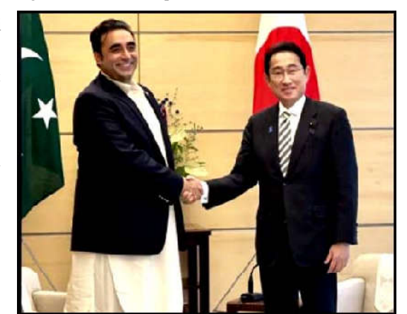
Foreign Minister Bilawal Bhutto Zardari meeting with Japanese Prime Minister Fumio Kishida in Tokyo

The foreign minister also invited his Japanese counterpart to visit Pakistan at your convenience to further our discussions. He said Pakistan and Japan were longstanding friends and share a special bond based on deep-rooted linkages that go far in history and time. The people of Pakistan carry a deep sentiment of warmth and affection for Japan and the Japanese people. We have always stood with each other in times of need, he said.