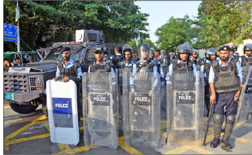
ISLAMABAD: Police personnel stand guard outside Sweden Embassy during the Protest of Jamat-e-Islami against burning of Holy Quran in Sweden.

promptly withdraw any advertisements related to granting affiliations that have been published in print and social media. Failure to comply with these directions will result in the non-recognition and non-attestation of degrees issued by the non-compliant HEIs, and HEC will be compelled to initiate appropriate actions in accordance with the Standard Operating Procedures (SOPs). The move follows HEC's authority under Ordinance No. LIII of 2002 (Amendment Act No. XXI of 2021 and Second Amendment Act No. XXII of 2022), Section 10-1(a).