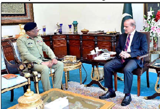
ISLAMABAD: Chairman Joint Chiefs of Staff Committee General Saahir Shamshad Mirza calls on Prime Minister Muhammad Shehbaz Sharif

Referring to the OIC statement released on Sunday, PM Shehbaz said the council also demanded that the culprit should be "heavily investigated" and such incidents should be prevented in the future.