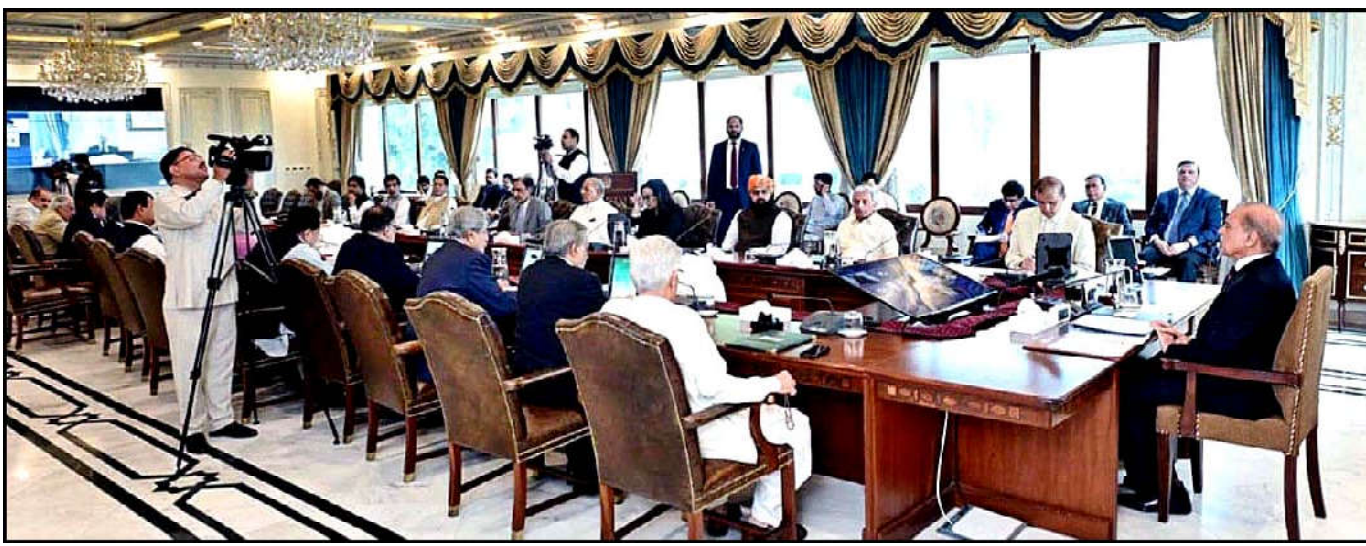
ISLAMABAD: Prime Minister Muhammad Shehbaz Sharif chairs a meeting of the Federal Cabinet

Vol. XIII No. 205 Reg. mails-B / ID-445 Tuesday July 04, 2023, Zil Hajj 15, 1444 A.H. Ph: 2158688, 2158997 Pages 4: Rs. 12