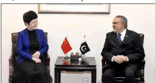
ISLAMABAD: H.E. Ms. Pang Chunxue, Charge d'Affairs of the People's Republic of China to Pakistan called on Federal Minister for Finance and Revenue Senator Mohammad Ishaq Dar.

keep alive the martyrs in hearts of the people, particularly the youth." The Acting President said the federal and provincial governments should ensure the establishment of martyrs monuments at the federal and provincial capitals. The pictures of the martyrs and the Pakistani flag should be put up at airports, government buildings, schools, important highways, railway stations and other places. "Pakistanis and foreigners should know that as a nation we are grateful to our martyrs," he said, adding visits of the people from different walks of life, particularly students to these monuments would reignite patriotism.