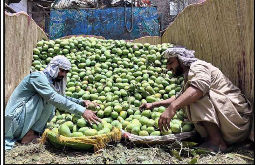
LARKANA: Labourers busy in unloading mangoes from a delivery truck at Fruit Market.

provide a breathing space in the recovery of Pakistan's creditworthiness but also enable the resumption of dollar inflow from various bilateral and multilateral lenders. He said that the business community hopes that the industry reforms introduced by the government in the budget would be implemented. The framework for the development of five Es, Energy, E-Pakistan, environment, equity and empowerment would be shared with the business community and stakeholders will be taken on board, he added. However, Chamber President urged the government to improve financial management and discipline.