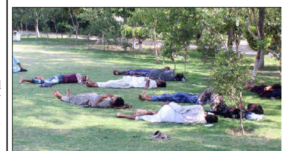
ISLAMABAD: Laborers are taking rest under the shadow of trees at Liaquat Bagh during high temperature in City.

The PTDC official added that ongoing summer vacations of kids were another factor which saw a rush of domestic tourists head to these scenic valleys of KPK. Upper Dir is a most beautiful district in Pakistan's North Western region in the Khyber Pakhtunkhwa province, said a foreign tourist, adding, it is comfortably nestled in the foothills of the Himalayas. The district mainly consists of most of the Pashtoon population that speaks the Pashto language. The people of Dir are amiable and hospitable, he mentioned. Upper Dir enjoys a very moderate temperature throughout the year. This makes this beautiful district an attractive location for travellers, said a local tourist. Tourists also took a keen interest in the cable car to cross the Swat River, said a resident.