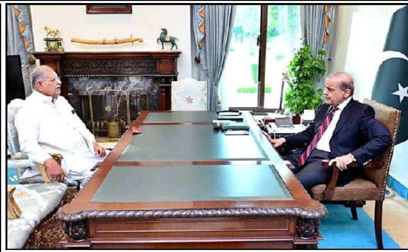
ISLAMABAD: Federal Minister for Human Rights, Riaz Hussain Pirzada talks on Prime Minister Muhammad Shehbaz Sharif.

path of development again, he said adding that after severe disappointments, a new sun of hope is rising again. Praying to Allah Almighty for further successes on the economic front, the prime minister said the seeds of Pakistan's development had started taking root as a result of the government's sincere efforts, honesty and truth. He said the government once again had embarked upon Quaid Muhammad Nawaz Sharif's vision of construction, development and people's welfare.