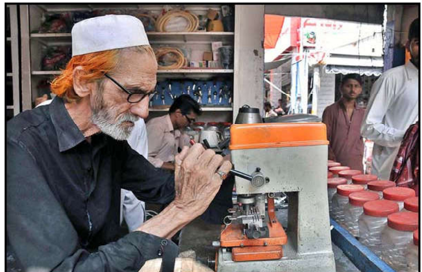
ISLAMABAD: An elderly person busy in making duplicate key at Aabpara Market.