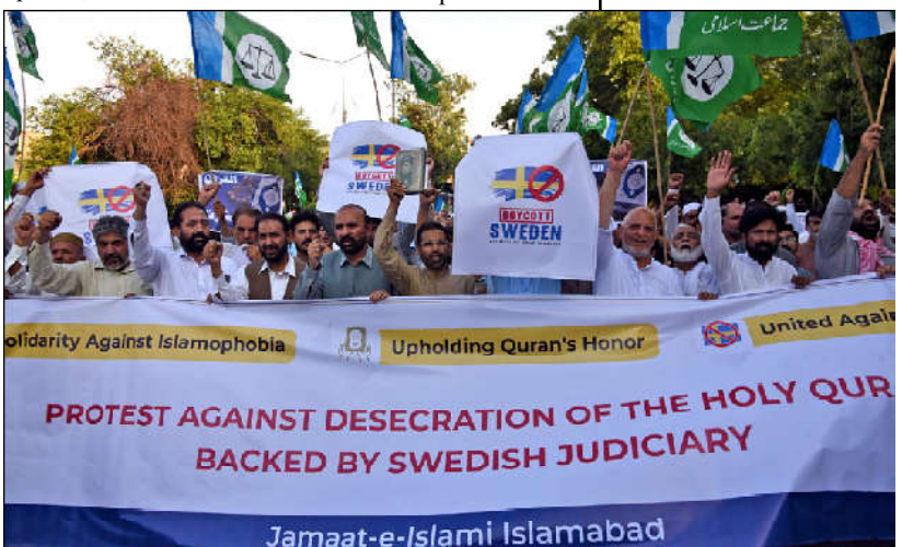
ISLAMABAD: Workers of Jamat-e-Islami holds protest outside Sweden Embassy against burning of Holy Quran in Sweden.

The communications minister said that the Yarik-Saggu and Saggu-Zhob CPEC project was going to start soon.