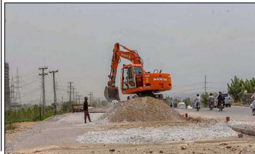
ISLAMABAD: Heavy machinery being used to expand lanes for smooth traffic on Islamabad Expressway.

ISLAMABAD (INP): The Islamabad High Court (IHC) on Monday adjourned hearing on an intra court appeal of former minister Shireen Mazari regarding the remarks of Defence Minister Khawaja Asif about her in 2016 at National Assembly till Thursday. The IHC sought arguments on maintainability of the ICA from the petitioner's lawyer on next hearing.