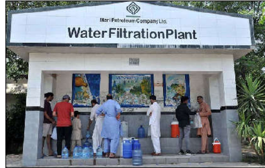
ISLAMABAD: People fill their pots with clean drinking water from water filtration plant in I-8 Sector.

paper mulberry and its replacement with the local indigenous plants will be carried on. The people from all walks of life, including people from private and public institutions, are invited to participate in this awareness walk to create awareness among the public regarding the reduction of environmental pollution, increasing green areas and plantation of new plants and species in accordance with the safety of human life. Also, the importance of a better environment can be highlighted in this awareness campaign. In addition to this special walk, information will be provided to the citizens regarding the utility of useful and human-friendly plants. Resultantly, valuable opinions, views and thoughts of the citizens will also be obtained. In light of these opinions, views and thoughts plants and trees more compatible with the local environment will be planted in Islamabad city so that everyone can benefit from these trees and plants.