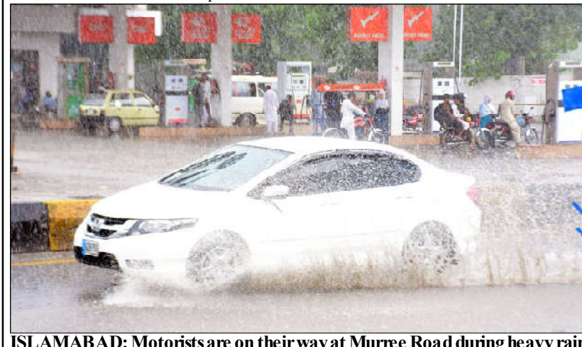
ISLAMABAD: Motorists are on their way at Murree Road during heavy rain fall of Pre-monsoon spell in Federal Capital.