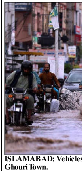
ISLAMABAD: Vehicles on the way being driven through flooded streets at Ghouri Town.