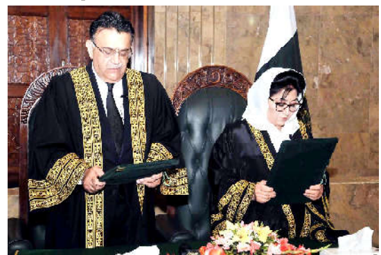
ISLAMABAD: Chief Justice Mr. Umar Ata Bandial administering the oath to Justice Supreme Court judge of the Ms. Justice Musarrat Hilali, Chief Justice Peshawar High Court as Judge of the Supreme Court of Pakistan

Justice Musarrat Hilali will serve as SC judge for three years. The total number of SC judges now has reached 16 with the induction of Justice Musarrat Hilali. Parliamentary committee for appointment of judges had approved induction of Justice Musarrat Hilali as SC judge.