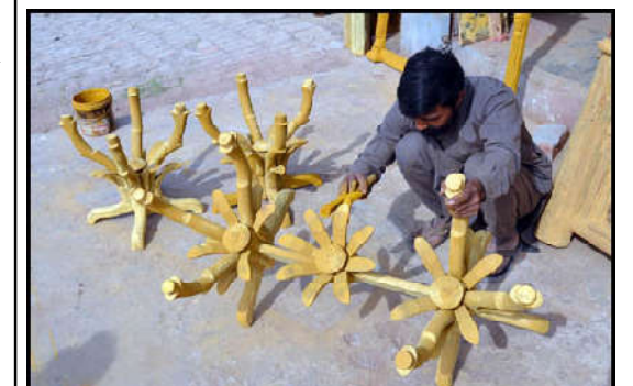
LAHORE: A wood worker given the final touches and polishes on a clothes hanger stand at Shahdara Furniture Market.