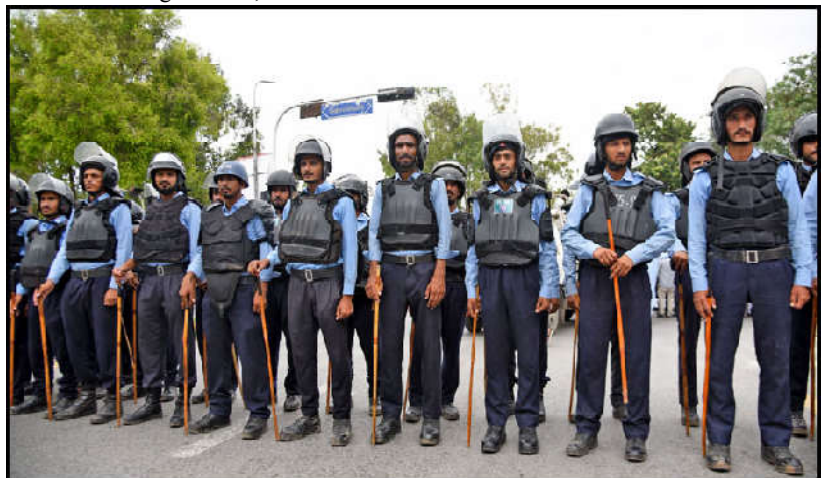
ISLAMABAD: Police personnel stand guard to counter any unexpected situation during the rallies of Youm-e-Taqadus in Federal Capital against the desecration of Quran Pak in Sweden.

The President urged the Ministry of Human Rights to further intensify its efforts for finding jobs for differently-abled people in the public and private sectors.