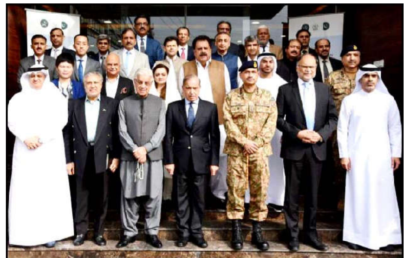
ISLAMABAD: Prime Minister Shehbaz Sharif, Chief of Army Staff General Syed Asim Munir and others in a group photo during inauguration ceremony of Land Information and Management System - Centre of Excellence (LIMS-COE)

Govt launches Land Information and Management System - Centre of Excellence - to transform unproductive land