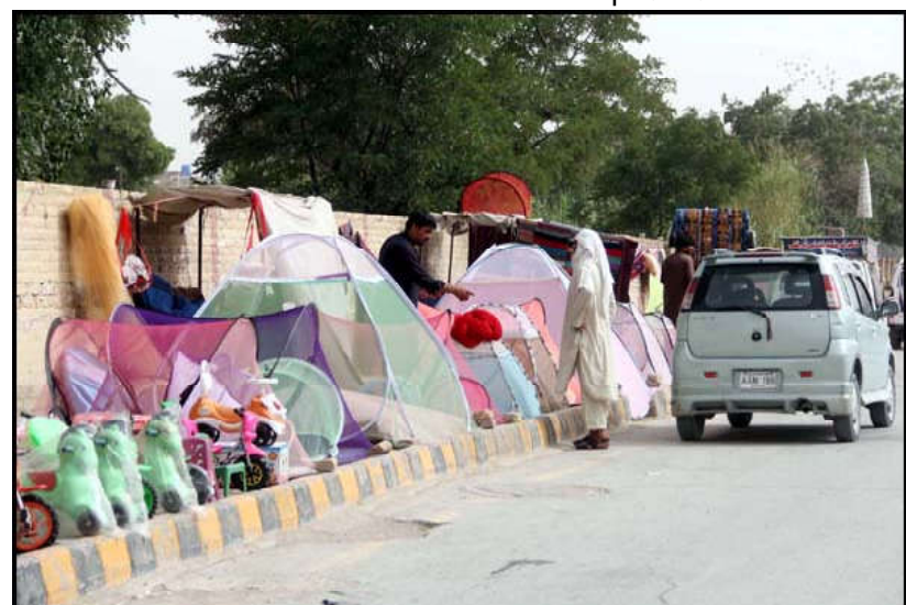
QUETTA: Vendor sells mosquitoes net to earn his livelihood for support his family during hot day of summer season at a roadside stall located on Zarghoon road in Quetta

KARACHI (APP): Four ships named, Seaspan Beacon, Singapore, and Atrotis Heracle Containers carrying Canola and Palm oil, berthed at Qasim International Container Terminal, Grain & Fertilizer Terminal, and Liquid Cargo Terminal respectively. Meanwhile, two more ships, Kition-M and Perth-1 with Mogas and Coal also arrived at the outer anchorage of the Port Qasim on Friday.