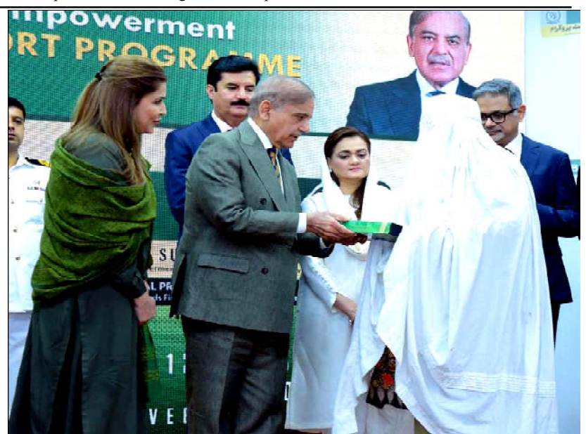
ISLAMABAD: Prime Minister, Muhammad Shehbaz Sharif distributing smart cards and cheque books relating to Benazir Social Protection Account among the beneficiaries