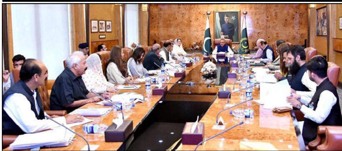
ISLAMABAD: President Dr. Arif Alvi chairing a meeting regarding the framework for the classification of disabilities, at Aiwan-e-Sadr.