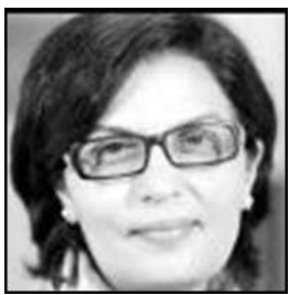
Dr Sania Nishtar

In Pakistan, polarization and rhetoric are at their peak and many conflicts abound whilst a terrifying brain drain and flight of capital are underway. With the recent IMF SLA, we have narrowly averted the threat of a sovereign default. However, it is critical now that we focus on a long-term plan for meaningful economic reform that will help prevent such a situation in the future. But first, we must introspect. Why have we landed in this situation? And beyond what's apparent, for example the numbers, we need to get a sense of their true determinants.