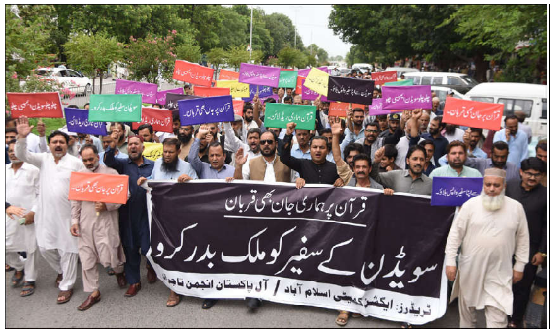
ISLAMABAD: Activists of All Pakistan Anjuman-e-Tajran holds protest rally at Aabpara Chowk to commemorate Yaum-e-Taqadus against the desecration of Quran Pak in Sweden.

He also expressed his thanks to Pope Francis for condemning the incident and distancing himself from this profane act.