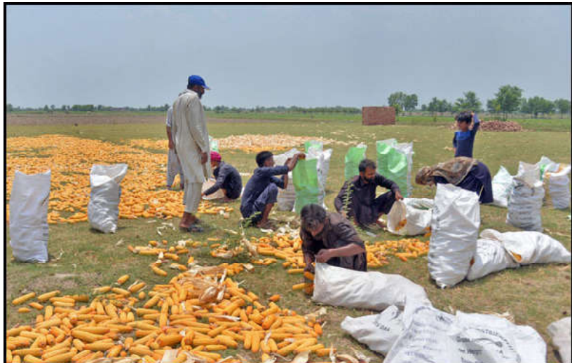
FAISALABAD: Formers are packing the Corns in sacks at Field along the Satyana Road in City.