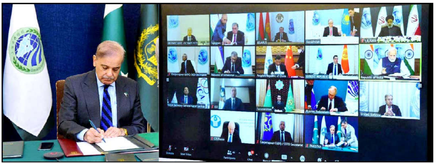
ISLAMABAD: Prime Minister Muhammad Shehbaz Sharif signing Joint Declaration and other documents adopted at the conclusion of the 23rd Shanghai Cooperation Organisation (SCO) Summit held virtually

Today, dollar got cheaper and in interbank dollar price lowered by 11.01. Dollar is trading in interbank at the price of 274.98Pkr.