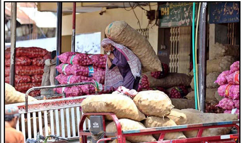
ISLAMABAD: An elderly labourer on the way loading a sack on a Suzuki van on Fruit and Vegetable market.