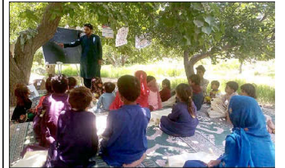
QUETTA: Children attending classes established by a NGO in Mastung.

The extremists want to prove their movement successful by targeting the security forces, he said.