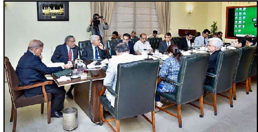
ISLAMABAD: Prime Minister Muhammad Shehbaz Sharif chairs a meeting regarding PSDP projects.