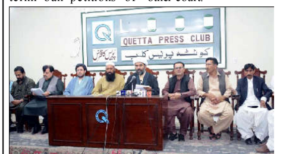
QUETTA: Majlis Wahdat-e-Muslimeen (MWM) Leader, Allama Maqsood Domki addresses to media persons during press conference regarding to condemning the latest incident of desecration of the Holy Quran in Sweden, at Quetta press club.

He said that the decision should have come together and prayed the judge to transfer the case to another court.