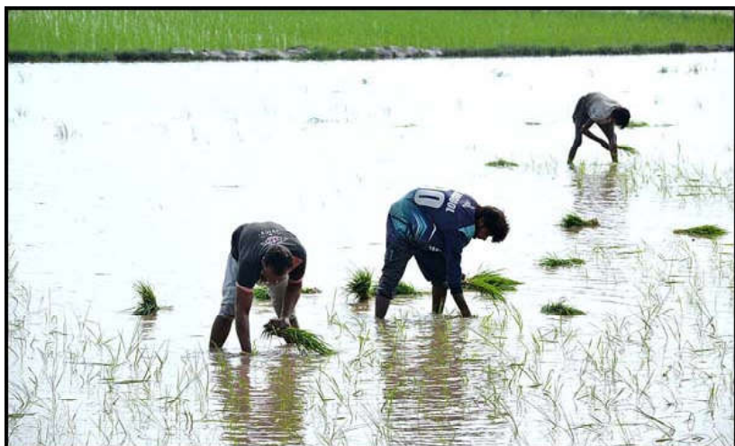
FAISALABAD: Farmers seeding the rice crop on their field.

team for the R&D and design of silage harvesting and processing machinery and a group of technicians for the operation, use and maintenance of the machinery for Pakistan. According to China Economic Net (CEN), the project, undertaken by Gansu Academy of Mechanical Sciences Co., Ltd., aims to enhance the mechanized operation, efficiency and economic benefits of Pakistan's agricultural production, and the export competitiveness of its silage. Since the project was launched in 2018, the team has been studying the key technologies suitable for Pakistan in terms of silage harvesting and processing, sealing reliability of wrap film, mechanical properties.