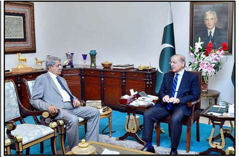
ISLAMABAD: Federal Minister for Commerce, Syed Naveed Qamar calls on Prime Minister Muhammad Shehbaz Sharif.

China's controls, to take effect from August 1, will apply to eight gallium-related products: gallium antimonide, gallium arsenide, gallium metal, gallium nitride.