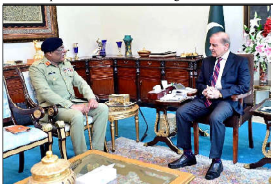
ISLAMABAD: Chairman Joint Chiefs of Staff Committee General Sahir Shamshad Mirza calls on Prime Minister Muhammad Shehbaz Sharif