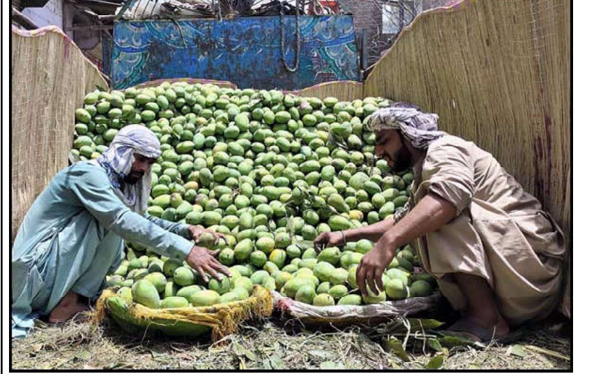
LARKANA: Labourers busy in unloading mangoes from a delivery truck at Fruit Market.

provide a breathing space in the recovery of P a k i s t a n ' s creditworthiness but also enable the resumption of dollar inflow from various bilateral and multilateral lenders. He said that the business community hopes that the industry reforms introduced by the government in the budget would be implemented. The framework for the development of five Es, Energy, E-Pakistan, environment, equity and empowerment would be shared with the business community and stakeholders will be taken on board, he added. However, Chamber President urged the government to improve financial management and discipline.