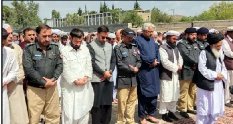
Funeral prayer of the martyred policemen being offered in Zhab

Taking to Twitter, the former interior minister said the PPP had not given any reaction to the deal, saying: "This means there is something wrong with it".