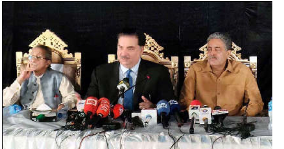
PHOOL NAGAR: Federal Minister for Power, Engr. Khurram Dastgir Khan addressing a press conference in Phool Nagar.