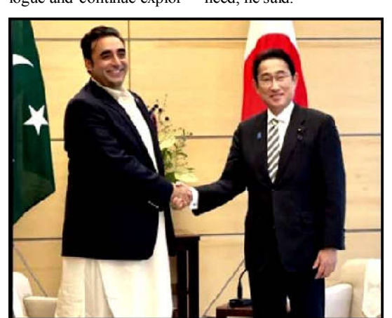
Foreign Minister Bilawal Bhutto Zardari meeting with Japanese Prime Minister Fumio Kishida in Tokyo

The foreign minister also invited his Japanese counterpart to visit Pakistan at your convenience to further our discussions. He said Pakistan and Japan were longstanding friends and share a special bond based on deep-rooted linkages that go far in history and time. The people of Pakistan carry a deep sentiment of warmth and affection for Japan and the Japanese people. We have always stood with each other in times of need, he said.