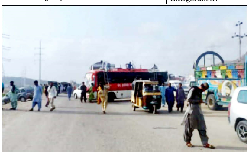
HUB: Members of Balochistan National Party (BNP-Mengal) block road as they are holding protest demonstration for acceptance of their demands, at Bhawani Western Bypass road in Hub