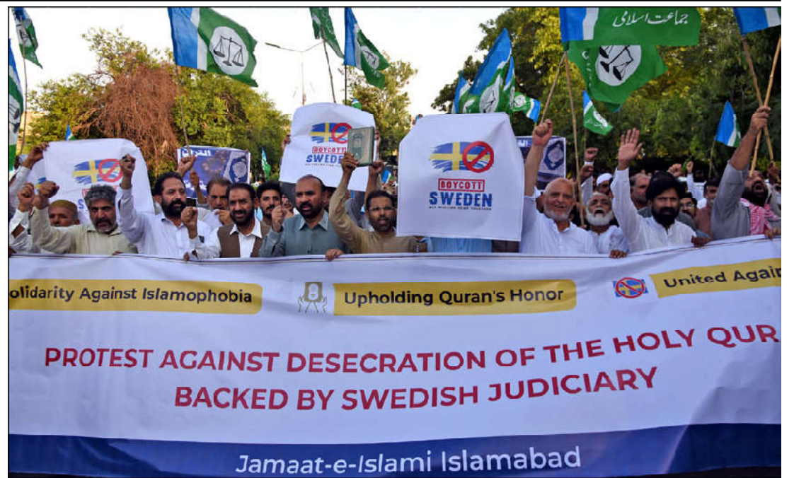
ISLAMABAD: Workers of Jamat-e-Islami holds protest outside Sweden Embassy against burning of Holy Quran in Sweden.

Shehbaz Sharif vowed to continue the journey of economic stability and national development with the same direction, spirit and struggle.