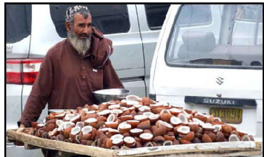
QUETTA: An elderly man pushing his handcart full of coconuts for selling to earn livelihood for his family.

He regretted that the PTI has tried to sabotage the IMF's agreement with Pakistan but could not succeed.