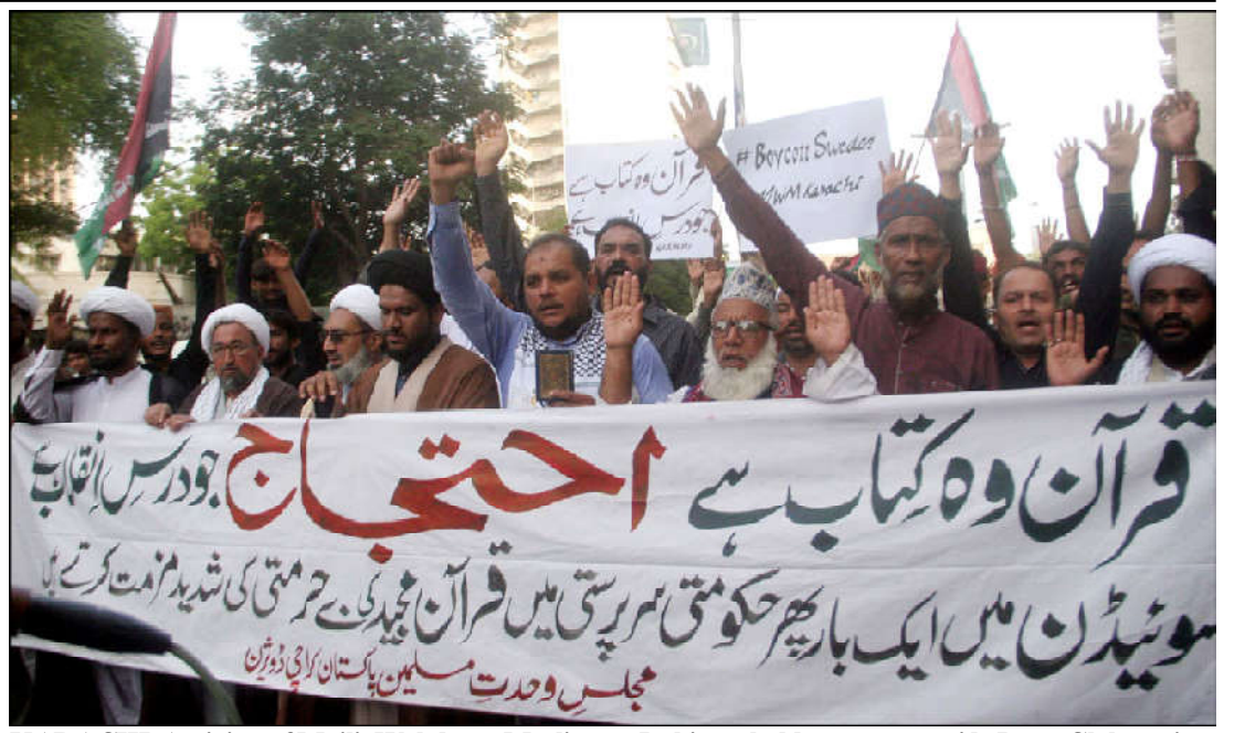
KARACHI: Activists of Majlis Wahdat-e-Muslimeen Pakistan holds protest outside Press Club against the burning of Quran Pak in Sweden.