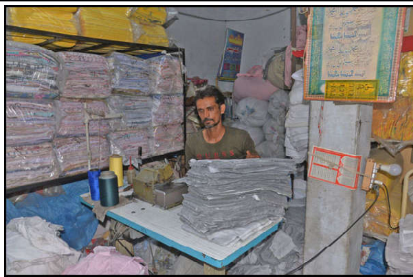
FAISALABAD: A worker is busy in his work at Tissue making factory, to earn daily wages for the livelihood of his family.