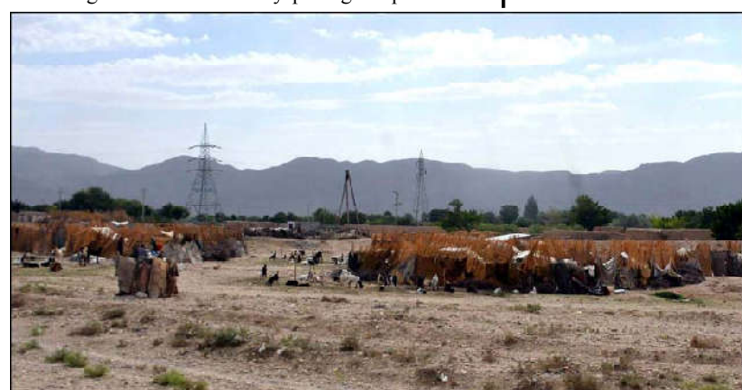
QUETTA: Gypsy family spends their life under the open sky.

Using conical baffles in geysers will save 25% gas, and Pakistan save Rs92 billion annually under this head.