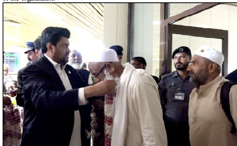
KARACHI: Governor Sindh Kamran Khan Tessori receiving the pilgrims warmly with flower garlands as first hajj flight landed at Karachi International Airport during post hajj operation

PM Shehbaz Sharif summoned the federal cabinet's session on Monday in which the participants will review the political and economic situation of the country.