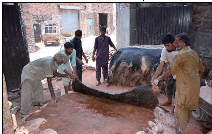
FAISALABAD: Workers preserving sacrificial animal hides at their warehouse.