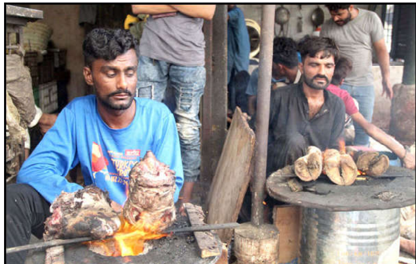
KARACHI: Workers are peeling the "Siri Paye" outside their shop at nanakwarha area, the paye and Siri is the one of the favorite and famous dish in Pakistan.

about the leadership role. To a question about relief to poor people, he said despite economic challenges, the government has provided maximum relief to employees, and pensioners besides the people working in the private sector. About load-shedding of gas and electricity, he said, we have issued directives to the department concerned to ensure energy supply during cooking breakfast, lunch and dinner timing. He said that a discussion has been made with Azerbaijan regarding the provision of LNG cargo to Pakistan before next winter. To a question about IMF, he said a nine-month relief through an agreement has been made to run the economic affairs in a proper manner. He hoped that heavy investment from the Gulf region would boost business activities besides open job opportunities in Pakistan.