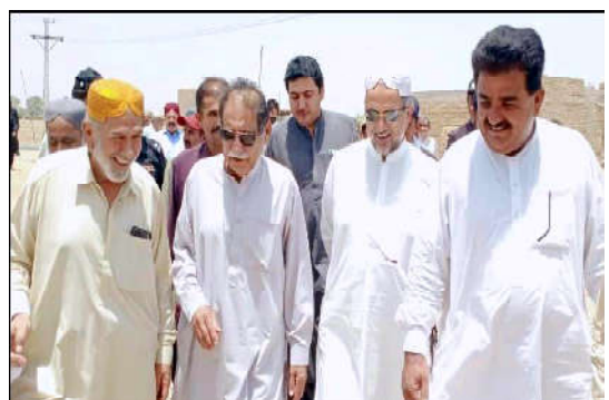
USTAMUHAMMAD: Speaker Balochistan Assembly Mir Jan Muhammad Khan Jamali and Muhammad Khan Lehri visiting different canals

The Chief Minister made it clear that we have no personal grudge with the federal government. We had also boycotted the NEC meeting and federal budget in compulsion just because of non-implementation on the promises and commitment made by the federal government with the province. The Prime Minister formed a parliamentary committee to resolve the financial issues being faced by the province and we also sent a 11-point stance to the committee for consideration, but to no avail, he added.