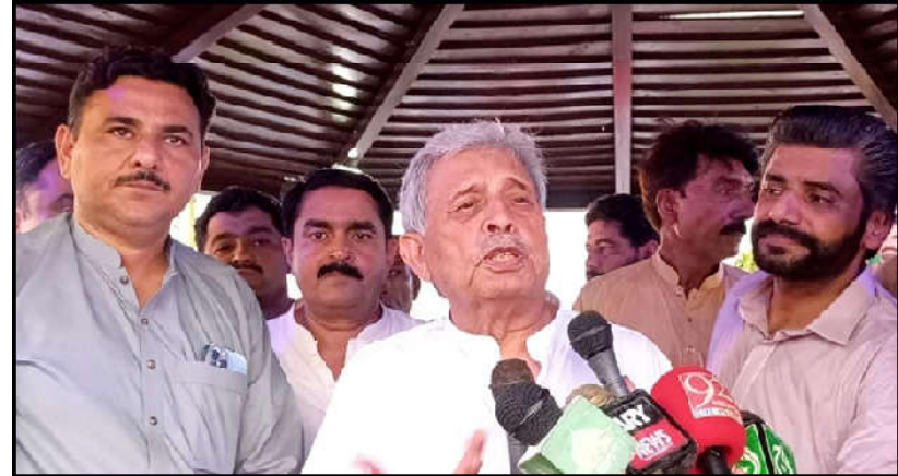
MURIDKE: Federal Minister for Education Rana Tanveer Hussain talking with mediapersons.

The farmers have been left in need of agricultural water and they yearned for a drop of agricultural water. Irrigation Naseerabad Division has become a center of corruption. It was not possible to supply agricultural water to the farmers, but all the funds were seen to be corrupt.