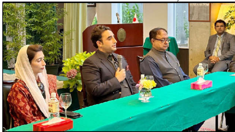
Foreign Minister Bilawal Bhutto Zardari speaking at a function organized by the Pakistani diaspora in Tokyo