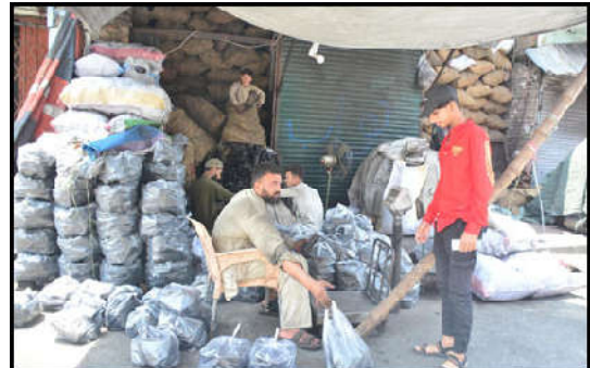
RAWALPINDI: Shopkeepers are packing the Charcoal for customers at their shop in Ganjmandi area as due high demand because of Bakra Eid.

Now the rupee will strengthen, which will reduce inflation. He said that there is a 9-month agreement which is very positive, as the caretaker government will remain in the facility, however, the IMF conditions have increased the cost of production.