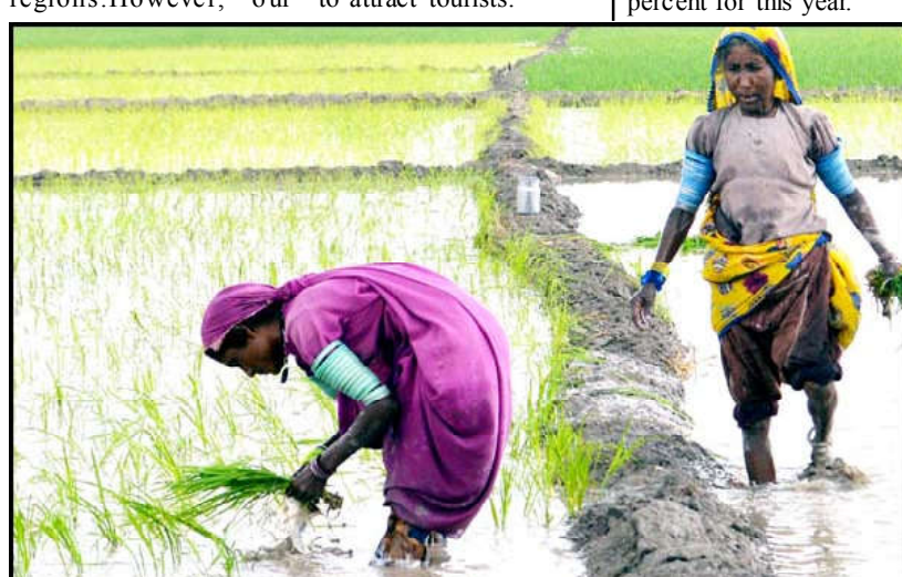
HYDERABAD: Female farmers are busy in seeding rice crops in their fields at the bypass.

Market analysts maintained the forecast for the benchmark Selic interest rate at 12.25 percent for this year.