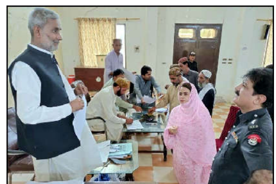
NASEERABAD: Deputy Commissioner Ayesha Zehri visiting a polling station during Local Bodies elections

mate change unit under the regulation of the Environmental Protection Agency to work on the minimizing effects of climate change in the province. The government has stepped up its efforts to ensure strict implementation of the Environmental Protection Act 2012 to protect the environment and to monitor the compliance of environmental laws at development sites. The official said the government has purchased Ambient Air Mobile Monitoring Stations to analyze the air quality index in Hub and Gwadar and curb air pollution. The Environment Protection Department is conducting a feasibility study on solid waste management to resolve the issue on permanent bases and protect.