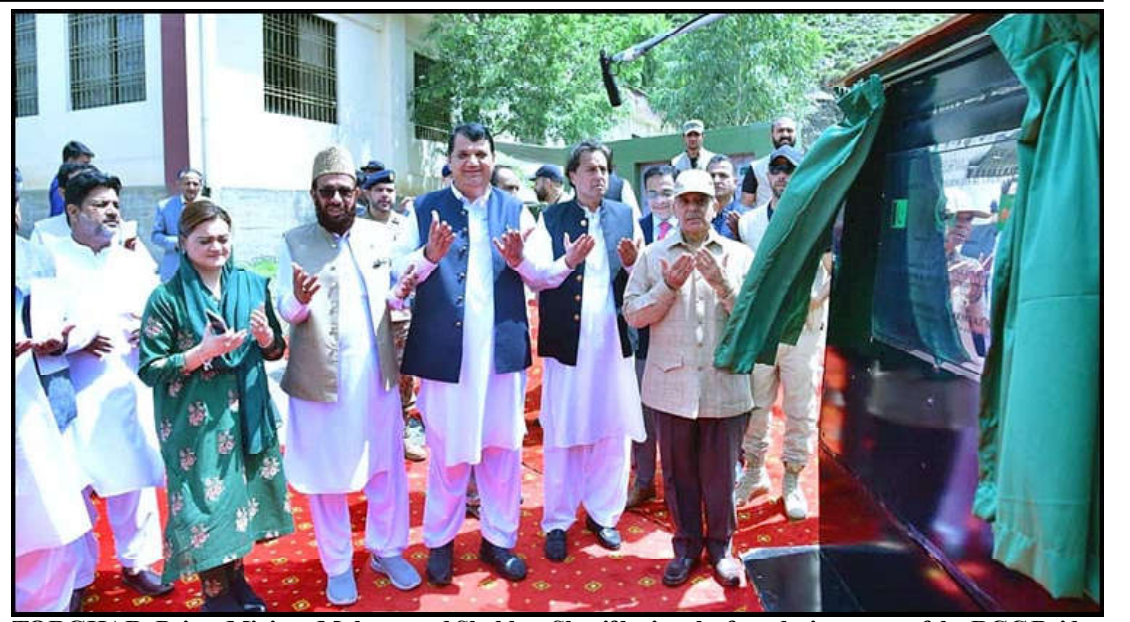
TORGHAR: Prime Minister Muhammad Shehbaz Sharif laying the foundation stone of the RCC Bridge on the River Indus that will connect Torghar with Buner District, Torghar, KP.

people. The prime minister acknowledged the sacrifices of the forefathers of the locals who donated their lands during the formation of Pakistan 70 years ago. He regretted the apathy of political leaders in the past, who neglected the area and did not make efforts to mainstream it in the journey of national development. He emphasized giving opportunity to the locals to help them prosper in educational and professional fields.