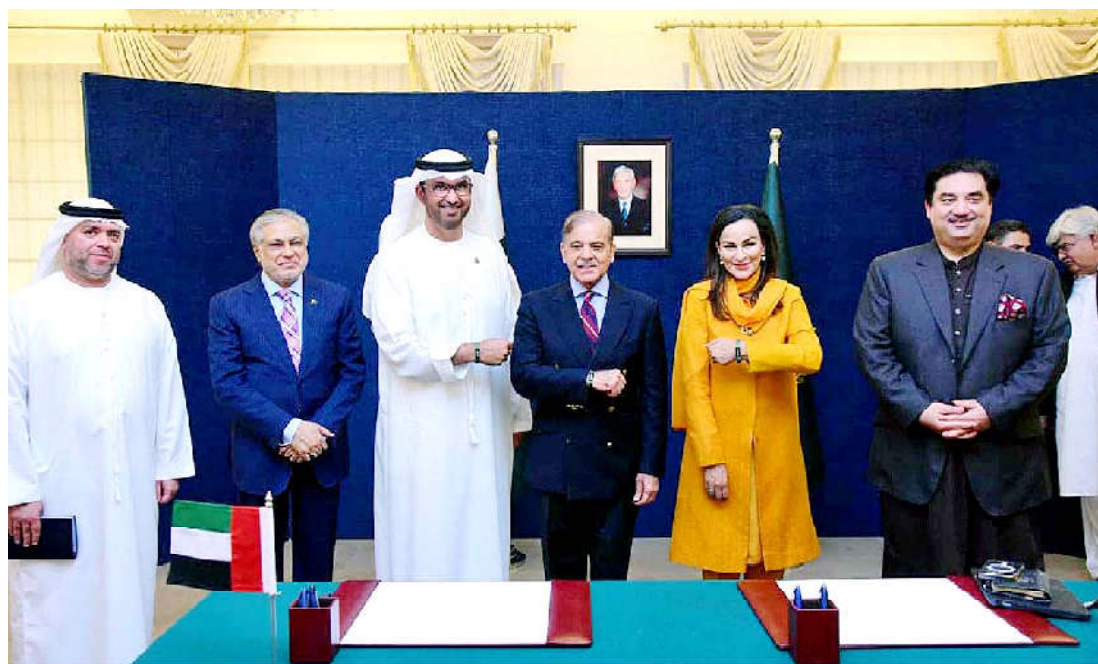
ISLAMABAD: Prime Minister Muhammad Shehbaz Sharif, UAE's President-designate for COP28 Dr Sultan Ahmed Al Jaber, Federal Minister for climate change Ms Sherry Rehman displaying COP28's wrist band as a display of commitment to climate change agency

Ph: 2841470/2841473 Vol: XVI No. 57, Zil Hajj 18, 1444 AH Friday July 07, 2023, Pages 08, Price Rs. 15