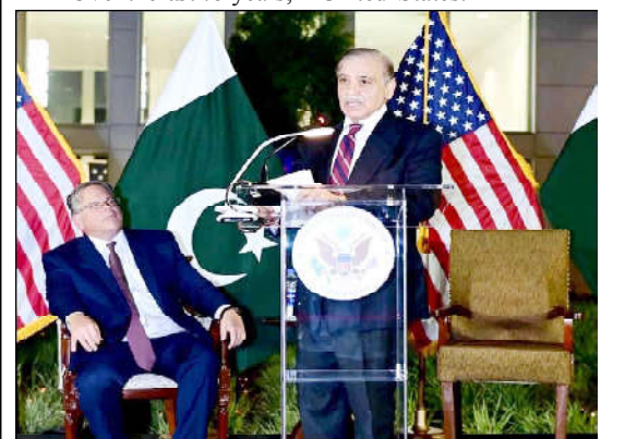
ISLAMABAD: Prime Minister Muhammad Shehbaz Sharif addressing a ceremony of the celebration of the 247th Independence Day of the United States of America

He said about five years ago when Pakistan was facing serious power outages, the then government established 5000 megawatts of LNG-based power plants and the entire equipment was brought from the United States.