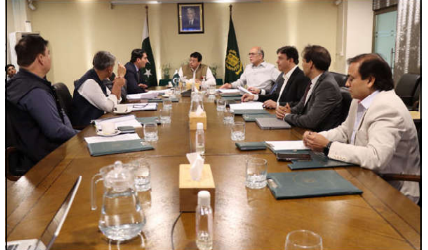
Federal Minister for IT and Telecommunication Syed Amin Ul Haque chairing policy Committee meeting of Research & Development Fund in Islamabad.

2023-24 was approved. The meeting was attended by high-ranking officials from the IT sector, including the Secretary IT and representatives from the Cabinet Division and Finance Ministry. The CEO of USF briefed the chair about the ongoing projects. The minister also presided over the Policy Committee meeting of the Research & Development Fund. The CEO of Ignite, a government-owned technology innovation organization, presented various future projects during the meeting. The annual budget of Ignite for FY 2023-24, amounting to Rs 3,206 million, was approved. Syed Amin Ul Haque highlighted the challenges faced by telecom companies in importing equipment and upgrading systems due to limited Letters of Credit (LCs), causing delays in completing USF's ongoing projects. The minister assured his commitment to addressing this issue and finding suitable solutions.