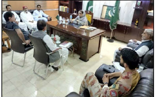
QUETTA: Deputy Commissioner Ayesha Zehri presiding over a meeting of officers regarding security and other arrangements for election of District Chairman

In previous regimes, Rs 10 million were allocated for all academies of the regional languages every year, however, Pashto and Brahvi academies have been totally ignored by the incumbent provincial government. He deplored that the government has increased the grant of only one academy from Rs 10 million to Rs 500 million.