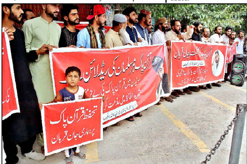
QUETTA: Enraged people are gathered on the call of Balochistan Home and Tribal Affairs Minister Mir Zia Lango to protest against the desecration of Holly Quran in Sweden

people to flee their homes. The tragedy of such immense proportions was believed to have taken place in the presence of maritime authorities. It was also believed that Pakistani nationals were forced to stay below the deck by the crew, which maltreated them during the journey. Referring to the tragedy during the hearing today, Justice Bandial noted that innocent and poor people were tricked into going abroad on the pretext of better jobs. "Citizens are duped by human traffickers and pay millions of rupees," the top judge said, pointing out that even children and women were becoming victims of human smuggling. "Does the government have statistics on the number of children being smuggled," the CJP asked. To the query, the director general of the human rights ministry said, "Unfortunately, accurate data is not available."