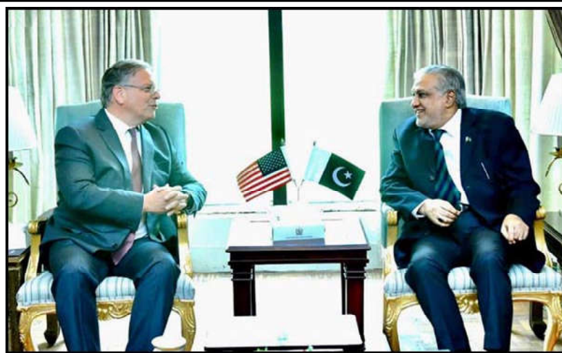
ISLAMABAD: Donald Blome, Ambassador of the United States of America to Pakistan called on Federal Minister for Finance and Revenue Senator Mohammad Ishaq Dar.

Dar appreciated the support and cooperation of the US and reiterated the desire of the government to further deepen bilateral economic and trade ties with the US. On the occasion, Donald Blome expressed confidence in the policies and programmes of the government for bringing economic sustainability to the country. He also extended his support to further promote bilateral economic, investment and trade relations between the two countries.