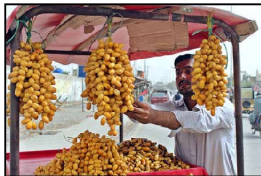
QUETTA: Roadside vendor puts dates on display to attract the customer.

Replying to a question, she urged that we need to work positively for the welfare of the state instead of politics and we need to control expenditure as well.