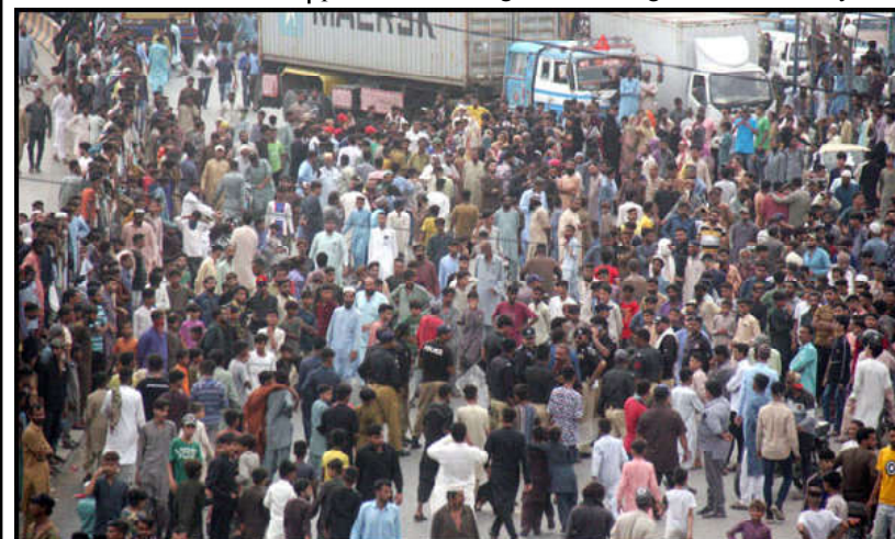
KARACHI: A large number of the people holds protest against the load shedding of Gas, Electricity and Water at Liyari, in Provincial Capital.