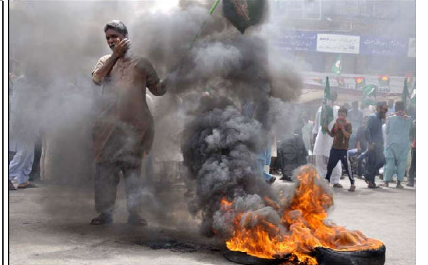
HYDERABAD: Activists of Sunni Tehreek (PST) are burn tires as they are holding protest demonstration against desecration of Holy Quran in Sweden.

"However, in my view, we are still far from fully tapping the potential of CPEC, a worthy goal that has my personal & government's staunch commitment," he added.