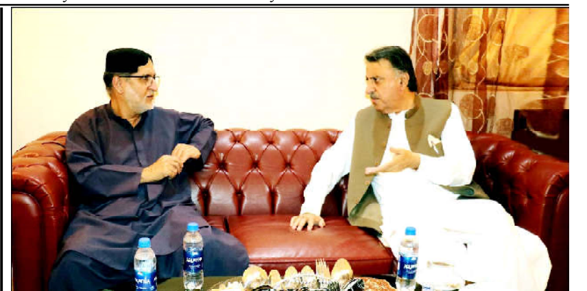
Governor Balochistan Malik Abdul Wali Khan Kakar meeting with President of Balochistan National Party (BNP) Sardar Akhtar Jan Mengal at his residence in Wadh

whom political elders give up the internal conflicts and battles and move ahead by making the collective peace and development the aim of life. The Governor was speaking to the President of Balochistan National Party (BNP), Sardar Akhtar Mengal during his visit to his residence in Wadh on Wednesday. The Governor especially went to Wadh to meet Sardar Akhtar Mengal and discussed with him the latest situation of the country, tense situation of Tehsil Wadh besides the changes taking place in the region.