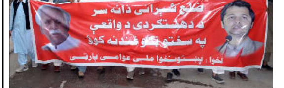
QUETTA: Activists of Pashtunkhwa Milli Awami Party (PKMAP) are holding protest demonstration for acceptance of their demands, at QPC.