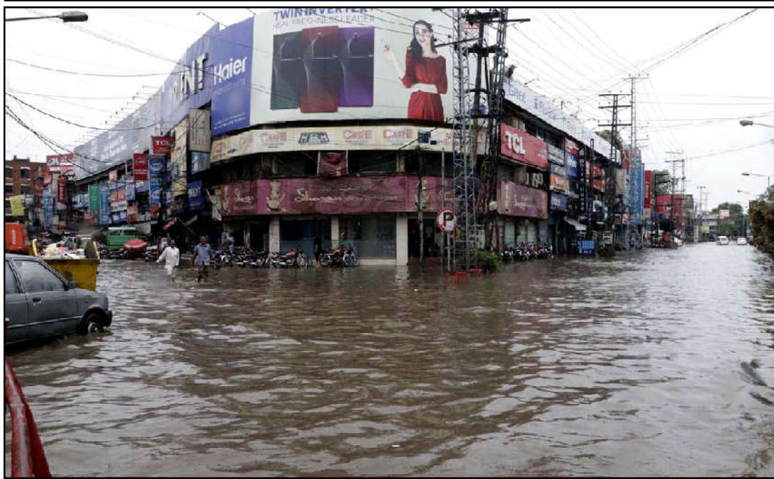
LAHORE: Commuters are facing difficulties in transportation due to stagnant rainwater due to poor sewerage system caused by heavy downpour of monsoon season, at Queensroad in Lahore.