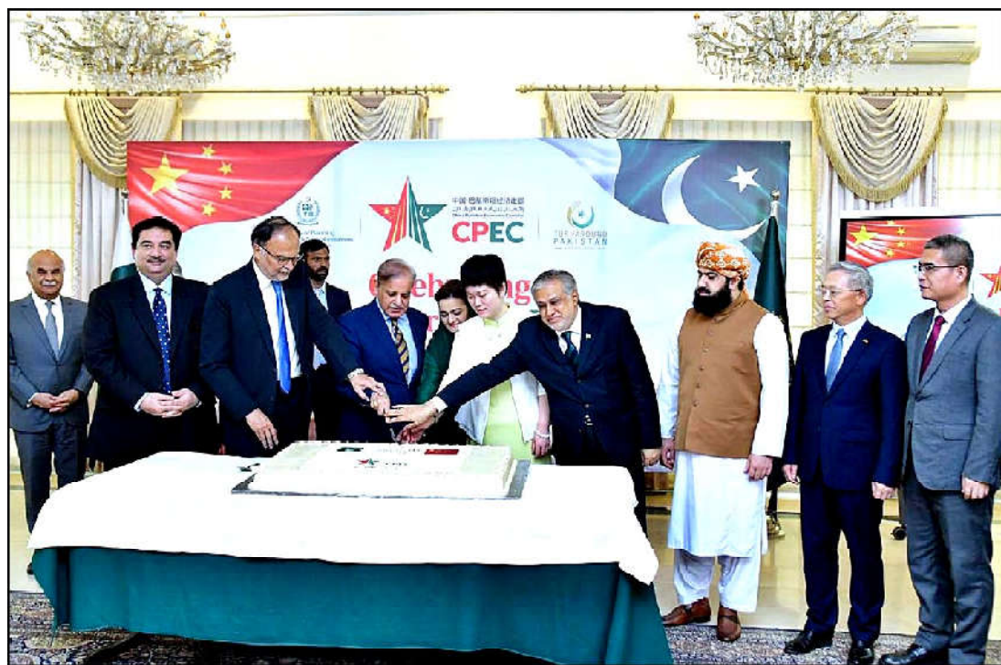
ISLAMABAD: Prime Minister Muhammad Shehbaz Sharif, Chargé d'affaires of the Chinese Embassy in Islamabad Ms. Pang Chunxue and Federal Ministers cutting a cake marking the 10th anniversary of the signing of the agreement for CPEC

Ph: 2841470/2841473 Vol: XVI No. 56, Zil Hajj 17, 1444 AH Thursday July 06, 2023, Pages 08, Price Rs. 15