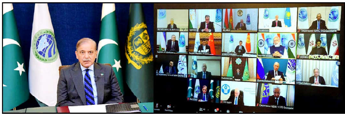
ISLAMABAD: Prime Minister Muhammad Shehbaz Sharif addresses the 23rd SCO Summit hosted virtually by India

He told the meeting that the sanctity of the Holy Quran was a part of the Muslims' belief for which all of them were united. He said that the astray minds were toeing a nefarious agenda of fanning the negative trend of Islamophobia. Prime Minister Shehbaz said that nations and leadership believing in peace and co-existence should contain the violent forces infested by the Islamophobia and religious biases. He believed that the violent mindset targeting the religion, sacred personalities, beliefs and ideologies were in fact the enemies of the world peace.