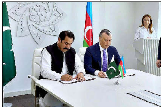
BAKU: Federal Minister for Overseas Pakistanis & HRD, Sajid Hussain Turi signing MoU with his Azerbaijan counterpart on social welfare.