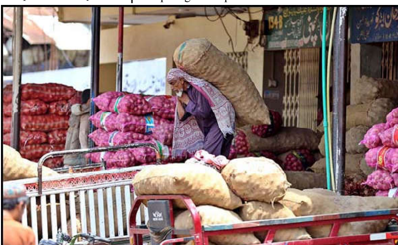
ISLAMABAD: An elderly labourer on the way loading a sack on a Suzuki van on Fruit and Vegetable market.