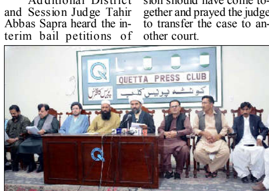
QUETTA: Majlis Wahdat-e-Muslimeen (MWM) Leader, Allama Maqsood Domki addresses to media persons during press conference regarding to condemning the latest incident of desecration of the Holy Quran in Sweden, at Quetta press club.

ousted prime minister in six cases. Imran Khan's lawyer Sher Afzal Murawat objected over the court, hearing this case, and said that it had already disclosed its mindset in the matter to the extent of two co-accused. He said that the decision should have come together and prayed the judge to transfer the case to another court.