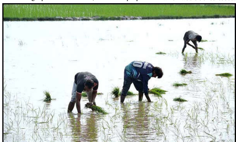
FAISALABAD: Farmers seeding the rice crop on their field.

team for the R&D and design of silage harvesting and processing machinery and a group of technicians for the operation, use and maintenance of the machinery for Pakistan. According to China Economic Net (CEN), the project, undertaken by Gansu Academy of Mechanical Sciences Co., Ltd., aims to enhance the mechanized operation, efficiency and economic benefits of Pakistan's agricultural production, and the export competitiveness of its silage. Since the project was launched in 2018, the team has been studying the key technologies suitable for Pakistan in terms of silage harvesting and processing, sealing reliability of wrap film, mechanical properties.