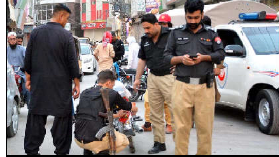
QUETTA: Police removing fake and fancy number plate from motorcycle at Mission Chowk.

strongly condemned the sacrilegious act. "We demand immediate action against the perpetrator," the premier had said. Unfortunately, this is not the first time that such an act has been committed, he had added, recalling that a similar incident had taken place in the past too. The premier had also demanded that the Swedish government take notice of the Islamophobic and hateful narrative against the Muslim population in their country. PM Shehbaz had further appreciated the Organisation of Islamic Cooperation for convening an urgent meeting on the issue and said Pakistan endorsed the OIC's meeting and its decision with the hope that such Islamophobic incidents would not recur in the future. On Sunday, the OIC had called an emergency meeting and said collective measures were needed to prevent acts of desecration of the Holy Quran and international law should be used to stop religious hatred after the burning incident in Sweden.