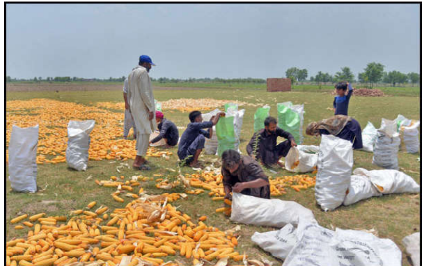
FAISALABAD: Formers are packing the Corns in sacks at Field along the Satyana Road in City.

Plan of SBP 'Vision 2028' and its key areas including bringing inflation to the target level in the medium term, promoting fairness in the banking system, propagating gender-inclusive policies, encouraging green financing, providing a conducive environment for Shariah-compliant banking in line with the directives of the Federal Shariah Court, and transforming the SBP into a high-tech, people-centric institution. He expressed hope that the whole banking industry would work with the SBP in realising the goals. He also appreciated the hard work put into the SBP commemorative banknote, and congratulated the team members on the successful launch of the banknote. Addressing the ceremony Deputy Governor SBP Sima Kamil, discussed the positive consequences of women's participation in the financial sphere.