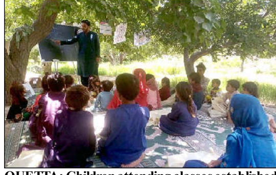
QUETTA: Children attending classes established by an NGO in Mastung.

curity forces are always engaged in the service of the people, but in the meantime, the extremists carry out their operations. The government is taking all possible steps to eradicate terrorism. Our effort is to root out terrorism. The extremists want to prove their movement successful by targeting the security forces, he said.