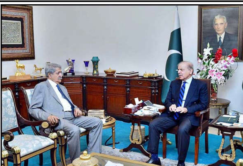
ISLAMABAD: Federal Minister for Commerce, Syed Naveed Qamar calls on Prime Minister Muhammad Shehbaz Sharif.

Washington mulls new restrictions on the shipment of high-tech microchips to China, according to media reports. The United States and the Netherlands are also set to deliver a one-two punch to China's chipmakers this summer by further restricting sales of chipmaking equipment, part of efforts to prevent their technology from being used to strengthen China's military. China's controls, to take effect from August 1, will apply to eight gallium-related products: gallium antimonide, gallium arsenide, gallium metal, gallium nitride.