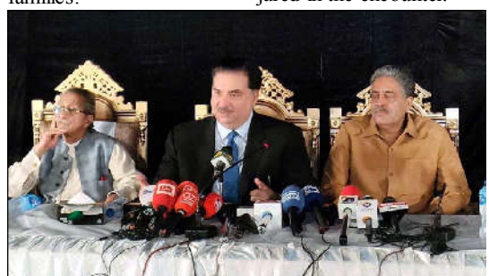
PHOOL NAGAR: Federal Minister for Power, Engr. Khuram Dastgir Khan addressing a press conference in Phool Nagar.