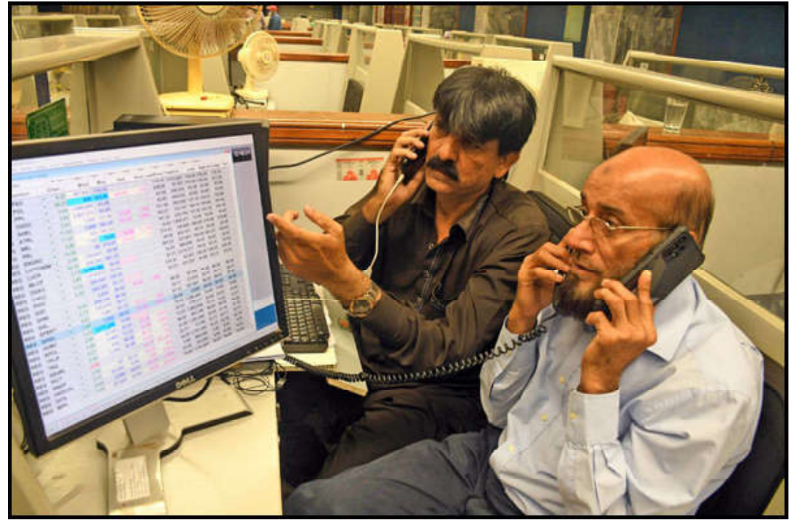
KARACHI: Pakistani brokers and traders monitor the shares at the Stock Exchange (KSE) as Pakistan Stocks Surge Most after the approval of IMF Loan to Pakistan.

(38.17 percent), Eggs (36.96 percent), Bakery and Confectionery (36.83 percent), Gur (36.60 percent), Milk Fresh (31.8 percent), Condiments and Spices (30.04 percent), Gram Whole (28.42 percent), Pulse Gram (24.14 percent), Cooking Oil (19.62 percent), Meat (18.50 percent), Fresh Vegetables (13.71 percent), Vegetable Ghee (8.90 percent) and Mustard Oil (5.97 percent), while tomatoes came down by 29.57 percent and onion 16.53 percent. The non-food commodities that witnessed an increase during the period on a YoY basis included