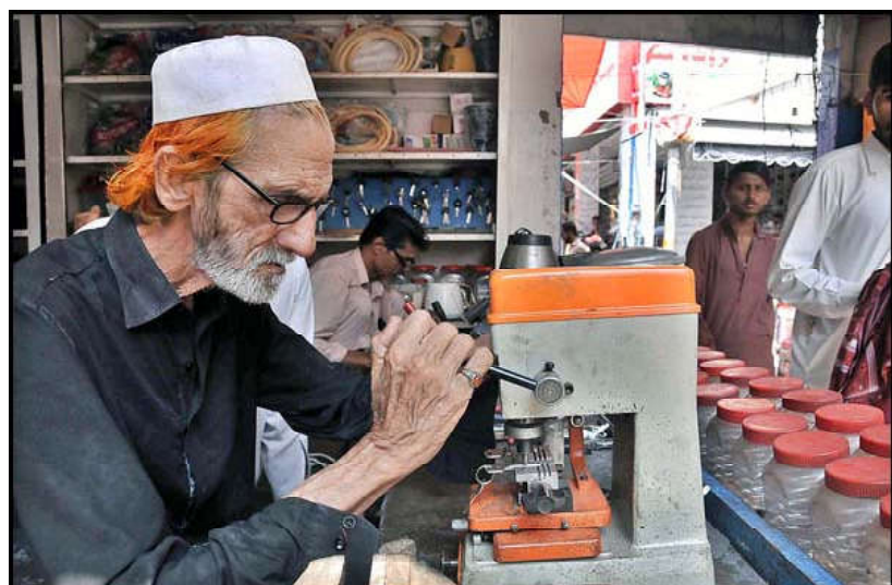
ISLAMABAD: An elderly person busy in making duplicate key at Aabpara Market.