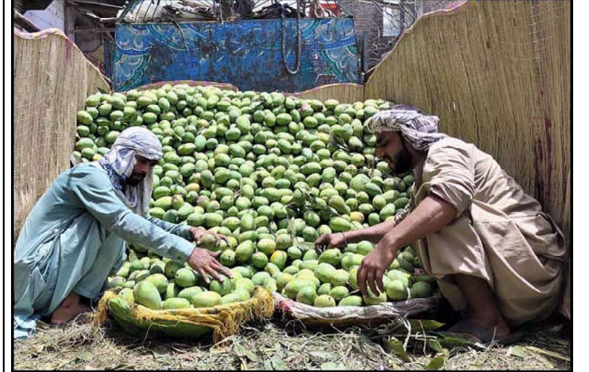
LARKANA: Labourers busy in unloading mangoes from a delivery truck at Fruit Market.

provide a breathing space in the recovery of Pakistan's creditworthiness but also enable the resumption of dollar inflow from various bilateral and multilateral lenders. He said that the business community hopes that the industry reforms introduced by the government in the budget would be implemented. The framework for the development of five Es, Energy, E-Pakistan, environment, equity and empowerment would be shared with the business community and stakeholders will be taken on board, he added. However, Chamber President urged the government to improve financial management and discipline.