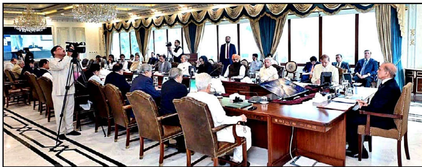
ISLAMABAD: Prime Minister Muhammad Shehbaz Sharif chairs a meeting of the Federal Cabinet

Ph: 2841470/2841473 Vol: XVI No. 54, Zil Hajj 15, 1444 AH Tuesday July 04, 2023, Pages 08, Price Rs.15