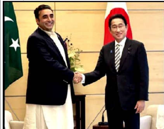
Foreign Minister Bilawal Bhutto Zardari meeting with Japanese Prime Minister Fumio Kishida in Tokyo

ISLAMABAD (APP): Foreign Minister Bilawal Bhutto Zardari on Monday called on the Japanese Prime Minister Fumio Kishida in Tokyo and discussed with him matters of mutual interests. The foreign minister conveyed greetings from the Government and people of Pakistan, according to the ministry of foreign office's spokesperson. During the meeting, both leaders expressed the desire to further enhance bilateral engagement and cooperation in different fields.