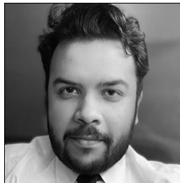
Syed Sheheryar Raza Zaidi

Pakistan's long-running political soap opera continues, adding layers of intrigue with each passing day. Every day, Pakistanis long disenchanted by the shenanigans of the ruling elite, watch from the edge of their seats as the fate of their country hangs in the balance between the Supreme Court and the military.