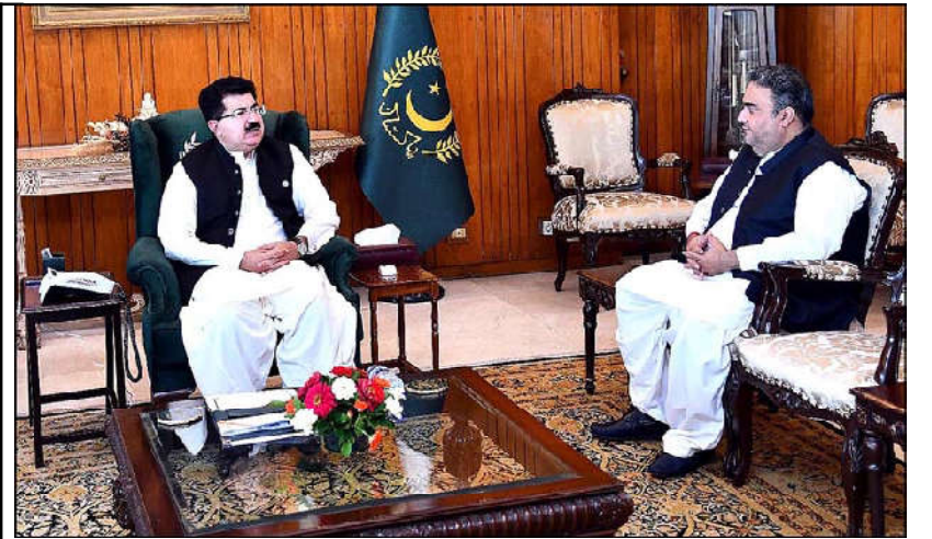
ISLAMABAD: Senator Danesh Kumar called on the Acting-President, Muhammad Sadiq Sanjrani at Aiwan-e-Sadr.

Shehbaz Sharif vowed to continue the journey of economic stability and national development with the same direction, spirit and struggle.