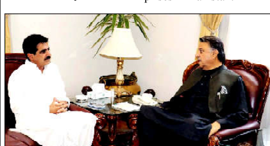
QUETTA: Central Executive Member of Balochistan National Party Haji Zahid Baloch meeting with Governor Balochistan Malik Abdul Wali Khan Kakar