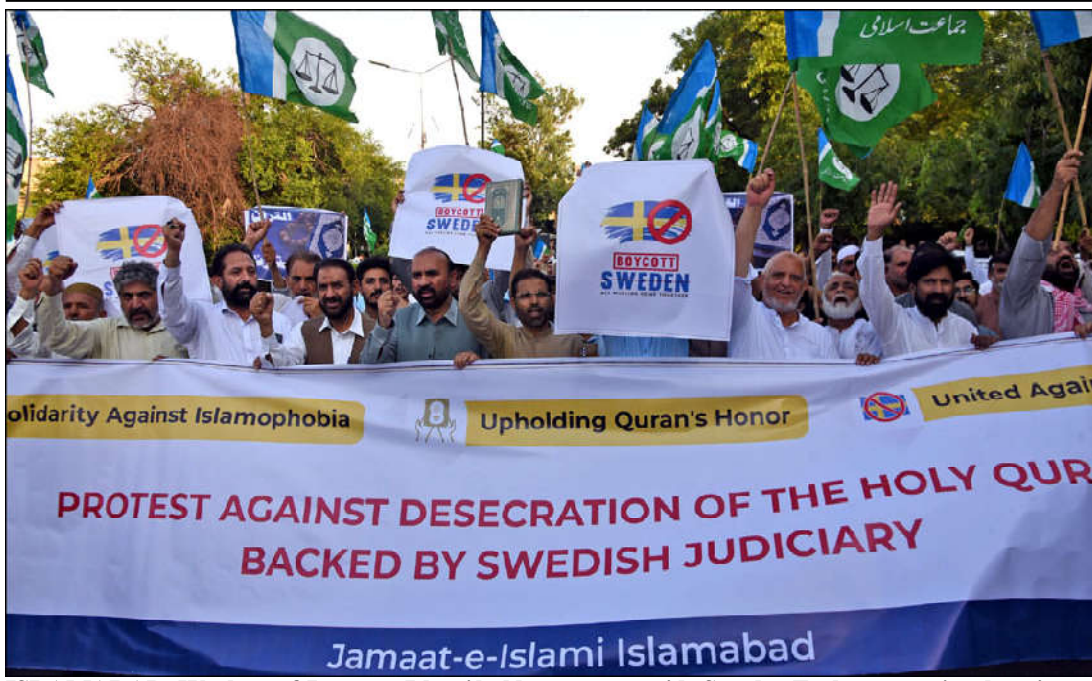
ISLAMABAD: Workers of Jamat-e-Islami holds protest outside Sweden Embassy against burning of Holy Quran in Sweden.