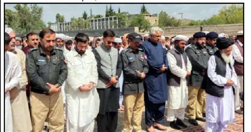
Funeral prayer of the martyred policemen being offered in Zhob

injuries. Due to which one patient died, the family members of the later tortured the doctors and vandalized the hospital, and damaged the government property. Young Doctors Association Balochistan demanded the hospital management, Deputy Commissioner Khuzdar, and higher authorities the miscreants involved in the incident should be arrested and security should be provided to the hospital. PMA Khuzdar and Young Doctors Association Balochistan Khuzdar have jointly announced a boycott of OPD services in Teaching Hospital Khuzdar.