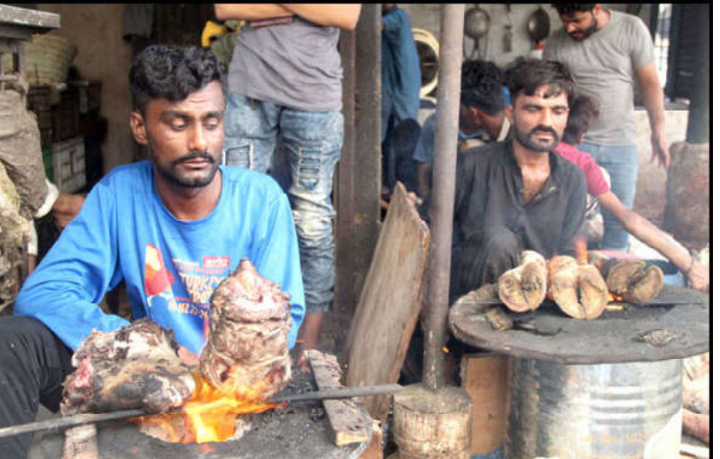
KARACHI: Workers are pealing the "Siri Paye" outside their shop at nanak warha area, the paye and Siri is the one of the favorite and famous dish in Pakistan.

before next winter. To a question about IMF, he said a nine-month relief through an agreement has been made to run the economic affairs in a proper manner. He hoped that heavy investment from the Gulf region would boost business activities We are hopeful to bring role in this country, he said besides open job business opportunities the PML-N will decide opportunities in Pakistan. job