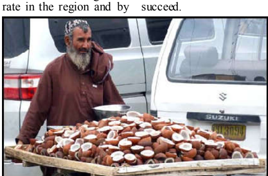
QUETTA: An elderly man pushing his handcart full of coconuts for selling to earn livelihood for his family.

He regretted that the Planning PTI has tried to sabotage Minister said Pakistan has the IMF's agreement with the lowest GDP growth Pakistan but could not succeed