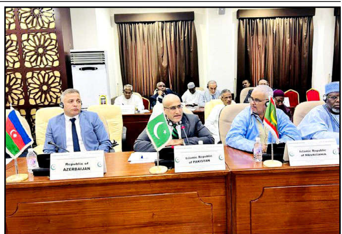
JEDDAH: Pakistan's Ambassador to the OIC Fawad Sher participating in extraordinary meeting of Organization of Islamic Countries (OIC) called to discuss incident of the Holy Quran's desecration in Sweden.

Turkey in late January suspended talks with Sweden on its NATO application after a similar incident of desecration of the Holy Quran by a Danish far-right politician near the Turkish embassy in Stockholm.