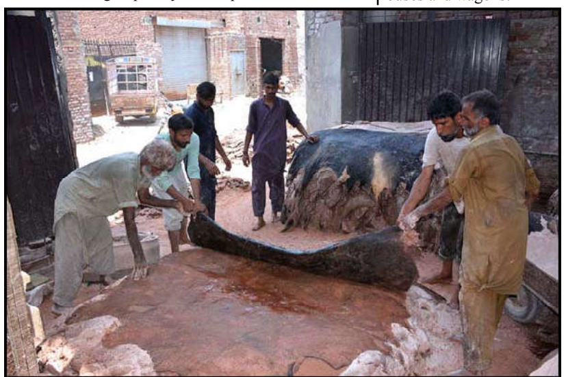
FAISALABAD: Workers preserving sacrificial animal hides at their warehouse.

Apple has surged 49% so far in 2023 in a rally by several of Wall Street's most valuable companies.