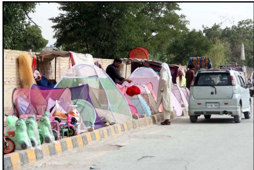
QUETTA: Vendor sells mosquitoes net to earn his livelihood for support his family during hot day of summer season at a roadside stall located on Zarghoon road in Quetta

Korean Embassy, Ministry of National Food Security and Research, universities and senior officials of allied departments, said a press release. These initiatives are being implemented through the joint efforts of PARC and the KOPIA and the successful outcomes of these projects are anticipated to significantly enhance both the quantity and quality of these crops. Speaking on the occasion, Dr Ali lauded the invaluable cooperation extended by the Government of Korea in this regard and emphasized the potential extension of this cooperation to the livestock sector and the application of sex semen technology. He assured the Korean counterparts of PARC's commitment to maintaining close collaboration and acknowledged the people.