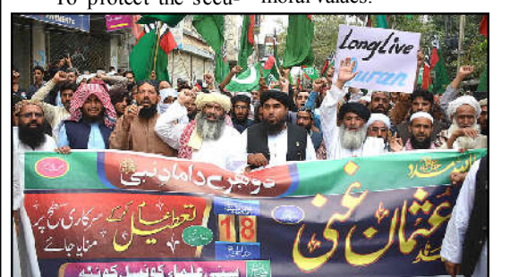
QUETTA: Activists of Suni Ulema Council hold protest out Quetta Press Club.