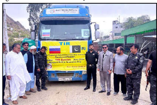
TORKHAM: First Russian Truck under Pak-Russia Road Trade Agreement reaches Torkham.