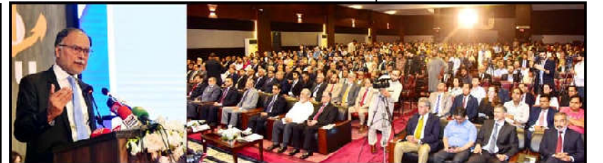
Federal Minister for Planning and Development Prof Ahsan Iqbal addressing the seminar on "CPEC- The Road to Prosperity and Growth Amidst Challenges" in Islamabad.