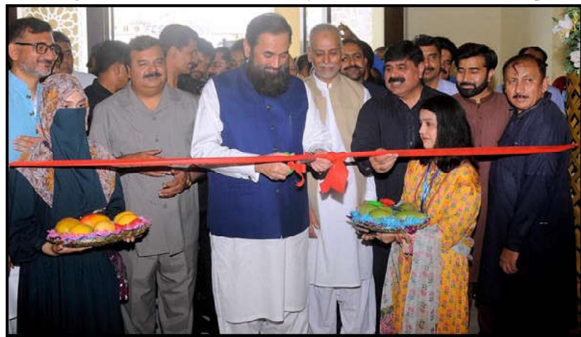
MULTAN: Governor Punjab Engr. Muhammad Baligh Ur-Rehman cutting the ribbon to inaugurate three days of "Mango Festival 2023" at DHAA Arena Hall.