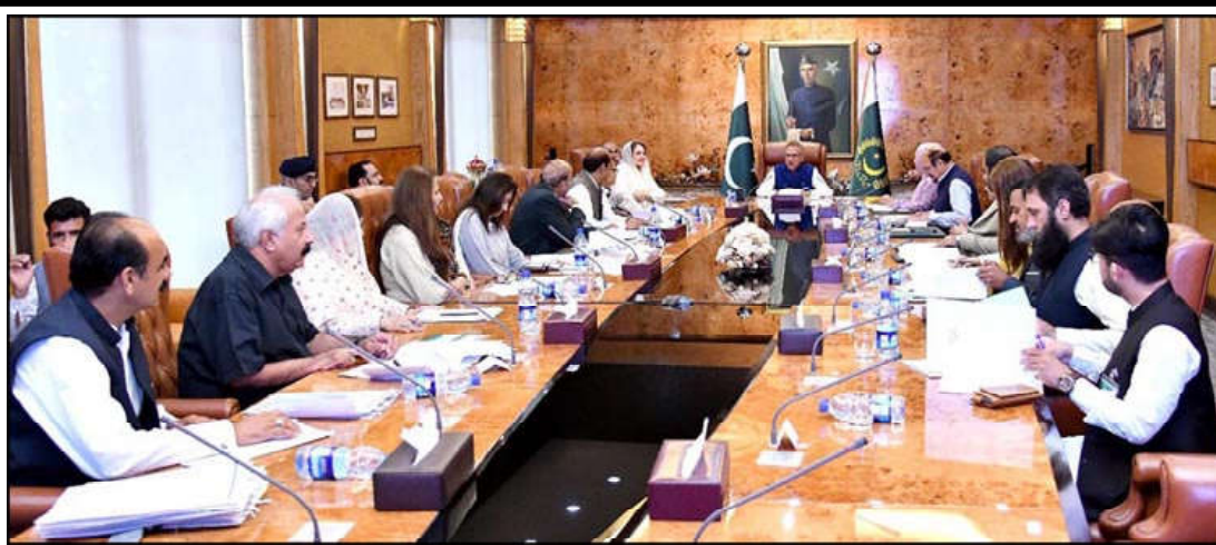
ISLAMABAD: President Dr. Arif Alvi chairing a meeting regarding the framework for the classification of disabilities, at Aiwan-e-Sadr.