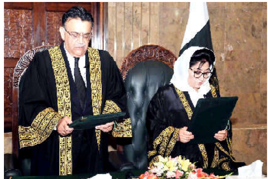
ISLAMABAD: Chief Justice Mr. Justice Umar Ata Bandial administering the oath to Justice Supreme Court judge of the Ms. Justice Musarrat Hilali, Chief Justice Peshawar High Court as Judge of the Supreme Court of Pakistan

The security situation in the province remained satisfactory.