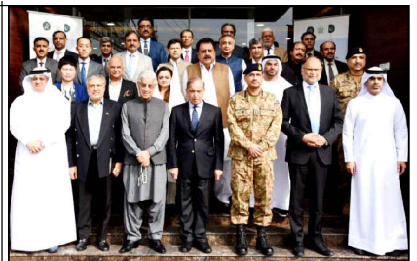
ISLAMABAD: Prime Minister Shehbaz Sharif, Chief of Army Staff General Syed Asim Munir and others in a group photo during inauguration ceremony of Land Information and Management System – Centre of Excellence (LIMS – COE)

The Governor stressed that if we focus on securing rights of the people and make them center of our policies and development projects, then marked improvement can be brought about in the society.