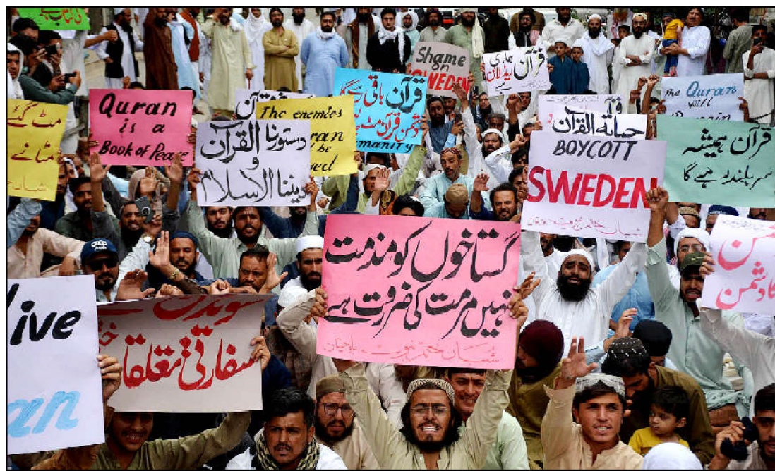
QUETTA: Shaban Khatme Nabuwat holding protest against desecration of Holy Quran in Sweden

Ph: 2841470/2841473 Vol: XVI No. 58, Zil Hajj 19, 1444 AH Saturday July 08, 2023, Pages 08, Price Rs. 15