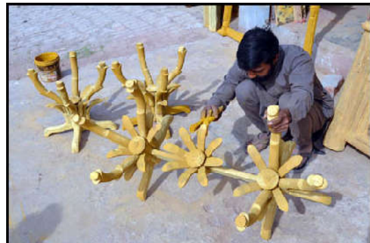
LAHORE: A wood worker given the final touches and polishes on a clothes hanger stand at Shahdara Furniture Market.