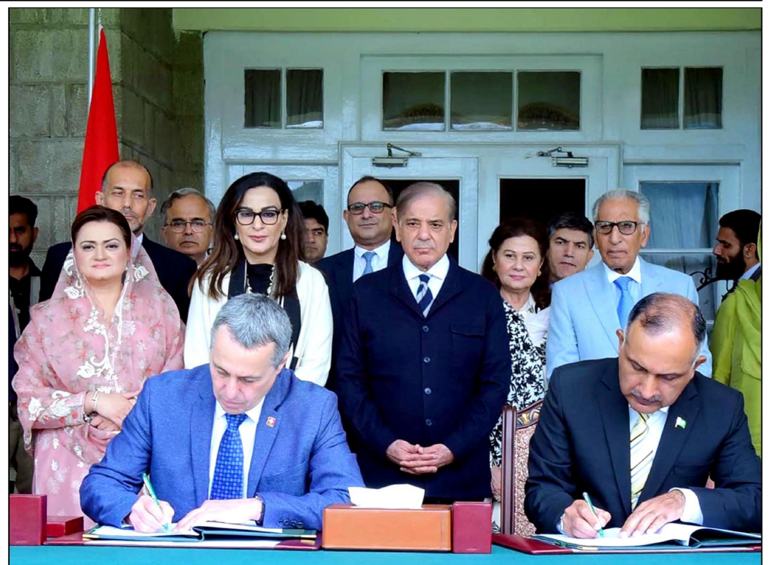
NATHIAGALI: Swiss Foreign Minister Ignazio Cassis and Chairman NDMA Lt. Gen. Inam Haider Malik signed a Memorandum of Understanding between Pakistan & Switzerland to promote cooperation in the field of natural disasters management. Prime Minister Muhammad Shehbaz Sharif witnessed the signing ceremony.