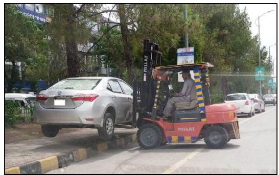
of traffic laws and take action against those involved in creating problems for traffic discipline in the city. The CTO Islamabad

said that it is the right of pedestrians to use footpaths and no parking would be allowed there. He said that vehicles should be parked at lots specified at shopping centers while awareness campaigns should be launched to educate citizens. During the campaign, action was taken against showroom and shopping malls' administrators in G-11 Markaz, F-10 & F-11 Markaz, G-8 & G-9 Markaz, I-8 Markaz, Blue area, Bahria Town, Jinnah Super, F-6 Super Market, Aabpara and Bhara Kahu markets. Vehicles were re-