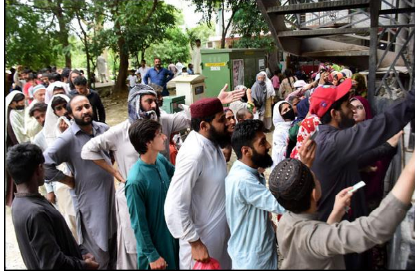
ISLAMABAD: People are stand in queue for registration at low price floor counter at Utility Store in Sitara Market as due to extremely high inflation, common people are suffering a lot across the Country.