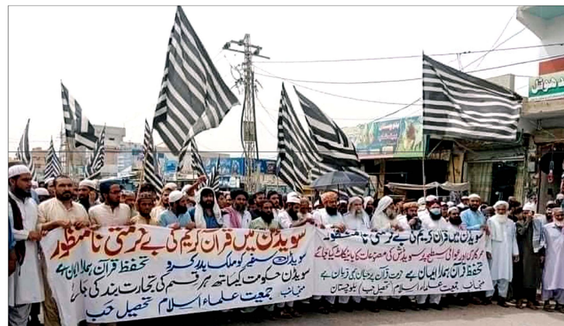
HUB: Members of Jamiat Ulema-e-Islam (JUI) are holding protest demonstration against desecration of Holy Quran in Sweden, held in Hub