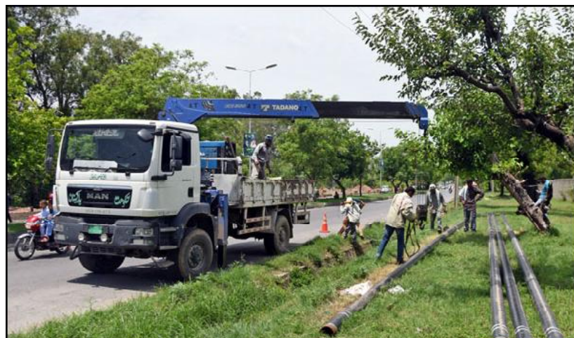
ISLAMABAD: Workers of local administration are installing gas pipe lines along the Park road in Federal Capital.

dedicated his entire existence to serving humanity selflessly, PTV news channel reported. Abdul Sattar Edhi was born on February 28, 1928, in Bantva, Gujarat, British India. He grew up witnessing poverty and suffering, which planted the seeds of compassion and empathy within him. In 1947, following the partition of India, Edhi migrated to Karachi, Pakistan, where he began his lifelong mission of alleviating human suffering. The philanthropist's charitable journey commenced with a humble dispensary in Karachi, which gradually evolved into the Edhi Foundation an unprecedented organization providing a wide range of social services, including medical care, rehabilitation centers, orphanages, morgues, and burial services.