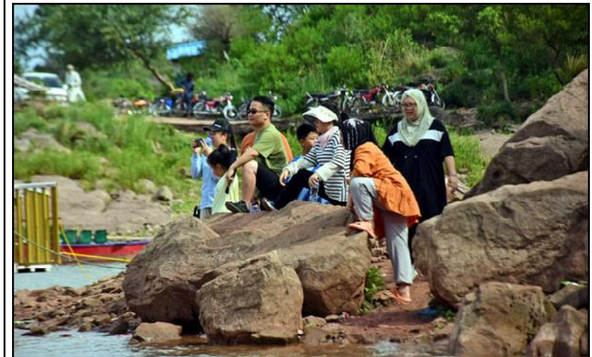
ISLAMABAD: Chinese Tourists are enjoying at Rawal Dam during pleasant weather in Federal Capital.