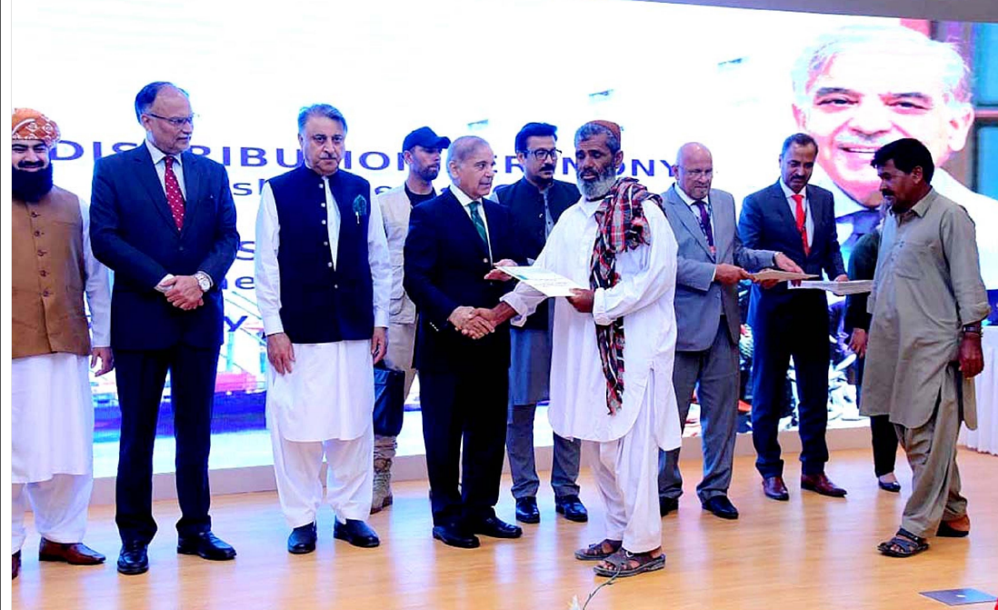
GWADAR: Prime Minister Muhammad Shehbaz Sharif distributes cheques among the fishermen of Gwadar.

the government's Hajj pack-age. In a promising development, Senator Talha announced that next week, the transfer of funds to the respective bank accounts of the pilgrims would begin, ensuring a smooth and efficient refund process.