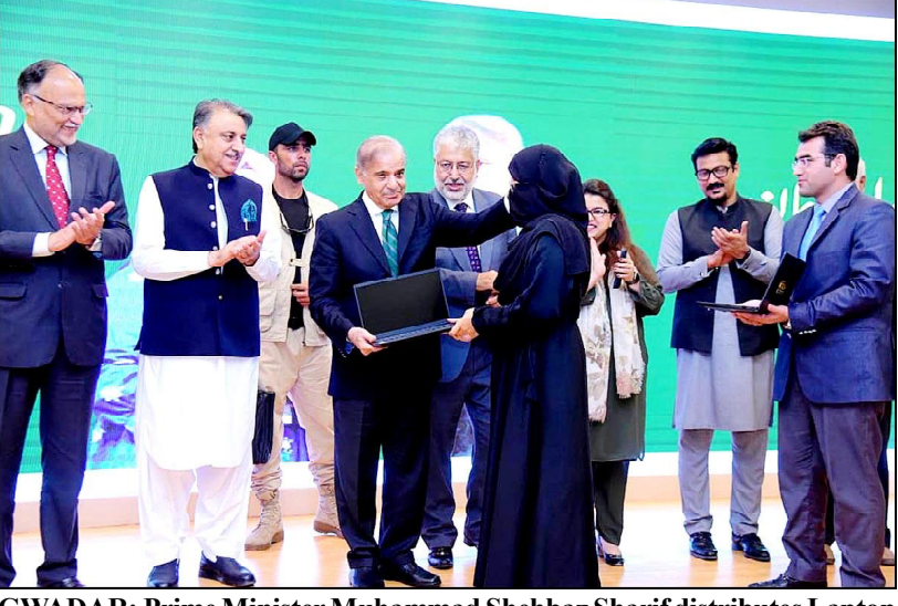
GWADAR: Prime Minister Muhammad Shehbaz Sharif distributes Laptop among the high-achievers of Gwadar University under the Prime Minister delusional remarks about Youth Laptop Scheme 2023.

now been increased to 14% against the 6% population share of the province.