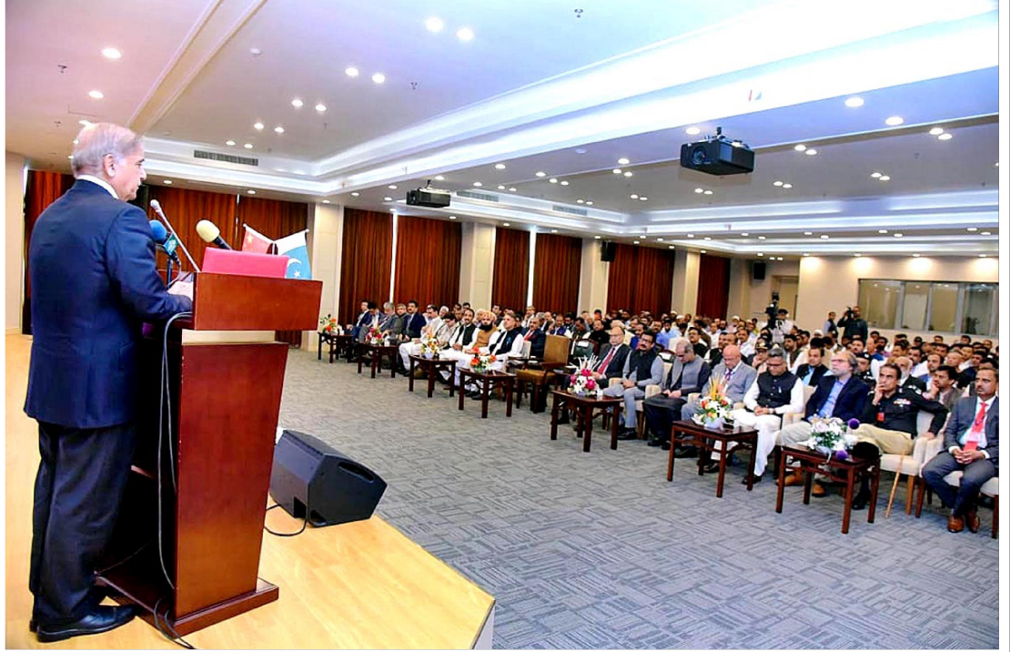
GWADAR: Prime Minister Muhammad Shehbaz Sharif addresses the ceremony of distribution of cheques among the fishermen of Gwadar and distribution of laptops among high-achievers of Gwadar University under Prime Minister's Youth Laptop Scheme 2023