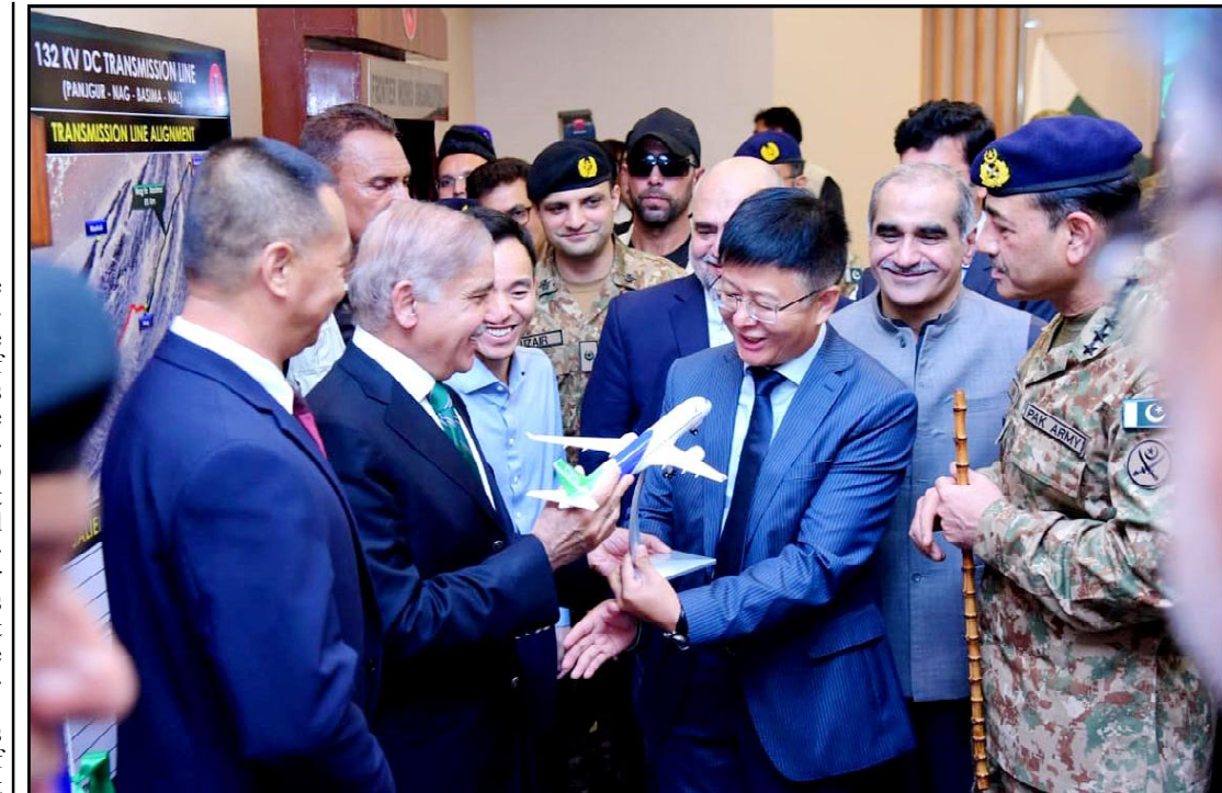
GAWADER: A Chinese official presenting a model of an aircraft to Prime Minister Muhammad Shehbaz Sharif on the completion ceremony of the airside infrastructure (runway, taxiway) at New Gawadar International Airport

Committing offenses under the Prevention of Electronic Crimes Act (PECA), 2016, with malicious intent against the armed forces may result in punishment as prescribed in