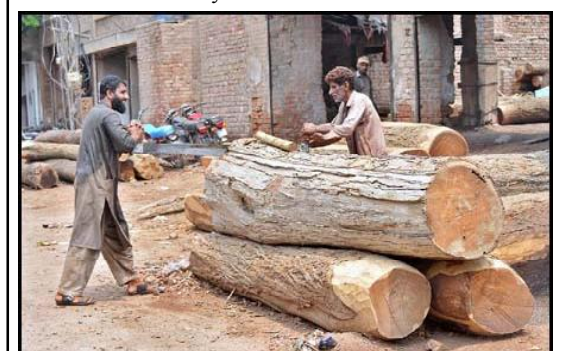
MULTAN: Labourer are cutting huge wood into pieces at the Timber Market.

He said, "Such projects can lead to the creation of tailored hybrid seed varieties that cater to the specific needs of Pakistani farmers and align with the country's agricultural practices and climate."