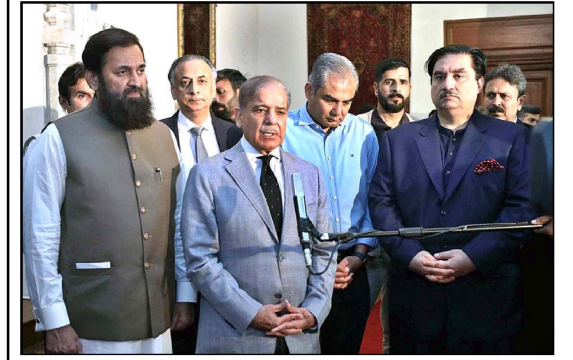
LAHORE: Prime Minister Shehbaz Sharif talking with media persons after inaugurating various development projects.

"Who will be held accountable for such a blunder? It is the continuation of a saga of 75 years for which they were all responsible," he quipped.