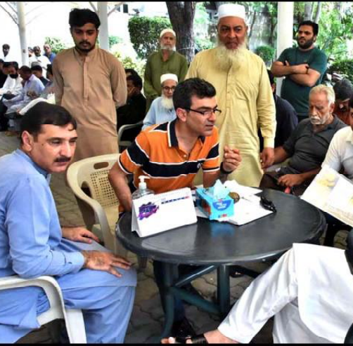
SIALKOT: Defense Minister Khawaja Muhammad Asif is listening to people's problems at his residence in Cantt.

electoral reforms was already started and the Election Commission was busy in the preparation of conducting elections at its specific time and period. Replying to a question, he said that delaying elections would not be favorable for the country's stability and PML-N was also not in favor to delay the process at any cost.