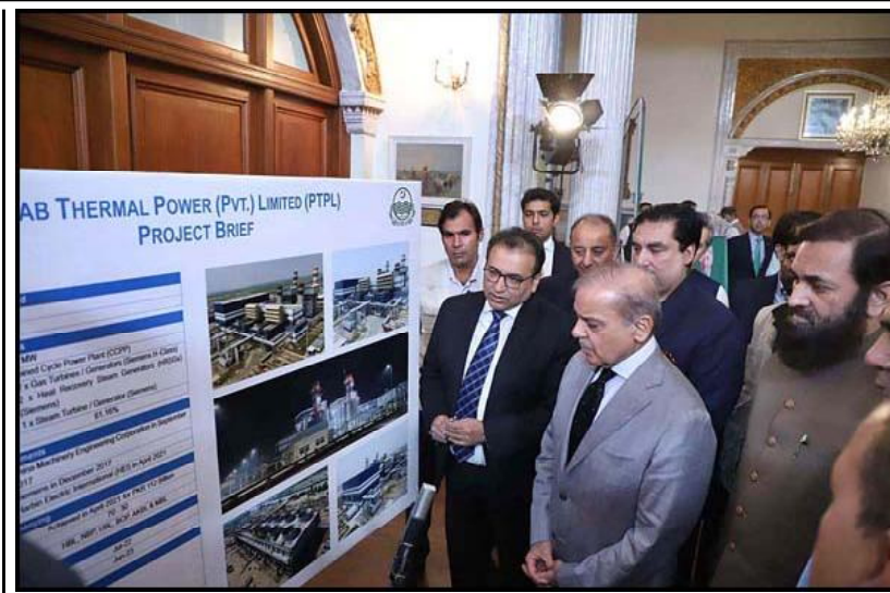
LAHORE: Prime Minister Muhammad Shehbaz Sharif being briefed about 1263 MW Punjab Power Plant Dist Jhang.

He informed that herbal medicines, seafood, rice, sesame, and boiled meat have big potential to attract the Chinese market. The commercial counsellor said that the upcoming food exhibition will connect hundreds of foreign delegates, media personnel, and regulators from 55 countries with budding Pakistani exporters.