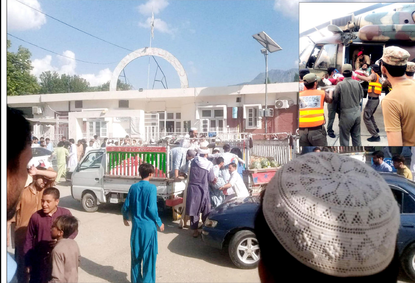
BAJAUR: Worker of JUI (F) shifting injured of suicide bomb blast in a hospital (Inset) Rescue workers shifting an injured worker of JUI (F) in a Army Helicopter.