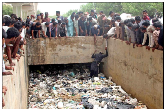
KARACHI: People searching body of a child who drowned in a Nullah at UP More area in the Provincial Capital.

LAHORE (Online): Punjab Governor Muhammad Balighur Rahman has strongly condemned the explosion in the workers convention of JUI (F) in Khar area of Bajaur. He expressed his condolences to the families of those who died in the blast. Governor Punjab prayed for the speedy recovery of those injured in the blast. He said that the nation is united against the monster of terrorism.