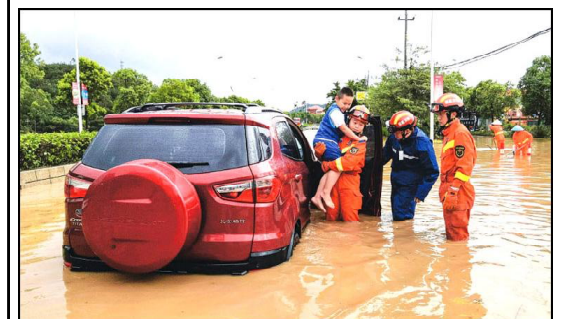
Rescuers evacuate residents in a flooded area after Typhoon Doksuri landfall in Quanzhou, in China's eastern Fujian province.

Monitoring Desk NAIROBI: African leaders are leaving two days of meetings with Russian President Vladimir Putin with little to show for their requests to resume a deal that kept grain flowing from Ukraine and to find a path to end the war there. Putin in a press conference late Saturday following the Russia-Africa summit said Russia's termination of the grain deal earlier this month caused a rise in grain prices that benefits Russian companies. He added that Moscow would share some of those revenues with the "poorest nations." That commitment, with no details, follows Putin's promise to start shipping 25,000 to 50,000 tons of grain for free to each of six African nations in the next three to four months – an amount dwarfed by the 725,000 tons shipped by the U.N. World Food Program to several hungry countries, African and otherwise, under the grain deal. Russia plans to send the free grain to Burkina Faso, Zimbabwe, Mali, Somalia, Eritrea and Central African Republic. Fewer than 20 of Africa's 54 heads of state or government attended the Russia summit, while 43 attended the previous gathering in 2019, reflecting concerns over Russia's invasion of Ukraine even as Moscow seeks more allies on the African continent of 1.3 billion people.