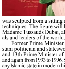
Wax figure of former Prime Minister Benazir Bhutto.

advocating peace, stability, and cooperation amongst nations at international fora. Ambassador Faisal Niaz Tirmizi on the occasion said the work of Madame Tussauds allows us to celebrate the achievements and contributions of remarkable individuals who have inspired generations all over the world. Late Mohtarma Benazir Bhutto's wax figure unveiled at the Madame Tussauds wears the same outfit she wore when sworn in as Prime Minister of Pakistan. The figure