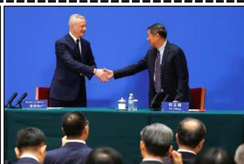
China's Vice Premier He Lifeng and French Economy and Finance Minister Bruno Le Maire attend the China-France Economic and Financial Dialogue at the Diaoyutai State Guesthouse in Beijing, China.