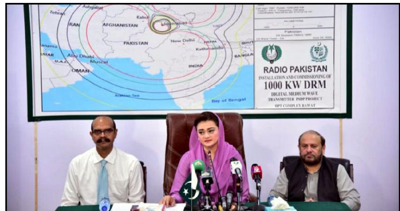
Federal Minister for Information and Broadcasting Mariyum Aurangzeb addressing a Press conference in Islamabad.