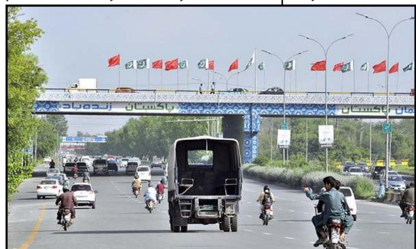
ISLAMABAD: Billboard and Pak-China flags are being displayed at Zero Point in connection with 10 years celebration of CPEC.

ISLAMABAD (APP): An additional 50 surveillance cameras have been strategically installed in Islamabad, covering the high-security zone to the airport, aiming to fortify the security in the city. In response to the growing security concerns, Federal Minister of Interior, Rana Sanaulah Khan, has taken decisive action to enhance the safety of Islamabad, police spokesperson said on Sunday. He said an additional 50 surveillance cameras have been strategically installed, covering the high-security zone to the airport, aiming to fortify the city's surveillance. These new security arrangements will be meticulously monitored through the Safe City cameras, with the public urged to cooperate with the police in bolstering civilian security.