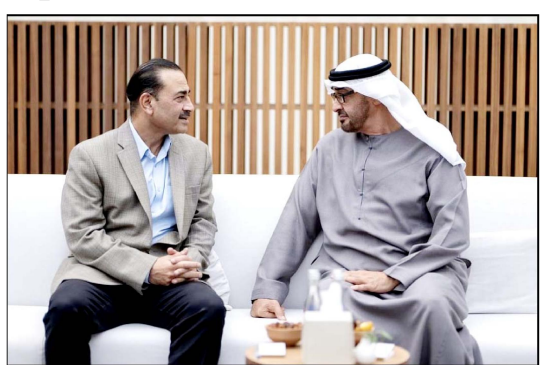
ISLAMABAD (Online): Army Chief General Syed Asim Munir condoled United Arab Emirates (UAE) president Muhammad bin Zayed Al Nahyan on his brother during his visit to the UAE.

The Emirates Embassy in Pakistan shared a photo. In the picture released on the Twitter account by the Embassy of the United Arab Emirates in Pakistan, Army Chief General Asim Munir is seen expressing his condolences with the Emirati President Sheikh Muhammad bin Zayed Al Nahyan.