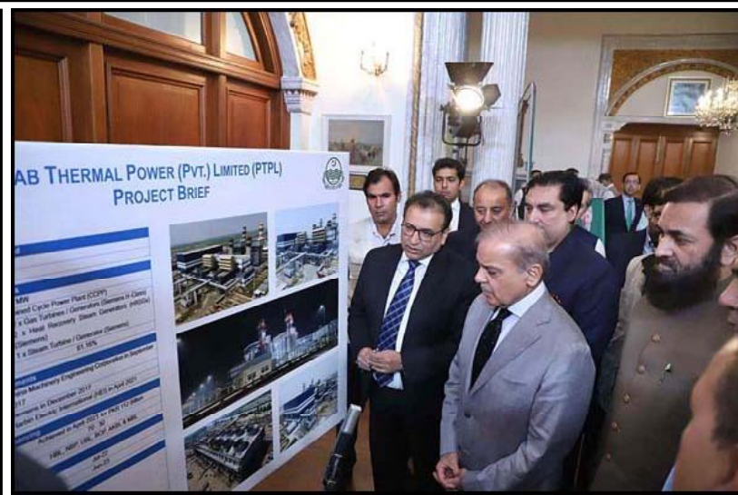
LAHORE: Prime Minister Muhammad Shehbaz Sharif being briefed about 1263 MW Punjab Power Plant Dist Jhang.

He informed that herbal medicines, seafood, rice, sesame, and boiled meat have big potential to attract the Chinese market. The commercial counsellor said that the upcoming food exhibition will connect hundreds of foreign delegates, media personnel, and regulators from 55 countries with established and budding Pakistani exporters.