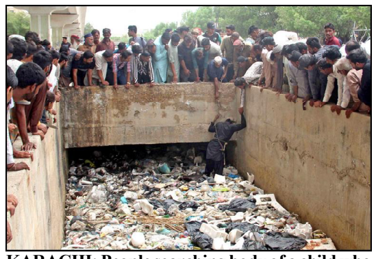
KARACHI: People searching body of a child who drowned in a Nullah at UP More area in the Provincial Capital.

He said that the nation is united against the monster of terrorism.