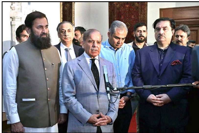
LAHORE: Prime Minister Shahbaz Sharif talking with media persons after inaugurating various development projects.

LAHORE (APP): Prime Minister Muhammad Shehbaz Sharif Sunday lambasted the criminal negligence and inefficient performance of Pakistan Tehreek-e-Insaf's (PTI) government led by former prime minister Imran Khan Niazi, saying that the country paid a heavy price for their blunders and political vendetta. The prime minister expressed these views after performing the soft launching of various development projects which included Rs 50 billion Medical City, Rs 52 billion National Health Support Programme, and Rs 30 billion Population Welfare Programme. On the occasion, he also broke grounds for the SL-3 Lahore Ring Road project, Shadara to Kala Shah Kaku Metro Bus extension project, and inaugurated 1263 MW Punjab Thermal power plant in Jhang with a capacity of generating 10 billion inexpensive units annually. Addressing the ceremony, the PM said Imran Niazi had neglected the completion of the gas-fired Haveli Bahadur Shah power plant due to his animosity with the PML-N leadership and the country had to pay an additional whopping amount of Rs 77 billion besides, its original cost of Rs74 billion at that time due to non-functionality.