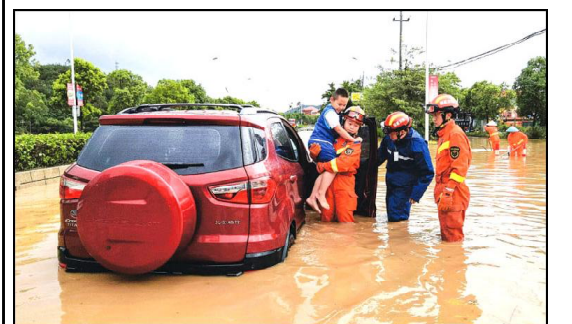
Rescuers evacuate residents in a flooded area after Typhoon Doksuri landfall in Quanzhou, in China's eastern Fujian province.

ping 25,000 to 50,000 tons of grain for free to each of six African nations in the next three to four months — an amount dwarfed by the 725,000 tons shipped by the U.N. World Food Program to several hungry countries, African and otherwise, under the grain deal. Russia plans to send the free grain to Burkina Faso, Zimbabwe, Mali, Somalia, Eritrea and Central African Republic. Fewer than 20 of Africa's 54 heads of state or government attended the Russia summit, while 43 attended the previous gathering in 2019, reflecting concerns over Russia's invasion of Ukraine even as Moscow seeks more allies on the African continent of 1.3 billion people.