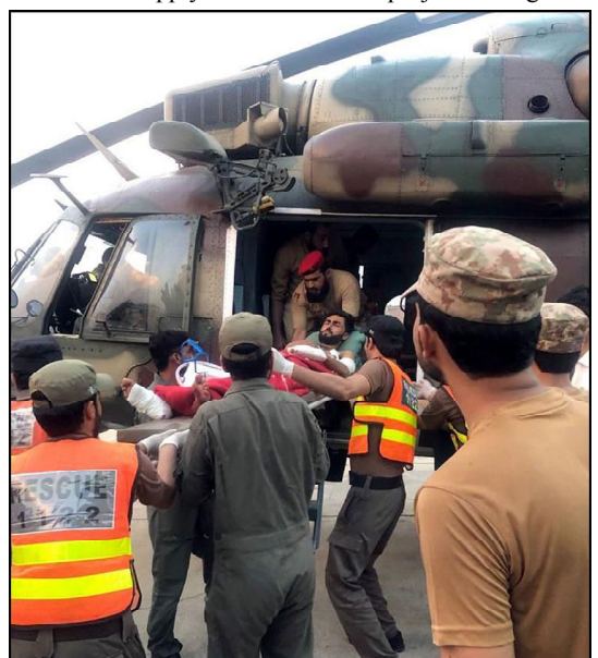
BAJAUR: Rescue workers shifting an injured worker of JUI (F) in a Army Helicopter after the bomb blast in Bajaur district.

K-IV project at Keenjhar Lake on Sunday, he said that they were making all-out efforts to complete the project by 2024 or at the start of 2025. Replying to a question over the delay of the K-IV project which was expected to complete in 2018, he said, 'Where there is a will, there is a way.' He said that their 'Will' was that they had to complete this project whether two months before or two months later. He said that an investigation should be carried out to know about the responsible for the project's design.