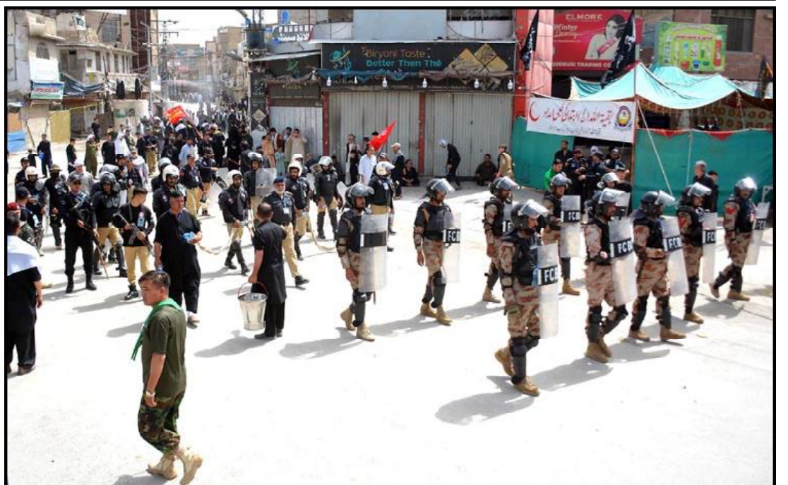
QUETTA: Security personnel standing high alert during Ashura procession on 10 th Muharram ul Haram, commemorating the martyrdom of Imam Hussain (RA) grandson of Holy Prophet Muhammad (SAWW) and other martyrs of Karbala.

kistan on modern lines. The minister extended gratitude to PM, Finance Minister Ishaq Dar, and Planning Minister Ahsan Iqbal for the initiative. With the implementation of the 1000 kilowatt digital DRM medium wave transmitter, she said Radio Pakistan's reach would transcend borders, resonating in more than 52 countries. She said the initiative would help promote Pakistan's narrative, news, heritage, and culture across the world. Out of 20 existing transmitters of Radio Pakistan, 14 had already become obsolete.