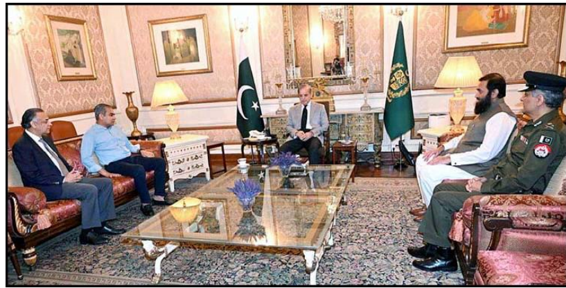
LAHORE: Governor Punjab Muhammad Baligh ur Rehman calls on Prime Minister Muhammad Shehbaz Sharif. Caretaker Chief Minister Punjab Syed Mohsin Naqvi, Chief Secretary and IG Punjab Police are also present.