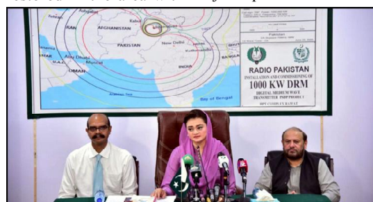
Federal Minister for Information and Broadcasting Mariyum Aurangzeb addressing a Press Conference in Islamabad.

support of the Pak army and security institutions. He expressed sympathy with the bereaved families of the martyrs. He also prayed for early recovery of those injured in the blast. Similarly, the Provincial Minister Home also condemned the Bajor terrorism act in strongest words. In a condemnation statement issued here, he expressed condolence and sympathy with the bereaved families of those martyred in the terrorism. He said that no religion of the world allows attack on the innocent persons and it is an inhuman act to target the innocent people at public place. He said that the people of Balochistan and government share the grief and sorrow with the bereaved families of martyrs. He prayed for the departed souls of the martyrs and early recovery of the injured persons.