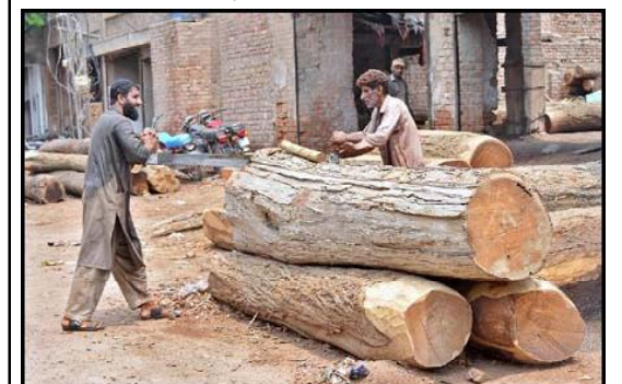
MULTAN: Labourer are cutting huge wood into pieces at the Timber Market.

He said, "Such projects can lead to the creation of tailored hybrid seed varieties that cater to the specific needs of Pakistani farmers and align with the country's agricultural practices and climate."