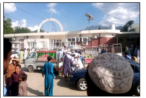
BAJAUR: Worker of JUI (F) shifting injured suicide bomb blast victim in a hospital