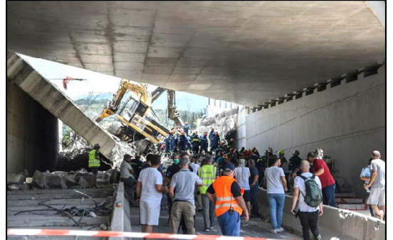
People are seen at the site of a bridge that collapsed in Patras, Greece.

announced the president's plans. Tuesday is the anniversary of Emmett Till's birth in 1941. The monument will protect places that are central to the story of Till's life and death at age 14, the acquittal of his white killers and his mother's activism. Till's mother's insistence on an open casket to show the world how her son had been brutalized and Jet's magazine's decision to publish photos of his mutilated body helped galvanize the Civil Rights Movement. Biden's decision also comes at a fraught time in the United States over matters concerning race.