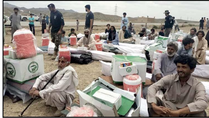
WASHUK: Relief goods being distributed by PDMA among affectees of recent rains