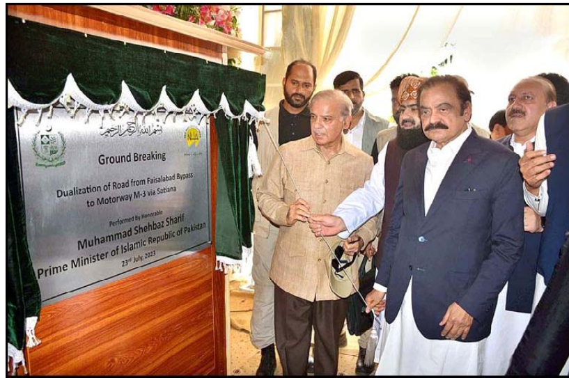
FAISALABAD: Prime Minister Muhammad Shehbaz Sharif is unveiling the plaque during ground-breaking ceremony for dualization of a road from Faisalabad Bypass to Motorway (M-3) via Satiana.

Ph: 2841470/2841473 Vol: XVI No. 72, Muharrumul Haram 05, 1445 AH Monday July 24, 2023, Pages 08, Price Rs.15