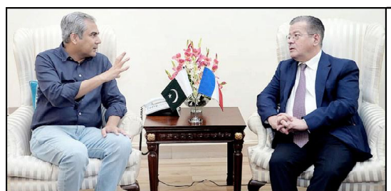
LAHORE: Ambassador of France Nicolas Galey meeting with Caretaker Chief Minister Punjab Mohsin Naqvi at CM Office.

basis stated that all preemptive measures should be given a final shape for the safety of village people present inside the bed of both rivers. The CM asserted that no negligence or lapse would be tolerated under any circumstance with regard to timely evacuation of the people. He directed that Commissioner Lahore and other divisional commissioners should ensure implementation of the formulated plan in case of an emergency. He directed that the administration should constitute mobile teams to provide edibles and medical facilities to affectees.