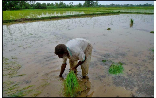
CHINIOT: A farmer busy in seedling rice crop in his field along Lahore Road.

Textile sector that was the major provider of permanent and daily wage jobs has lost 50 percent of both domestic and export market.