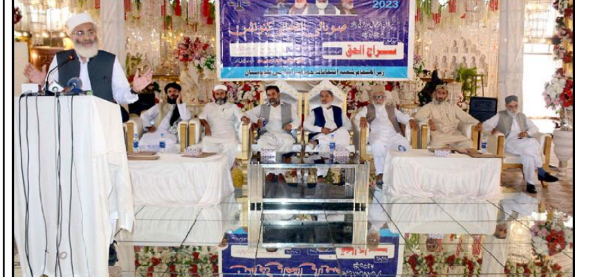
QUETTA: Ameer Jamaat-e-Islami Siraj ul Haq addressing the Provincial Electrol Convention of Jamaat-e-Islami Balochistan.

QUETTA (APP): The Balochistan government has established the first-ever forest school in Ziarat to educate the youth regarding the preservation of forests in the area. The government has also decided to form a special force and engage the local community to ensure the preservation of the forest, an official of the Balochistan government said. In coordination with the departments concerned, steps would be taken to control the illegal cutting of trees, he remarked. He said an effective action plan would be formulated to curb illegal deforestation. He said these forests play an important role in providing both green.