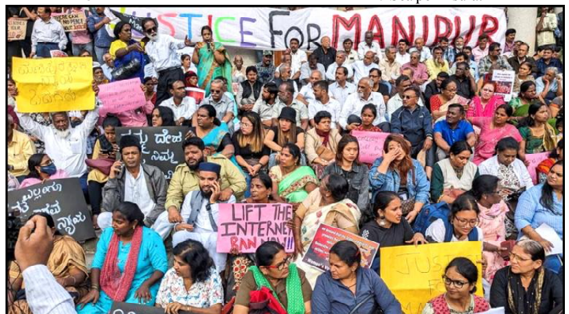
People gather outside Town Hall to protest the alleged sexual assault of two tribal women in the eastern state of Manipur, in Bengaluru, India.