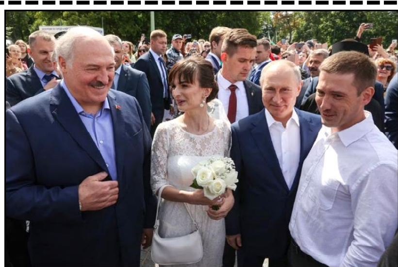
Russian President Vladimir Putin and Belarusian President Alexander Lukashenko meet outside the Naval Cathedral of St. Nicholas in Kronstadt near Saint Petersburg, Russia.

over those responsible for prosecution in Islamic countries. "All Islamic scholars agree that those who desecrate the Koran deserved the most severe punishment... The duty of that (Swedish) government is to hand over the perpetrator to the judicial systems of Islamic countries," Khamenei said in a statement carried by state media. Iran, which has delayed the posting of a new ambassador to Sweden, also said it was not accepting a new Swedish envoy.