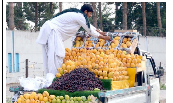
QUETTA: A vendor arranging seasonal fruits on his van to attract customers.

He added that Chashma Right Bank Canal (CRBC) Lift Low Gravity project has been approved with the federal and provincial partnership, the cost of which being shared by our province is 35%, but due to a lack of resources.