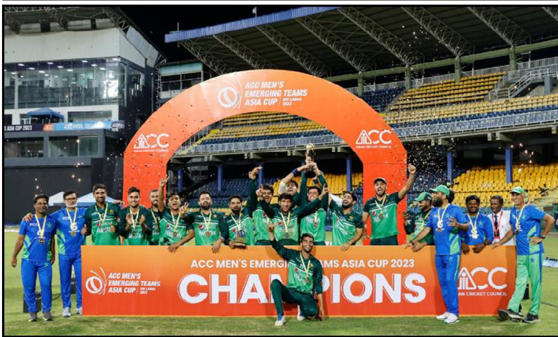
COLOMBO: A group photo of Pakistan Shaheens after winning ACC Men's Emerging Teams Asia Cup after beating India in the final