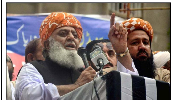
KARACHI: Jamiat Ulema-e-Islam (F) President Maulana Fazlur Rehman addresses a protest rally held in connection with desecration of Holy Quran in Sweden outside Karachi Press Club.