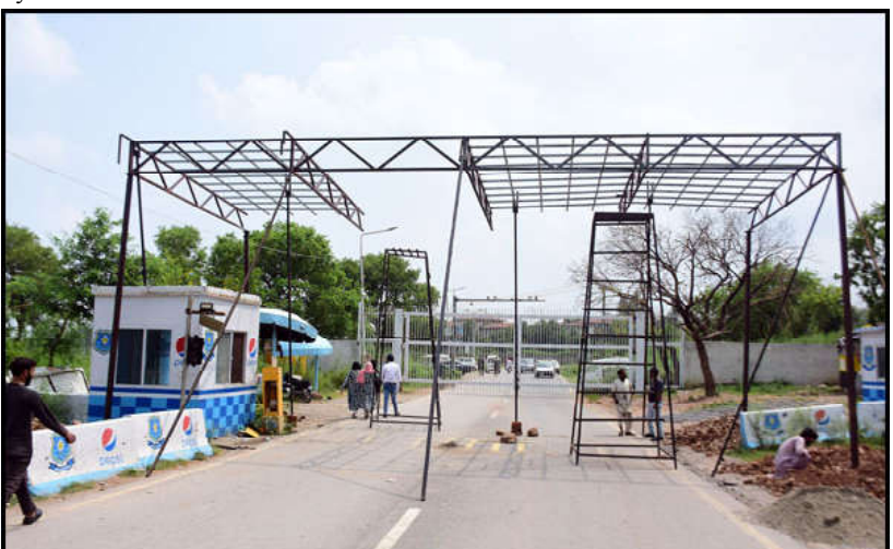
ISLAMABAD: View of gate closed of entrance of Bari Imam road for traffic due to construction of security gate, in the Federal Capital.