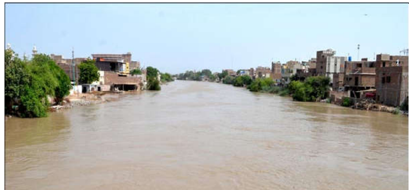
HYDERABAD: View of the water level increasing in the Phuldi Canal while many nearby residents evacuate from their homes due to increased water level and overflowing canal water, in Hyderabad.