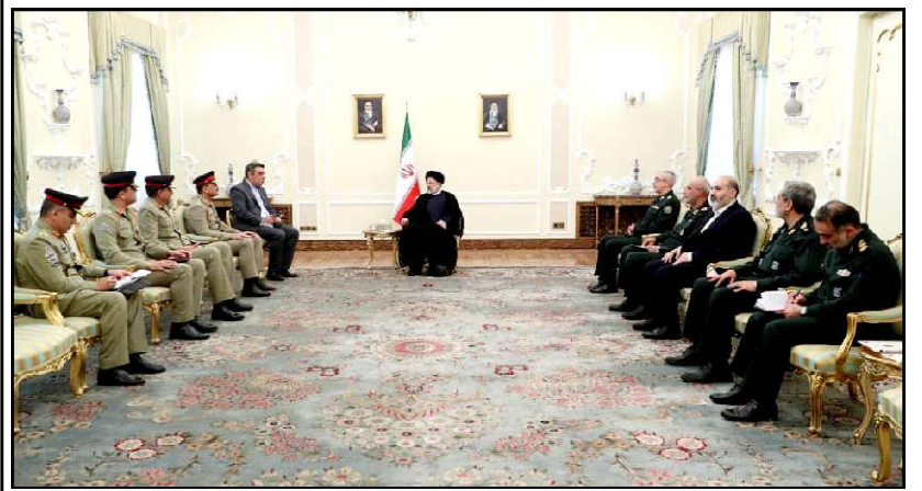
TEHRAN: Chief of Army Staff (COAS) General Syed Asim Munir meeting with President of the Islamic Republic of Iran, Ebrahim Raisi

During discussions, the significance of Pakistan-Iran bilateral relations for regional peace and stability was highlighted. The COAS was presented with the Guard of Honour by a smartly turned-out contingent of Iranian Armed Forces at the Military Headquarters on his arrival.