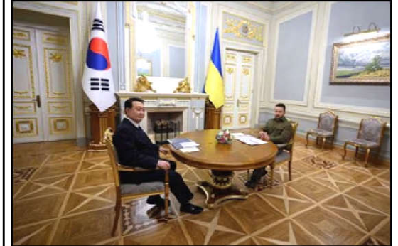
Ukraine's President Volodymyr Zelenskyy and South Korean President Yoon Suk Yeol attend a meeting, amid Russia's attack on Ukraine, in Kyiv, Ukraine.

India, the world's third biggest oil importer and consumer and whose central bank last year announced a framework for settling global trade in rupees, currently pays for UAE oil in dollars. Bilateral trade between the two countries was $84.5 billion in the year from April 2022 to March 2023. An official with knowledge of the details of the agreement said India could make its first rupee payment for UAE oil to Abu Dhabi National Oil Co (ADNOC). Reuters reported on Friday.