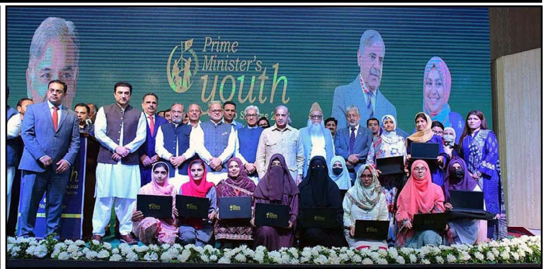
SIALKOT: Prime Minister Muhammad Shehbaz Sharif in a group photo with high achievers who received laptops under the PM Youth Scheme distribution ceremony.

LAHORE (APP): Minister for Railways and Aviation Khawaja Saad Rafique on Sunday called on Prime Minister Muhammad Shehbaz Sharif and apprised him of the progress over reforms in Pakistan International Airlines (PIA) and outsourcing process aimed at provision of better services at airports. During the meeting, they also discussed the matters related to the relevant ministry.