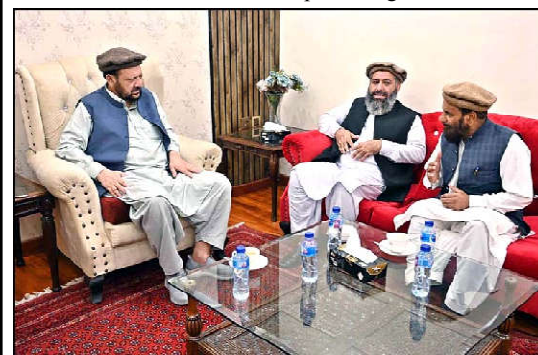
GILGIT: Chief Minister Gilgit-Baltistan, Haji Gulbar Khan in a meeting with the delegation of Jamaat-e-Islami at CM House.

Pakistan, she said, recognizes the critical importance of aligning its efforts with the Paris Agreement to the temperatures limited to 1.5 degrees and the 2030 UN Development Agenda.