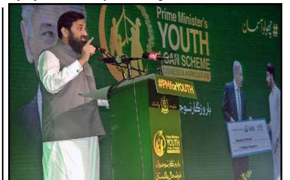
LAHORE: Governor Punjab Engr. Muhammad Baligh ur Rehman addressing the cheques distribution ceremony of Prime Minister's Youth Business and Agriculture Loan.

ISLAMABAD (APP): Pakistan Meteorological Department (PMD) has forecast hot and humid weather in most plain areas of the country. However, rain-wind/thundershower was expected in Kashmir, Potohar region, Northeast Punjab, and Upper Khyber Pakhtunkhwa. According to the synoptic situation, monsoon currents from the Bay of Bengal were penetrating the upper parts of the country. During the last 24 hours, the weather remained hot and humid in most parts of the country. However, rain-wind/thundershowers occurred in various parts of the country.