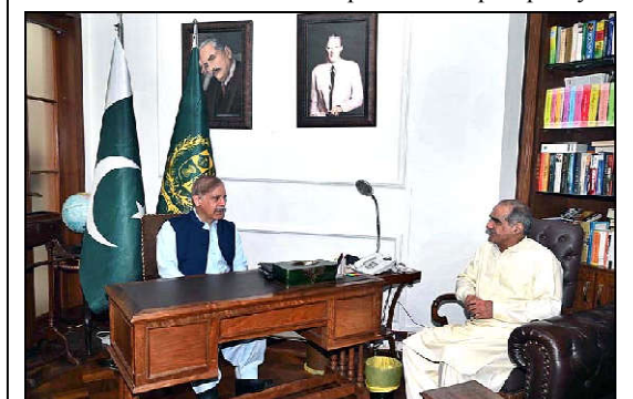
LAHORE: Federal Minister for Railways and Aviation, Khawaja Saad Rafique calls on Prime Minister Muhammad Shehbaz Sharif.

Khawaja Asif said that during the Pakistan Muslim League-Nawaz (PML-N) government before 2018 election, the country's economy was getting stable, but then the premier Nawaz Sharif was disqualified under a conspiracy. He said that Prime Minister Muhammad Shehbaz Sharif was working very hard for the stability of the country's economy and he hoped that they would soon be able to put the country on road to development and prosperity.