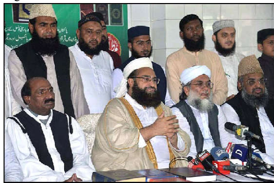
LAHORE: Special Assistant to the Prime Minister on Religious Harmony Maulana Tahir Ashrafi talking to media persons at Jamia Manzoorul Islamia.

The conference placed significant emphasis on fostering interfaith harmony within Pakistan.