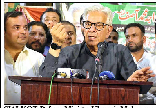
SIALKOT: Defense Minister Khawaja Muhammad Asif addressing the workers convention of PML-N at Union Council Water Works.

PPP source told that Asifa Bhutto will run peoples party's political election campaign. She will address political rallies and meetings in various districts. Asifa Bhutto started preparation for proper political engagements.