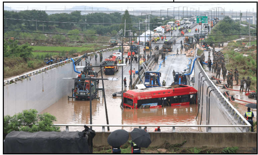
South Korean rescue workers search for missing persons near a bus along a deluged road leading to an underground tunnel where some 15 cars were trapped in flood waters after heavy rains in Cheongju.

Monitoring Desk WASHINGTON: White House National Security Adviser Jake Sullivan said on Sunday the Biden administration remains concerned that North Korea will move forward with another intercontinental ballistic missile test. "I have been concerned for some time that North Korea would conduct what would be its seventh nuclear test," Sullivan said during an interview with CBS's Face the Nation.