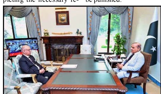
ISLAMABAD: Senator Irfan Siddiqui calls on Prime Minister Muhammad Shehbaz Sharif.

Criticizing the attack on the military installations on May 09 by rioters, Faisal Kundi said those involved in the incident must be punished.