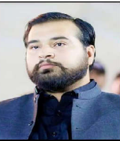
By Hamza Shahzad

Balochistan's educated youth are increasingly feeling exasperated and desperate, as years of university education are no assurance of acquiring a job. With mounting inflation, this catastrophe is also distressing their mental health.