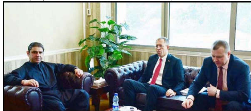
ISLAMABAD: Ambassador of the Republic of Belarus H.E. Andrei Metelitsa calls on the Federal Minister for Inter-Provincial Coordination (IPC) Ehsan ur Rehman Mazari.

Senator Rehman said that rains with thunder-showers were likely in different areas of Islamabad, Punjab, Sindh, Balochistan, Khyber Pakhtunkhwa, Gilgit-Baltistan and Kashmir. "This new wave of monsoon is likely to continue till July 17. In the meantime,