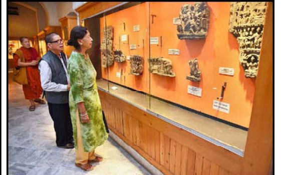
PESHAWAR: Monks from different countries visit Peshawar Museum to see the remains of Buddha's.

drivers, 127 pedestrians, and 462 passengers were among the victims of road traffic crashes. The statistics showed that 224 RTCs were reported in Lahore which affected 257 persons placing the Provincial Capital at top of the list followed by 80 in Faisalabad with 74 victims and at third Multan with 64 RTCs and 65 victims. According to the data, 922 motorbikes, 130 auto-rickshaws, 67 motorcars, 25 vans, 12 passenger buses, 34 trucks and 101 other types of auto vehicles.