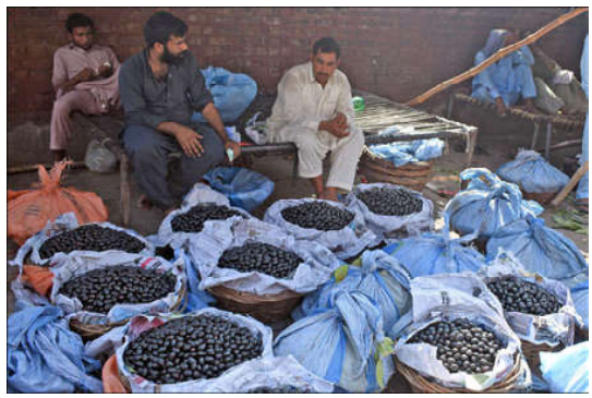
LAHORE: Wholesale traders are waiting for customers to begin the auction of Black plums at Fruit and Vegetables Market in Provincial Capital.

He said that remaining amount of $1.8 billion would be credited in 9 months, following two quarterly reviews. He said more inflows were expected from multilateral development partners including World Bank (WB), Asian Infrastructure Investment Bank (AIIB) and Islamic Development Bank (IDB), which would further improve country's foreign exchange reserves, he added.