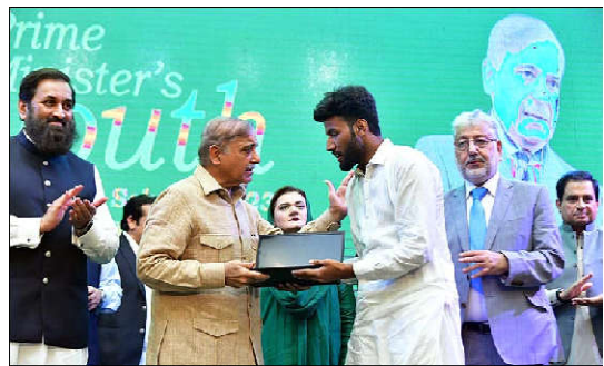
MULTAN: Prime Minister Muhammad Shehbaz Sharif distributes laptops among high achievers of public sector universities under the PM's Youth Laptop Scheme at Bahauddin Zakaria University.

She said Pakistan shared the disappointment of the OIC countries that despite its balanced and apolitical nature.