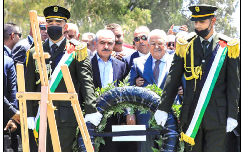
Palestinian President Mahmoud Abbas and Prime Minister Mohammad Shtayeh arrive to lay a wreath of flowers by the graves of those killed in recent Israeli military raids on the Jenin camp for refugees.

Thailand's Pita Limjaroenrat failed on Thursday in his initial bid to become Thailand's next prime minister, after he was thwarted in a high-stakes parliamentary vote that included a host of no-shows and nearly 200 abstentions. The leader of election winners Move Forward was unopposed in the contest but struggled to muster the required support of more than half of 749-member bicameral parliament, despite the backing of his eight-party alliance. Another vote is expected to be held next week, which Pita can contest if nominated again. The progressive Move Forward party and its alliance partner, Pheu Thai.