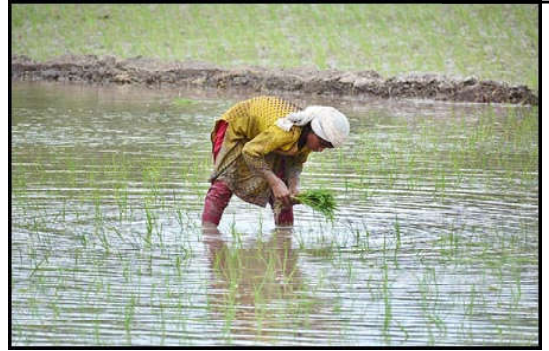
FAISALABAD: A farmer woman busy in seedling the rice crop in her field.

By the end of 2022, CPEC has brought 25.4 billion U.S. dollars in direct investment to Pakistan and has created about 236,000 jobs for the country, as per a recent data revealed by Chinese embassy.