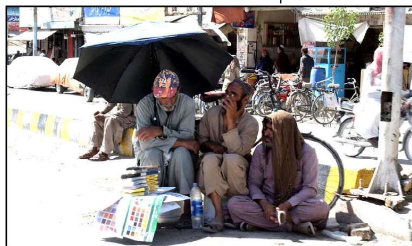
QUETTA: Daily wages labours sitting under umbrella while waiting for customers during hot day.

He mentioned that due to the restraint of resources, only 100,000 laptops were being distributed under the programme and stressed the need for expanding the project to benefit a large number of students.