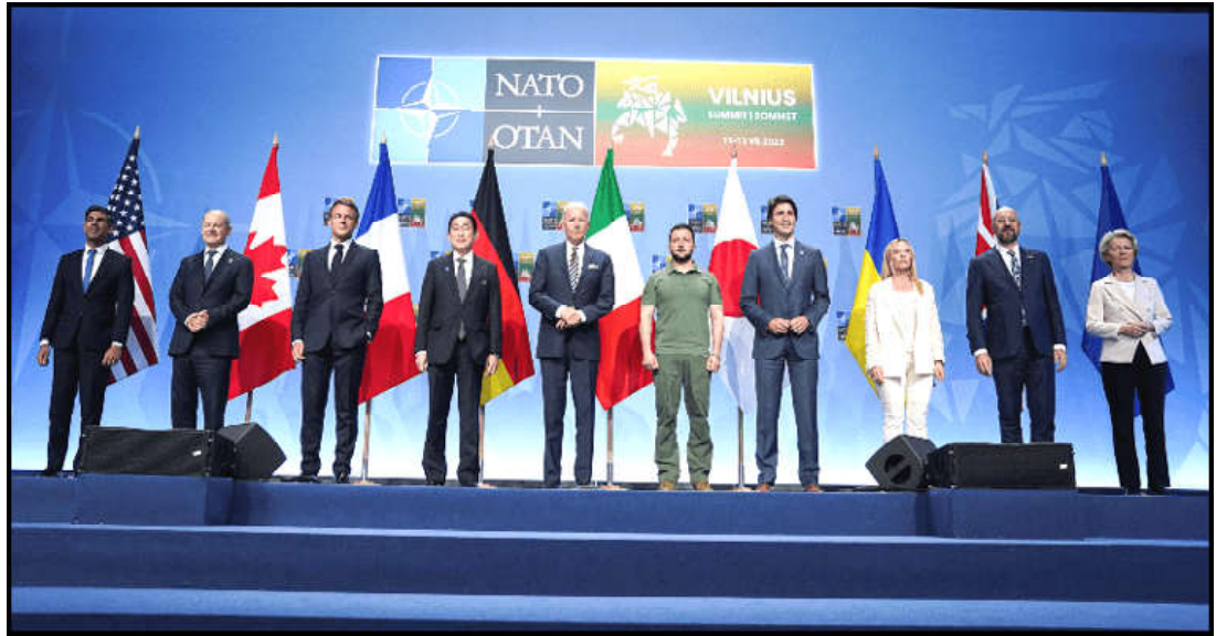
US President Joe Biden, Japan's PM Fumio Kishida, British PM Rishi Sunak, Canadian PM Justin Trudeau, German Chancellor Olaf Scholz, Italian PM Giorgia Meloni, France's President Emmanuel Macron, President of the European Council Charles Michel, European Commission President Ursula von der Leyen and Ukraine's President Volodymyr Zelensky pose for a family photo, as they attend an event with G7 leaders as the NATO summit is held in Vilnius, Lithuania.

"Your resilience and your resolve has been a model for the whole world to see," Biden said. "I look forward to the day when we're having the meeting celebrating your official, official membership in Nato. The bad news for you is, we're not going anywhere. You're stuck with us," Biden joked, prompting laughter from Zelensky. Asked by a reporter how soon after the war he would like Ukraine to join Nato, Biden responded "an hour and 20 minutes". US national security adviser Jake Sullivan said Biden would offer Zelensky long-range missiles when they met.