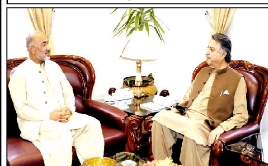
QUETTA: Provincial Ombudsman Balochistan Nazir Muhammad Baloch meeting with Governor Balochistan Malik Abdul Wali Khan Kakar

The suffering humanity was waiting for the completion of the hospital but previous government had not issued funds even to hospitals.