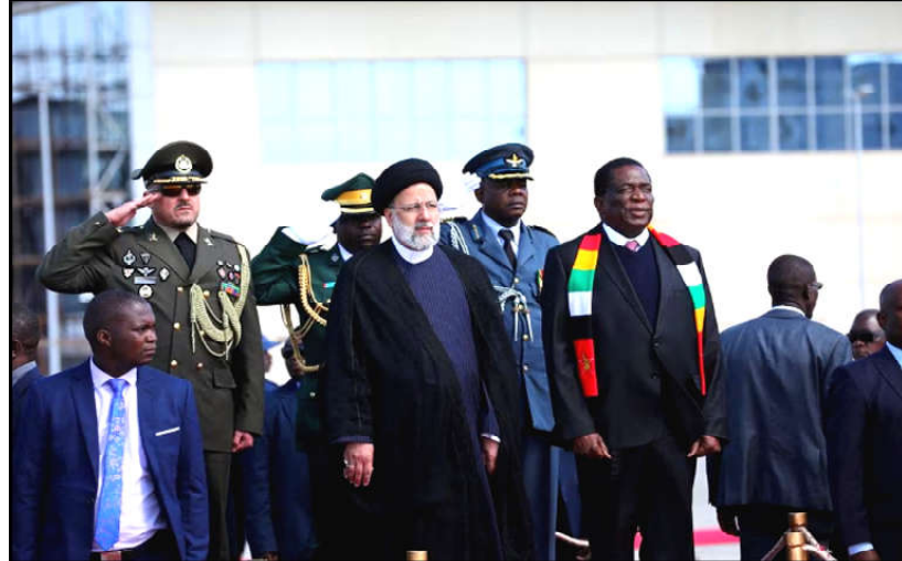
Iranian President Ebrahim Raisi is welcomed by Zimbabwean President Emmerson Mnangagwa, at Harare airport in Harare, Zimbabwe.