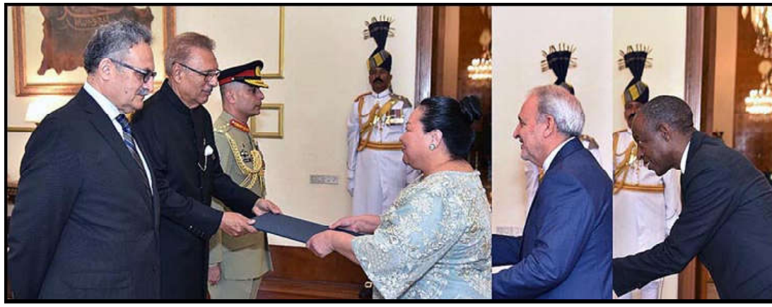
ISLAMABAD: The newly-appointed envoys of the Philippines, Iran and Rwanda presenting their diplomatic credentials to President Dr. Arif Alvi at Aiwan-e-Sadr.

The official told that the Balochistan government was working to provide solar geysers in mosques and public places in various areas of the province. The government is planning to connect the commissioners and public offices at district headquarters with solar energy sources, he added.