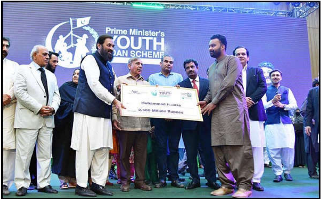
MULTAN: Prime Minister Muhammad Shehbaz Sharif distributes cheques among the successful candidates who received loans under Prime Minister's Youth Loan Scheme.

These initiatives reflect the government's commitment to expanding broadband infrastructure in Balochistan, with numerous projects already underway across the province. Moreover, 21 broadband projects worth Rs. 27.12 billion have been launched in 30 districts of Balochistan.