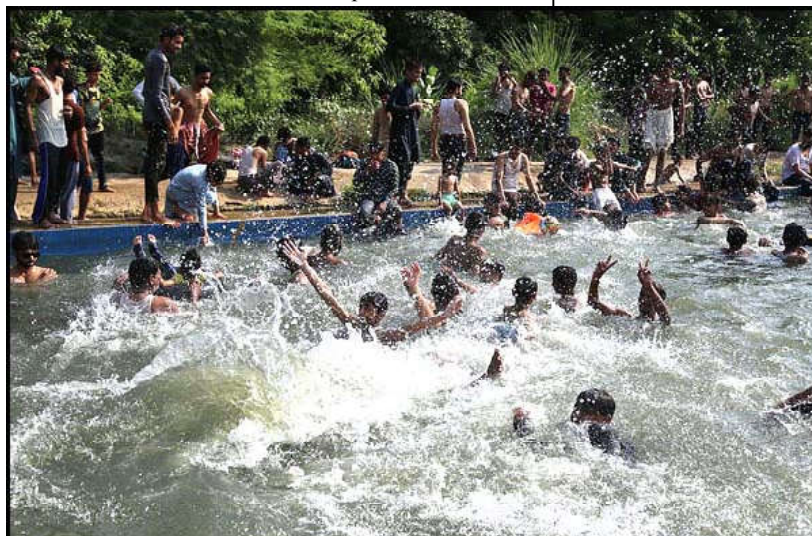
HYDERABAD: A large number of youngsters enjoy bathing in the local swimming pool at Khisana Mori to get relief from scorching hot weather in the city.

superintendents of all district and tehsil headquarters hospitals of Punjab had been directed to make necessary arrangements including the availability of human resources, medicine, supplies, equipment functionality and proper cleanliness for conducting surgeries and normal deliveries in their respective hospitals to provide uninterrupted services. The minister directed the hospital's administration to deal with the patients kindly.