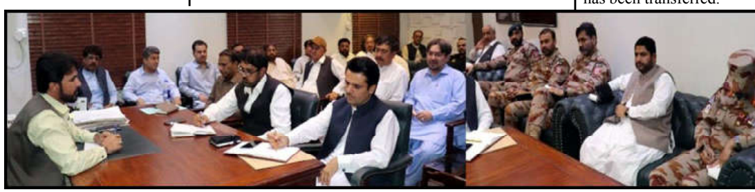
QUETTA: Commissioner Quetta Division Sohailur Rehman Baloch presiding over a meeting regarding security and other arrangements for Muharramul Haram processions

The multipurpose Mohmand Dam Project is being constructed by WAPDA across River Swat in Mohmand District of Khyber Pakhtunkhwa.