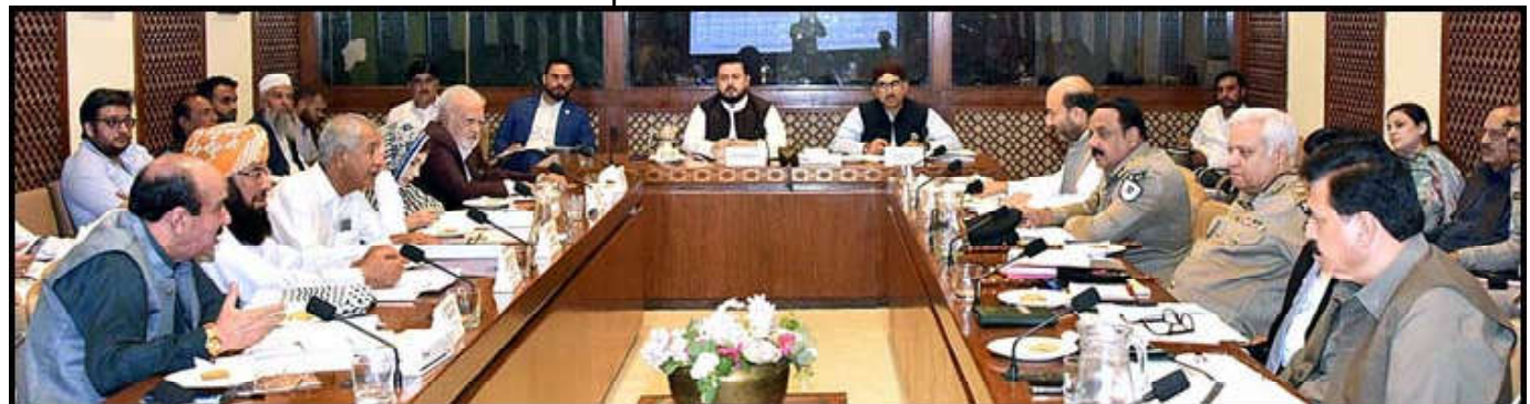
ISLAMABAD: Senator Prince Ahmed Umer Ahmedzai, Chairman Senate Standing Committee on Communications presiding over a meeting of the committee at Parliament House.

In today's globalized economy, countries compete for FDI, and if potential investors face onerous screening processes, they may choose alternative destinations with more favorable investment climates, he added.