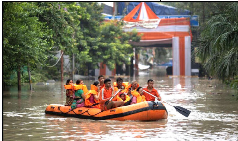
Members of the National Disaster Response Force (NDRF) evacuate stranded residents from a flooded locality, after a rise in the water level of the river Yamuna, in New Delhi, India

people of Delhi to cooperate with each other in every possible way in this emergency," Delhi's Chief Minister Arvind Kejriwal said on Thursday, warning that water supplies would be badly affected. "Due to the closure of water treatment plants, the supply of water will be affected by up to 25pc. That's why water rationing will be done," Kejriwal told reporters. The city of 20 million people has ordered the closure of all schools, colleges and universities until Sunday and stopped non-essential government staff from coming to the office, Kejriwal said, adding that private firms were also being advised to "implement work from home." Kejriwal said the Yamuna's level would peak later today, having already reached its highest levels in 45 years as a result of the unusually heavy downpours north of the capital.