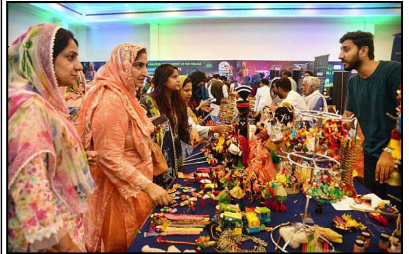
LAHORE: Women participating in the Dastkar Mela organized by Punjab Small Industry at the local hotel.

Additionally, another project worth PKR. 4.82 billion has been initiated to ensure voice and 4G coverage on 478 kms of previously unserved road segments along the M-8 motorway.