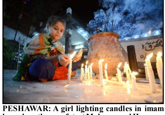
PESHAWAR: A girl lighting candles in imam bargah on the eve of start Muharram ul Haram.