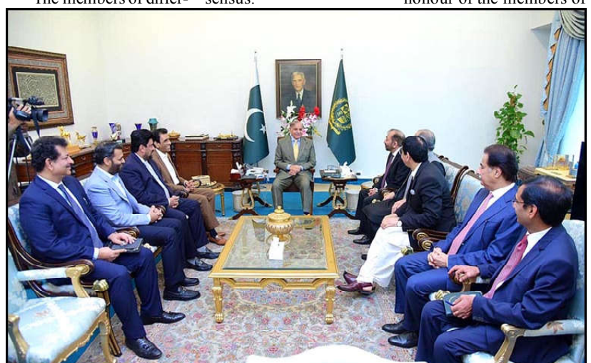
ISLAMABAD: A delegation of MQM led by the Convener Dr. Khalid Maqbool Siddiqui calls on Prime Minister Muhammad Shehbaz Sharif.