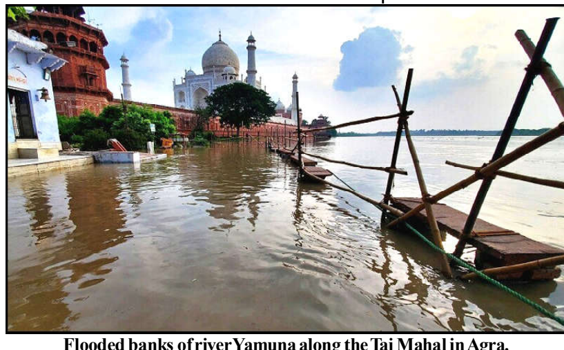
Flooded banks of river Yamuna along the Taj Mahal in Agra.

The World Meteorological Organization warned on Tuesday of increased risk of deaths linked to excessively high temperatures. Meanwhile Hawaii's Big Island was bracing for the impact of Tropical Storm Calvin, expected to bring as much as 8 inches (20.3 cm) of rain and strong wind gusts, the National Weather Service (NWS) said. In South Korea, deluges of rain have pummelled central and southern regions since last week. Fourteen deaths occurred in an underpass in the central city of Cheongju, where more than a dozen vehicles were swamped on Saturday when a river levee collapsed. In the southeastern province of North Gyeongang, 22 people died, many from landslides and swirling torrents. This year's casualties have rekindled questions over South Korea's efforts to prevent and respond to flood damage, less than one year after the heaviest downpours in 115 years pounded Seoul.