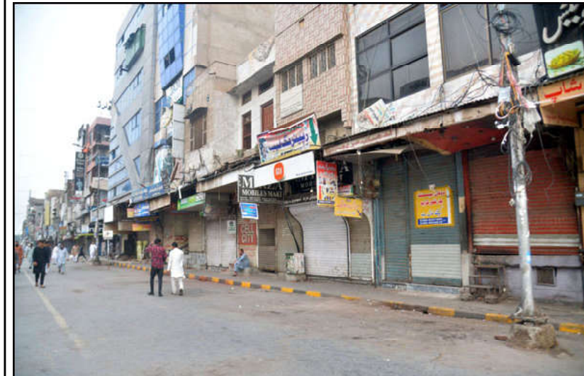
FAISALABAD: A view of the closed shops and Markets in Kacheri Bazaar due to security measurements because of Shiite Muslims Rituals in the month of Muharram-ul-Haram in City.

The petitioner requested the court to nullify the decision of granting physical remand by sessions court.