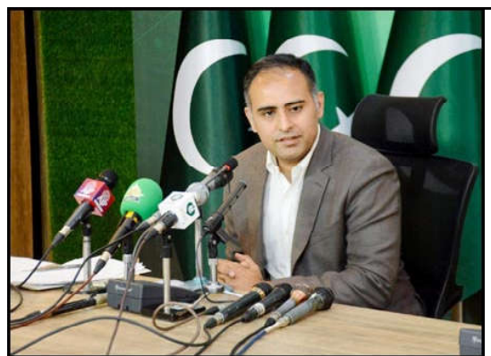
Coordinator to the Prime Minister on Economy and Energy, Bilal Azhar Kayani addressing a press conference in Islamabad

PTCL achieved 17.2 per cent revenue growth over the same period last year in the fixed broadband business. The Company further strengthened its flagship FTTH brand, "Flash Fiber" by achieving significant net subscriber additions through exceptional customer experiences and aggressive expansion of the fiber network across the country which played a vital role in achieving a significant increase in FTTH revenue by 106.5 per cent. IPTV segment also showed a 5.8 per cent revenue growth Year-on-Year basis (YoY). Voice and wireless revenue streams continue the declining trajectory as they are impacted by OTT services and tough competition from cellular operators. PTCL's enterprise business grew by 21.1 per cent as compared to last year.