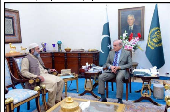
MNA Hamid Hameed calls on Prime Minister Muhammad Shehbaz Sharif in Islamabad

The chief justice IHC also issued instructions regarding the construction of shades at the place dedicated to cameramen. Justice Tariq Mehmood on the occasion said that the media should focus on highlighting the problems of the public.