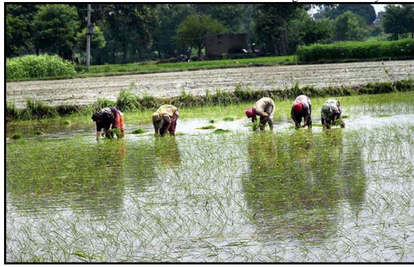
SIKALOT: The farmer family is cultivating the rice crop in the fields in a traditional way.

was regularly arranging open courts and now these courts are being organized online to facilitate the consumers further and saving their precious time which they had to spend for visiting FESCO Headquarter to participate in the open court. He added that FESCO has created close liaison among company employees and its consumers so that uninterrupted power supply could be ensured by redressing genuine problems of the consumers without any delay. He said that FESCO had also launched a vigorous campaign against power pilferage. In this connection, FESCO teams were regularly patrolling on electricity lines in addition to ensuring surprise checking of electricity supply meters. However, without public cooperation.