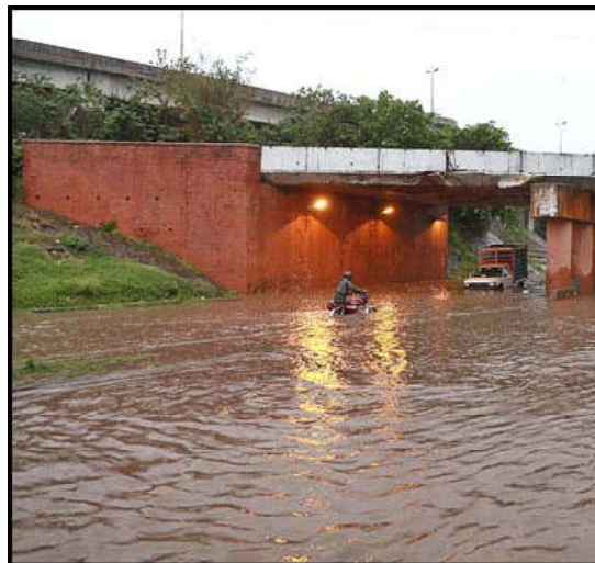
RAWALPINDE: Vehicles passing through rain water accumulated on road during torrential rain since last night.

He asked to join hands with the police to reduce accidents and inform family members, children, and friends about traffic laws and road safety.