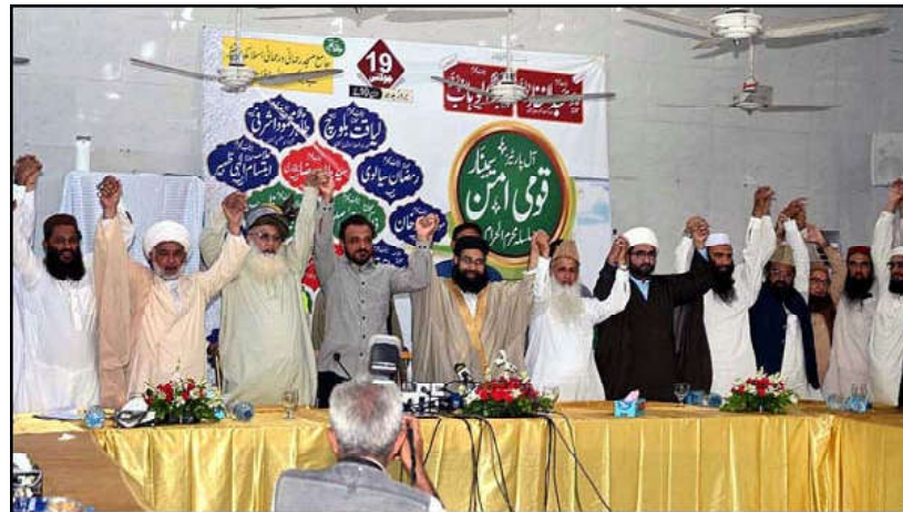
LAHORE: Chairman Pakistan Ulama Council and Special Representative of Prime Minister of Pakistan for Interfaith Harmony and Middle East Hafiz Muhammad Tahir Mahmood Ashrafi series of All Parties National Peace Seminar at Rahmani Islamic Center Model Town hand in hand for peace and unity on the occasion of Muharram.

lowers fought against the injustice and sacrificed their lives to uphold the sanctity of truth. Dr Alvi prayed that may Allah Almighty make the new Islamic year a source of His blessings for Pakistan, the nation, Islamic community and the entire world. "May the new Islamic year bring for us the peace, prosperity and happiness and lead us towards a better future ahead," he said. Meanwhile on the advent of the new Islamic year on Wednesday, Prime Minister Shehbaz Sharif urged countrymen to strive for emulating the noble teachings of the Holy Prophet Muhammad (PBUH) and his companions besides building a society featuring principles of social justice and equality. "Let us pledge today that we will strive to emulate the noble qualities established by our Prophet Muhammad (PBUH).