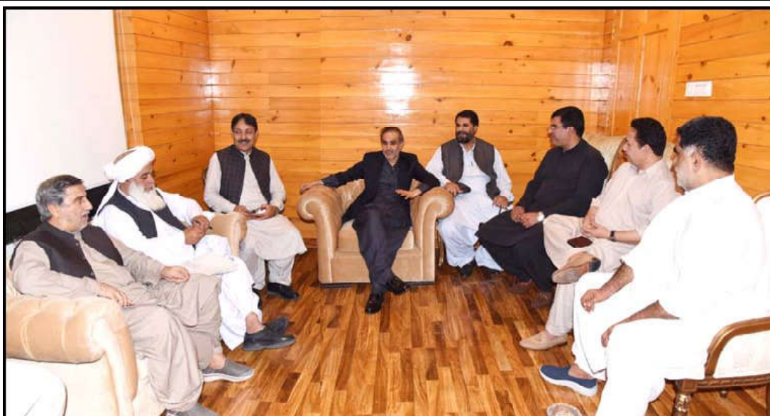
QUETTA: Balochistan Chief Minister Mir Abdul Qudus Bizenjo holding consultative meeting with Opposition MPAs regarding caretaker setup

During the course of dinner, there was discussion on the political as well as other matters.