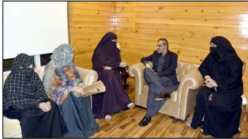
QUETTA: A delegation of women MPAs meeting with Balochistan Chief Minister Mir Abdul Qudus Bizenjo.

diplomacy. Pointing out that the US has chosen friends within the setting of the Indo-Pacific Strategy, Ambassador Masood Khan noted that "their (US friends) declared vectors of invest, align and compete, we are told are not designed to alienate or confront other countries in the region and beyond." On its part, he said Pakistan had pursued connectivity through the China-Pakistan Economic Corridor to leverage its economic geography, declaring, "Our defence and economic ties with China will continue."