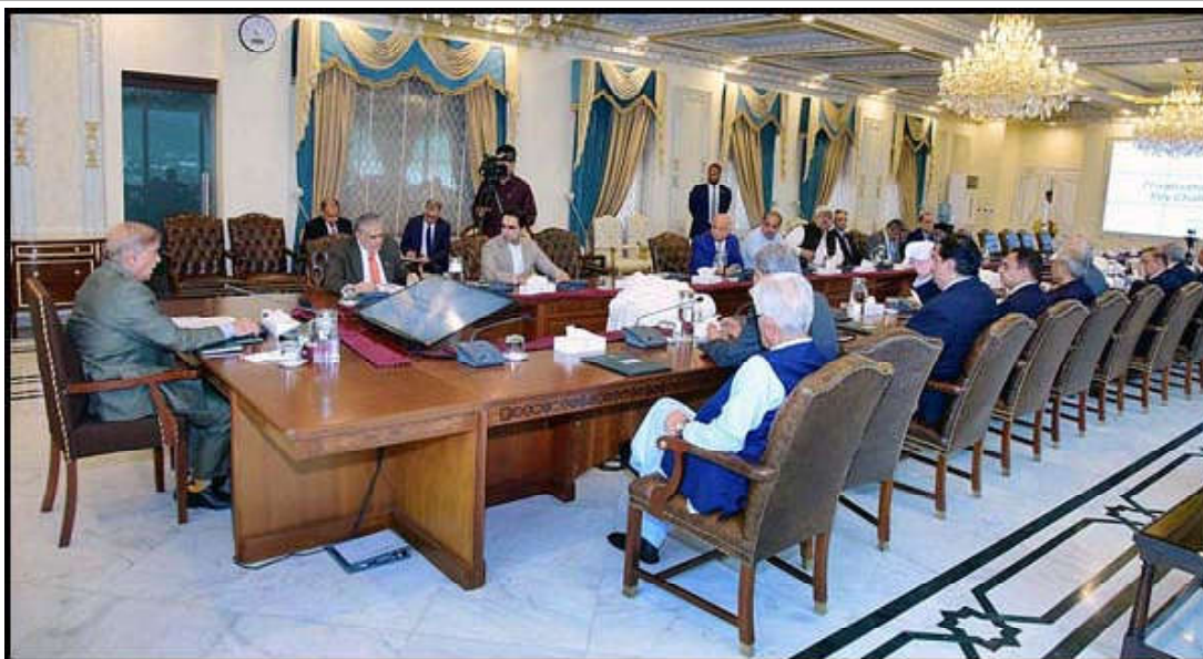
ISLAMABAD: Prime Minister Muhammad Shehbaz Sharif chairs a meeting to review the progress regarding the ongoing SOE reforms.