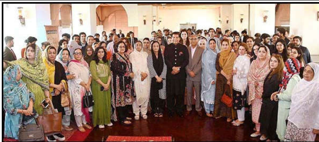
ISLAMABAD: Speaker National Assembly Raja Pervez Ashraf in a group photo with participants of the closing ceremony of Roundtable of Political Parties on Women Manifesto 2023 organized by WPC.