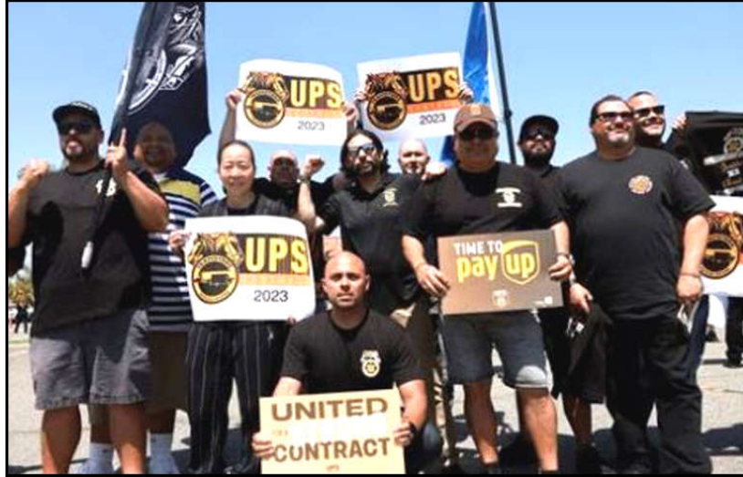
United Parcel Service and the Teamsters hold a rally before the beginning of the largest U.S. private sector labor contract talks covering more than 330,000 U.S. drivers, package handlers and loaders at the global delivery firm, in Orange, California, U.S.

Monitoring Desk LUCKNOW: At least 16 people were killed and another six injured in a suspected case of electrocution in the north Indian state of Uttarakhnad on Wednesday morning, government officials said. The incident took place inside a sewage treatment plant established in the Himalayan state's Chamoli district as part of a flagship programme of the federal government that focuses on conserving the river Ganga.