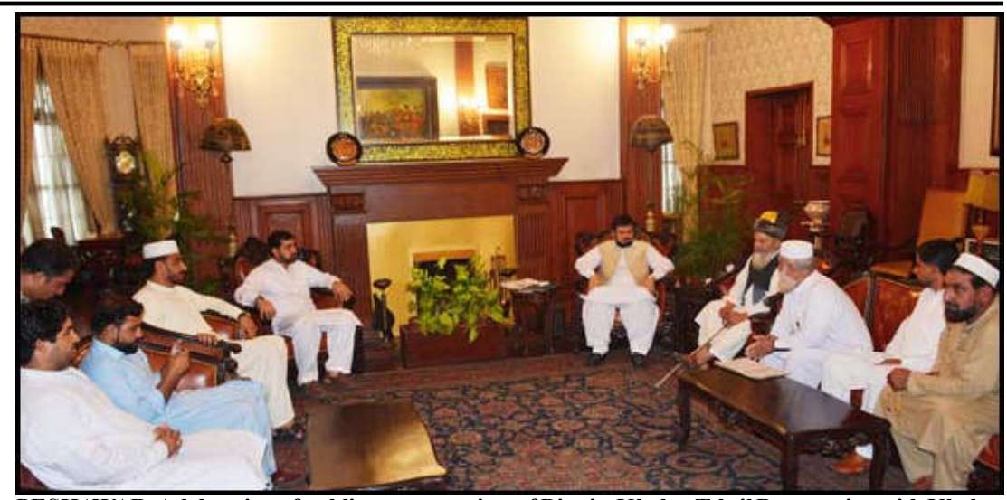
PESHAWAR: A delegation of public representatives of District Khyber Tehsil Bara meting with Khyber Pakhtunkhwa Haji Ghulam Ali.

“Without quality education and vocational training to youth, the country’s development seemed difficult and collective efforts were required to promote technical education in all areas of Pakistan,” he said.