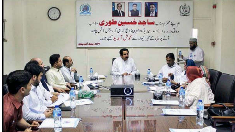
PESHAWAR: Federal Minister for Overseas Pakistanis & HRD, Sajid Hussain Tori chairing a meeting at OPF Regional Office.