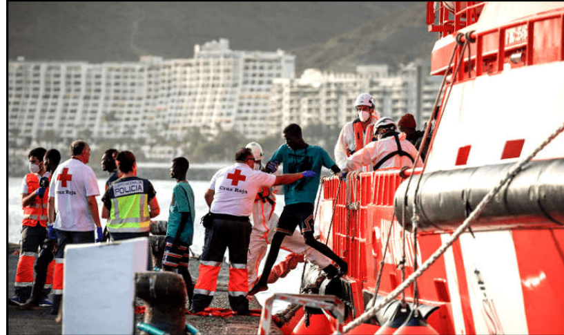
Migrants disembark from a Spanish Maritime Rescue vessel in the Port of Arguineguin on the Canary Island of Gran Canaria.

Monitoring Desk LONDON: UK unemployment rose back to four per cent in the three months to the end of May, official data showed Tuesday, as the economy struggles with stubbornly high inflation. The unemployment rate increased from 3.8pc in the three months to the end of April, the Office for National Statistics (ONS) said in a statement, dashing expectations for no change. The rate was back at 4pc for the first time since the start of 2022. Despite the rise, finance minister Jeremy Hunt said Britain's "jobs market is strong with unemployment low by historical standards." The ONS added that pay excluding bonuses had risen at record levels.