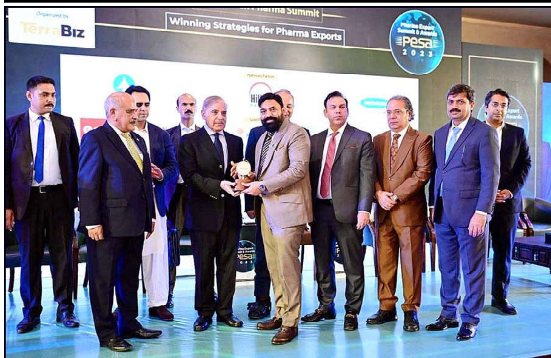
ISLAMABAD: Prime Minister Muhammad Shehbaz Sharif distributes awards among the highest exporters of Pharmaceutical Industry in Pakistan.