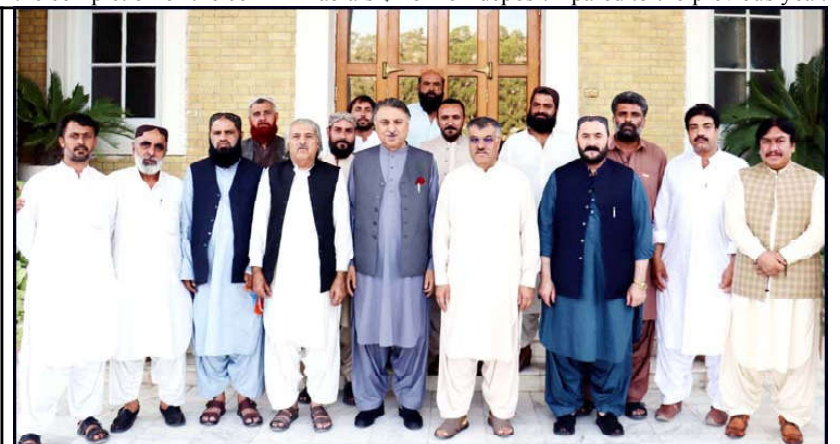
QUETTA: Governor Balochistan Malik Abdul Wali Khan Kakar in a group photo with transports and traders