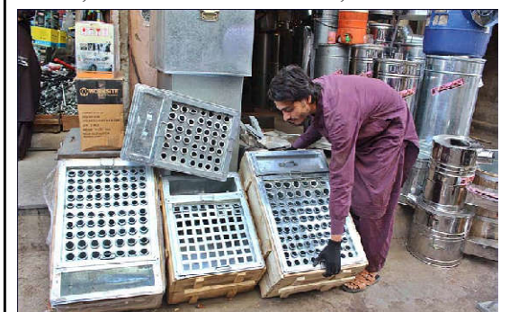
QUETTA: Shopkeeper setting up frames of Kulfi to attract customers at Mission Road.