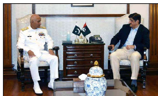
KARACHI: Sindh Chief Minister Syed Murad Ali Shah exchanges views with Chief of the Naval Staff Pakistan Admiral Muhammad Amjad Khan Niazi at CM House.

She commended Radio Pakistan for establishing state of the art Technology platform to create awareness among people about latest and modern tools and gadgets to make a difference in the society. She said Radio Pakistan has now become a visual medium as well for which a Drama Studio Reels has been launched to provide quality entertainment to the viewers. She said it will encourage and facilitate young artists to demonstrate their skills through creativity.