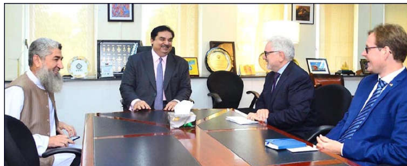
ISLAMABAD: Federal Minister for Energy Engr. Khurram Dastgir Khan held a meeting with the Ambassador of the Federal Republic of Germany Arnold Grannas today to discuss Green Financing, General Discussion of mutual interest in Renewable Energy Investment and overall power arrangements.

The panelists discussed that the heritage sites were very important for religious practices but also for building religious and national identity. They highlighted that the true spirits of Gandhara were reflected in the stone sculpture of fasting Siddharta, the academic excellence of Taxila, and the mindful, pragmatic, imaginative, creative, and bold nature of Gandhara. It was proposed to support the bringing of new digital technology and chemicals for preservation purposes. It was also underlined that Gandhara was not only a communication but an all-out campaign for modernization.