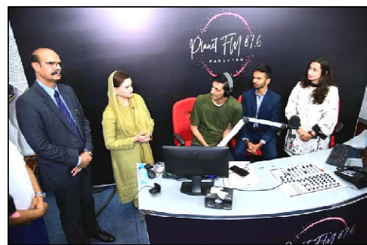
Ms. Marriyum Aurangzeb, Federal Minister for Information and Broadcasting inaugurating a podcast studio titled "Planet FM 87.6" at Radio Pakistan, Islamabad.

He paid tribute to the martyred soldiers and said that their sacrifice for the homeland would be remembered forever.