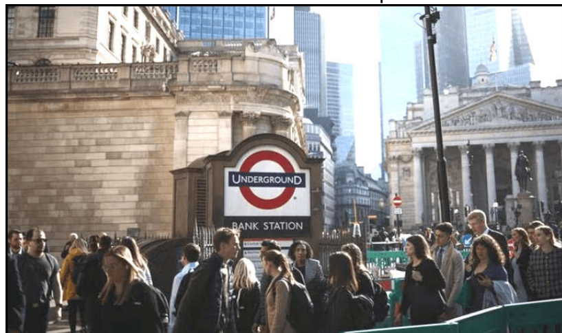
People walk outside the Bank of England in the City of London financial district in London, Britain.

formed about the probes. "None of the investigations has been concluded and at this point, it is still not possible to say when they will be concluded. The nature of the acts of sabotage is unprecedented and the investigations are complex," the three wrote in a joint letter, dated Monday, which included an update on each inquiry. The joint letter said Germany has been investigating "the suspicious charter of a sailing yacht" that had been rented in a way to "hide the identity of the real charterer." Germany was still investigating the precise course of the boat. "It is suspected that the boat in question may have been used to transport the explosives that exploded at the Nord Stream 1 and Nord Stream 2 pipelines."