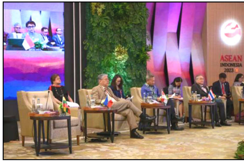
Philippine's Foreign Secretary Enrique Manalo, Singapore's Foreign Minister Vivian Balakrishnan and Thailand's Foreign Minister Don Pramudwinai attend the Association of Southeast Asian Nations (ASEAN) Foreign Ministers' Interface With ASEAN Intergovernmental Commission on Human Rights Representatives as the seat reserved for Myanmar is left unoccupied at the ASEAN Foreign Ministers' Meeting in Jakarta, Indonesia.