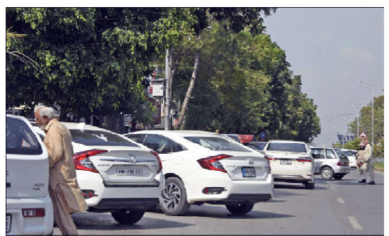
ISLAMABAD: A view of the overparked car at Aabpara area, which needs the attention of concern authority.

The 35th meeting of the committee was held here at the CDA Secretariat to receive briefing on comprehensive report on implementation status of the previous recommendations of the Committee, complete details of Housing Societies in Islamabad (legal and illegal) causing severe damage to the environment and sewerage system in Islamabad Capital Territory (ICT), briefing on all restaurants located on Margalla Hills causing severe damage to the environment with poor sewerage system, and especially the complete case study of Monal Restaurant