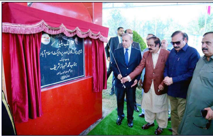
ISLAMABAD: Prime Minister Muhammad Shehbaz Sharif unveils the plaque of ground breaking of Shaheen Chowk Flyover.

Candidate can challenge the appointment of polling staff within ten days.