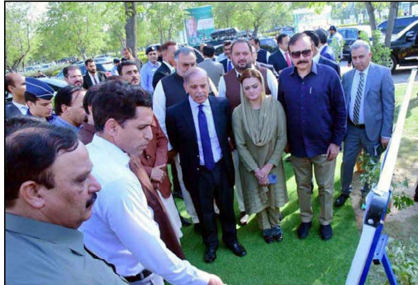
ISLAMABAD: Prime Minister Muhammad Shehbaz Sharif being briefed about Monsoon Tree Plantation Drive 2023.

It was proposed to support the bringing of new digital technology and chemicals for preservation purposes. It was also underlined that Gandhara was not only a communication but also an all-out campaign for modernization for an international audience.