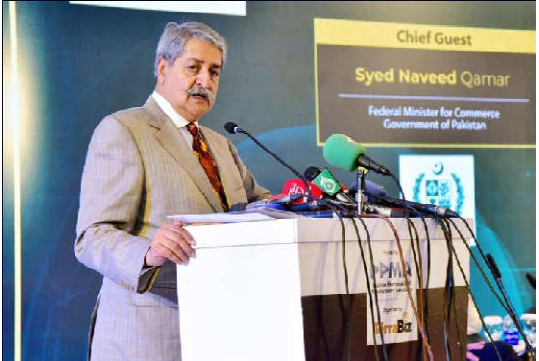
help economic development of the country. Speaking at the 6th Pakistan Pharma Summit and Awards (PESA) 2023, the minister outlined the government's plans to significantly increase Pakistan's pharmaceutical exports. The event was organized by the Pakistan