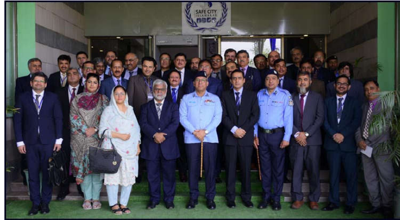
ISLAMABAD: A delegation of Karachi Institute of Management, consisting of 33rd senior Management course participants visited Safe City Islamabad to gain insights into the operations and significance of the state-of-the-art surveillance system.