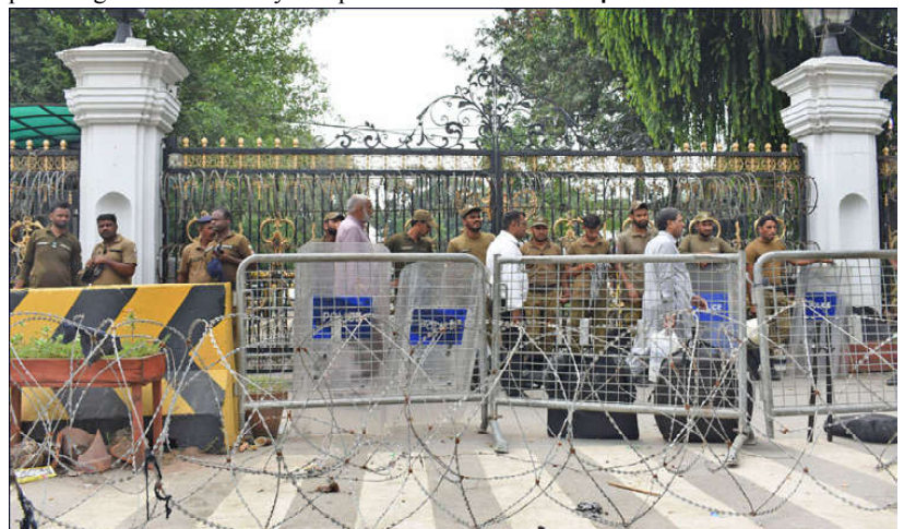
LAHORE: Police personnel stand guard during the protest of Government Employees of Punjab outside Civil Secretariat in Provincial Capital.

It will give an opportunity to the students of various colleges and universities to test their artistic and creative skills.