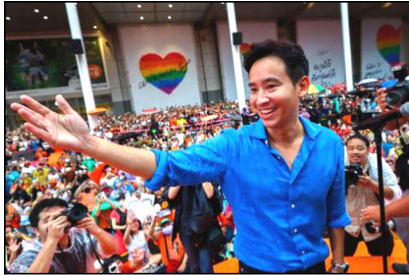
Move Forward Party leader Pita Limjaroenrat greets supporters during a rally to thank voters ahead of the vote for a new prime minister, in Bangkok, Thailand.

when it resumed testing ICBMs amid stalled talks on denuclearization. North Korea is also thought to be preparing for its seventh nuclear test, which would be its first since 2017. The launch Wednesday was North Korea's first missile test since June 15 and the first time it has launched an ICBM since April. Both South Korea and Japan condemned it as a violation of United Nations Security Council resolutions, which bar North Korea from using ballistic missile technology. "These acts by North Korea threaten the peace and security not only of our country but also the region, as well as the international community, and it is absolutely unacceptable."