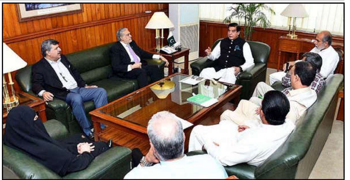
ISLAMABAD: Speaker National Assembly, Raja Pervez Ashraf in a meeting with Federal Minister for Finance and Revenue, Senator Mohammad Ishaq Dar at Parliament House.

The E-commerce platforms and online marketplaces enable businesses to reach customers worldwide, expanding their customer base and opportunities for growth, explained the minister, while highlighting E-Pakistan, an important E of the 5Es framework which was launched recently by the Planning Ministry. Furthermore, he highlighted that digital connectivity has provided businesses with the ability to access larger markets beyond their immediate geographical boundaries.