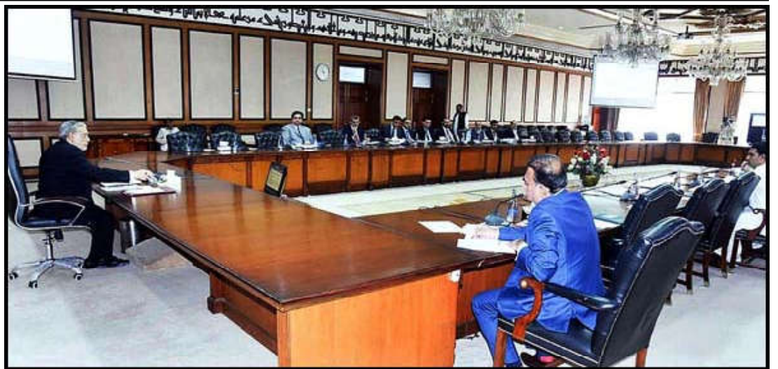
ISLAMABAD: Federal Minister for Finance and Revenue, Senator Mohammad Ishaq Dar chaired a meeting of Cabinet Committee on Privatization (CCoP).

College. This diverse gathering promises to facilitate meaningful exchanges and foster valuable connections among the participants, enriching the scientific community in Pakistan. The scientific activities of the International Nathiagali Summer College (INSC) are designed to encompass a wide range of topics at the forefront of knowledge in Physics and related disciplines. Each year, the College focuses on three to five