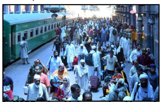
LAHORE: A view of the large number of the people at Railway Station as the population of the country is increasing day by day along with problems, for which 11 every year world observed World Population Day to raise awareness of global population issues.

The illegal structures of land grabbers were demolished with the help of heavy machinery while further action against land grabbers was under progress, he added.