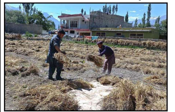
GILGIT: Farmers busy in collecting wheat for thrashing and making bundles.