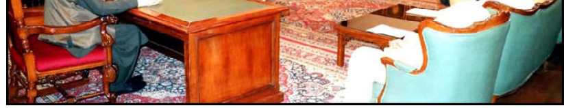
QUETTA: Different delegations meeting with Governor Balochistan Malik Abdul Wali Khan Kakar

The Governor on the occasion also called for taking revolutionary measures to bring the University of Loralai at par other good universities of the country.