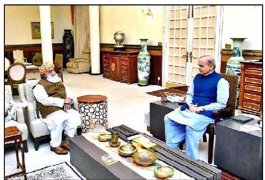
ISLAMABAD: President JUI-F Maulana Fazlur Rehman call on Prime Minister Muhammad Shehbaz Sharif.

He praised JUI-F for standing with the government in taking the difficult decisions.