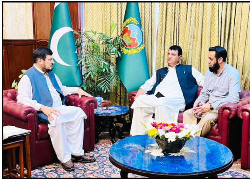
PESHAWAR: Advisor to PM Engineer Ameer Muqam and Special Assistant to PM Attaullah Tarar meeting with Khyber Pakhtunkhwa Governor Haji Ghulam Ali.

The meeting included a comprehensive evaluation of Sahiwal city development project, as well as initiatives related to water recharge and waste management. The meeting emphasized the importance of completing the Sahiwal-Pakpattan Road by September, setting a clear deadline for its timely execution. The project concerning the lining of small channels in Okara was also reviewed during the meeting, reflecting the government's commitment to effective water resource management.