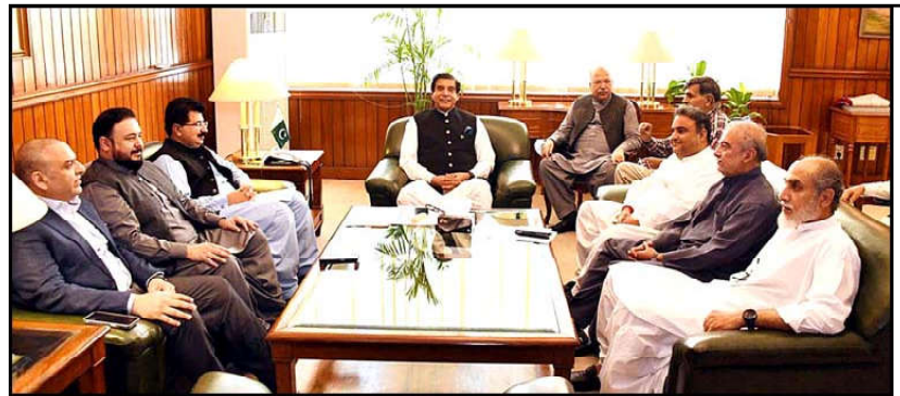
ISLAMABAD: Chairman Senate, Muhammad Sadiq Sanjrani in a meeting with Speaker National Assembly Raja Pervaiz Ashraf along with political leadership from Balochistan at Parliament House.