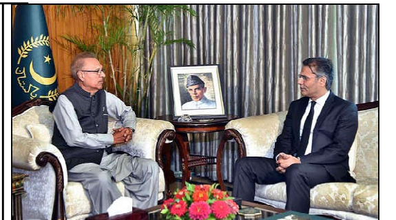
ISLAMABAD: Attorney General for Pakistan, Mansoor Usman Awan called on President Dr. Arif Alvi at Awan-e-Sadr.

firm support to the GDI, the prime minister said that Pakistan would continue its multifaceted cooperation with China for swift implementation of the GDI projects in Pakistan. The event was attended by Wang Yi, member of the Politburo of the Communist Party of China and Director of the General Office of CPC Foreign Affairs Commission, State Councilor and Foreign Minister Qin Gang and Chairman CIDCA, Luo Zhaohui. Leading experts and executives from several countries and international organizations also participated in the forum.