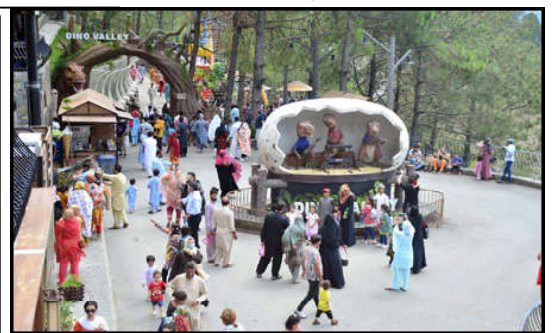
ISLAMABAD: Families are enjoying at Dino Valley Park on the top of the Margala Hills as due to the summers vacation in schools, children have a lot of time to enjoy well.

The IHC's bench would likely to hear the bail cases of former prime minister on Tuesday. The petitioner had prayed the court to grant protective bails so that he could approach the concern courts for the relief.