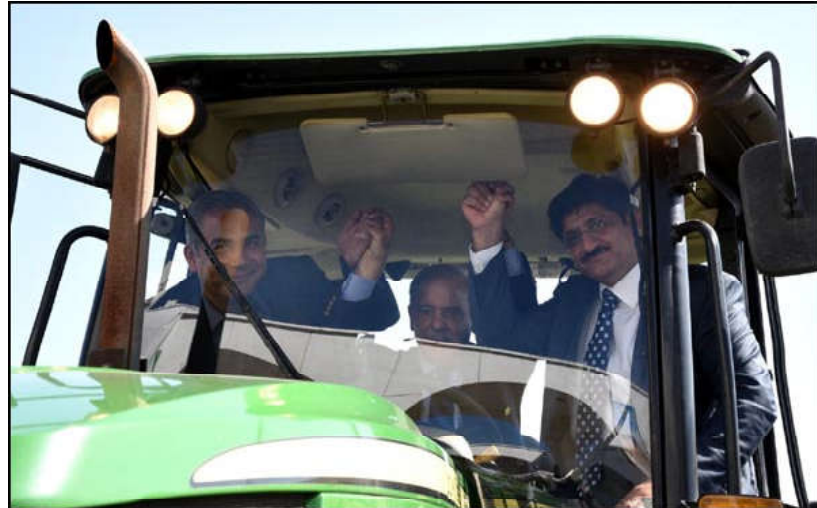
Prime Minister Muhammad Shehbaz Sharif along with Chief Minister Sindh Syed Murad Ali Shah and caretaker Chief Minister Punjab Syed Mohsin Naqvi examines a tractor during their visit of stalls in Green Pakistan Initiative inaugural ceremony, Islamabad.