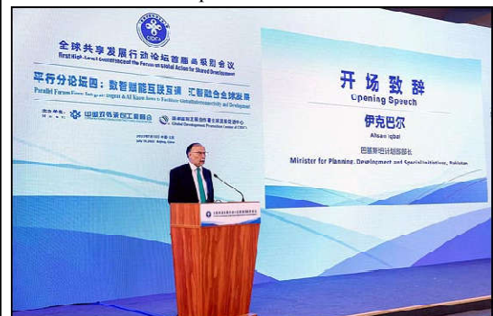
BEIJING: Federal Minister for planning and Development Prof. Ahsan Iqbal addressing the Global panel for Industrialization and Digital-Era of Connectivity.

QUETTA (APP): Building of Shaheed Skindar University Khuzdar was completed with huge amount of Rs. 2.84 billion in three years by efforts of former Chief Minister Balochistan Nawab Sanaulah Zehri. According to press release, Vice Chancellor would be appointed soon for the University and processes of higher education to be launched for interest of students of Khuzdar and the completion of university building would be brought in changing of education in Jhalwan area of Khuzdar. However, Ex. CM Balochistan, Chief of Jhalwan Nawab Sanaulah Khan Zehri had laid foundation stone of the University in tenure of regime. The press release further said that the building of the varsity was made earthquake proof which would be resolved the remote areas of Khuzdar while they had moved to other areas of country including Karachi and other areas in past for getting education.