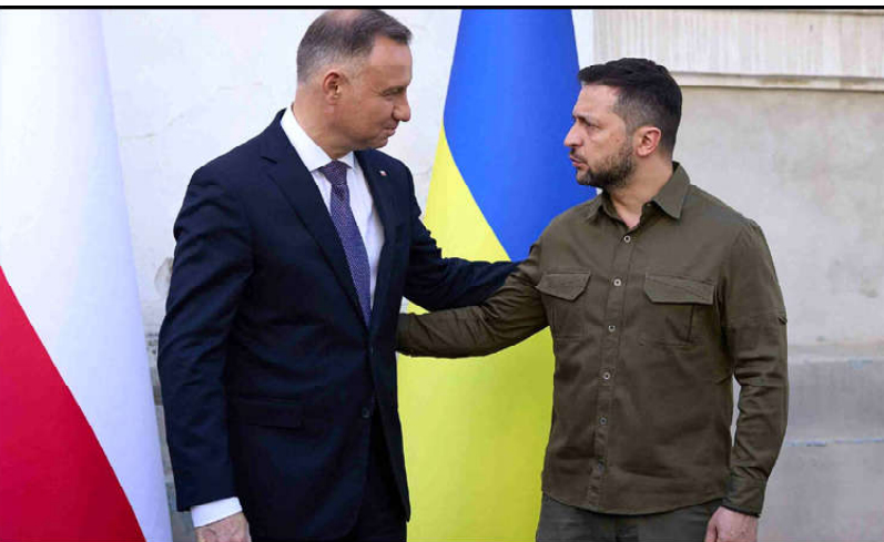
Ukraine's President Volodymyr Zelenskyy speaks with Poland's President Andrzej Duda during their meeting in Lutsk.

by Prigozhin, in which Wagner fighters took control of the southern city of Rostov-on-Don and a military headquarters building, was defused in a deal brokered by Belarusian leader Alexander Lukashenko. Putin, who likened the events to the turmoil which engulfed Russia in the run-up to the 1917 Russian Revolution, has since thanked his army and security services for averting chaos and civil war. Prigozhin has said the mutiny was not aimed at overthrowing the government but at "bringing to justice" the army and defence chiefs for what he called their blunders and unprofessional actions in Ukraine. Putin has so far kept Defence Minister Sergei Shoigu and Chief of the General Staff Valery Gerasimov in place, judging by appearances by both men on state TV - rejecting Prigozhin's appeals to sack them.