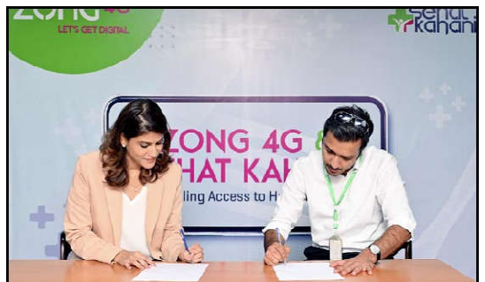
Zong 4G and Sehat Kahani Join Forces to Empower Pakistan through Digital Health.