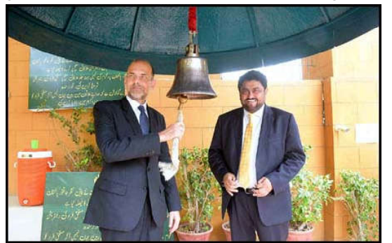
KARACHI: Ambassador of Switzerland to Pakistan Georg Steiner rang the 'bell of hope' at Governor House.

The benefit of increase in pension sanctioned will also be admissible to those Civil Pensioners of the Sindh government, who are residing abroad (other than those residing in India and Bangladesh), who retired on or after 15.08.1947 and are not entitled to or are not in receipt of pension increase under the British Government's Pension (increase) Acts. The payment will be made at the applicable rate of exchange.