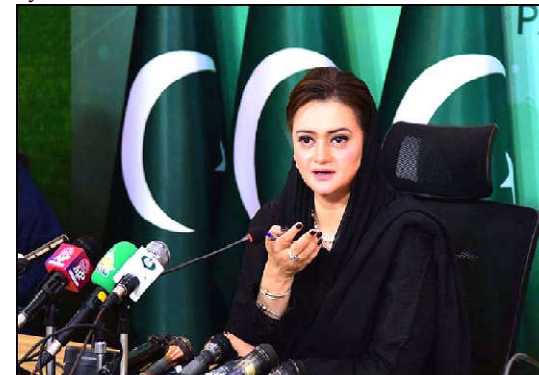
ISLAMABAD: Federal Minister for Information and Broadcasting, Ms. Marriyum Aurangzeb addressing a press conference.