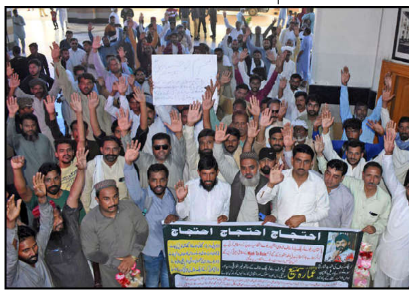
LAHORE: Employees of Traffic yard Association Pakistan are shouting slogans during protest in the favor of their demands at Railway Station in Provincial Capital.

LAHORE (APP): The Punjab Agriculture department has advised the cotton growers to take necessary timely measures to get rid of weeds as they put negative impact on the growth of the crop. A spokesman of the department said on Monday that farmers must carry out anti weed sprays as per the guidelines of the department. He said that cotton crop should be given water keeping in view the fertility of land, seed variety and condition of the crop. He said, "Juice sucking insects usually attack during moist weather so growers should stay alert and carry out pest scouting twice a week." PSX stays bullish, gains 377 points ISLAMABAD (INP): The 100-index of the Pakistan Stock Exchange (PSX) witnessed bullish trend on Monday, gaining 377.82 points, a positive change of 0.85 percent, closing at 44,585.13 points against 44,207.31 points the previous trading day. A total of 440,221,059 shares were traded during the day as compared to 247,993,312 shares the previous day, whereas the price of shares stood at Rs.12,086 billion against Rs.8,512 billion on the last trading day. As many as 342 companies transacted their shares in the stock market; 238 of them recorded gains and 82 sustained losses, whereas the share price of 22 companies remained unchanged.