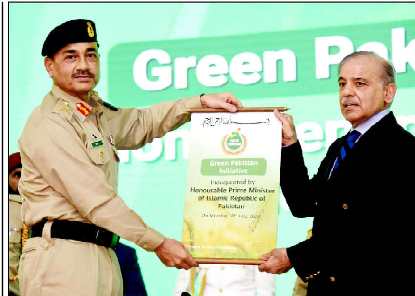
ISLAMABAD: Prime Minister Muhammad Shehbaz Sharif inaugurates Green Pakistan Initiative, COAS General Syed Asim Munir hands over the inaugural scroll to the Prime Minister.