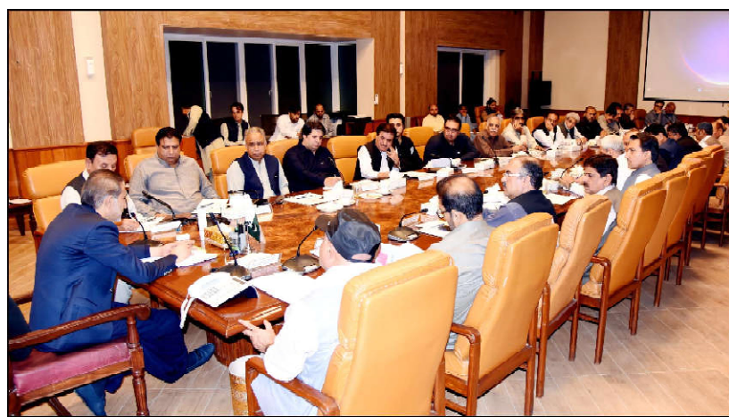
QUETTA: Chief Minister Balochistan Mir Abdul Qaddus Bizenjo addressing meeting of Secretaries of provincial departments