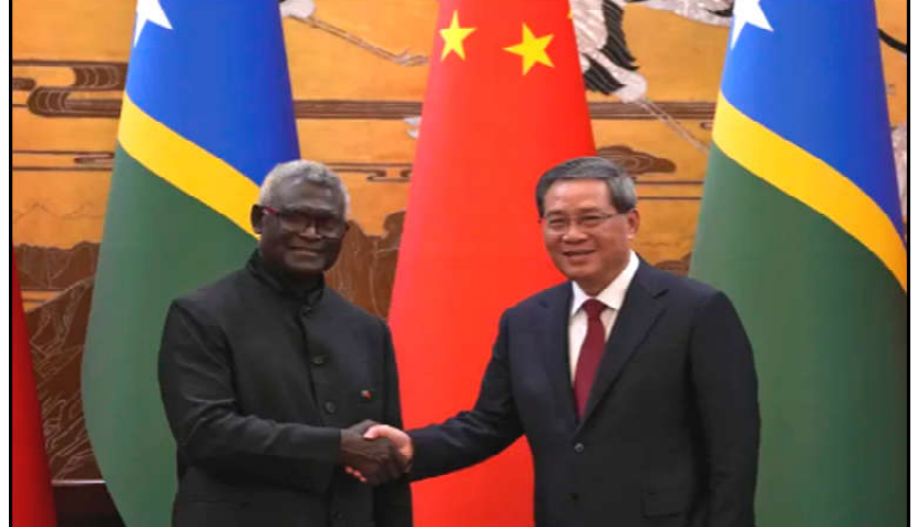
Visiting Solomon Islands Prime Minister Manasseh Sogavare, left, shakes hands with his Chinese counterpart Li Qiang after they witnessed signing on agreement for both countries at the Great Hall of the People in Beijing.