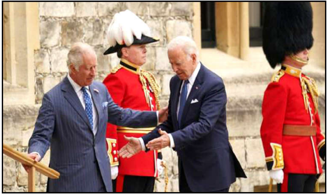
Joe Biden was welcomed by King Charles to Windsor Castle for his first meeting with the monarch since he was officially crowned.

Windsor Castle on July 10, 2023 in Windsor, England. Chris Jackson/Pool via REUTERS Russia, Ukraine and the United States have not signed the Convention on Cluster Munitions, which bans their production, stockpiling, use and transfer. "We stand by our obligations under the convention, which include discouraging their use. There is no change from us on that, obviously it is for each country to make a decision," Sunak's spokesperson said. After the meeting, Biden, 80, headed to Windsor Castle to meet the king, where he was greeted with traditional pomp and ceremony in the castle quadrangle.