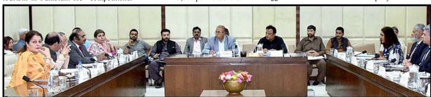
ISLAMABAD: Senator Mohsin Aziz, Chairman Senate Standing Committee on interior presiding over a meeting of the committee at Parliament House.

Furthermore, during the raid conducted by the Islamabad Wildlife Management Board's team, two individuals were apprehended on the spot for their involvement in the illegal trade of protected bird species. A first information report (FIR) has been lodged against the accused, initiating legal proceedings to hold them accountable for their actions. The FIR stated that the two individuals had misbehaved with the raid team and made objectionable remarks.