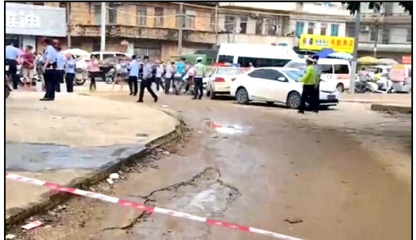
A police cordon is placed in the aftermath of a stabbing attack at a kindergarten in Lianjiang county, Guangdong province, China.