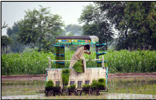
FAISALABAD: Farmer using modern agriculture machine for seedling of rice crop in his field.