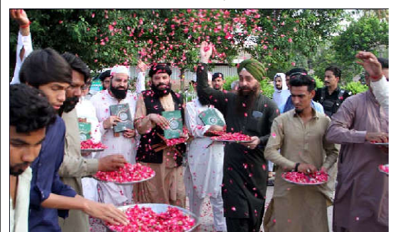
PESHAWAR: Members of Minority Community are expressing solidarity with Muslims as they are holding protest demonstration against desecration of Holy Quran in Sweden, at Gor Kathri Park in Peshawar.