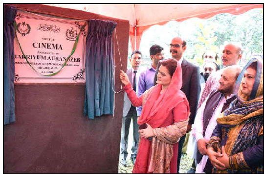
LAHORE: Federal Minister for Information and Broadcasting, Ms. Marriyum Aurangzeb Inaugurating the foundation stone for the construction of cinema building of projects at Radio Pakistan Station building.