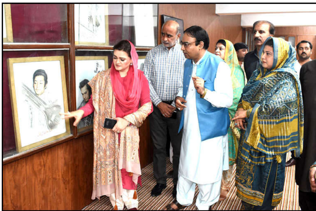
LAHORE: Federal minister of Information and Broadcasting Maryam Aurangzeb taking keen interest in the portraits of Pakistan favorites classical Singers during her visits of Radio Pakistan in Provincial Capital.

ISLAMABAD (Online): Finance Minister Ishaq Dar has said economic situation of the country is improving due to prudent policies of the coalition government. He was virtually talking to a representative delegation of Chambers of Commerce and Industries and business organizations of 25 districts of Punjab in Lahore on Sunday. He said bringing traders and industrialists together at one platform is commendable. Speaking on the occasion, Caretaker Chief Minister Mohsin Naqvi said one window facility will be provided for issuance of NOCs for setting up new industries and starting new business.