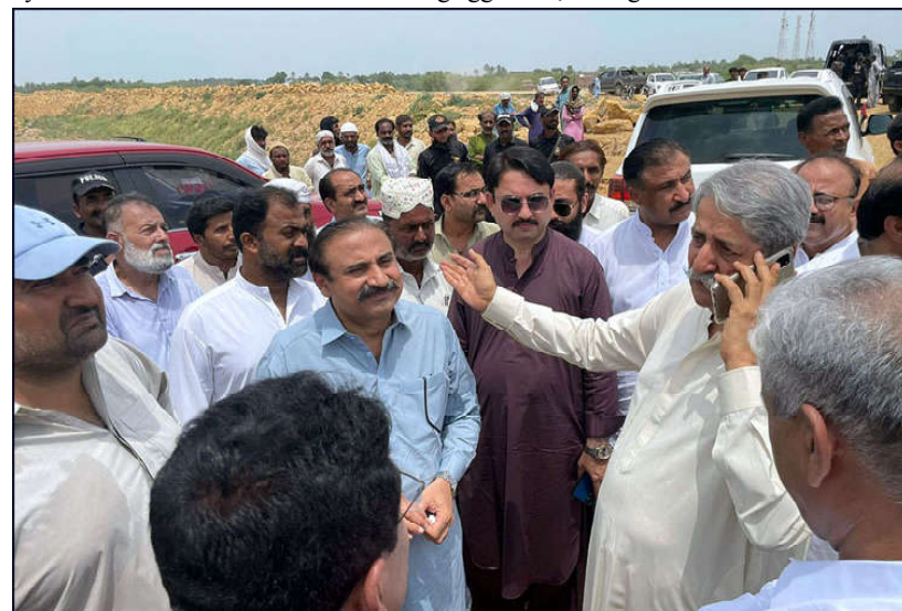
TANDO MUHAMMAD KHAN: Syed Naved Qamar, Federal Minister for Commerce Visited H/P Bund and issued directive regarding repair and maintenance of H/P Mulaktiyar Bund Bulri Shah Karim.

Monitoring Desk ISLAMABAD: NDMA says 31 children, 30 men, 15 women among those who have died due to rains in last fortnight. Nine more people have died, and eight others were injured due to the monsoon rains in the last 24 hours, as per the National Disaster Management Authority (NDMA). Since June 25, the number of deaths from monsoon rains across the country has reached 76. According to the NDMA, 31 children, 30 men and 15 women are among those who have died due to rains in the last fortnight. The highest number of deaths, 48, has been reported in Punjab. Rains have also claimed 20 lives in Khyber Pakhtunkhwa, five in Balochistan and three in Azad Jammu and Kashmir. Moreover, among the more than 130 people injured in rain-related incidents are 49 men, 38 women and 48 children, the authority says in a report. So far, 78 houses have been damaged by the rains across the country, while there is a fear of urban flooding in different cities of the country due to torrential rains.