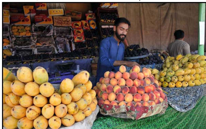
ISLAMABAD: A vendor selling fruits on his stall at weekly Sunday bazaar Peshawar Morri in Federal Capital.

PESHAWAR (APP): The storm of inflation continued in the provincial capital as the price of ginger touched the Rs 1000 mark while the district administration claimed to control the rates according to the official price list of various food items. A visit to the vegetables and fruits markets revealed that the storm of inflation in the markets continued with ginger touching all-time high marks of Rs 1050 per kilogram, garlic at 300 and lemon at 140 per kg remained unchanged. Onion 50, tomato 80, green pepper 80, peas 250, okra 90 and turnip 80 rupees sold per kg while Potato 110, Kachalo 130, Cauliflower 120, Eggplant 30, Zucchini and Tenda 100 rupees per sale. Among fruits, apples reached Rs 400, mango Rs 250, peach Rs 220 per kg, Cherries 430, potatoes 260 and bananas 200 per dozen were sold.