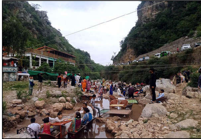
ISLAMABAD: A large number of people enjoying picnic at Shahdara valley near outskirts of the Federal Capital.

students and Rs 3500 for female students at higher secondary school level was being offered. He said that Rs 500 extra is fixed for female students at each level to encourage them to get an education. The cash could be withdrawn from Habib Bank's designated retail centers. Deserving women were asked to receive their full amount and never forget to get the receipt. The beneficiaries could report to BISP toll-free helpline 080026477 or DG office helpline number 04235415143 in case of any complaint pertaining to deduction of amount, payment hurdle, or others, he concluded.