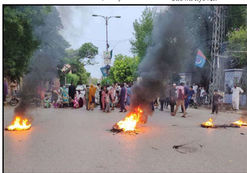
HYDERABAD: Residents of Radio Pakistan area are blocked road and burn tires as they are holding protest demonstration against prolong electricity load shedding in their area, in Hyderabad

In terms of geo-economic growth and regional connectivity, China-Pakistan Economic Corridor (CPEC) is also a blessing for Pakistan's extensive industrial revivalisation, as well as for other regional countries in South Asia, he remarked.