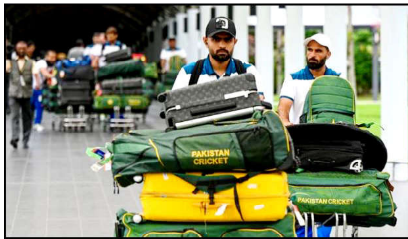
COLOMBO: Pakistan cricket team arrived in Sri Lanka to play two match Test series

Xinjiang Uygur Autonomous Region, which encompasses energy, transport and industrial cooperation. The 12th Special CPEC JCC meeting holds great significance as it not only represents a decade of fruitful collaboration but also sets the stage for the next phase of the project. The meeting aims to forge stronger ties, explore new opportunities and reinforce the foundation of the China-Pakistan Economic Corridor (CPEC), the flagship project of the Belt and Road Initiative (BRI).