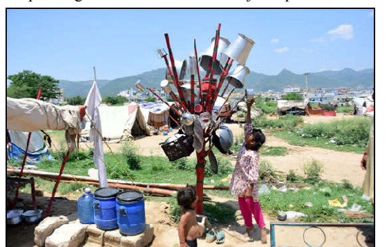
ISLAMABAD: A view of the handmade pots stand from bamboo sticks as made by nomad people to protect their kitchen holds, at their shanties in Golra area of Federal Capital.

erly Wave still persists over Northern parts of Pakistan whereas Seasonal Low lies over North western Balochistan. Upper air cyclonic circulation (the main source of streams of air at higher altitude) yesterday over Northwestern Madhya Pradesh (India) lies over Western Rajasthan (India). At the reporting time, strong monsoon currents from the Bay of Bengal has weakened slightly and thus moderate monsoon currents from both sources (Bay of Bengal & Arabian Sea) are now penetrating into the upper parts of Pakistan upto 7,000 feet. Widespread wind thunderstorms/rain with heavy falls at isolated places and very heavy falls at one or two places over the upper catchments of rivers Ravi & Sutlej is expected.