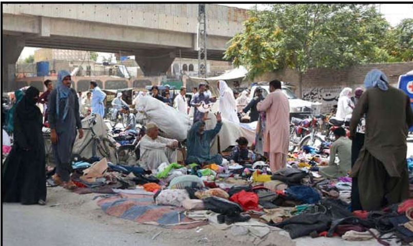
QUETTA: People are busy purchasing from the weekly Sunday Bazar at Joint Road.

is a deadlock between the EU Council and the EU Parliament on the issue of migration. The EU Parliament strongly believes that trade should not be linked with the migration issue but the EU Council thinks otherwise, he added. The business leader informed that the EU Council includes ministers from each EU country, they meet to discuss, amend and adopt laws, and coordinate policies. The ministers have the authority to commit their governments to the agreed actions. It has been proposed that the current scheme should be extended for four years. The proposal will now be put to vote in the EU Parliament.