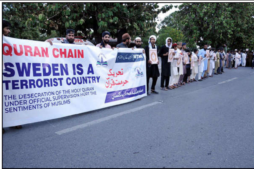
ISLAMABAD: People from different walks of life making Quran Chain organize by the Muslim Talba Mahaz Pakistan at Appara against the desecration of Holy Quran in Sweden.