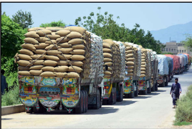
ISLAMABAD: A view of the trucks parked outside Floor mills at Sector I-II as waiting for laborers to unload them, in Federal Capital.