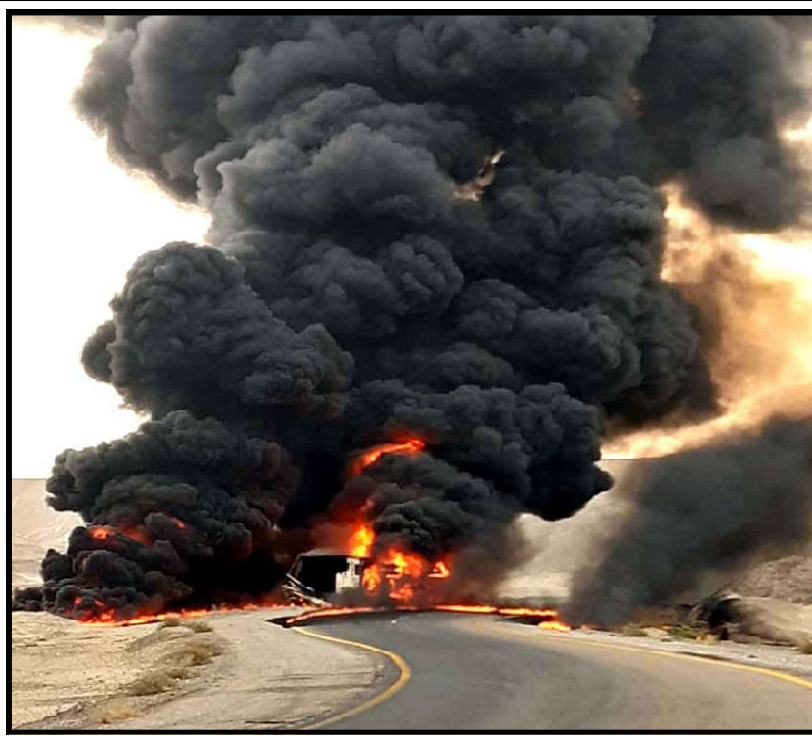
GWADAR: View of huge fire flames rise from burning truck after traffic accident due to over speeding, at Makran Coastal Highway in Gwadar.

Beraj administration said Marala Barrage Sialkot have the capacity of 11 thousand cubic water.