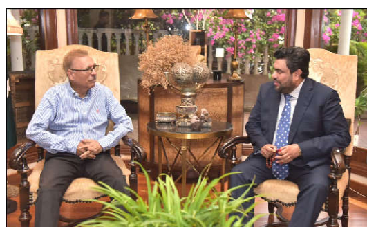
KARACHI (APP): Sindh Governor Kamran Khan Tessori called on the President Dr. Arif Alvi at his residence here on Sunday.

According to a Governor House communique, the Governor felicitated the President on performing Hajj.