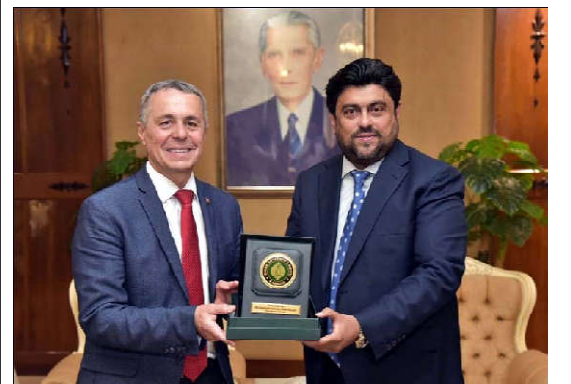
KARACHI: Governor Sindh, Kamran Iessori presenting shield to Ignazio Cassis, Swiss Foreign Minister during meeting held at Swiss House in Karachi.

Independent Report QUETTA: The Government of Balochistan is all set to introduce the long-awaited and much-needed Green Bus Service in Quetta. The trial operation of the Green Bus Service would kick off on July 13, and the full-scale operation would be inaugurated on July 17. This was announced by the Chief Minister, Mir Abdulquddus Bizenjo in a tweet on his social media account, Twitter on Sunday. He said that after dedicated efforts, we are delighted to bring the long-awaited and much-needed quality public transport system to Quetta. The inauguration ceremony would be graced by a member of the general public who actively utilizes public transportation. In his tweet, the Chief Minister described the launch of Green Bus Service as a great news for the citizens of Quetta especially students. Moreover, he said that the elderly women, children and students would benefit from the facility. He mentioned that the Green Bus Service project was delayed for long time. However, by the grace of Allah, it is going to be functional, he added.