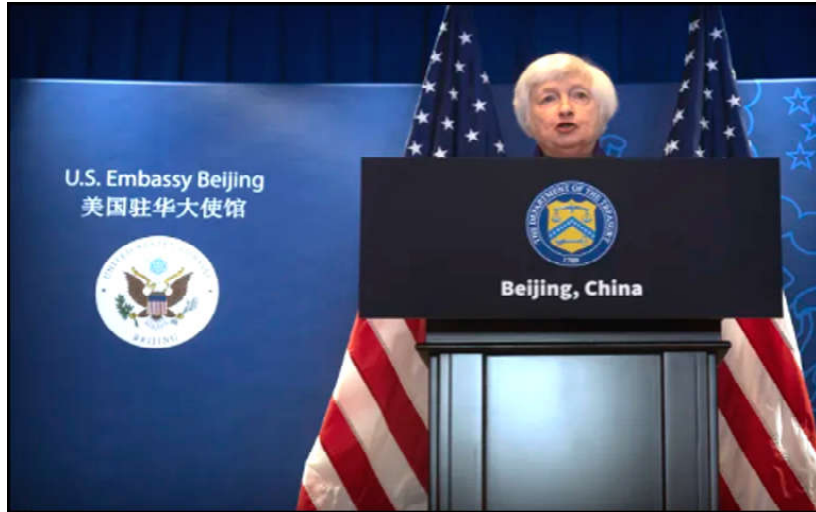
Treasury Secretary Janet Yellen speaks during a press conference at the U.S. Embassy in Beijing, China.