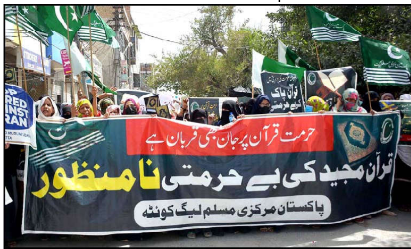
QUETTA: Activists of the Pakistan Muslim League Women's Wing hold a protest against the desecration of the Quran in Sweden in front of the press club.