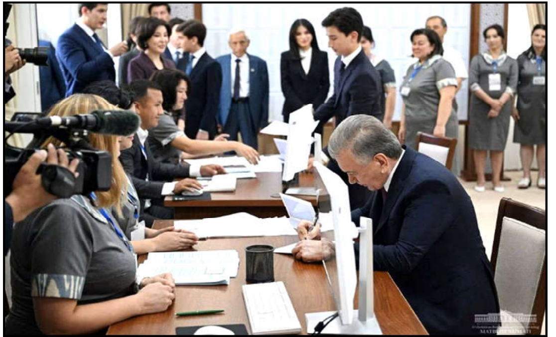
Uzbekistan's President Shavkat Mirziyoyev votes during an early presidential election in Tashkent, Uzbekistan.