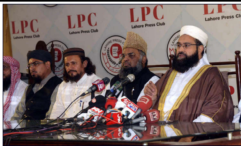
LAHORE: Special Assistant to the Prime Minister on Religious Harmony Maulana Tahir Ashrafi addressing a seminar on Hazrat Usman Ghani (R.A) at Press Club