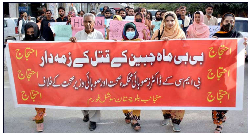
QUETTA: Activists of Balochistan National Social Forum hold a protest rally in favour of their demands.