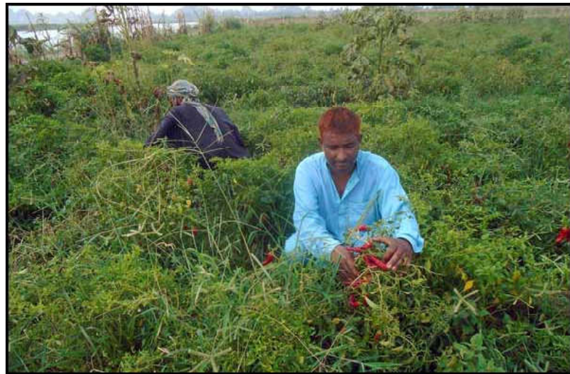
CHINIOT: Farmers busy in plucking of vegetables on their field at river Chenab bank.

the national development of Pakistan and connectivity in the region. China and Pakistan have also explored new areas for cooperation under the framework of CPEC, creating new highlights in cooperation on agriculture, science and technology, telecommunication and people's well-being. "China stands ready to work with Pakistan to build on the past achievements and follow the guidance of the important common understandings between the leaders of the two countries on promoting high-quality development of CPEC to boost the development of China and Pakistan and the region and bring more benefits to the people of all countries," the official said.