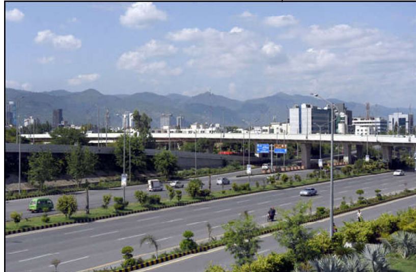
ISLAMABAD: A view of clouds on the sky during pleasant weather in the Federal Capital.