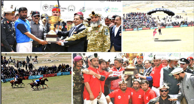
Along with this, administration officials, including high civil and military officials, a large number of local people and other guests had attended the event. On this occasion, local artists also performed Waziristan dance and sang national songs.

CHITRAL (INP): A three-day enthralling colourful celebrations of traditional Shandur polo festival concluded successfully in Chitral valley where thousands of tourists from all across Pakistan including International tourists had participated in the event and enjoyed polo matches. The provincial government in collaboration with Pakistan Tourism Development Corporation (PTDC) has made all-out efforts to promote sports and tourism while the polo game found special attention for the tourists, PTV News channel reported. The world's highest polo field, Shandur, Upper Chitral, is the site of the annual polo festival, which features teams from Gilgit Baltistan and Chitral. A foreign tourist admired that the unique location of the polo ground makes it a popular destination for adventure seekers and polo enthusiasts. The final match of the festival was played between Chitral and Gilgit Baltistan teams, said a local visitor. The festival also concluded with special traditional, cultural, and adventurous activities including music and dance in the evening at the world's highest polo ground at Shandur.