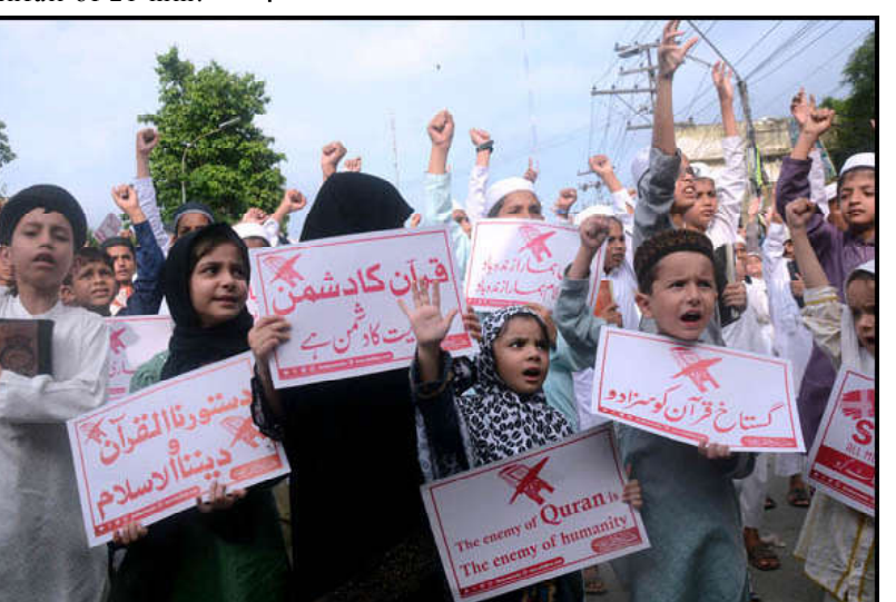
LAHORE: Children of civil society are protesting outside Lahore Press club against the desecration of Holy Quran in Sweden.

He said that the situation was being continuously monitored and the district administration Sialkot.