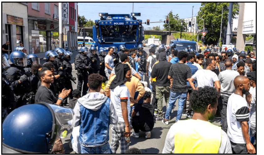
German police face participants of an Eritrean Festival in Giessen, while a police vehicle with water cannon can be seen in the background.