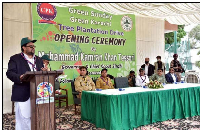
KARACHI: Governor Sindh, Kamran Tessori addresses during the Tree Plantation Drive opening ceremony held in Karachi.

Mohtarma Fatima Jinnah was born on July 31, 1893 in Karachi and passed away on this day in 1967. Fatima Jinnah is still remembered for her passionate support for civil rights and devoted struggle in Pakistan Movement.