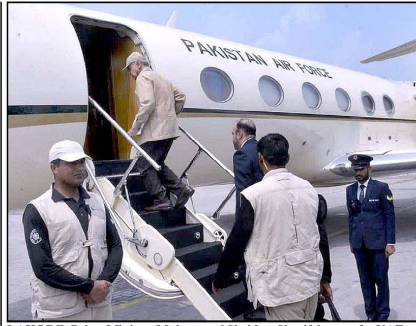
LAHORE: Prime Minister Muhammad Shehbaz Sharif departs for UAE on his one day visit to offer condolences on the demise of Sheikh Saeed Bin Zayed Al-Nahyan.