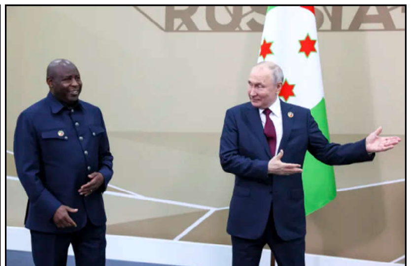
Russian President Vladimir Putin and President of the Republic of Burundi Evariste Ndayishimiye meet on the sidelines of the Russia Africa Summit in St. Petersburg, Russia.

operation" in Ukraine. The Russian president lamented "Western policies" for "undermining the supremacy of international law, the indivisibility of security and the establishment of a truly multipolar and just world," the state media reported. Mr Putin accused the West of disregarding "respect for the sovereignty and national interests of states." Vladimir Putin lauded North Korea's "unwavering support" for the "special military operation" in Ukraine as Russia joined China in Pyongyang to celebrate the hermit kingdom's 70th anniversary of the Korean War truce.