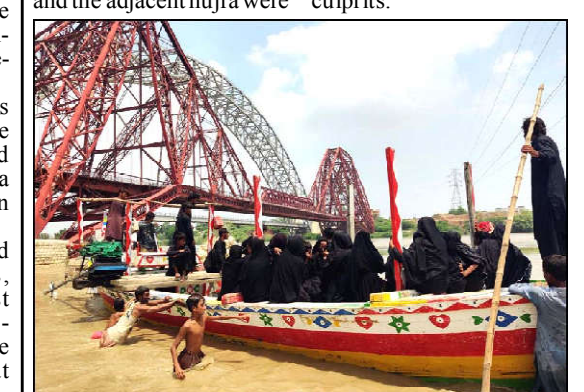
SUKKUR: Devotees of Imam Hussain (R.A) are using boats to participate in the religious mourning procession in memories of martyrdom of Hazrat Imam Hussain (R.A), grandson of Prophet Mohammad (PBUH), in connection of 9th Muharram-ul-Haram, at Rohri in Sukkur.