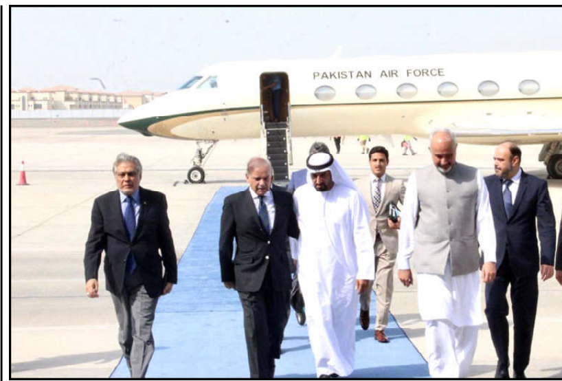
Prime Minister Muhammad Shehbaz Sharif arrives in Abu Dhabi, UAE on his one day official visit. Pakistan's Ambassador to UAE and Senior officials of UAE received the Prime Minister upon his arrival.