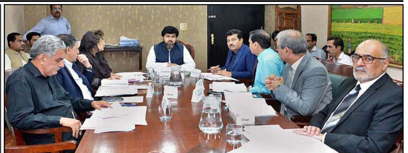
ISLAMABAD: Senator Zeeshan Khanzada, Chairman Senate Standing Committee on Commerce presiding over a meeting of the Committee at Parliament House.

"A secure environment is fundamental for a flourishing economy," he added. "Conversely, a secure environment fosters economic activity, encourages entrepreneurship, and attracts foreign direct investment, contributing to overall economic prosperity," he remarked.