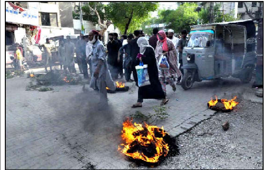
HYDERABAD: Residents of Saddar area are burning tires and blocking road as they are holding protest demonstration against non-installation of electricity transformer since 3 days, in Hyderabad.

LAHORE (Online): Pakistan is a country blessed with beautiful sights and many areas in our homeland will make you feel like you are in paradise. Rather be it the beautiful KPK, Gilgit Baltistan or Kashmir, we are blessed to have high mountains with snowy caps, beautiful green plains and glaciers that are not found anywhere else in the world. People from all over the world come to Pakistan.