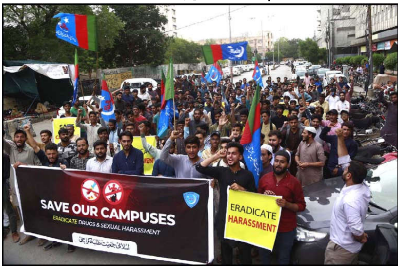
KARACHI: Members of Islami Jamiat Tulba are holding protest demonstration for eradicate drugs and sexual harassment from colleges and universities, at Karachi press club.

additional portable cameras. The Safe City Operation and Monitoring Center have assigned police communication officers and technical teams for 24/7 duty. As per SP Awais Shafiq, the central mourning processions will be provided three-tier security comprising Dolphin Squad, Police Response Unit, and effective patrolling of police vehicles. Continuous moment-to-moment monitoring will be carried out through Safe City cameras during central mourning processions and gatherings.