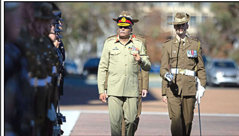
During the visit, the JCSC met high-ranking civilian and military leadership including General Angus J. Campbell, Chief of Defence Forces Australia. In the meetings, both militaries agreed to further expand military-to-military cooperation, an Inter-Services Public Relations (ISPR) news release said.

RAWALPINDI (APP): Chairman Joint Chiefs of Staff Committee (JCSC), General Sahir Shamsah Mirza, is on an official visit to Australia from July 24 for Defence and Security Talks and 1.5 Track Security Dialogue.