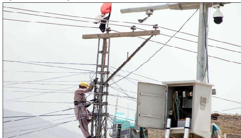
QUETTA: Technician is busy in maintenance works of CCTV camera in connection of Shiite religious mourning procession in memories of martyrdom of Hazrat Imam Hussain (RA), grandson of Prophet Mohammad (PBUH), on the route of Ashura Procession.

The other is the dry weather with low rainfall. These conditions are very suitable in Gilgit-Baltistan and many other places in Pakistan," he added.