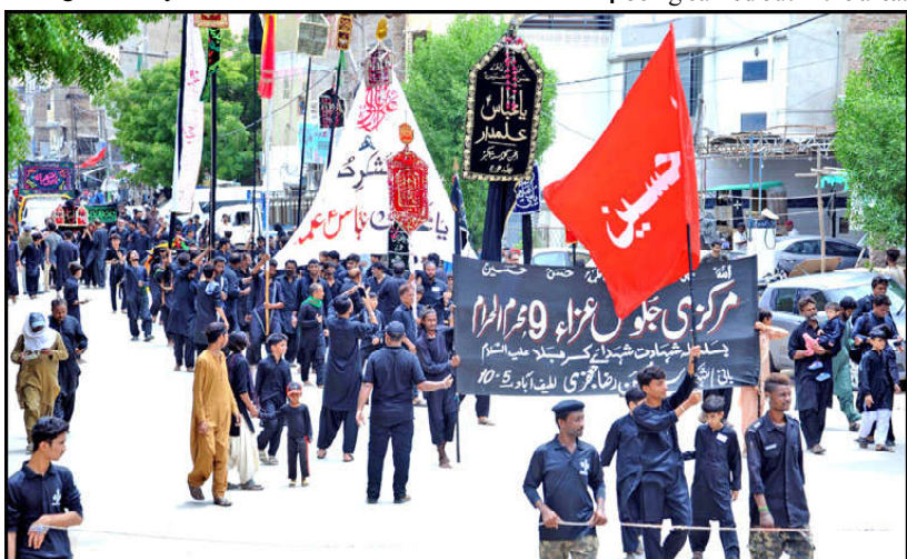
HYDERABAD: Shiite Muslims attending the mourning procession of 9th Muharram-ul-Haram at Latifabad area, in City.