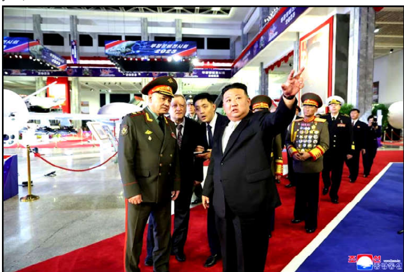
North Korean leader Kim Jong Un and Russia's Defense Minister Sergei Shoigu visit an exhibition of armed equipment on the occasion of the 70th anniversary of the Korean War armistice in this image released by North Korea's Korean Central News Agency.

high-standard completion of the Jakarta-Bandung high-speed railway as it nears commercial operation, Xi told Widodo. The high-speed rail, a flagship project of the Indonesian president and part of China's Belt and Road Initiative, was set back by budgetary problems and already four years behind schedule. "The two sides should make every effort to do a good job in the last kilometre of construction and ensure the high standard and high quality of the project."