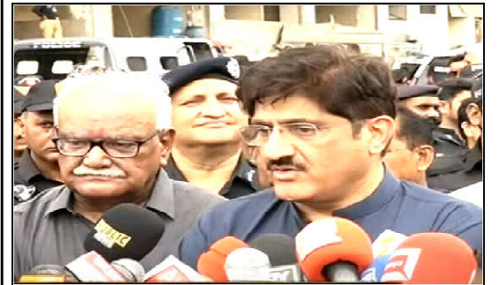
Accompanied by Sindh Labour and Human Resources Minister Saeed Ghani, Karachi Mayor Murtaza Wahab, chief secretary, and IG police, the Sindh CM reviewed the security arrangements in place for Muharram 9 procession.

Monitoring Desk KARACHI: Threat alerts during Ashura, but excellent security arrangements are in place, said Sindh Chief Minister Murad Ali Shah on Friday. Sindh Chief Minister Murad Ali Shah attended the prime procession in Karachi and reassured the public about the stringent and well-organized security measures in response to potential threat alerts during Ashura. During the visit, the chief minister issued necessary instructions to the administration concerning security. He inquired the Sindh IG about security passes, to which the IG clarified that passes were granted only to house owners, Sabeel distributors, Niaz distributors, and scouts. The Sindh IG informed the chief minister that a total of 4,698 police personnel have been de-