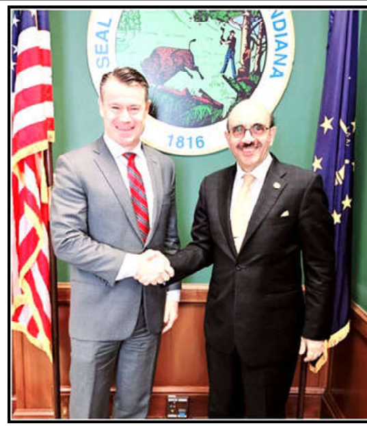
WASHINGTON: Pakistan's Ambassador to the United States, Masood Khan held separate meetings with three key US lawmakers to discuss Islamabad-Washington relations, economic partnership, defense ties, and security collaboration.

of the United Nations Human Rights Council stated that Israeli attacks against the Jenin refugee camp may constitute a war crime and had no justification under international law. The impunity that Israel has enjoyed for its acts of violence over decades only fuels and intensifies the recurring cycle of violence. The Special Rapporteurs also called for Israel to be held accountable under international law.