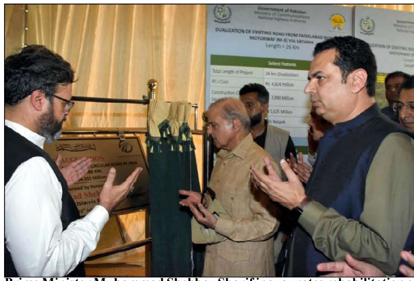
Prime Minister Muhammad Shehbaz Sharif inaugurates rehabilitation of Faisalabad Circular Road.