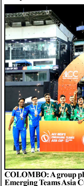
COLOMBO: A group photo of Pakistan Shaheens after winning ACC Men's Emerging Teams Asia Cup after beating India in the final.

On his Twitter handle, the prime minister said "I extend my deepest condolences to H.H. Sheikh Tamim bin Hamad Al Thani, the Emir of Qatar and the bereaved family. May Allah rest the departed soul in eternal peace!"