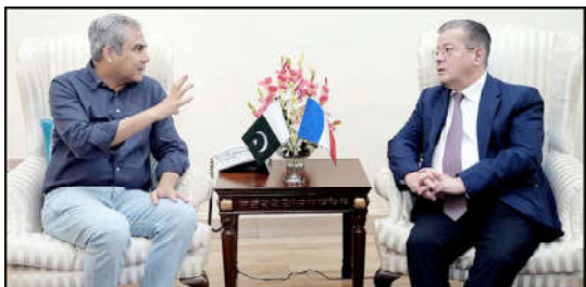
LAHORE: Ambassador of France Nicolas Galey meeting with Caretaker Chief Minister Punjab Mohsin Naqvi at CM Office.

basis stated that all preemptive measures should be given a final shape for the safety of village people present inside the bed of both rivers. The CM asserted that no negligence or lapse would be tolerated under any circumstance with regard to timely evacuation of the people. He directed that Commissioner Lahore and other divisional commissioners should ensure implementation of the formulated plan in case of an emergency. He directed that the administration should constitute mobile teams to provide edibles and medical facilities to affectees.