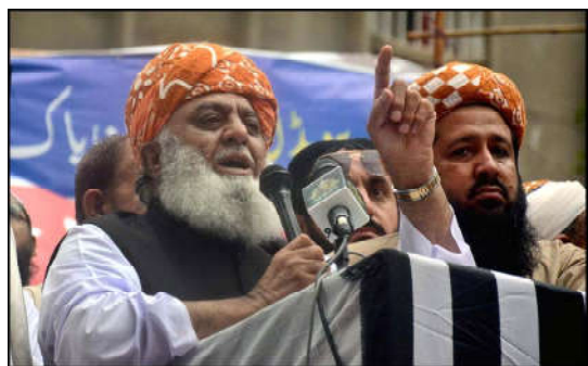
KARACHI: Jamiat Ulema-e-Islam (F) President Maulana Fazalur Rehman addresses a protest rally held in connection with desecration of holy Quran in Sweden outside Karachi Press Club.