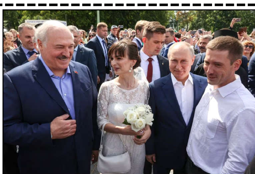
Russian President Vladimir Putin and Belarusian President Alexander Lukashenko meet people outside the Naval Cathedral of St. Nicholas in Kronstadt near Saint Petersburg, Russia.

over those responsible for prosecution in Islamic countries. "All Islamic scholars agree that those who desecrate the Koran deserved the most severe punishment... The duty of that (Swedish) government is to hand over the perpetrator to the judicial systems of Islamic countries," Khamenei said in a statement carried by state media. Iran, which has delayed the posting of a new ambassador to Sweden, also said it was not accepting a new Swedish envoy.