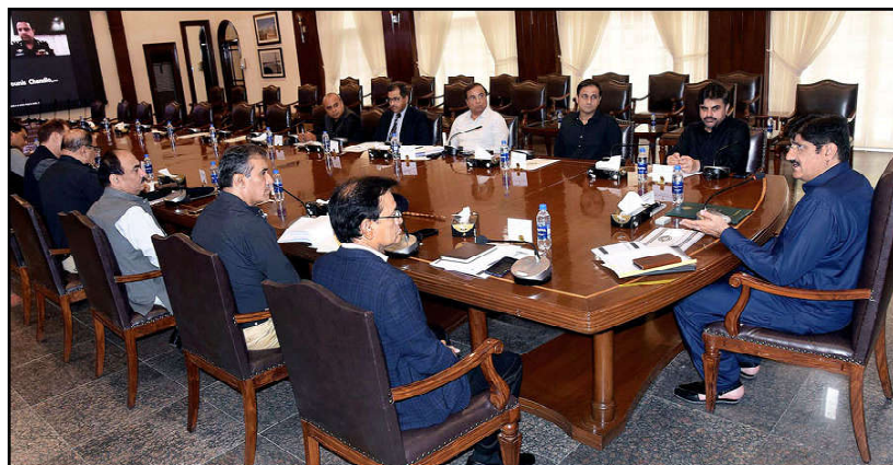
KARACHI: Sindh Chief Minister Syed Murad Ali Shah presides over the meeting to review law and order situation in the province.

He said last year we did trade and investment framework agreement (TIFA) meeting after eight years, and negotiated for climate, energy and health sector.