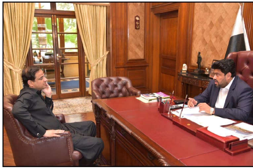
KARACHI: Mayor of Karachi Barrister Murtaza Wahab called on the Sindh Governor Mohammed Kamran Khan Tessori at Governor House