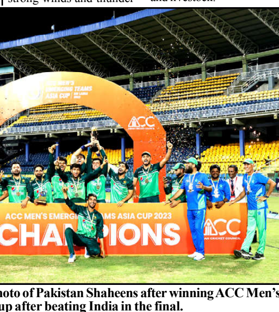
COLOMBO: A group photo of Pakistan Shaheens after winning ACC Men's Emerging Teams Asia Cup after beating India in the final.

MONITORING DESK PESHAWAR: At least nine people were killed in rain-related incidents in Khyber Pakhtunkhwa over the last 48 hours due to heavy rainfall while an emergency was declared in the province's Lower and Upper Chitral districts till August 15. Heavy rain with strong winds and thunder-