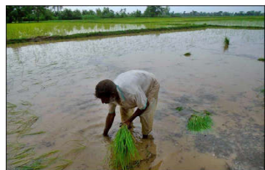
CHINIOT: A farmer busy in seedling rice crop in his field along Lahore Road.

FPI consists of securities and other financial assets held by investors in another country. Along with FDI, FPI is one of the common ways to invest in overseas economies. In June 2023, Pakistan also received $5.8 million from Hong Kong bringing the total FDI from Hong Kong to $96.6 million in FY 23.