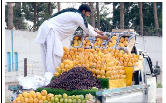
QUETTA: A vendor arranging seasonal fruits on his van to attract customers.

He added that Chashma Right Bank Canal (CRBC) Lift Low Gravity project has been approved with the federal and provincial partnership, the cost of which being shared by our province is 35%, but due to a lack of resources.