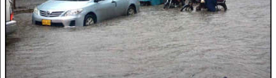
HYDERABAD: Vehicles passing through accumulated water after heavy rain in the city.