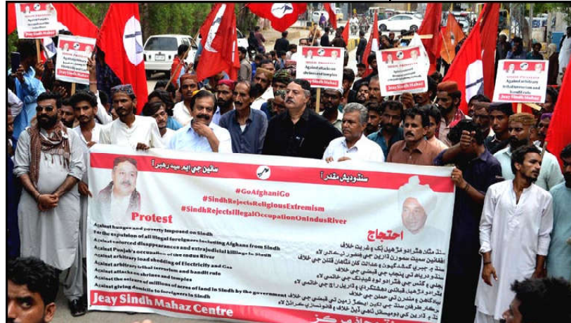
HYDERABAD: Activists of Jeay Sindh Mahaz Centre hold a protest against go Afghani at outside press club.

He said that those associated with the commerce and industry are considered to be ambassadors of the country, and they can play important role in its economic development.