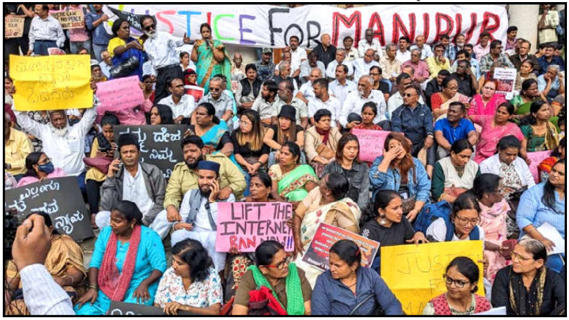
People gather outside Town Hall to protest the alleged sexual assault of two tribal women in the eastern state of Manipur, in Bengaluru, India.