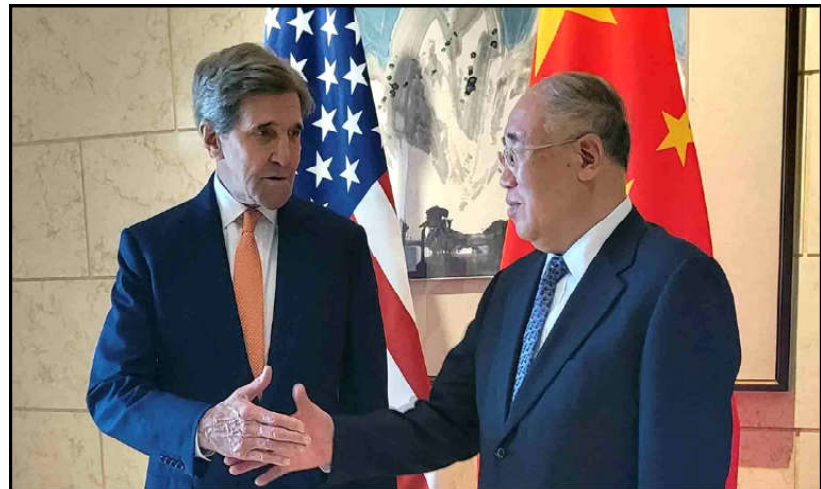
US Special Presidential Envoy for Climate John Kerry shakes hands with his Chinese counterpart Xie Zhenhua before a meeting in Beijing, China.

Monitoring Desk BEIJING: US climate envoy John Kerry held four hours of talks with his Chinese counterpart in Beijing on Monday, calling for "urgent action" as the two countries revived stalled diplomacy on reducing planet-warming emissions. Climate talks between the two biggest greenhouse gas emitters came to a halt last year after Nancy Pelosi, then-speaker of the US House of Representatives, enraged Beijing by visiting self-ruled Taiwan, which China considers to be