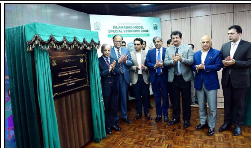
ISLAMABAD: Prime Minister Muhammad Shehbaz Sharif unveiling a plaque to mark the groundbreaking of Islamabad Model Special Economic Zone.