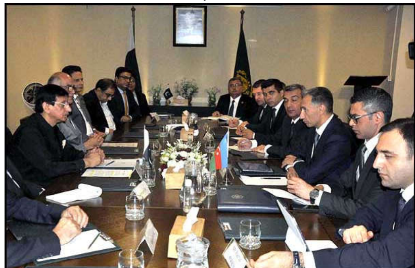
ISLAMABAD: Federal Minister for IT and Telecommunication Syed Amin Ul Haque chair a meeting along with Azerbaijan Minister for Digital Development & Transport Mr. Rashad Nabiyev at IT Ministry.

The agency has successfully processed an impressive sum of around Rs 66.87 billion cash till date.