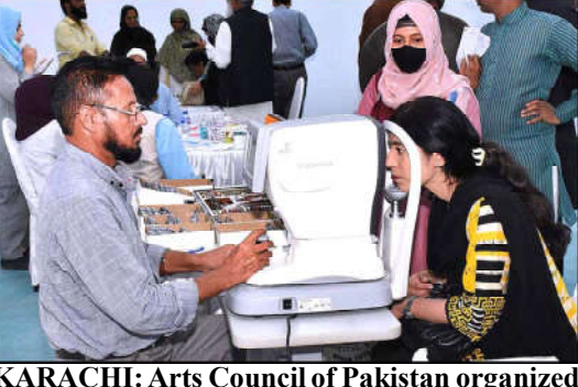
KARACHI: Arts Council of Pakistan organized "Free Medical Camp" at Haseena Moin Hall.