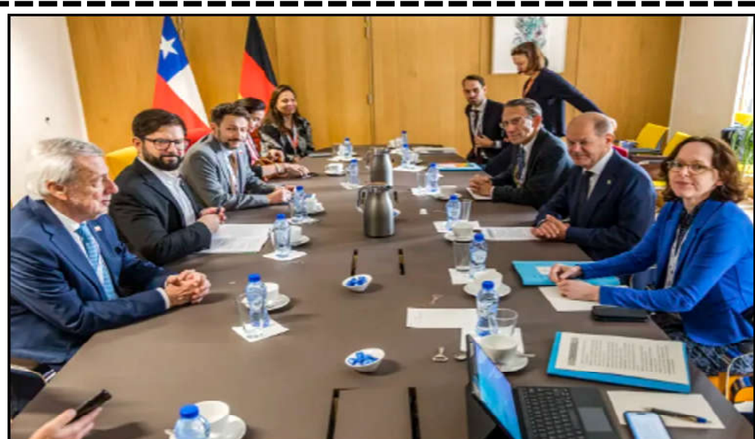
Germany's Chancellor Olaf Scholz and Chile's President Gabriel Boric sit during their bilateral meeting during the third EU-CELAC summit that brings together leaders of the EU and the Community of Latin American and Caribbean States, in Brussels, Belgium.

The North African nation has strategic importance to China given its location on the Mediterranean Sea. Relations between Beijing and the governing National Liberation Front go back to the late 1950s, when Algeria sought independence from France. In 2014, the two upgraded their ties to a so-called comprehensive strategic partnership, with gas-rich Algeria the first Arab nation to form such a partnership with China. In their statement on Tuesday, both sides agreed to deepen their comprehensive strategic partnership, stressing the need for close political and security cooperation.