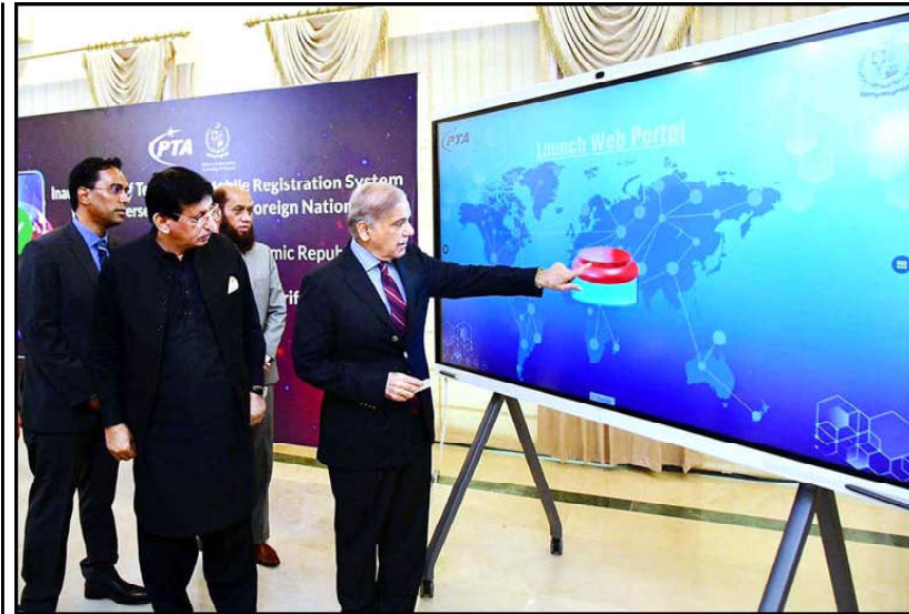
ISLAMABAD: Prime Minister Muhammad Shehbaz Sharif pushing a button to inaugurate temporary Mobile Registration System for overseas Pakistanis & Foreign Nationals.

projects. He told the gathering that after the Chinese industry gone hitech, Pakistan had the golden opportunity to learn from the Chinese textile expertise, go for joint ventures and bring Chinese second-hand machinery to Pakistan to boost its exports. He said during the last 14 months, the incumbent government remained in 'fire-fighting' mode as it had to cope with the unprecedented floods and record inflation, begotten by the Ukraine war. The prime minister said after the IMF agreement, the government would mainly focus on boosting industrial and agriculture sectors.