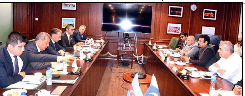
ISLAMABAD: Minister of Maritime Affairs, Syed Faisal Hussain Sabzwari, and Minister of Digital Development and Transport, H. E. Rashad Nabiyev, of the Republic of Azerbaijan, held a meeting at the Ministry of Maritime Affairs today to discuss mutual cooperation and explore potential collaborations.

the challenges and issues faced by FM radios. In response, Sharjeel Inam Memon assured the delegation that he would take steps to address the problems encountered by FM radios. Sharjeel Inam Memon emphasized the significance of radio as a powerful and essential public medium that should not be overlooked. He acknowledged that radio holds the capability to reach a vast number of listeners within a short span of time, making it a crucial tool for public awareness.