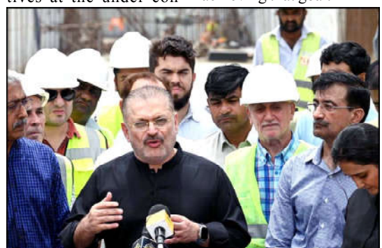
KARACHI: Sindh Minister of Information, Transport and Mass Transit, Sharjeel Inam Memon talks with media persons during his inspection visit to review construction works of new development projects at Shahrah-e-Quaideen road nearby Numash Chowrang area in Karachi.

Independent Report KARACHI: Sindh Minister for Information, Transport and Mass Transit, Sharjeel Inam Memon talks with media persons during his inspection visit to review construction works of new development projects at Shahrah-e-Quaideen road nearby Numash Chowrang area in Karachi.