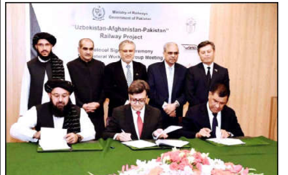
ISLAMABAD: Uzbekistan, Afghanistan and Pakistan signed a Joint Protocol on (UAP) Railway project at Ministry of Railways.