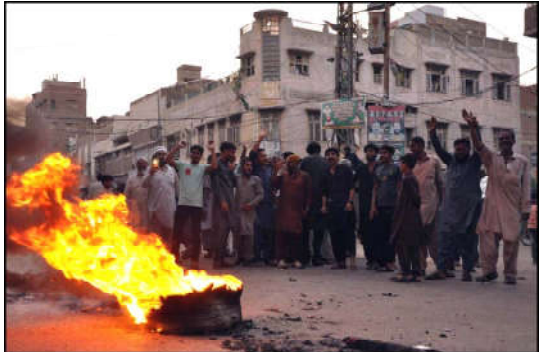
HYDERABAD: Shopkeepers of Anaj Market are burn tires and blocked road as they are holding protest demonstration against non-installation of electricity transformer, in Hyderabad.