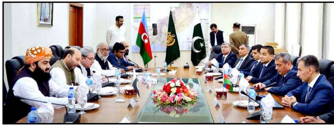
ISLAMABAD: Federal Minister for Communications, Maulana Asad Mahmood hosted a meeting with Azerbaijan's Minister for Transport, Mr. Rashad Nabiyev to discuss Road Trade Agreement.

ISLAMABAD (APP): Prime Minister Shehbaz Sharif on Tuesday launched multiple initiatives here for promoting sports culture and welfare of the sports persons including the Rs 5 billion Pakistan Sports Endowment Fund. In a ceremony held here, he launched Pakistan Sports Endowment Fund with initial seed money of Rs 5 billion to provide financial assistance and other facilities to the emerging players and retired sports persons of the country. The prime minister also performed soft launch of the first dedicated Sports University in the country to produce critical pool required for sports events such as planners, managers, technical staff, nutritionists, physiotherapists and others. Similarly, PM Shehbaz launched the Prime Minister Youth Sports Initiative to develop sports across the country and to provide world class sports facilities to the youth. He also launched the Elite Sportspersons Development Programme and E-Sports development programme.