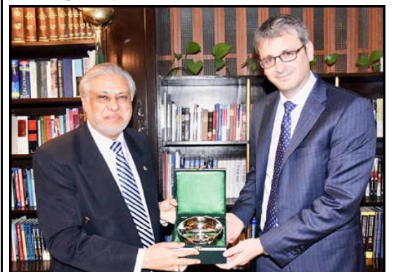
ISLAMABAD: Brent Neiman, Deputy Under Secretary of the US Department of Treasury calling on Federal Minister for Finance and Revenue, Senator Muhammad Ishaq Dar at Finance Division.

To achieve the milestone, the USF had diligently laid fiber optic cables and installed 4G and 3G towers in remote and previously unserved areas, he added.