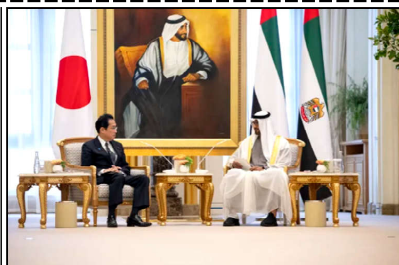
Japanese Prime Minister Fumio Kishida and Emirati President Sheikh Mohammed bin Zayed Al Nahyan meet at Qasr Al Watan in Abu Dhabi, United Arab Emirates.

Washington has pledged to defend the Philippines, which allowed the U.S. access to four additional military bases this year, angering Beijing. Marcos also said granting U.S. access to the bases was a defensive step that would be "useful" if China attacked democratically governed Taiwan, which China claims as part of its territory. China has always insisted on being friendly with its neighbours, which it sees as its partners, Xi said, without commenting on the state of current bilateral ties.