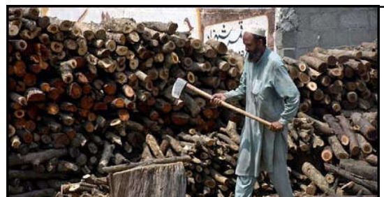
RAWALPINDI: A laborer cutting woods at Chakbeli Road.

For over a decade and a half, Zong 4G has been at the forefront of technological advancement, pioneering the introduction of 3G and 4G networks and successfully testing 5G. The company's commitment to technological progress has transformed the way Pakistan connects and communicates, propelling the nation's digital revolution. Investing significantly in expanding its network infrastructure, Zong 4G has erected over 14,000 towers nationwide, extending its services to even the remotest corners of the country.