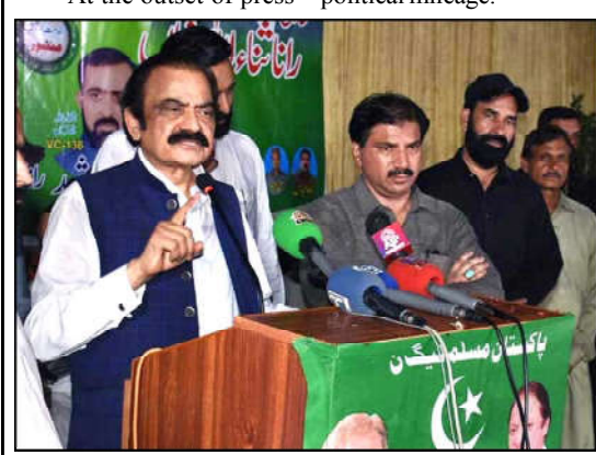
FAISALABAD: Interior Minister Rana Sana Ullah Khan addressing to a public gathering.

ISLAMABAD (APP): The Election Commission of Pakistan (ECP) on Monday issued a report that revealed the number of registered voters in the country had reached over 126 million, as of June 30, 2023. The ECP also released the percentage of voters in terms of age, according to which, the highest number of voters remained within the age group of 26 to 35 years. According to the report, the ratio of male and female voters in Pakistan stood at 54.02 per cent and 45.98 per cent respectively. The total number of registered voters in Islamabad was over one million while Punjab topped with 71.60 million voters.