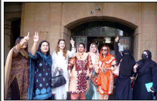
KARACHI: Female Councilors of Tehreek-e-Insaf (PTI) are holding protest demonstration for acceptance of their demands, after first district council meeting session held at City Council Hall Old KMC building in Karachi.

Commissioner said the Sindh Government is incurring huge funds on better facilities of medical treatment to poor people but despite that Taluka Hospital on National Highway lacks better treatment for area people. Earlier, the Commissioner visited the