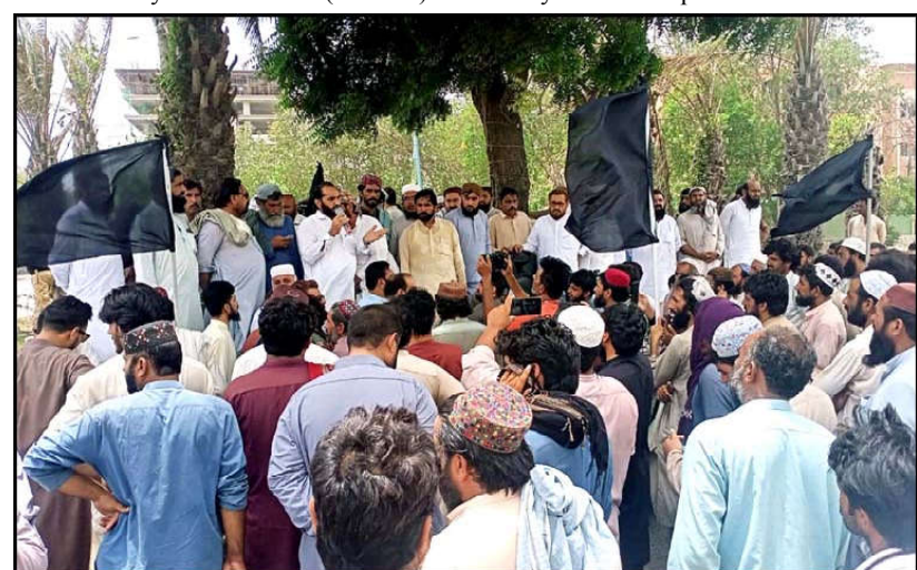
KARACHI: Members of Oil Tankers Owners Association are holding protest demonstration for acceptance of their demands, held in Karachi.