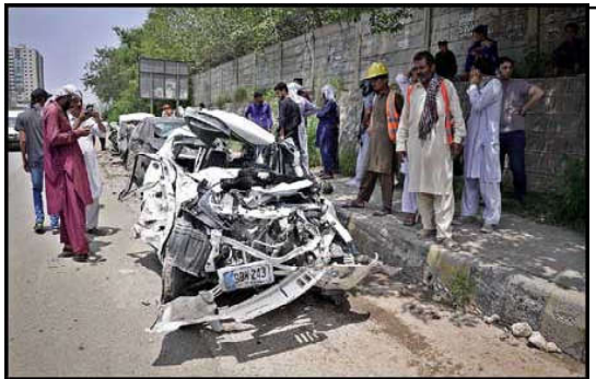
RAWALPINDI: View of badly damaged vehicles struck by an out of control Dumper Truck near Lahore High Court Bench at Swan area in the outskirts of the city.

Provincial Minister for Health, Dr Javed Akram said that Muharram teaches us tolerance, patience and brotherhood. The government has united ulema of all schools of thought on one platform by promoting inter-faith harmony and all of them assured their cooperation. Provincial Minister for Information, Aamir Mir, said that we all have to play a key role.