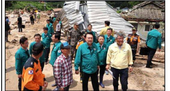
South Korea's President Yoon Suk Yeol (C) visits a village, where more than a third of houses were damaged in landslides and two people remain missing, in Yecheon.