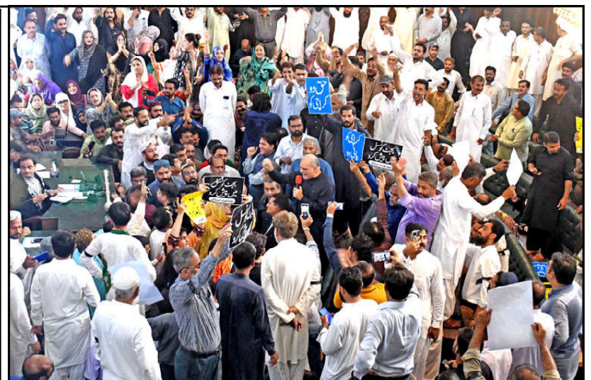
KARACHI: Mayor Barrister Murtaza Wahab chair the meeting of the newly elected City Council while member of Jamaat-e-Islami and his alliance stage protest in front of Mayor desk during the meeting of City Council in Provincial Capital.