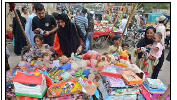
KARACHI: Women and children selecting and purchasing old toys at a roadside stall in Empress Market.

He said that over 10 thousand Pakistanis were residing in Korea while there were opportunities of investment in Fisheries and Textile sectors in Korea available to Pakistanis.