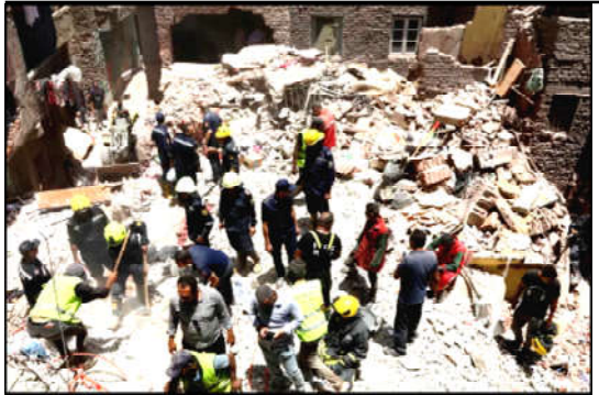
Rescuers search through the rubble of a collapsed five-story apartment building in Cairo, Egypt.

biggest land war since World War Two. The aid, which will be provided through the United Nations and other non-governmental organization partners, will increase support for those who have been displaced or otherwise affected by the war with emergency food assistance, health care and safe drinking water, among other assistance, according to the announcement.