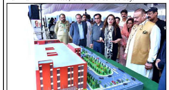
ISLAMABAD: Federal Minister for health Abdul Qadir Patel being briefed about Cancer Hospital in PIMS.

ISLAMABAD (INP): Minister for National Health Services Abdul Qadir Patel performed the groundbreaking of National Cancer Hospital at Pakistan Institute of Medical Sciences (PIMS) in Islamabad on Monday. Speaking on the occasion, he said that this project will be completed at a cost of 10.8 billion rupees by June 2025. He regretted that this cancer hospital in the public sector was delayed by the previous government out of ego and stubbornness. He said this delay has increased the cost of this project.