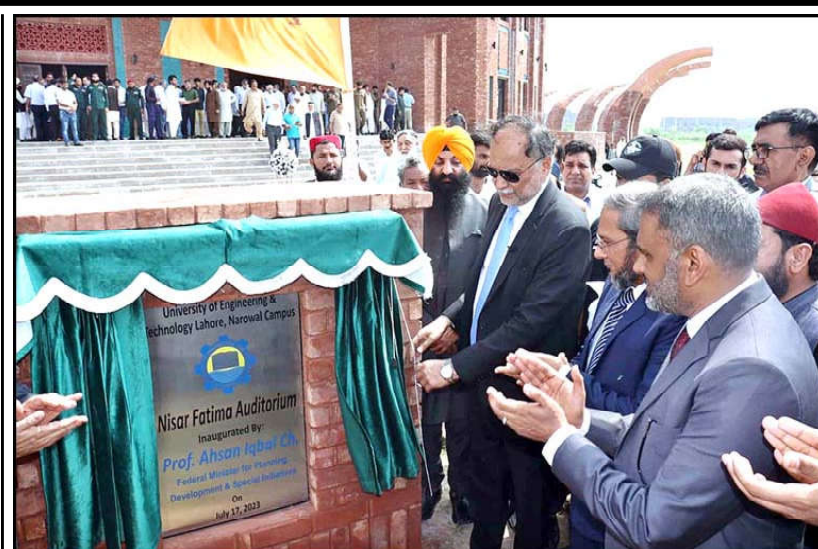
NAROWAL: Mr. Ahsan Iqbal Federal Minister for Ministry of Planning Development & Special Initiatives unveiling the plaque to inaugurate Nisar Fatima Auditorium and Jamia Masjid UET.

He said that in the year 2018, the journey towards development was stopped through a conspiracy and the politics of hatred was started in Pakistan. Ahsan Iqbal said that 15 months ago, when the coalition government was formed through constitutional means, it had to bear the brunt of Imran Khan's incompetence.