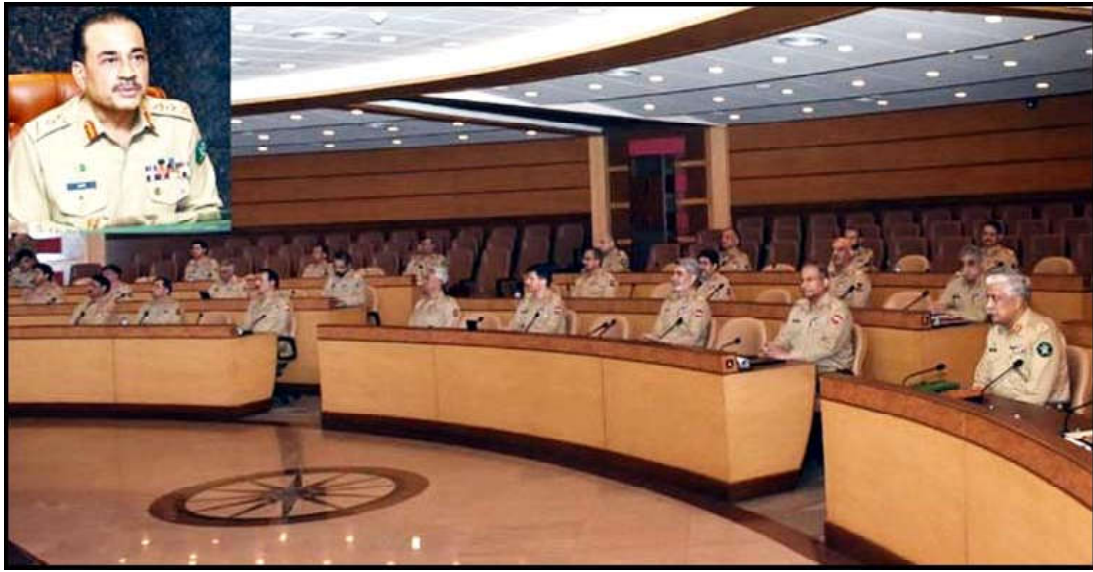
RAWALPINDI: Chief of the Army Staff (COAS) General Syed Asim Munir presiding over 258th Corps Commanders' Conference (CCC) held at the General Headquarters.

Ph: 0300-3898091 Vol: 05. No. 209 Zil Hajj 29, 1444 AH Tuesday July 18, 2023 Pages 04 Price Rs. 12.00