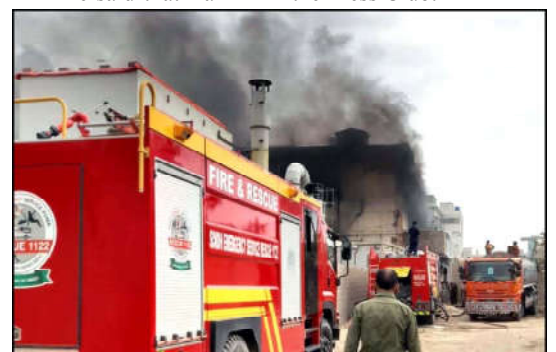
KARACHI: View of site after a fire broken out incident as the fire brigade officials are busy in extinguishing fire and rescue operation, at Garments Factory building located on Maymar Industrial Area in Karachi.