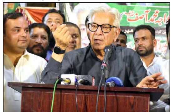
SIKALOT: Defense Minister Khawaja Muhammad Asif is addressing the workers convention of PML-N at Union Council Water Works.

The COAS was presented with the Guard of Honour by a smartly turned-out contingent of Iranian Armed Forces at the Military Headquarters on his arrival.