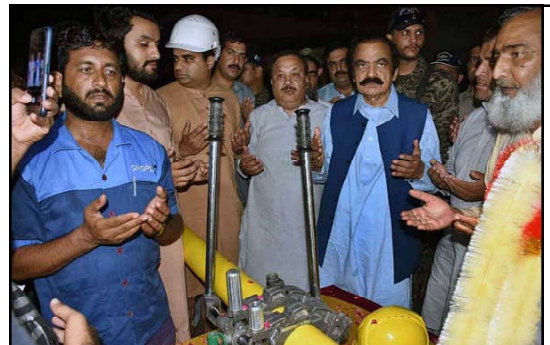
FAISALABAD: Interior Minister Rana Sana Ullah Khan offering 'dua' after inaugurating sui gas supply at Chak No. 4 JB Ram Diwali.