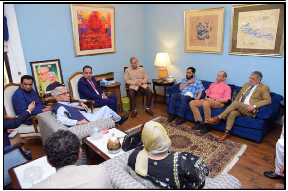
A delegation of Sialkot Chamber of Commerce called on Prime Minister Muhammad Shehbaz Sharif in Sialkot. Minister of Defence, Khawaja Muhammad Asif was also present.

The delegation paid tribute to the prime minister on the final approval of the agreement with the International.