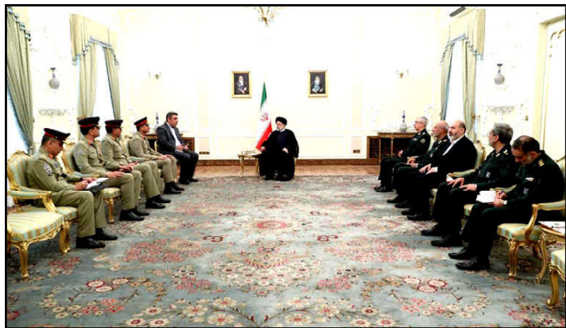
TEHRAN: Chief of Army Staff (COAS) General Syed Asim Munir meeting with President of the Islamic Republic of Iran, Ebrahim Raisi

It said India is sending CRPF's CoBRA commandos to further brutalize the people of the occupied territory. It said huge concentra-