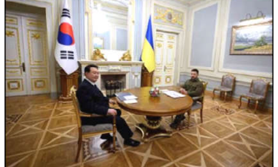
Ukraine's President Volodymyr Zelenskyy and South Korean President Yoon Suk Yeol attend a meeting, amid Russia's attack on Ukraine, in Kyiv, Ukraine.

Monitoring Desk WASHINGTON: White House National Security Adviser Jake Sullivan said on Sunday the Biden administration remains concerned that North Korea will move forward with another intercontinental ballistic missile test. "I have been concerned for some time that North Korea would conduct what would be its seventh nuclear test," Sullivan said during an interview with CBS's Face the Nation.