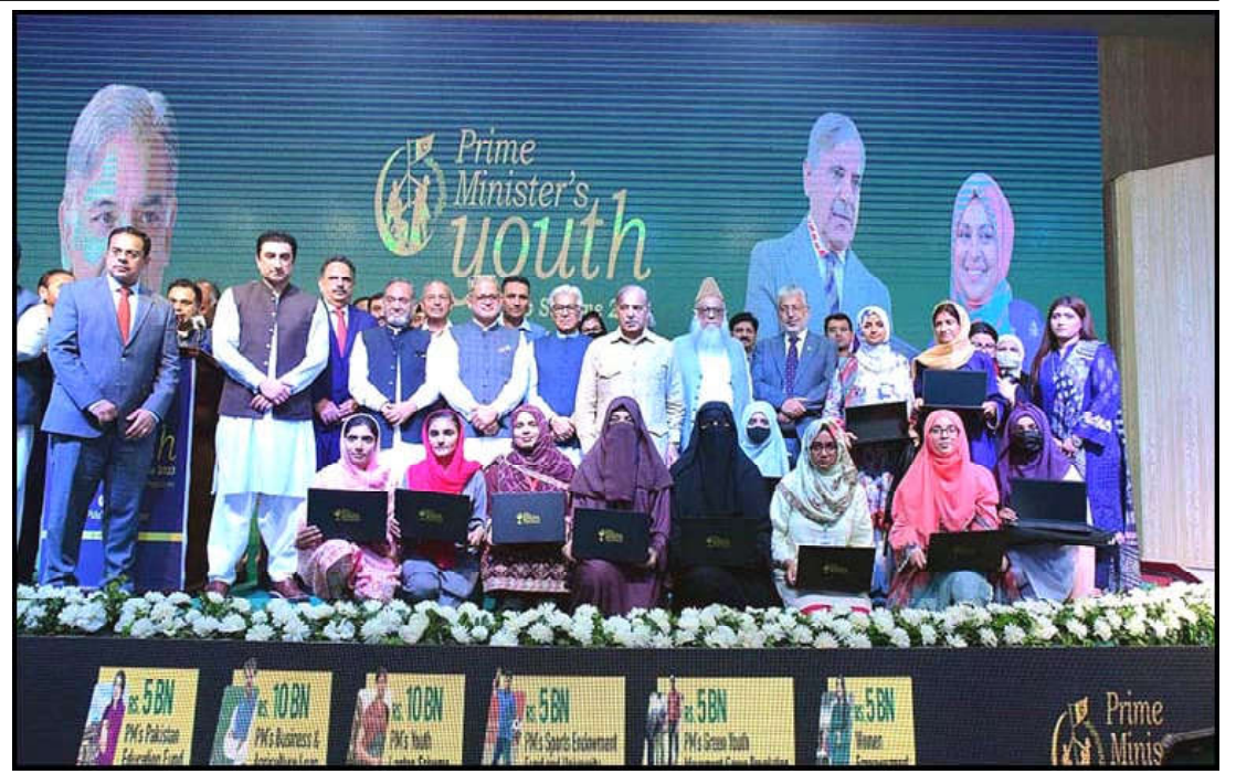
SIALKOT: Prime Minister Muhammad Shehbaz Sharif in a group photo with high achievers who received laptops under the PM's Youth Scheme distribution ceremony.

He said Pakistan is also looking for joint cooperation and technology, particularly information technology. Pakistan has a young population with very good IT skills.