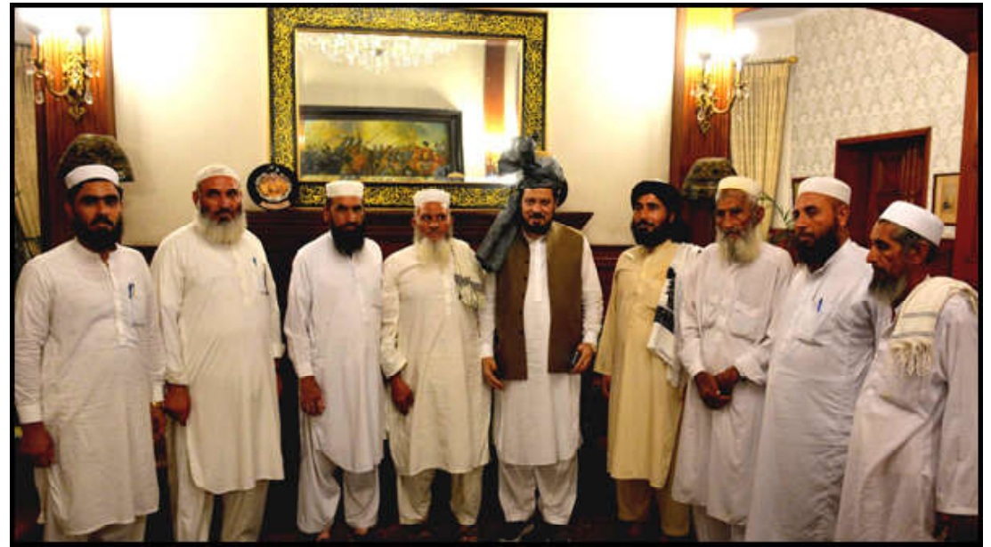
PESHAWAR: Khyber Pakhtunkhwa Governor Haji Ghulam Ali in a group photo with delegation of public representatives of District Mohmand.

He accused the PTI chief of destabilizing the country and destroying the national economy. Amir Muqam that the entire nation had seen attacks on national institutions and defense installations during May 9 vandalism. He said that one party had made a deep conspiracy against Pakistan on May 9 by attacking state institutions while Pakistan Muslim League-N had frustrated the evil designs of the attackers. Amir Muqam