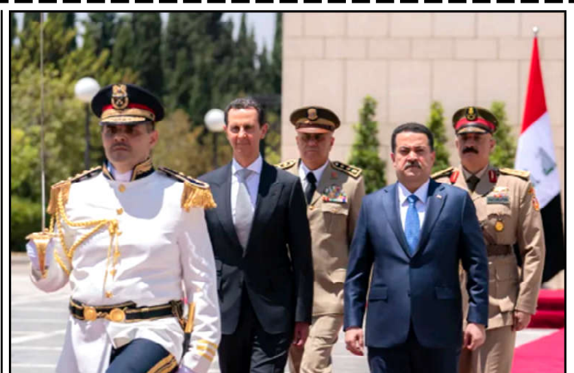
Syrian President Bashar Assad and Iraq's Prime Minister Mohammed Shia al-Sudani review a military honour guard during a welcome ceremony in Damascus, Syria.

the battlefield. They are banned by numerous countries — notably in Europe — that are signatories to a 2008 Oslo Convention, to which neither Russia, the United States nor Ukraine are parties. Humanitarian groups have strongly condemned the US decision to supply cluster munitions to Ukraine. US President Joe Biden said the decision was "very difficult" but stressed Ukraine needed extra ammunition to refill its depleted stocks.