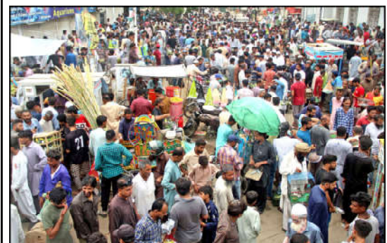
KARACHI: A large numbers of people are busy in buying birds in birds market at Liaqatabad area, in the Provincial Capital.