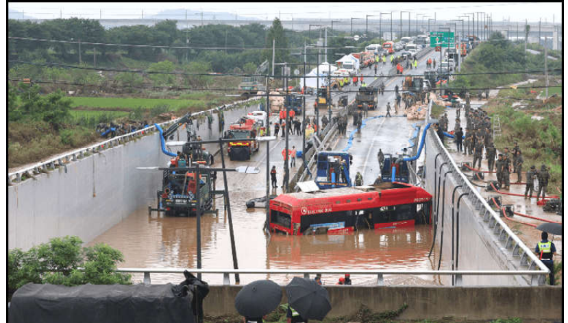
South Korean rescue workers search for missing persons near a bus along a deluged road leading to an underground tunnel where some 15 cars were trapped in flood waters after heavy rains in Cheongju.

fence secretary for four years, helping lead Britain's response to Russia's invasion of Ukraine. "I'm not standing next time," he said in an interview with the newspaper, but ruled out going "prematurely" and forcing another by-election. Sunak is facing three by-elections next week, and opinion polls suggest his Conservative party could lose all of them. A general election must be held in Britain within the next 18 months. The Sunday Times said a cabinet reshuffle was expected in September.