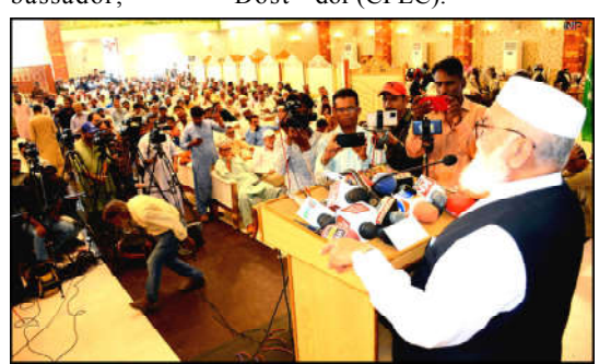
HYDERABAD: Naib Amir Jamaat-e-Islami Pakistan and former parliamentary leader Liaquat Baloch addressing the election convention of Lower Sindh under Sindh at local hotel Hyderabad.

The delegation members come from all provinces of Pakistan as well as from Azad Jammu and Kashmir, and Gilgit-Baltistan. As practitioners and academics, they have long-standing experience in China studies, regional and global matters, Pakistan-China relations, and China Pakistan Economic Corridor (CPEC).