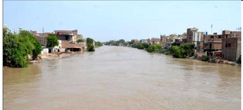
HYDERABAD: View of the water level increasing in the Phuleli Canal while many nearby residents evacuate from their homes due to increased water level and overflowing canal water, in Hyderabad.