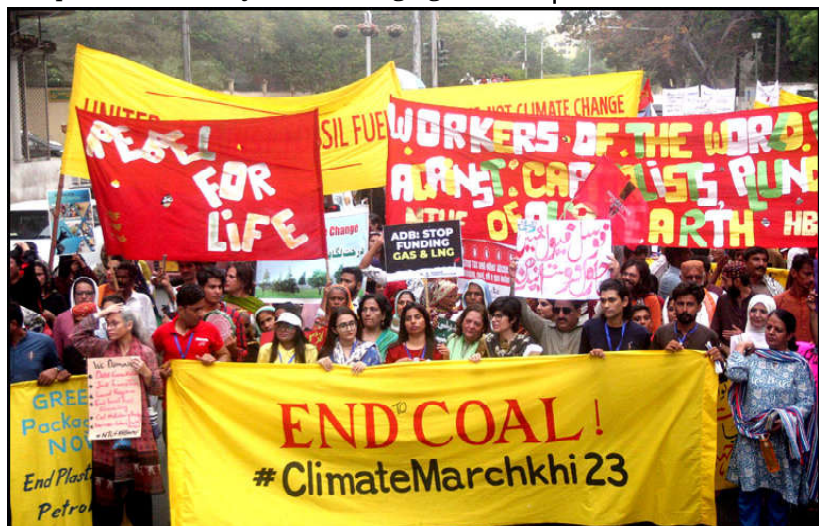
KARACHI: Participants hold banners during Climate March at Frere Hall in Provincial Capital.

Gwadar North Free Zone. It procured 10 acres of land in the Free Zone to set up a fertilizer factory, marking a first for Gwadar in both size and product. Agven will start operations under temporary arrangements such as electricity and water provision by China Overseas Port Holding Company. "The factory's construction started last year and was completed in a remarkably short time. Agven will offer hundreds of job opportunities and provide local business opportunities in terms of commodities and raw material supply."