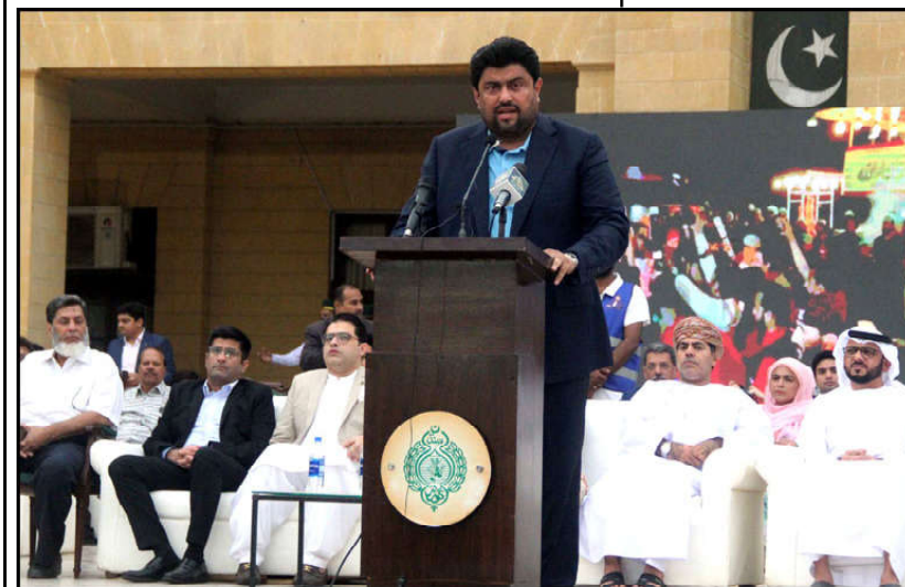
KARACHI: Governor of Sindh Muhammad Kamran Khan Tessori addressing during I.T mega entry test Ceremony at Governor House in Provincial Capital.

The participants, included, people from different walks of life, civil society, and different NGOs were determined to the awareness of the changing climate.