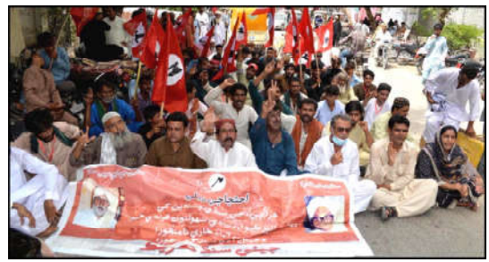
HYDERABAD: Demonstration is being held in favour of the demands of the Jai Sindh movement.