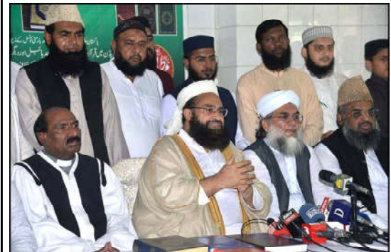
LAHORE: Special Assistant to the Prime Minister on Religious Harmony Maulana Tahir Ashrafi talking to media persons at Jamia Manzoorul Islamia.

Recognizing the universal message of peace, harmony, moderation, and tolerance found in Islam and all other religions, they vehemently clarified that no religion's teachings promote violence or extremism.