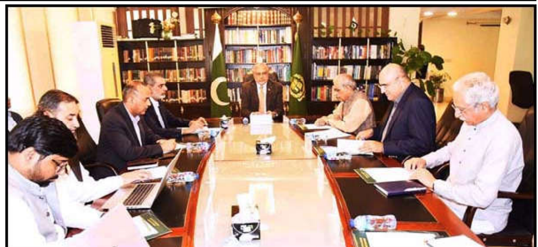
ISLAMABAD: Federal Minister for Finance and Revenue Senator Mohammad Ishaq Dar chaired a meeting on the establishment of Pakistan Sovereign Wealth Fund, at Finance Division.

development and long-term business partnerships between Pakistan and China. He said that Pakistan was establishing many special economic zones under CPEC and it was a good opportunity for Chinese companies to transfer technology to Pakistan and set up joint ventures in areas of interest. He said that ICCI is working on a new industrial estate in the region.