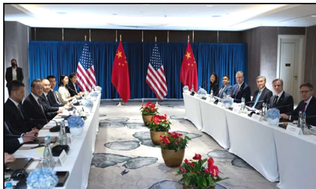
US Secretary of State Antony Blinken sits at a table with advisors across from Director of the CCP Central Foreign Affairs Office Wang Yi and his advisors.

Blinken eventually visited in mid-June, becoming the first US secretary of state in China in nearly five years, opening a flurry of diplomacy since then.