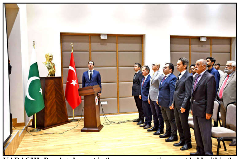
KARACHI: People take part in the commemoration event held within the July 15 Democracy and National Unity Day to mark sixth anniversary of July 15, 2016 defeated coup orchestrated by Fethullah Terrorist Organization (FETO) at Turkish Consulate in Provincial Capital.