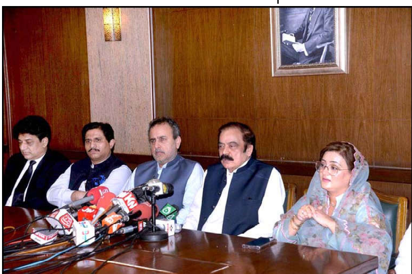
LAHORE: Federal Interior Minister Rana Sanaullah is addressing a press conference.