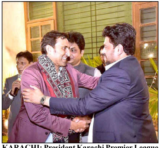
KARACHI: President Karachi Premier League Younas Khan thanking Governor Sindh Kamran Khan Tessori for coming to the event.

KARACHI (APP): Sindh Governor Mohammed Kamran Khan Tessori Friday said that the activities like Karachi Premier League (KPL) would promote the positive image of Karachi.