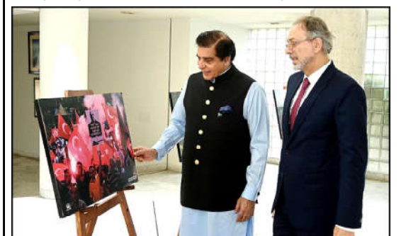
ISLAMABAD: Speaker National Assembly Raja Pervaiz Ashraf witnessing Türkiye Art Exhibition displayed on the occasion of Turkish Democracy and National Unity Day.