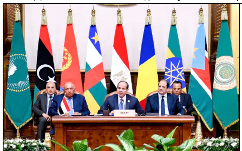
Egyptian President Abdel-Fattah el-Sissi speaks during the summit on the Sudan conflict, at the Presidential Palace in Cairo, Egypt.