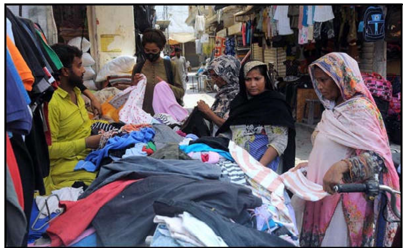
MULTAN: Female customers selecting and purchasing old clothes displayed by the roadside vendor to attract the customers.