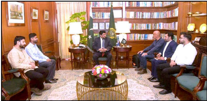
KARACHI: Governor Sindh Kamran Khan Tessori meets delegation of French NGO, Triangle Generation Humanitaire at Governor House.

Earlier on arrival, the COAS was received by the Commander Quetta Corps.