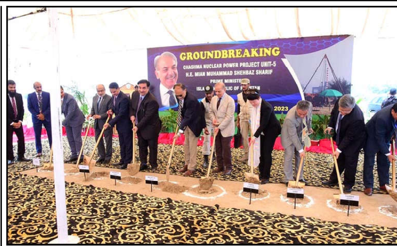
MIANWALI: Prime Minister Muhammad Shehbaz Sharif, Federal Ministers, dignitaries from China and PAEC officials performing the ground breaking of the 5th Unit of Chashma Nuclear Power plant (C-5) in Chashma.