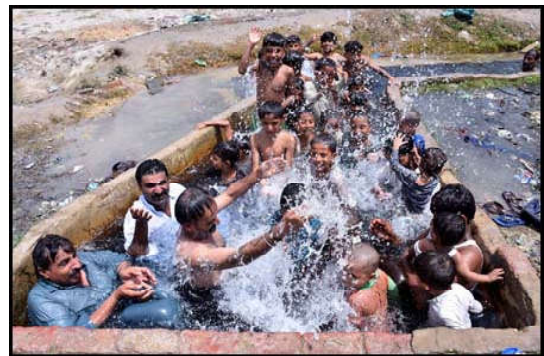
LARKANA: People along with children enjoying bathing in the watercourse to get some relief from hot weather in Ghulam Bhutto Village.