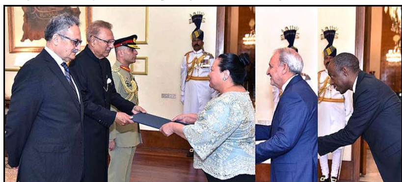
ISLAMABAD: The newly-appointed envoys of the Philippines, Iran and Rwanda presenting their diplomatic credentials to President Dr. Arif Alvi at Aiwan-e-Sadr.

He said the period of his government was a journey of moving from the destruction towards construction, economic stability, helping the flood affected people, providing maximum employment to the jobless and relief to the people hit by inflation, and revival of freedom of speech, media freedom and national integration.