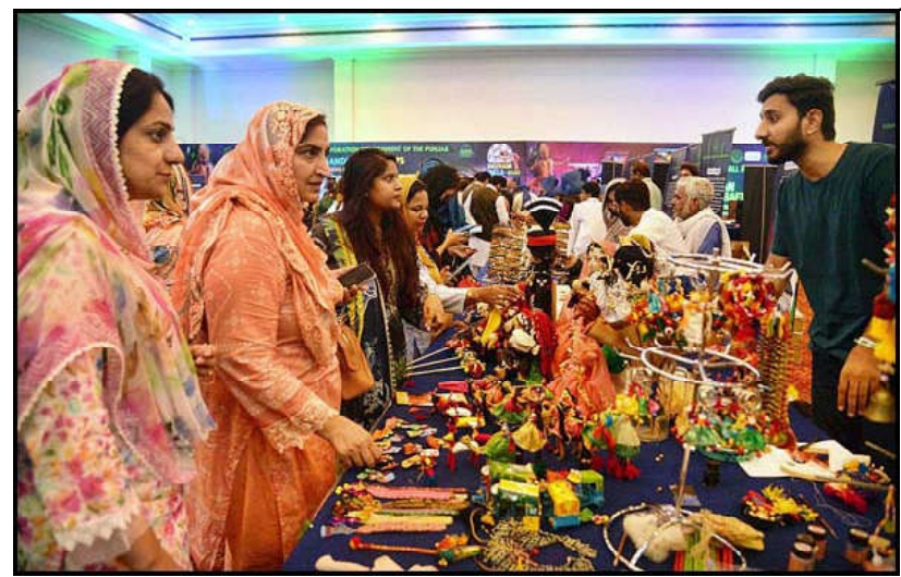
LAHORE: Women participating in the Dastkar Mela organized by Punjab Small Industry at the local hotel.