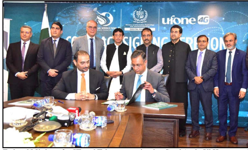
Federal Minister for IT and Telecommunication Syed Amin Ul Haque and Federal Minister for Science and Technology Agha Hassan Baloch witnessing contract signing of High Speed Mobile Broadband Projects for Balochistan in Islamabad.

According to details, dilapidated part of a flat located in Gulistan-e-Johar area of Karachi suddenly came down. A young girl died in the incident while mother was seriously injured. The rescue teams reached the scene, pulled out the body, injured from debris and shifted them to hospital.