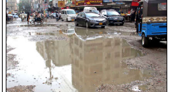
KARACHI: A view of the sewerage water accumulated on road at Soldier Bazaar causing trouble to the people, which needs the attention of concern authorities.

All concerned wings of Hyderabad Municipal Corporation have been activated to ensure cleanliness and special lightening arrangements around the places of Majalis-e-Aza and routes of mourning processions as well as provision of maximum facilities to mourners during the