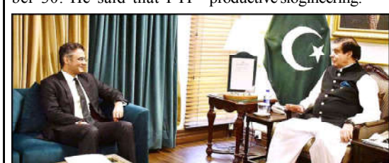
ISLAMABAD: Attorney General of Pakistan Mr. Anwar Mansoor Usman Awan call on Speaker National Assembly Raja Pervez Asharf.

There can be no more heinous act than this. There were trillion of rupees but he could have built a hospital had he not wasted time in unproductive engineering.