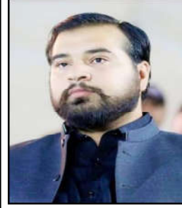
By Hamza Shahzad

Balochistan's educated youth are increasingly feeling exasperated and desperate, as years of university education are no assurance of acquiring a job. With mounting inflation, this catastrophe is also distressing their mental health.