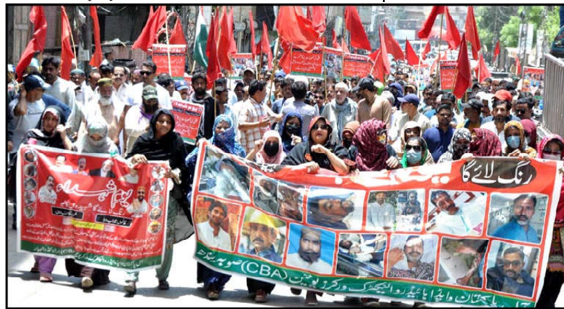
HYDERABAD: WAPDA workers under the banner of All Pakistan WAPDA Hydro Electric Workers Union take out a big rally to observe 'Youm-e-Shuhda' outside HPC.