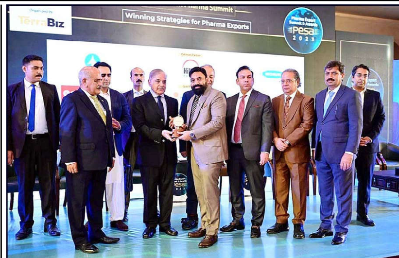
ISLAMABAD: Prime Minister Muhammad Shehbaz Sharif distributes awards among the highest exporters of Pharmaceutical Industry in Pakistan.

The prime minister expressed confidence that the board meeting of the International Monetary Fund this evening would help open more Letters of Credit (LCs) relating to pharma products.