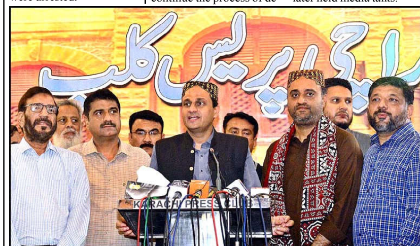
KARACHI: Mayor of Karachi Murtaza Wahab along with Deputy Mayor Salman Abdullah Murad talking to media during their visit to KPC.

The Mayor of Karachi visited various sections of the press club and later held media talks.