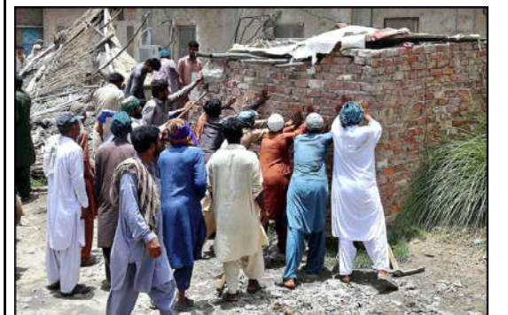
HYDERABAD: Railway staffers of Anti-Encroachment Cell demolishing encroachments at Makki Shah area.