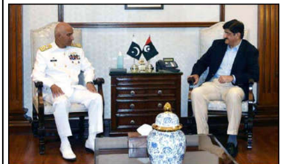
KARACHI: Sindh Chief Minister Syed Murad Ali Shah exchanges views with Chief of the Naval Staff Pakistan Admiral Muhammad Amjad Khan Niazi at CM House.

Today there is meeting of IMF Executive Board. Pray for it that our program is approved in IMF meeting.