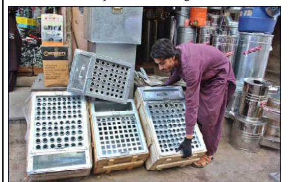
QUETTA: Shopkeeper setting up frames of Kulfli to attract customers at Mission Road.

The business leader said that the news of differences in the ruling coalition is everywhere, and the main reason for these differences is that different parties demand more than their right and try to deprive others of their legitimate rights.