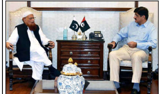
KARACHI: Sindh Chief Minister Syed Murad Ali Shah meets with Mufti Taqi Usmani at CM House.

He observed that when BAFL was advised to submit the SMS or e-mail through which OTP was delivered to the customer, BAFL failed to submit the required information even after continuous follow-up.