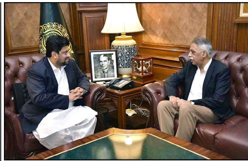
KARACHI: Former Sindh Governor Muhammad Zubair calls on Sindh Governor Kamran Khan Tessori at Governor House.