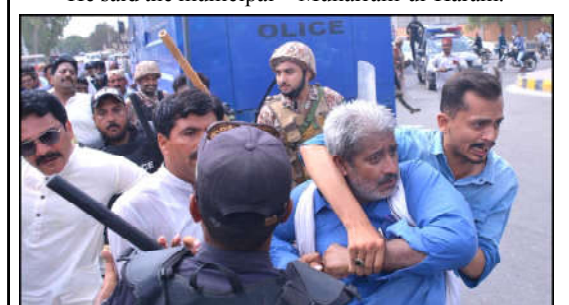
KARACHI: Police personal arrest teacher while going to red zone during protest.

It may be mentioned here that an emergency control room had been established for continuous monitoring of the arrangements made in connection with Muharram-ul-Haram.