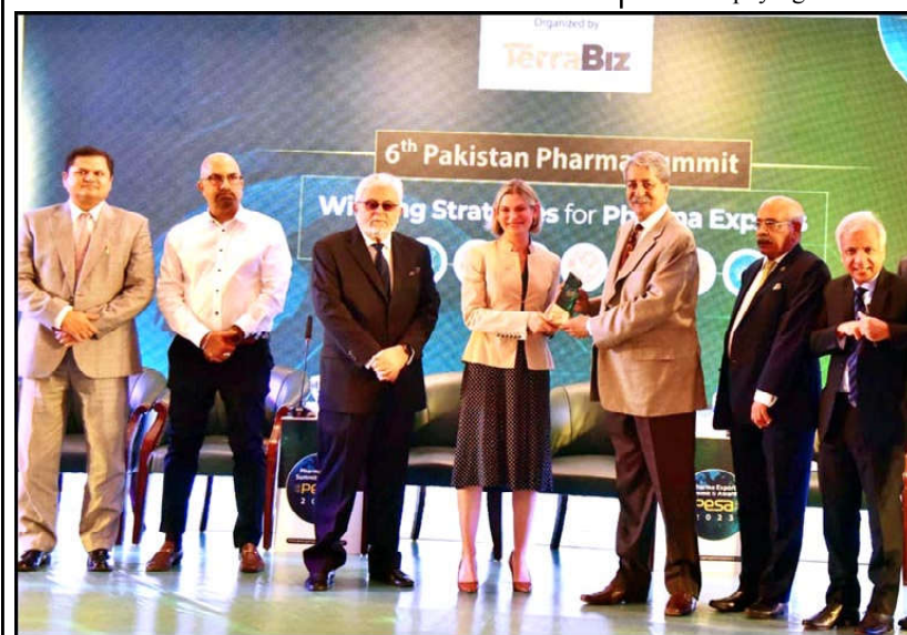
ISLAMABAD: Federal Minister for Commerce, Syed Naveed Qamar presenting souvenir to delegates at the opening ceremony of the 6th Pakistan Pharma Summit and Awards (PESA) 2023.

It was strongly opposed by the United States and the European Union, who say it conflicts with their view on human rights and freedom of expression.