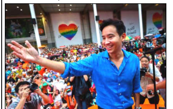
Move Forward Party leader Pita Limjaroenrat greets supporters during a rally to thank voters ahead of the vote for a new prime minister, in Bangkok, Thailand.

Monitoring Desk SEOUL: South Korean President Yoon Suk Yeol is set to meet Japanese Prime Minister Fumio Kishida on Wednesday on the sidelines of a NATO summit, with the release of radioactive water from the Fukushima nuclear plant and North Korea expected on the agenda. Japan plans to soon start releasing more than a million tons of treated radioactive water from its tsunami-wrecked Fukushima nuclear plant, a move which has stirred anger and concern among South Koreans. After a two-year review, the International Atomic Energy Agency (IAEA) said last week Japan's plans were consistent with global safety standards and that they would have a "negligible radiological impact to people and the environment". A South Korean presidential official has said the Fukushima water discharge plan could be discussed at the meeting. South Korea's government said on Friday it respected the IAEA's report and that its own analysis had found the release will not have "any meaningful impact" on its waters.