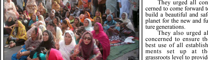
KARACHI: Residence of Liyari area holds protest outside the K-Electric office due to the load shedding in Provincial Capital.

He also directed the officers to take indiscriminate action against those who violate the National Action Plan. SSP Larkana directed to prepare a security plan regarding deployment of additional personnel throughout the district in the month of Muharram, increasing patrolling, snap checking at entry and exit routes and conducting search and combing operations at suspicious places.