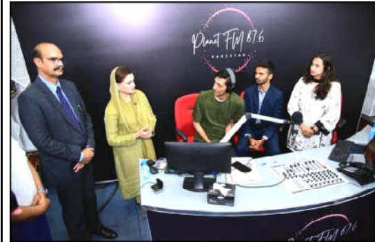
Ms. Marriyum Aurangzeb, Federal Minister for Information and Broadcasting inaugurating a podcast studio titled "Planet FM 87.6" at Radio Pakistan, Islamabad.

The Pakistan Army was also providing training to further enhance the professional techniques of commandos including lady commandos at its different training institutes, he added. The DIG Security and Emergency Services Division further briefed about the up-gradation and advancement made in Madadgar-15 which was one of the sub-units of Sindh Police as the response time of the Madadgar had been reduced to 7 to 10 minutes from 30 to 40 minutes in any emergency situation.