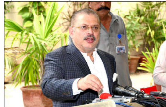
KARACHI: Minister for Information Transport and Mass Transit Sindh Sharjeel Inam Memon addressing at media men before the meeting of the Sindh Assembly.

According to Director Anti-Smuggling Organization of Pakistan Customs Inam Wazir, the Customs officials raided a building at Shahrah-e-Faisal on a tip-off and recovered approximately 20,088 pieces of assorted smuggled vapes, 1,378 kg accessories of vape and 578 liters vape flavor. The approximate value of the seized items was Rs.90 million. The owners/possessors could not produce any documents showing the legal import of these goods accordingly they were arrested.