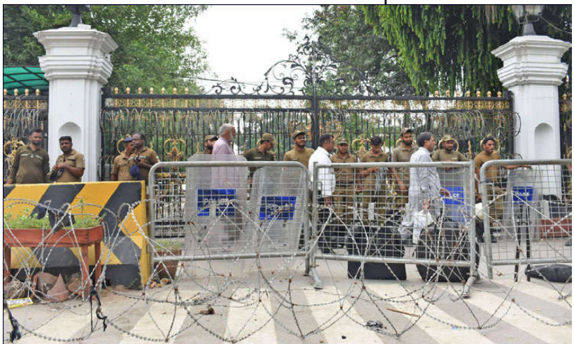
LAHORE: Police personnel stand guard during the protest of Government Employees of Punjab outside Civil Secretariat in Provincial Capital.