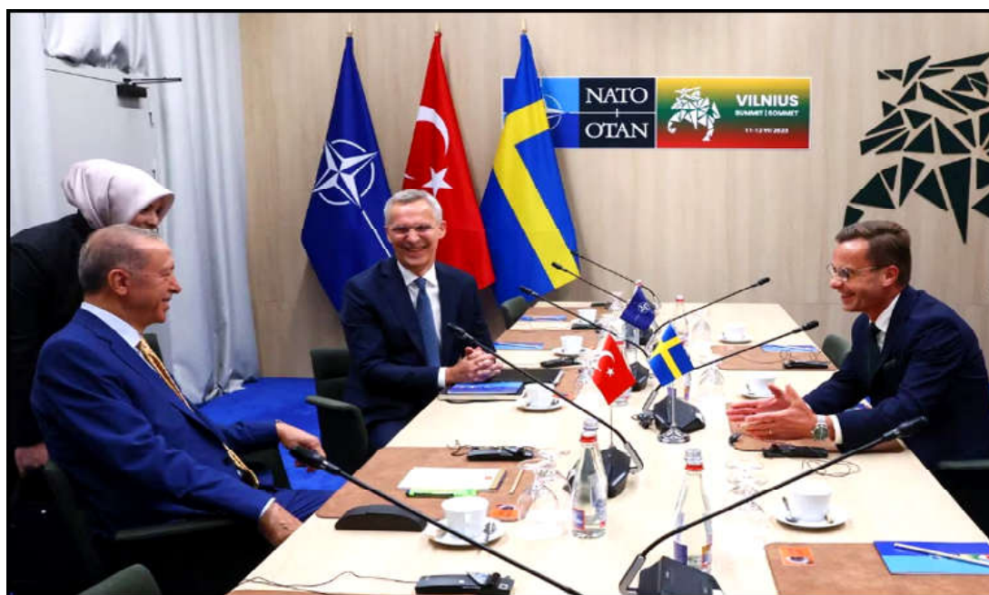
NATO Secretary-General Jens Stoltenberg, Turkish President Tayyip Erdogan and Swedish Prime Minister Ulf Kristersson react during a meeting, on the eve of a NATO summit, in Vilnius, Lithuania.

"I'm glad to announce ... that President Erdogan has agreed to forward the accession protocol for Sweden to the grand national assembly as soon as possible, and work closely with the assembly to ensure ratification," NATO Secretary General Jens Stoltenberg told a news conference, describing it as a "historic" step. He had convened Erdogan and Swedish Prime Minister Ulf Kristersson for several hours of talks on the eve of the summit as he sought to finally break the deadlock.