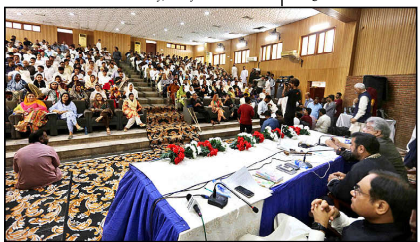
HYDERABAD: Newly elected Mayor Hyderabad Kashif Shoro addressing to Chairmen and District Councilors during Municipal Corporation meeting at Mumtaz Mirza Auditorium, Sindh Museum.

NDMA data shows that so far 86 deaths and 151 injuries to people have been reported, which includes 16 women and 37 children, whereas 97 houses have so far been damaged as torrential rain continued to play havoc across the country.