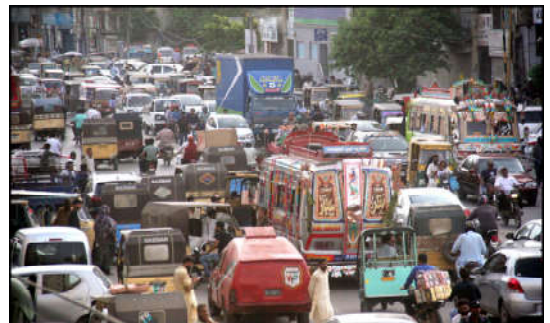
KARACHI: A view of the massive traffic jam at M.A. Jinnah road, which needs the attention of concern authority.

He made it clear that Dhabiji Special Economic Zone will prove to be an economic zone in respect of sustainable development.