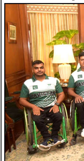
KARACHI: A six-member delegation of the Pakistan Wheelchair Cricket Team called on the Sindh Governor Mohammed Kamran Khan Tessori at Governor House.