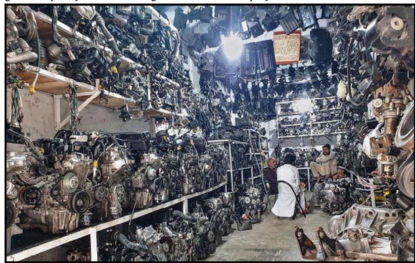
RAWALPINDI: Vendors displaying old vehicles' engines to attract the customers in shop at Chah Sultan.