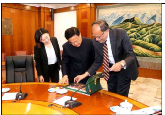
BELJING: Federal Minister for Planning, Development and Special Initiatives, Prof. Ahsan Iqbal met with Mr. Zheng Shanjie, Chairman, National Development and Reform Commission (NDRC). They reviewed progress on ongoing CPEC projects and exchanged views on its future direction in line with the important consensus between the leadership of the two brotherly countries.