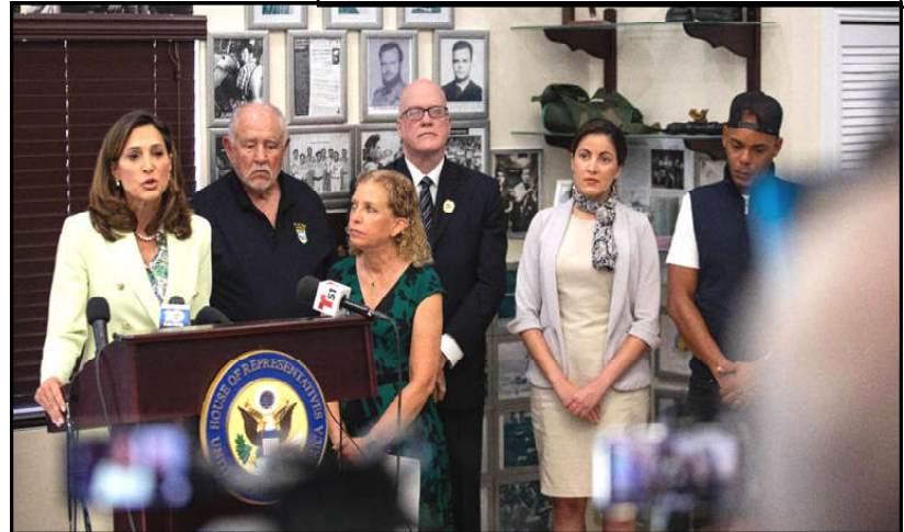
Rep. Maria Elvira Salazar speaks during a press conference after the roundtable discussion between elected officials and Cuban activists about political prisoners at the Assault Brigade 2506 Museum.

"Both sides also need to strengthen communication and collaboration within multilateral mechanisms such as the Shanghai Cooperation Organisation and the BRICS countries, lead the correct direction of global governance reform, and safeguard the common interests of emerging market countries and developing countries," the statement continued.