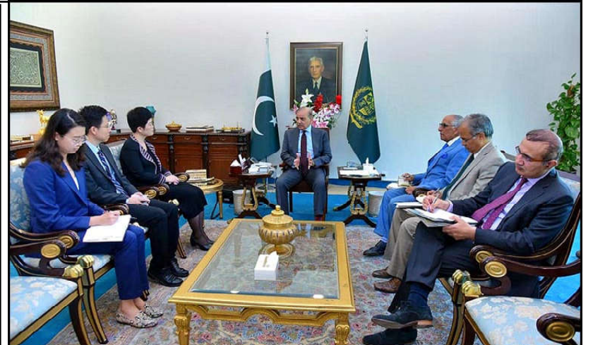
ISLAMABAD: Pang Chunxue, The Chargé d'Affaires of the Chinese Embassy in Pakistan calls on Prime Minister Muhammad Shehbaz Sharif.

Pakistan Wheelchair Cricket President Rukhsana Rajput informed the Governor that the first Asia Cup was won by the national team in 2019 and they would leave for Nepal to play the second Asia Cup in September.