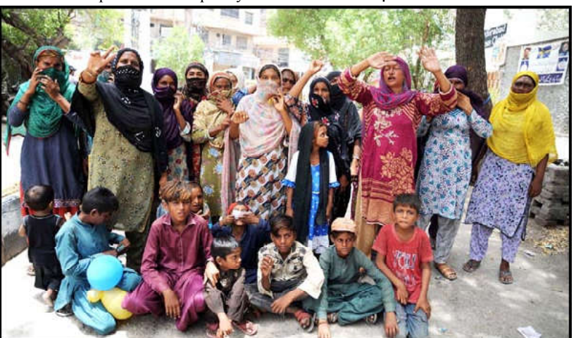
HYDERABAD: Women and children belong to Oadh tribe hold a protest against demolishing their makeshifts during an anti-encroachment drive on Autobahn road.