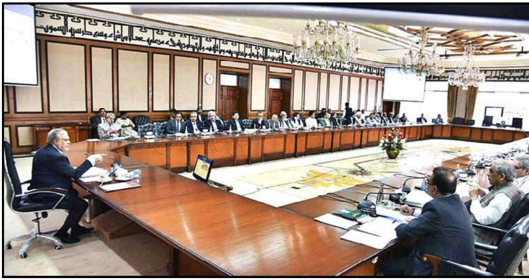
ISLAMABAD: Federal Minister for Finance and Revenue Senator Mohammad Ishaq Dar chaired the meeting of the Executive Committee of the National Economic Council (ECNEC).