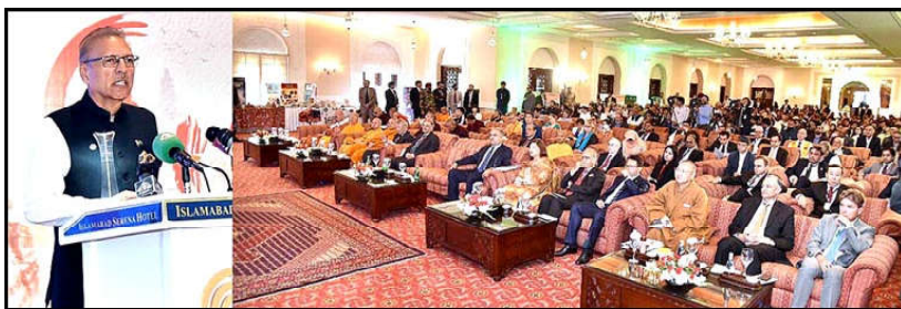
ISLAMABAD: President Dr. Arif Alvi addressing the International Gandhara Symposium 2023.

The Finance Minister said the country will witness more positive developments in the days ahead and it will now move towards growth trajectory. I hope the economic situation in Pakistan will soon grow stable. Improvement has already come therein, he remarked. APP adds: Prime Minister Shehbaz Sharif on Tuesday extended his "deep gratitude" to the leadership and brotherly people of the Kingdom of Saudi Arabia for the US$2 billion deposit with the State Bank of Pakistan. "I would like to especially thank my brother Saudi Crown Prince and Prime Minister His Royal Highness Mohammed bin Salman for ensuring this financial support to Pakistan," he wrote on Twitter. The prime minister hoped that the deposit would strengthen Pakistan's foreign exchange reserves and reflected the growing confidence of the brotherly countries and the international community in the country's economic turnaround.