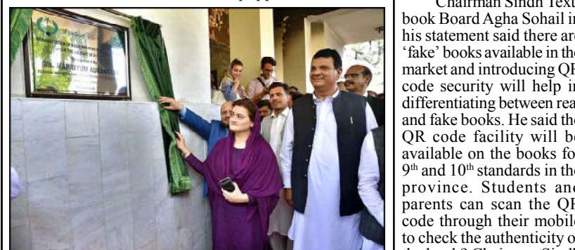
PESHAWAR: Federal Minister for Information and Broadcasting Ms. Marriyung Aurangzeb inaugurating Rehabilitation of Radio Pakistan Peshawar building after the incident of 9th May.

The PTI workers, she alleged, had desecrated and harmed the monuments of martyrs on the behest of their leader, who now wanted to harm Pakistan as a whole. "Israel is supporting Imran Khan today and what does that mean?" she quipped.