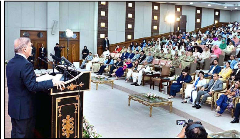
ISLAMABAD: Prime Minister Muhammad Shehbaz Sharif addresses the ceremony of Prime Minister's Initiatives on Women's Empowerment.

The prime minister said that the country's womenfolk were an effective and energetic segment, playing effective roles in families and society as mothers, sisters, wives and daughters. He observed that in the last 75 years, the required opportunities for the women empowerment were not sufficient and stressed upon making of further efforts for securing women rights.