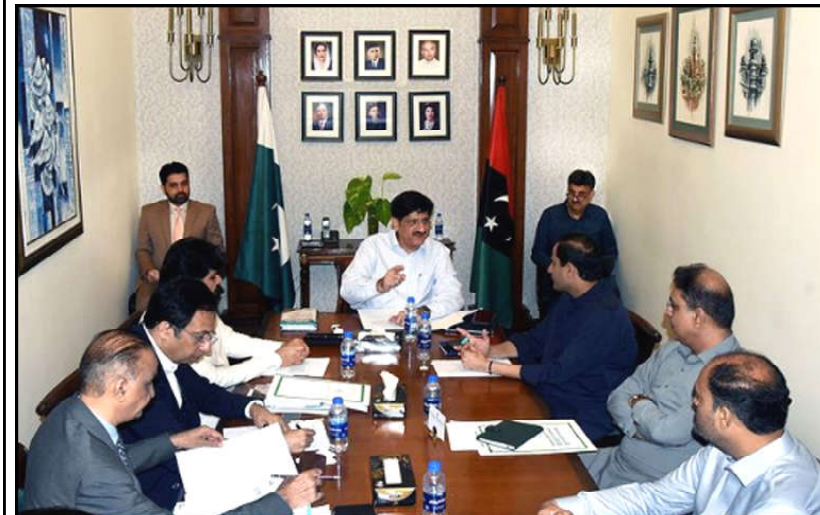
KARACHI: Sindh Chief Minister Syed Murad Ali Shah meets with Mayor and Deputy Mayor of Karachi at CM House.