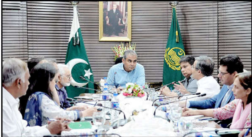
LAHORE: Caretaker Chief Minister Punjab Mohsin Naqvi presides over the meeting to review matter of Social Security Hospitals.