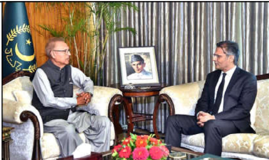
ISLAMABAD: Attorney General for Pakistan, Mansoor Usman Awan called on President Dr. Arif Alvi at Aiwan-e-Sadr.

PESHAWAR (APP): Awami National Party (ANP) leader Aimal Wali Khan on Monday expressed concerns over unrest and armed conflict in district Kurram over land dispute. In a statement issued here, he demanded of the provincial government and district administration.