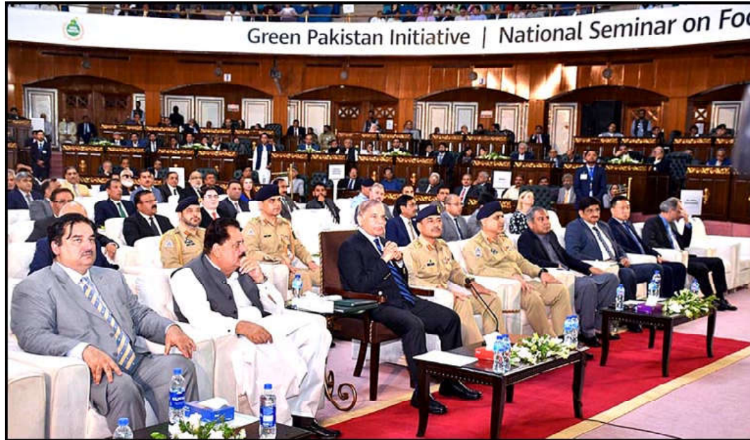
ISLAMABAD: Prime Minister Muhammad Shehbaz Sharif and other dignitaries at the inaugural ceremony of Green Pakistan Initiative.

Ph: 0300-3898091 Vol: 05. No. 203 Zil Hajj 22, 1444 AH Tuesday July 11, 2023 Pages 04 Price Rs. 12.00