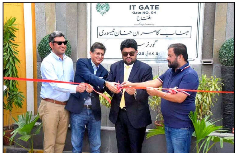
KARACHI: Governor Sindh Kamran Khan Tessori cutting ribbon to inaugurate IT Gate at Governor House.