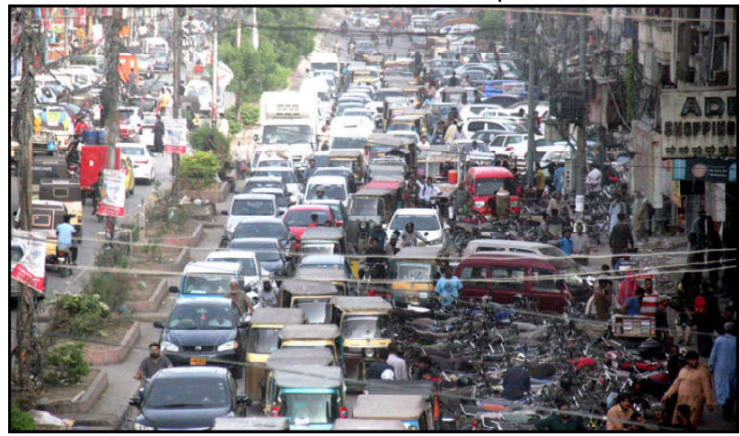
KARACHI: A view of the massive traffic jam at Kareemabad area due to the over parking of vehicles and bikes along the road side, which is the open sign of the negligence of traffic authority.