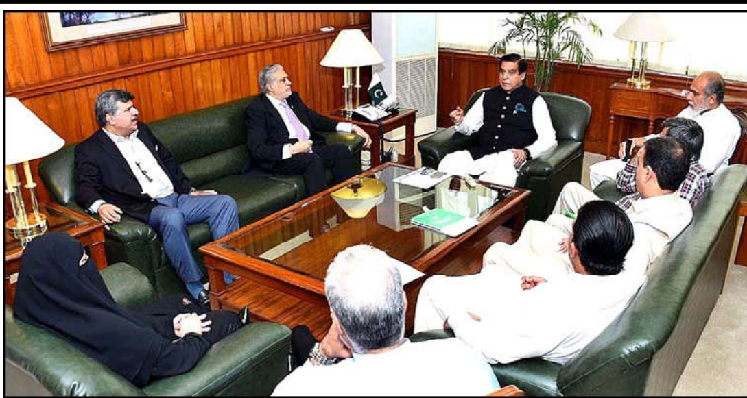
ISLAMABAD: Speaker National Assembly, Raja Pervaiz Ashraf in a meeting with Federal Minister for Finance and Revenue, Senator Mohammad Ishaq Dar at Parliament House.

both have brought unprecedented opportunities for progress, economic growth, and global connectivity. However, he emphasized the harmonization in digital policies and standards by stronger collaboration through multilateral forums. Ahsan Iqbal said that digital connectivity has revolutionized communication and collaboration in industrial sectors.