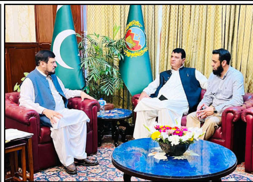
PESHAWAR: Advisor to PM Engineer Ameer Muqam and Special Assistant to PM Attaullah Tarar meeting with Khyber Pakhtunkhwa Governor Haji Ghulam Ali.

FAISALABAD (APP): A minor girl received burn injuries during house-ablaze incident in the area of Sargodha Road police station. Rescue 1122 spokesman said here on Monday that a house situated at Mohallah Shah Sargodha Road caught fire due to short-circuiting. The fire engulfed the entire surroundings and burnt precious house luggage present on the spot. Receiving information, fire fighters of Rescue 1122 rushed to the spot and brought the fire under control after hectic efforts of many hours.