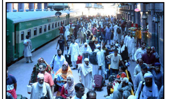
LAHORE: A view of the large number of people at Railway Station as the population of the country is increasing day by day along with problems, for which 11 every year world observed World Population Day to raise awareness of global population issues.