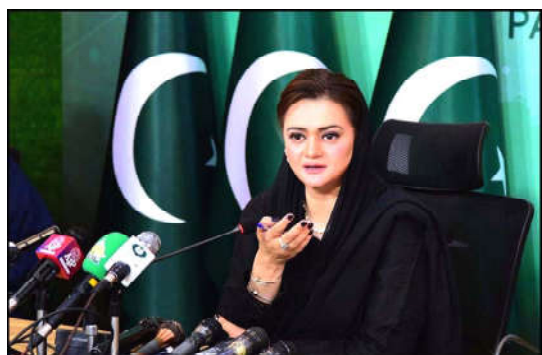
ISLAMABAD: Federal Minister for Information and Broadcasting, Ms. Marriyum Aurangzeb addressing a press conference.

ISLAMABAD (APP): Minister for Information and Broadcasting Marriyum Aurangzeb Monday said the May 9 incidents had only benefited the "enemy", but it was the nation who ultimately emerged victorious with the foiling of conspiracy against Pakistan. Ironically, she said, the "foreign agent", who masterminded the May 9 tragedy made a tweet the other day asking who benefited from the May 9 tragedy. "Only the enemies of the country benefited from the acts of vandalism and arson, but the people of Pakistan are the ultimate winners as the conspiracy against the country's integrity has been foiled," she said while addressing a press conference. The minister was responding to a question posed by the Pakistan Tehreek-e-Insaf (PTI) chairman on his Twitter handle asking who was benefited from the May 9 incidents of vandalising public and private properties, desecrating memorials of martyrs, and burning of ambulances, schools and mosques by the PTI workers.