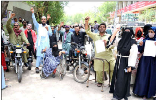
HYDERABAD: Disabled persons hold a protest rally against non issue of offer letters and non implement on 5% disabled quota in Government departments, in City.

ISLAMABAD (APP): The Fitch Ratings has upgraded Pakistan's Long-Term Foreign-Currency Issuer Default Rating (IDR) to 'CCC' from 'CCC-', indicating a positive development towards the betterment of the country's economy Federal Minister for Finance and Revenue, Senator Mohammad Ishaq Dar in a tweet said it was another positive development towards current economic revival journey. He congratulated Prime Minister, nation, government allies and economic team for this achievement. "Global Rating Agency 'Fitch' upgrades Pakistan's Long Term Foreign-Currency rating to CCC from IDR (Issuer Default Rating)...Another positive news towards current economic revival journey... Congratulations to PM @CMShehbaz, the Nation, Govt Allies & Economic Team," the minister tweeted. The rating agency has identified key indicators that contributed to the positive development rating for the country which include improvement in easing external financing risks. It says the upgrade reflects Pakistan's improved external liquidity and funding conditions following its Staff-Level Agreement (SLA) with the International Monetary Fund (IMF) on a nine-month Stand-by Arrangement (SBA) in June.