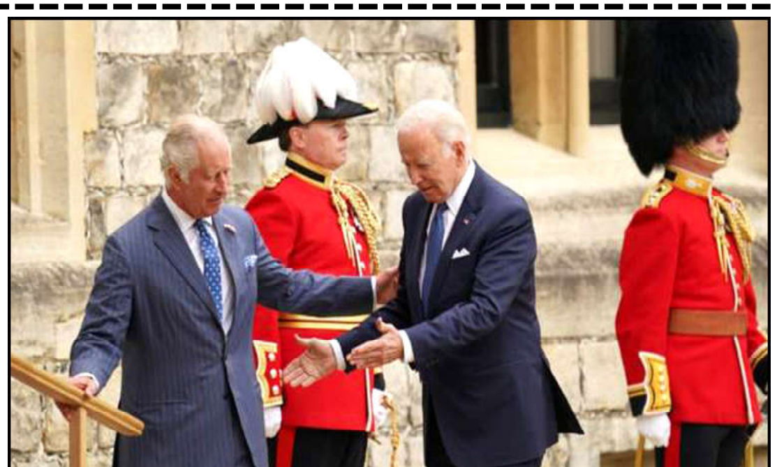
Joe Biden was welcomed by King Charles to Windsor Castle for his first meeting with the monarch since he was officially crowned.