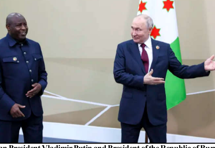
Russian President Vladimir Putin and President of the Republic of Burundi Evariste Ndavishimive meet on the sidelines of the Russia Africa Summit in

war crimes prosecution of Russia by blocking the sharing of U.S. military intelligence with