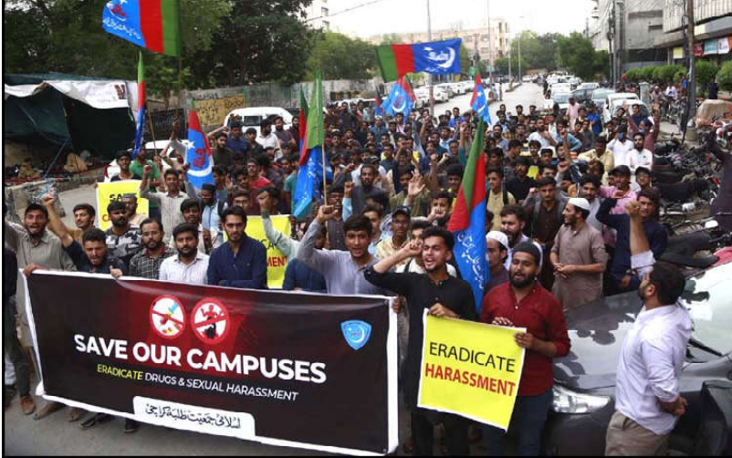
KARACHI: Members of Islami Jamiat Tulba are holding protest demonstration for eradicate drugs and sexual harassment from colleges and universities, at Karachi press club.