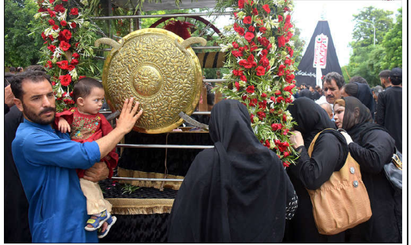
ISLAMABAD: Mourners touching tazia during 9th Muharram-ul-Haram at G-6 Imam Bargha.