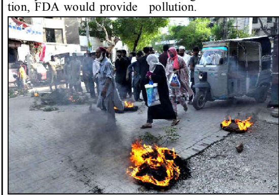
HYDERABAD: Residents of Saddar area are burn tires and blocked road as they are holding protest demonstration against non-installation of electricity transformer since 3 days, in Hyderabad.