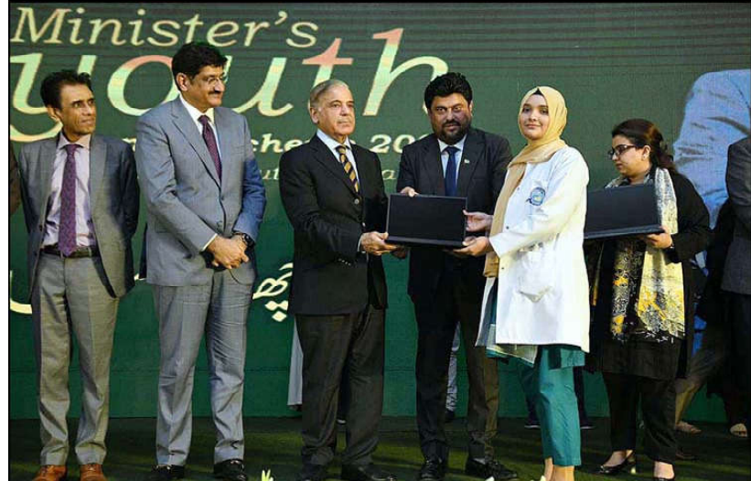
KARACHI: Prime Minister Muhammad Shehbaz Sharif distributes laptops among the high achievers of public sector universities of Sindh under PM's Youth Laptop Scheme 2023 at Governor House.