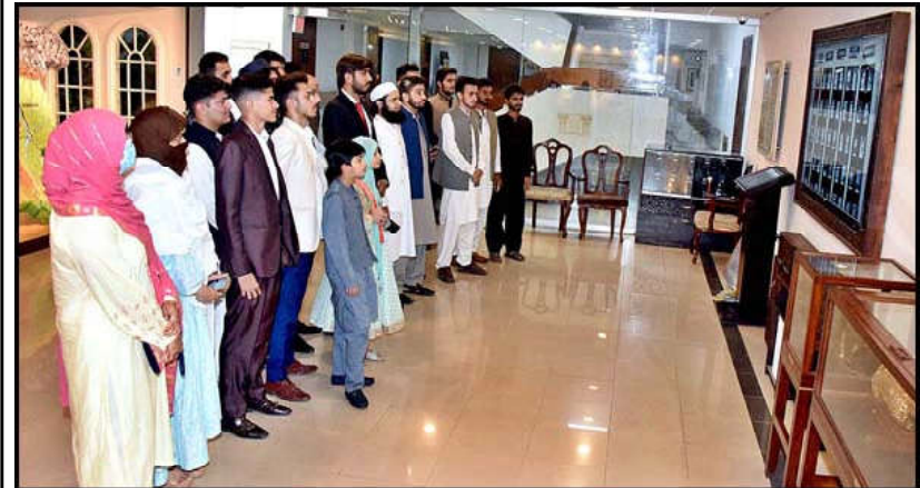
ISLAMABAD: A delegation of WEFIXERS Organization, Islamabad visiting Senate Museum at Parliament House.

ISLAMABAD (INP): Pakistan has dropped from 38.1 in 2006 to 26.1 in 2022 in the ranking on the Global Hunger Index (GHI-2022) and is at 99th place in the list of 121 countries. According to the report, although Pakistan's ranking has improved, the hunger level is considered serious. Zero score indicates a country has no issue of hunger. The report said 16.9 per cent population in Pakistan was undernourished. The death rate of children under the age of five years is 6.5 per cent and 7.1 per cent are wasted, while 37.6 per cent children under five are stunted.