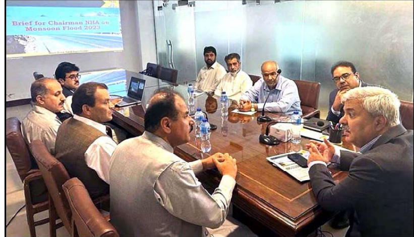
Federal Secretary Communications and Chairman NHA Captain (R) Muhammad Khurram Agha is giving instructions to deal with the flood situation in Balochistan.

the only way to make the nation progress," the prime minister told the ceremony also attended by Sindh governor, chief minister, federal ministers, MQM leaders, provincial ministers, diplomats, and representatives of bankers. He said youths from across the country needed to be equipped with education and provided maximum resources for country's swift progress. Mentioning the launch of the capital venture initiative for freelancers on Tuesday, he lauded the youngsters' talent for developing the projects like converting banana peels into different products and drones for agricultural use. He said it would be sheer injustice if the talented youths were not provided with the required resources as they were the guarantee for the country's prosperity. He said the incumbent government was in the process of distributing 100,000 laptops announced for the fiscal 2022-23 while the provision for another 100,000 laptops had been made in the budget 2023-24 which would be distributed purely on merit, without any nepotism. Prime Minister Shehbaz said the caretaker government should also ensure the merit in laptops' distribution keeping the excellence and enrollment in public sector universities as the only merit.