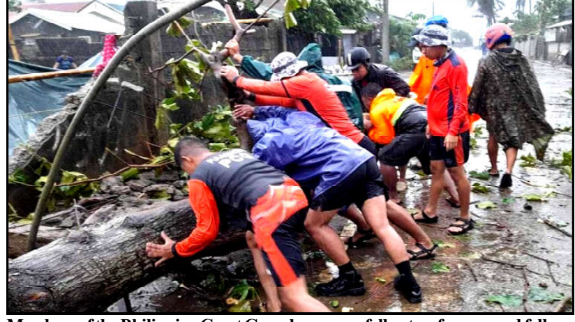
Members of the Philippine Coast Guard remove a fallen tree from a road following the onslaught of Typhoon Doksuri in Buguey, Cagayan province, Philippines.

Monitoring Desk BEIJING: China's sharp-tongued foreign minister, Qin Gang, was something of an avatar for nationalist Communist Party leader and President Xi Jinping, warning of "conflict and confrontation" with the U.S., the stakes of which could be the "future of humanity." Now, Qin has been dismissed from office in the biggest political tumult to strike China in a decade. Qin's departure was announced Tuesday after a month-long disappearance from public view, sparking rumors of personal scandals or friction within the top party echelons. He was absent from key meetings as the U.S. sent Secretary of State Antony Blinken and other officials to Beijing. It also comes during economic challenges and poor relations with the United States and other nations that China relies on for economic development but is also seeking to push aside in its drive to overcome the Western-led economic order.