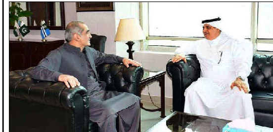
ISLAMABAD: Ambassador of Kingdom of Saudi Arabia to Pakistan, Nawaf Bin Said Al-Malki call on Federal Minister for Aviation and Railways, Khawaja Saad Rafique at Ministry of Aviation.

ISLAMABAD (APP): Minister for Planning, Development and Special Initiatives Professor Ahsan Iqbal on Wednesday stressed for collective efforts to tackle the challenge what he called 'hyper malnutrition', affecting the physical and mental health of children. "After last year's floods; the challenge of malnutrition is no longer malnutrition but it has become the challenge of hyper malnutrition as the flood-calamity hit the poorest of the poor," the minister was addressing the launching ceremony of the National Multisectoral Nutrition Programme to reduce stunting and other forms of malnutrition. He said the federal government had launched this initiative which would be implemented in collaboration with all stakeholders including provinces, donors and active community. Terming the nutrition-related issues 'alarming,' the minister said "Today is the age of knowledge revolution which requires creativity and innovation driven by cognitive skills. And it all depends on children's nutritional health."