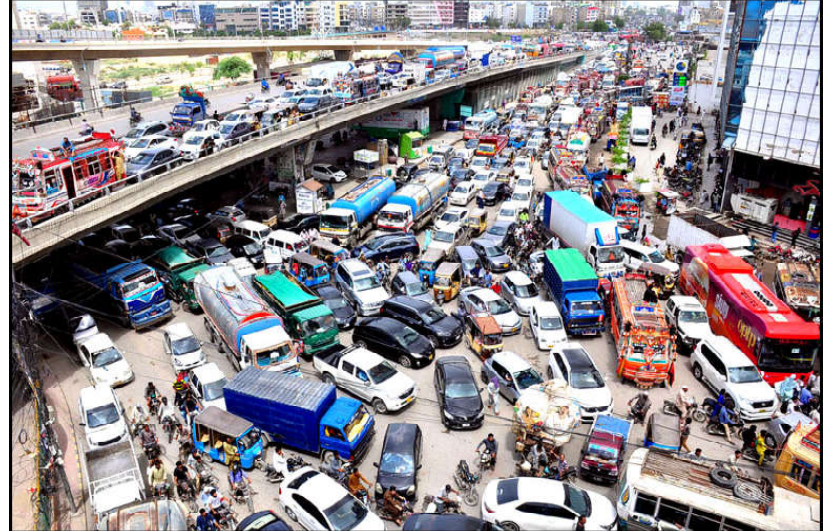
KARACHI: A view of the massive traffic jam at Qayyumabad area due to the closure of the road because of the flooded conditions on Korangi road in Provincial Capital.

PESHAWAR (INP): Khyber Pakhtunkhwa Caretaker Minister for Excise and Narcotics Control, Haji Manzoor Khan Afridi has said that education will play a key role in the development of the merged districts and a new era of development will begin in the region by paying special attention to it. He expressed these views while discussing the education sector projects in merged districts during a meeting with Education Adviser Rahmat Salam Khattak. Deputy District Education Officer District Khyber Shahid Ali Khan and other officials participated in the meeting. The provincial minister said that the caretaker government is taking practical steps for the promotion of education and besides the provision of facilities in educational institutions; scholarships are also being paid to both boys and girls students.