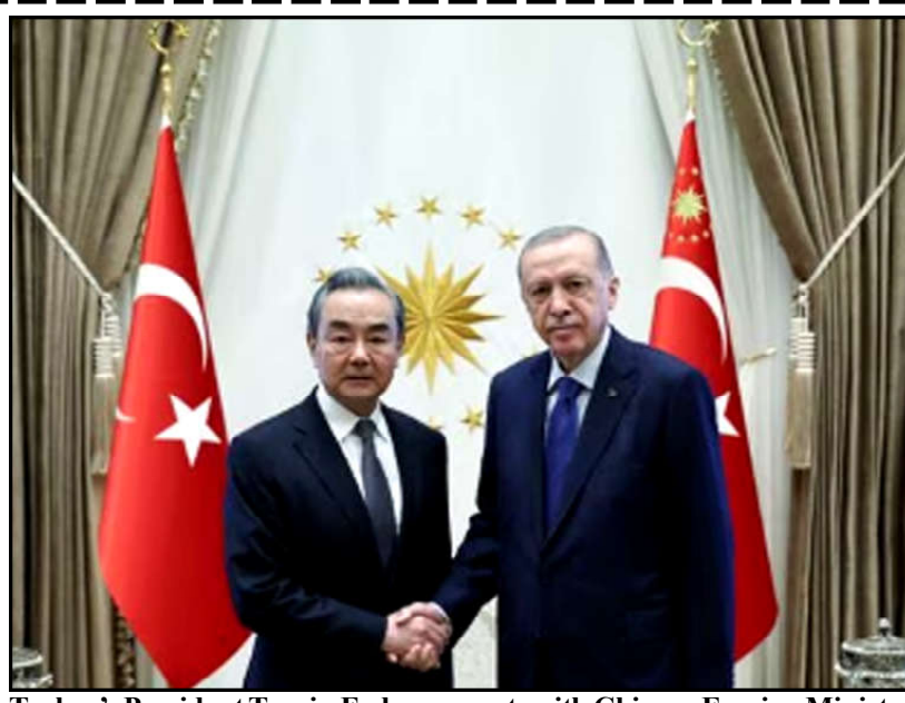
Turkey's President Tayyip Erdogan meets with Chinese Foreign Minister Wang Yi at the Presidential Palace in Ankara, Turkey.