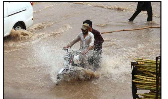
ISLAMABAD: A motorcyclist pass through rain water at Ghouri Town.