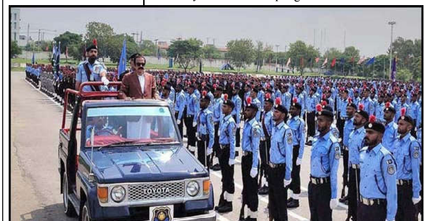
ISLAMABAD: Interior Minister Rana Sana Ullah Khan reviewing the parade during the passing out ceremony of 38th Basic Recruit Course at Police Lines.

link, China's state-run media reported on Wednesday. Zhao, chairman of the National People's Congress (NPC) Standing Committee, hailed Pakistan for giving firm support to China on issues concerning China's core interests over a long period of time. He said China is willing to strengthen strategic coordination with Pakistan and promote the building of an even closer China-Pakistan community of shared future in the new era.