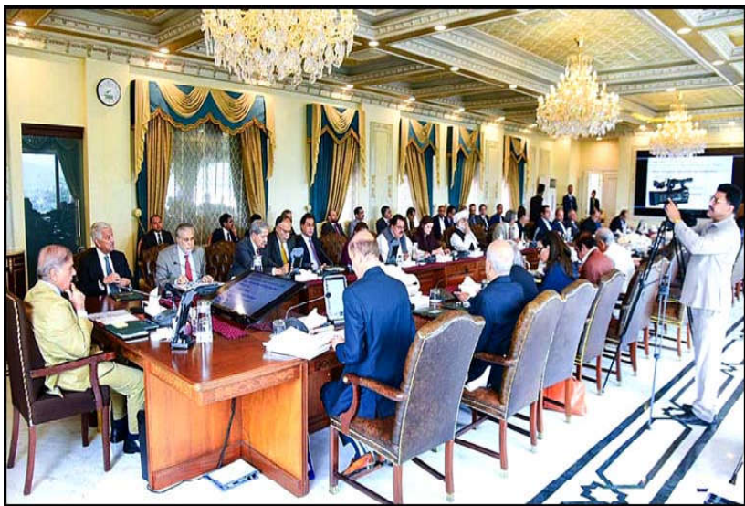
ISLAMABAD: Prime Minister Muhammad Shehbaz Sharif chairs Federal Cabinet Meeting.

civil court to protect the private documents/data of the users and redress the grievances of the complainants. The federal cabinet also gave assent to the draft amendment bill of the Investment Board Ordinance 2001 for the promotion of foreign investment in Pakistan. The amendment will empower the Special Investment Facilitation Council (SIFC) as well as lay down its basic structure, working procedures, and cooperation mechanisms with various ministries and provincial governments. After the law is passed, the SIFC will ensure the speedy implementation of foreign investment projects in the country.