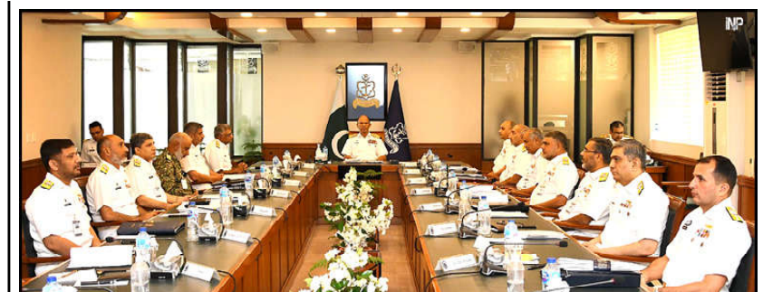
ISLAMABAD: Chief of the Naval Staff Admiral Muhammad Amjad Khan Niazi chairing the Command & Staff Conference of Pakistan Navy held at Naval Headquarters.

of investors and the business community was the greatest achievement. He said the government would miss no opportunity for economic recovery, restoration of confidence of international partners, investors and the business community. He told the meeting that a Special Investment Facilitation Council had been established for foreign direct investment in Pakistan. He acknowledged that the business community did not only provide employment opportunities in the country but also becomes a source of foreign exchange by enhancing exports.