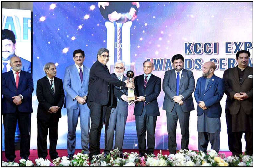
ISLAMABAD: Prime Minister Muhammad Shehbaz Sharif presenting awards to highest exporters at "KCCI Exports Trophy Awards Ceremony 2022-23".

Vol. XIII No. 225 Reg. mails-B / ID-445 Thursday July 27, 2023, Muharramul Haram 08, 1445 A.H. Ph: 2158688, 2158997 Pages 4: Rs. 12