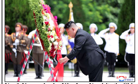
North Korean leader Kim Jong Un visits the Chinese People's Volunteer Army Martyrs' cemetery in this photo released by North Korea's Korean Central News Agency (KCNA).

Monitoring Desk ST. PETERSBURG: Some African leaders arrived in Russia on Wednesday for a summit with President Vladimir Putin as the Kremlin seeks more allies amid the fighting in Ukraine. Putin has billed the two-day summit that opens Thursday in St. Petersburg as a major event that would help bolster ties with a continent of 1.3 billion people that is increasingly assertive on the global stage. On Wednesday, Putin met separately with Ethiopia's Prime Minister Abiy Ahmed, and said Russia will more than triple the number of Ethiopian students it hosts and cover their education costs. Later in the day, Putin is set to hold talks with Egyptian President Abdel Fattah el-Sisi. Africa's 54 nations make up the largest voting bloc at the United Nations and have been more divided than any other region on General Assembly resolutions criticizing Russia's actions in Ukraine. It's the second Russia-Africa summit since 2019, and the number of heads of states attending shrank from 43 then to 17 now because of what the Kremlin described as a crude Western pressure to discourage African nations from attending it. Kremlin spokesman Dmitry Peskov deplored "unconcealed brazen interference by the U.S., France and other states through their diplomatic missions in African countries, and attempts to put pressure on the leadership of these countries in order to prevent their active participation in the forum."