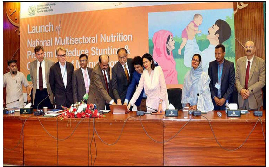
ISLAMABAD: The Planning Minister Professor Ahsan Iqbal launches "National Multi-sectoral Nutrition to Reduce Stunting & Other Forms of Malnutrition" worth Rs8.5 billion under Pakistan Nutrition Initiatives (PANI).

State Bank of Pakistan, the daily added. The Kingdom has always stood by Pakistan through thick and thin. But Pakistan must stand on its own two feet. The Special Investment Facilitation Council offers a viable pathway in this respect. Its establishment indicates that Pakistan's civilian and military leaders understand the risk of dependency on foreign loans. And they are preparing to lay down a solid economic base through attracting investment from friendly countries. The article added that political instability results in frequent changes of government and the consequent lack of continuity in economic policies. These issues have plagued major investment commitments by Saudi Arabia, the UAE and Qatar in the recent past. While visiting Islamabad in 2019, Crown Prince Mohammed bin Salman pledged $20 billion of investment in the energy, minerals and mining sectors. Likewise, the UAE and Qatar have committed $9 billion. But these pledges are yet to materialize due to cumbersome procedures and structural impediments. Going forward, the Comprehensive Economic Partnership Agreement with the UAE needs to be emulated in Pakistan's trade links with Saudi Arabia and the other GCC members. Pakistan's skilled manpower in the IT and services sectors is a perfect match for the economic transformations taking place in the Gulf, particularly Saudi Arabia.