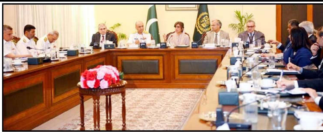
ISLAMABAD: Minister of State for Foreign Affairs Hina Rabbani Khar speaking at annual talks between Ministry for Foreign Affairs and Pakistan Naval Headquarters.