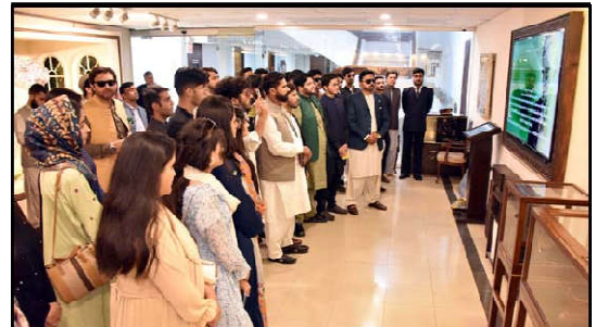
A delegation of Pakistan Youth Parliament visiting Senate Museum at Parliament House, Islamabad.

WASHINGTON (INP): Pakistan's Ambassador to United States Masood Khan has stated education has been a robust link between Pakistan and United States from 1950s till today. He was addressing a batch of 25 visiting Pakistani students under 'Study of the US Institutes' program at Embassy of Pakistan Washington DC. He said number of Pakistani students increased to 8000, registering 17% increase last year and we must have more students here in the United States. He said that this is a process of cross fertilization and intellectual capabilities recognize no boundaries. Highlighting imitation, emulation, and innovation as three key stages for societal progress, he expressed the hope that extraordinary experience would empower the visiting students to replicate and adopt what they have observed and experienced during their stay in the United States. He said this short course should inspire you to come back, to interface our two countries, to enrich shared intellectual heritage of our two nations," he said.