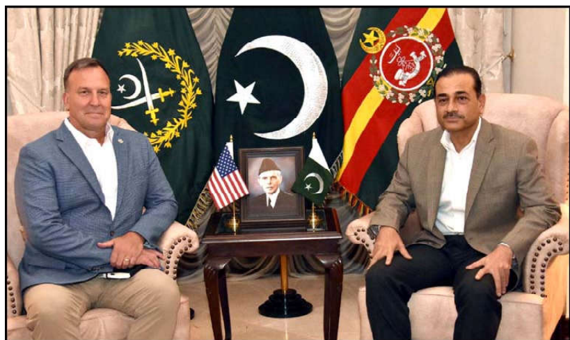
RAWALPINDI: Chief of Army Staff (COAS), General Syed Asim Munir exchanging views with General Michael Erik Kurilla, Commander United States (US) CENTCOM during meeting held at General Headquarters (GHQ) in Rawalpindi.