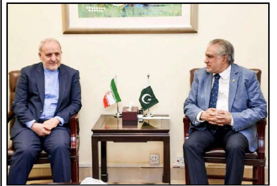
Ambassador of the Islamic Republic of Iran to Pakistan, H.E. Mr. Reza Amiri Moghaddam calling on Finance Minister Senator Mohammad Ishaq Dar at Finance Division, Islamabad

Collaboration in the banking sector between the two countries also came under discussion as the heads of central banks of the two countries would meet next week in Pakistan to discuss and sort out the issues related to banking cooperation.