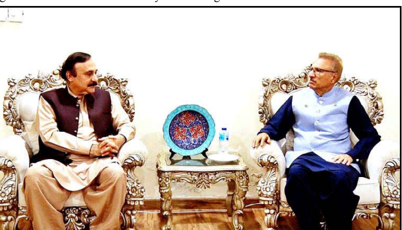
ISLAMABAD: President Dr. Arif Alvi offering his condolences over the sad demise of the son of Dr. Tariq Fazal Chaudhary at his residence.

The minister said that for the first time, the gov-