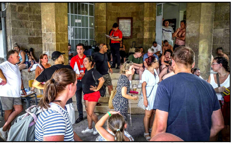
Tourists are seen after being evacuated following a wildfire on the island of Rhodes, Greece.