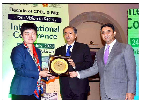
ISLAMABAD: The two-day International conference, organized by the Ministry of Planning Development & Special Initiatives in collaboration with Embassy of the Republic of China, kicked off on Monday with the theme "Decade of China Pakistan Economic Corridor (CPEC) & Belt & Road Initiative (BRI) from vision to reality to mark the 10-year celebrations of CPEC.

The National Disaster Management Authority (NDMA) data stated that so far 133 deaths and 215 injuries to people have been reported, which includes 21 women and 55 children. As many as 368 houses have also been damaged as torrential rain continued to play havoc across the country, it added. Punjab has the most number of people who died where 65 people were killed in the heavy rains and 35 lost their lives in Khyber Pakhtunkhwa (KP), six were killed in Balochistan, NDMA report read.