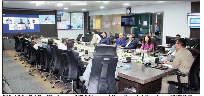
ISLAMABAD: Chairman NDMA presiding Special Session of NEOC on monsoon situation.