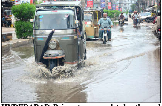
HYDERABAD: Rain water accumulated on the road at Latifabad.