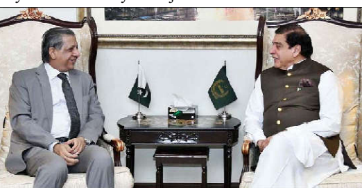
The speaker said resolving the problems being faced by the lawyers of Gujranwala Bar Council had been his top priority. He said that the role of the lawyers' community was of key importance for ensuring rule of law, supremacy of the constitution and promotion of democracy in the country.

The meeting discussed the issues being faced by the lawyers' community in Gujranwala.