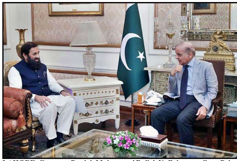
LAHORE: Governor Punjab Muhammad Baligh Ur Rehman calls on Prime Minister Muhammad Shehbaz Sharif.

Deputy Commissioner on Monday. Mohsin Naqvi, however, expressed displeasure over the poor cleanliness arrangement and instructed officials concerned to ensure cleanliness arrangements. The chief minister also ordered the widening of a door and its restoration to its original condition. He added that all steps would be taken for the rehabilitation of the ancient fort. On this occasion, Chief Secretary, IGP, Commissioner Multan and many other officers were also present.