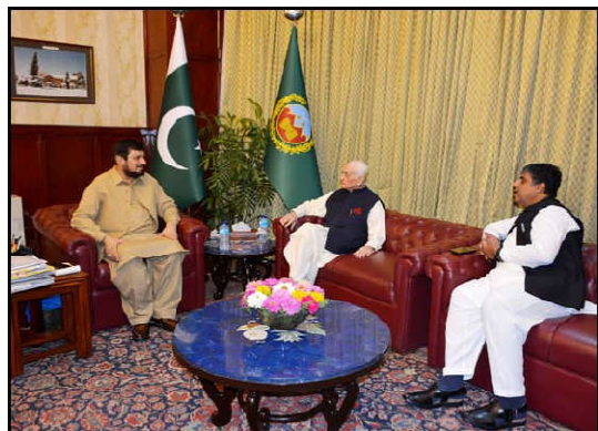
PESHAWAR: Khyber Pakhtunkhwa Governor Haji Ghulam Ali, Caretaker Chief Minister KP and Chief Secretary KP Nadeem Aslam Chaudhary discussing the rehabilitation efforts and losses in Chitral owing to heavy rains in the area.

ISLAMABAD (APP): Minister for Law and Justice Senator Azam Nazeer Tarar on Monday said that the government was committed to mitigate the hardships of the people of Gilgit Baltistan and extending every possible cooperation in that regard. He said that to attract investment in energy sector in order to materialize the full potential of GB resources for its people, the PPIB Act and the Power policy of 2015 would be extended to the province. The minister chaired a meeting to finalize power generation policy for GP. Advisor to Prime Minister on Kashmir Affairs and Gilgit Baltistan Qamar Zaman Qaira, Secretary Water And Power Gilgit Baltistan, Secretary Kashmir Affairs, representatives from power division, and Secretary Law And Justice Division also attended the meeting. The participants shared their insightful ideas for bridging the demand and supply gap that the Gilgit Baltistan region was currently experiencing.