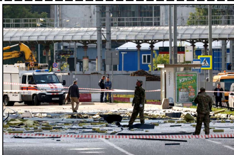
Members of the security services investigate the site of a damaged building following a reported drone attack in Moscow, Russia.