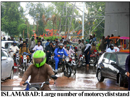
under the Rawal bridge during rain.

Earlier, a curative review reference had been filed by the PTI against Justice Isa. However, the present government did not view petition against the choose to follow the case.