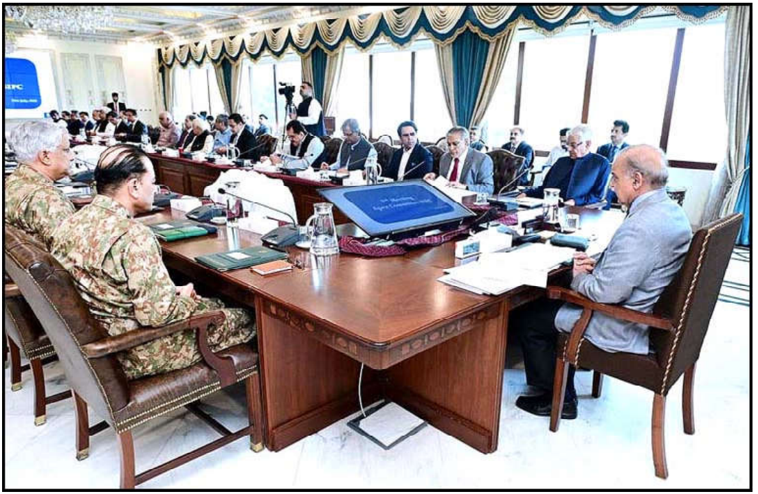
ISLAMABAD: Prime Minister Muhammad Shehbaz Sharif chairs the 2nd meeting of Apex Committee

Vol. XIII No. 221 Reg. mails-B / ID-445 Saturday July 22, 2023, Muharramul Haram 03, 1445 A.H. Ph: 2158688, 2158997 Pages 4: Rs. 12