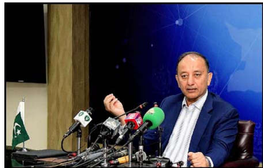
ISLAMABAD: Minister of State for Petroleum Dr. Musadik Malik addressing the press conference.

redressing grievances of the aggrieved tax-payers in the wake of maladministration of the tax functionalities of Federal Board of Revenue (FBR). "The helpline will fully ensure uninterrupted speedy and free-of-cost relief to the aggrieved taxpayers. In this regard, the FTO has launched a public awareness campaign to reach out the existing and prospective taxpayers for building their confidence to fulfill their national obligation by paying due taxes timely in national exchequer."