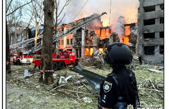
Emergency services personnel work at the site of a building that was damaged by a Russian missile strike, amid Russia's invasion of Ukraine.

Monitoring Desk MYKOLAIV: Russia jolted world grain markets with an escalation in the Black Sea, mounting a third straight night of air strikes on Ukrainian ports and issuing a threat against Ukraine-bound vessels to which Kyiv responded in kind. At least 27 civilians were reported hurt in the air strikes on the ports, which set buildings ablaze and damaged China's consulate in Odesa. The United States said Russia's warning to ships indicated Moscow might attack vessels at sea following Moscow's withdrawal this week from a U.N.-brokered deal to let Ukraine export grain. The signals that Russia was willing to use force to reimpose its blockade of one of the world's biggest food exporters set global prices soaring. Moscow says it will not participate in the year-old grain deal without better terms for its own food and fertiliser sales. The United Nations says Russia's decision threatens food security for the world's poorest people. Kyiv is hoping to resume exports without Russia's participation. But no ships have sailed from its ports since Moscow pulled out of the deal on Monday.