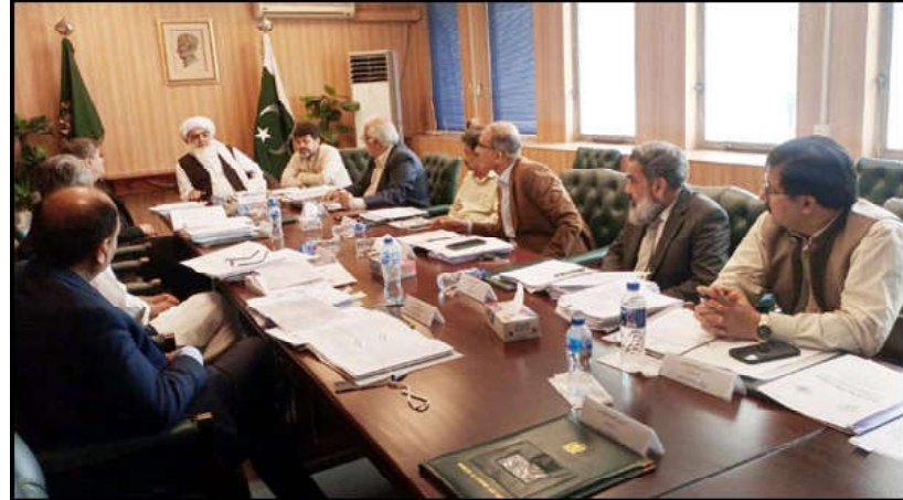
Maulana Abdul Wasay, Federal Minister for Housing and Works chaired executive board meetings of the Pakistan Housing Authority Foundation (PHAFA) and Federal Government Employees Housing Authority (FGEHA) in Islamabad