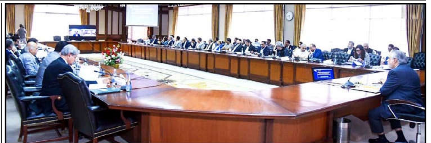
ISLAMABAD: Federal Minister for Finance and Revenue, Senator Mohammad Ishaq Dar chaired the meeting of the Economic Coordination Committee (ECC) of the Cabinet.

The three top-trading companies were WorldCall Telecom with 185,190,828 shares at Rs 1.43 per share; Bank of Punjab with 19,500,000 shares at Rs 4.20 per share and K-Electric with 15,889,256 shares at Rs 2.01 per share. Sapphire Fiber witnessed a maximum increase of Rs 61.00 per share price, closing at Rs 1295.00.