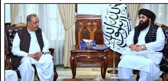
KABUL: Pakistan's Special Representative for Afghanistan Asif Durrani called on Taliban's interim Foreign Minister Amir Khan Muttaqi.

"Now the other countries have warned their officials not to share anything with Pakistani diplomats as it can be waved in public just like Imran disclosed the cipher in the public gathering. "We brought vote of no confidence against the PTI chief but we are still trying to bring the diplomatic relations back on track which he destroyed," he said.