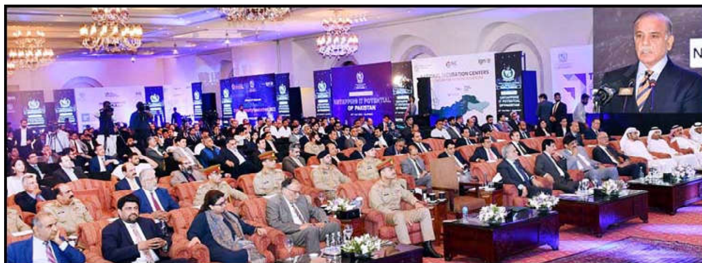
ISLAMABAD: Prime Minister Muhammad Shehbaz Sharif addresses the National IT seminar. Chief of Army Staff General Syed Asim Munir attended the seminar as guest of honor.

ISLAMABAD (APP): Prime Minister Muhammad Shehbaz Sharif addressed the National IT seminar. Chief of Army Staff General Syed Asim Munir attended the seminar as guest of honor.