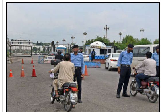
ISLAMABAD: Police Personnel stops the bikers at D-chowk, following the instructions as authorities imposes ban on the entry of Motorcycles to Constitution Avenue till 10th Muharram-ul-Harramin Federal Capital.