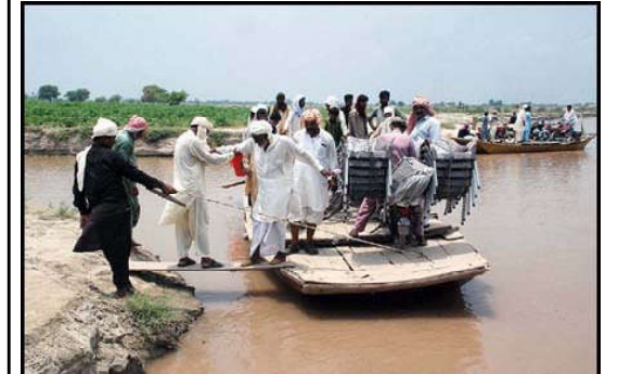
BAHAWALPUR: Floodwater forced people to travel in overloaded boats along with motorcycles in Patan Mangwani Mouza.

PESHAWAR (APP): Awami National Party Provincial President Aimal Wali Khan on Thursday expressed concerns over three consecutive terrorists' attacks on police and FC in the Khyber Pakhtunkhwa during the last three days. In a statement issued here he said that the suicide attack on FC vehicle in Hayatabad, target killing of two police officials in Regi area of Peshawar and suicide attack on Tehsil Compound in Bara district were strongly condemnable and matter of grave concern. He said that the terrorists were targeting police and the general public in Khyber Pakhtunkhwa with full force while the business community were also receiving calls for ransom due to which the residents of the province were feeling insecure. He said that strict action should be taken against those who were calling the terrorists fighters and brought them back under secret agreement, adding that exemplary punishment should be given to the perpetrators of the recent attacks. The ANP leader expressed grief over the losses of precious lives in the terrorist attack and sympathized with the bereaved families.