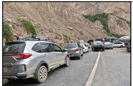
GILGIT: Massive traffic jam after land sliding near Shingus Paari at Juglot-Skardu Road (JSR).