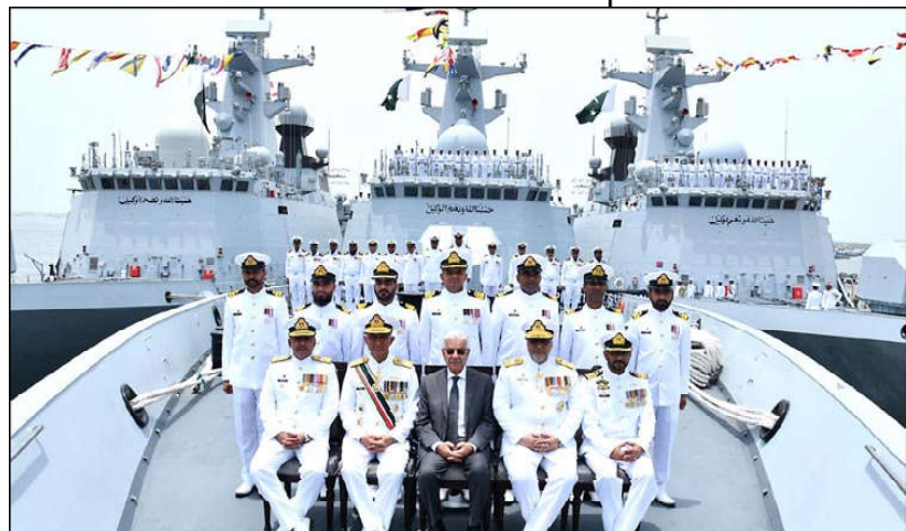
KARACHI: Federal Minister for Defence Khawaja Muhammad Asif in a group photo with Chief of the Naval Staff Admiral Muhammad Amjad Khan Niazi and ship crew during induction ceremony of two newly constructed PNS Shahjahan & Tippu Sultan held at Karachi.