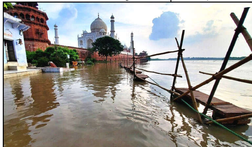
Flooded banks of river Yamuna along the Taj Mahal in Agra.

Monitoring Desk NAIROBI: Kenyan protesters hurled rocks at police, which responded with volleys of tear gas, in skirmishes in the country's major cities on Wednesday as three days of demonstrations against high costs of living and tax hikes kicked off. Two water-cannon trucks and dozens of riot police were stationed at the entrance to the Kibera neighbourhood in Nairobi, where protesters burned tires and engaged in running battles with security forces.