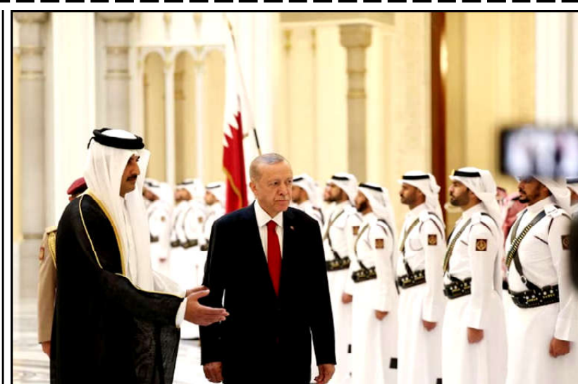
Turkish President Tayyip Erdogan and Qatar's Emir Sheikh Tamim Bin Hamad Al-Thani attend a welcoming ceremony in Doha, Qatar.

that Turkiye-Qatar relations reflect "deep-rooted" historical ties built on political and social foundations. "The current strategic partnership between the Republic of Turkiye and the State of Qatar is fruitful at all levels, and the two countries have similar approaches on most regional and international issues," it added. Economic and commercial cooperation between the two countries has witnessed steady growth over the past few years, it added. Qatari Emir Sheikh Tamim bin Hamad Al Thani welcomed Erdogan with an official ceremony.