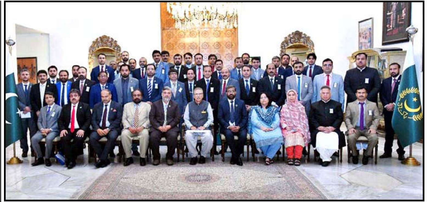
ISLAMABAD: President Dr. Arif Alvi in a group photo with the participants of the 37th Mid-Career Management Course, Quetta, at Aiwan-e-Sadr.