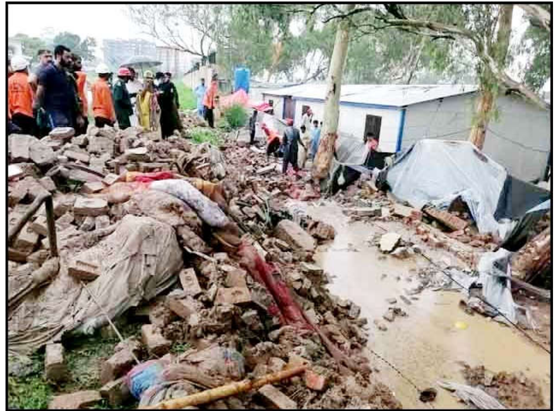
Rescue 1122 carrying out rescue operations as wall collapse during heavy rains in Islamabad

The president said the government authorities needed to take timely decisions to provide justice to the people. "Delay in decision making put negative impact on the service delivery and development of the country," he said.