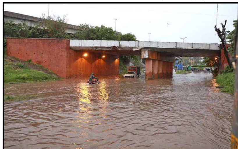
RAWALPINDI: Vehicles passing through rain water accumulated on road during torrential rain since last night.

of university autonomy, flexibility, and quality assurance, while also upholding academic freedom, relevance, and originality. One of the notable features of GEP-2023 is its liberal approach, which allows for intra-disciplinary admissions, enabling students to explore diverse academic fields within their chosen discipline. The policy recognises the value of both local and foreign expertise by introducing external evaluation conducted by indigenous Professors alongside foreign evaluators. This inclusive approach aims to ensure a comprehensive assessment of academic standards.