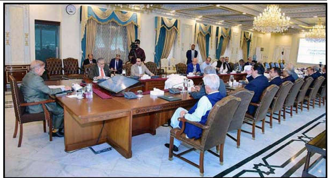
ISLAMABAD: Prime Minister Muhammad Shehbaz Sharif chairs a meeting to review the progress regarding the ongoing SOE reforms.