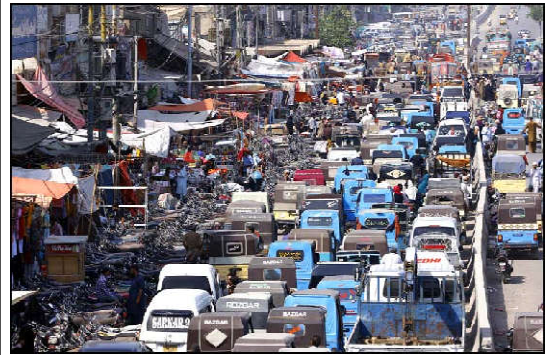
KARACHI: A large numbers of vehicles stuck in traffic jam due to negligence of traffic police staffs and illegal parking, at Liaquatabad in Karachi.