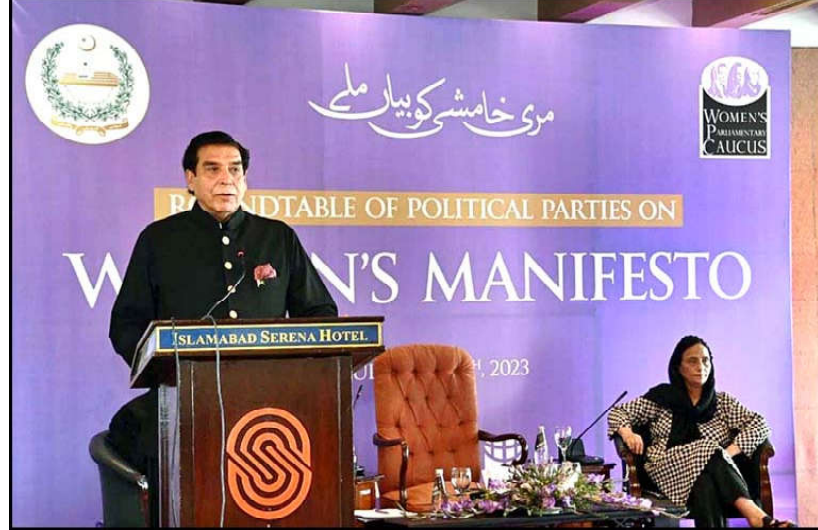
ISLAMABAD: Speaker National Assembly Raja Pervaz Ashraf addressing the closing ceremony of Roundtable of Political Parties on Women's Manifesto 2023 organized by WPC.

his message to the nation at the start of Hijri year 1445. Extending greetings to the nation and the whole Muslim Ummah, the prime minister prayed to Allah Almighty that the new Islamic year proved to be a year of peace, progress and prosperity for Pakistan as well as the Muslim world. He also prayed that the new year also brought ease to the lives of Muslims suffering across the world and people of Kashmir and Palestine got deliverance from oppression and achieve peace, progress and prosperity.