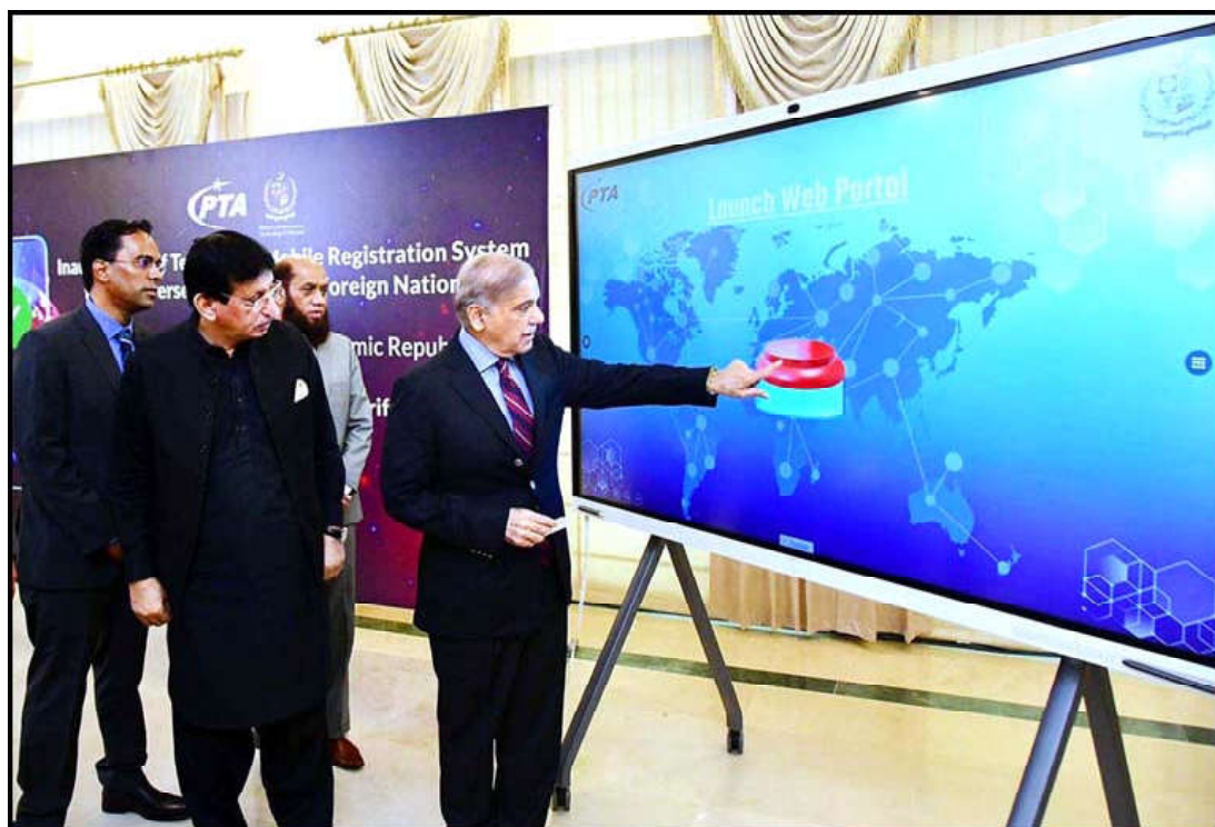
ISLAMABAD: Prime Minister Muhammad Shehbaz Sharif pushing a button to inaugurate temporary Mobile Registration System for overseas Pakistanis & Foreign Nationals.

Vol. XIII No. 218 Reg. mails-B / ID-445 Wednesday July 19, 2023, Zil Hajj 30, 1444 A.H. Ph: 2158688, 2158997 Pages 4: Rs. 12