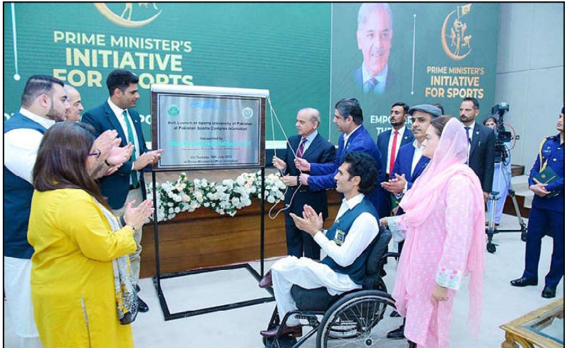
ISLAMABAD: Prime Minister Muhammad Shehbaz Sharif along with veteran sportspersons performing the soft launch of Pak first Sports University.

He said that both countries had commonality of views on important regional