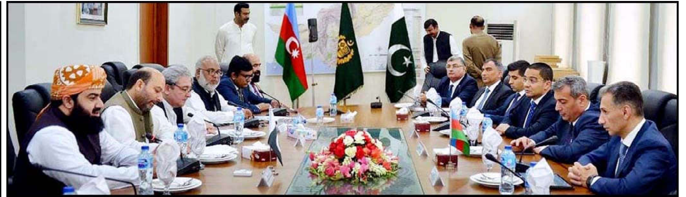
ISLAMABAD: Federal Minister for Communications, Maulana Asad Mahmood hosted a meeting with Azerbaijan's Minister for Transport, Mr. Rashad Nabiyev to discuss Road Trade Agreement.

In a meeting, they both expressed a shared commitment to enhancing bilateral relations and fostering stronger ties. Italian Ambassador expresses sorrow and regret over the tragic Greek ship incident during the meeting. The Interior Minister describes the loss of valuable lives of Pakistanis as an extremely mournful event. The Interior Minister emphasized that there will be no tolerance for the perpetrators involved and strict actions are being taken against them.