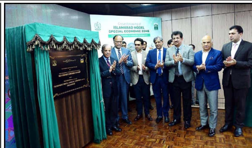
ISLAMABAD: Prime Minister Muhammad Shehbaz Sharif unveiling a plaque to mark the groundbreaking of Islamabad Model Special Economic Zone.

The price of 10 grams of 24 karat gold also increased by Rs 5,316 to Rs 189,472 from Rs 184,156 whereas the price of 10 grams 22 karat gold went up to Rs 173,683 from Rs 168,810, the All Sindh Sarafa Jewellers Association reported.