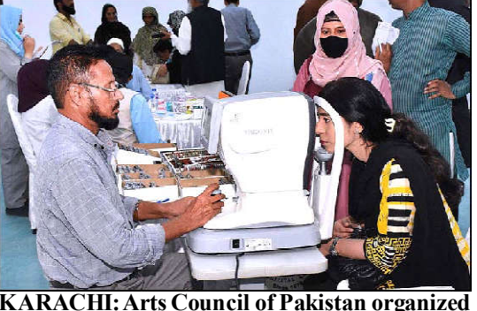
KARACHI: Arts Council of Pakistan organized "Free Medical Camp" at Haseena Moin Hall.

food Punjab, officers concerned attended the meeting. The Chief Secretary Punjab said that sale of flour and sugar at higher than the fixed rates is not acceptable, adding that those fleecing the consumers by creating artificial shortage of eatables will be dealt with strictly. He directed the officers to ensure stability in prices of flour and sugar through effective administrative measures. The Chief Secretary said that along with the prices of commodities, their supply and demand should also be closely monitored. He said that the special branch would provide support to the administration for taking action against hoarders.