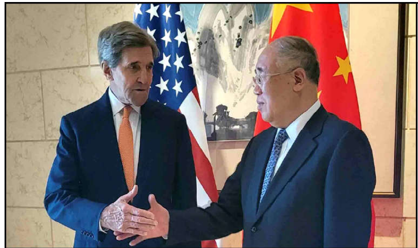
US Special Presidential Envoy for Climate John Kerry shakes hands with his Chinese counterpart Xie Zhenhua before a meeting in Beijing, China.