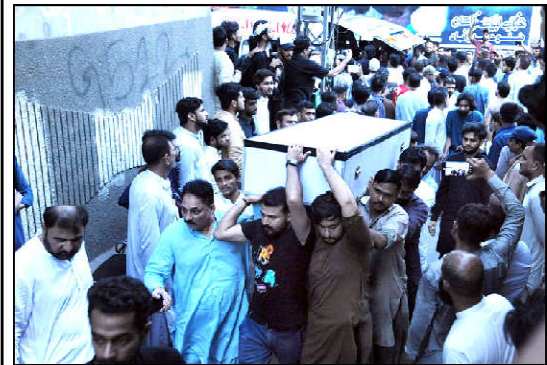
HYDERABAD: Relatives and others busy shifting the bodies of the 4 tourists to their home, who died in Gilgit due to a coach fall into a ditch.

PESHAWAR (APP): The Khyber Pakhtunkhwa police in its six months' performance report on Tuesday claimed to have arrested as many as 434 terrorists from across the province and killed 158 including absconders and terrorists with bounties in police encounters.