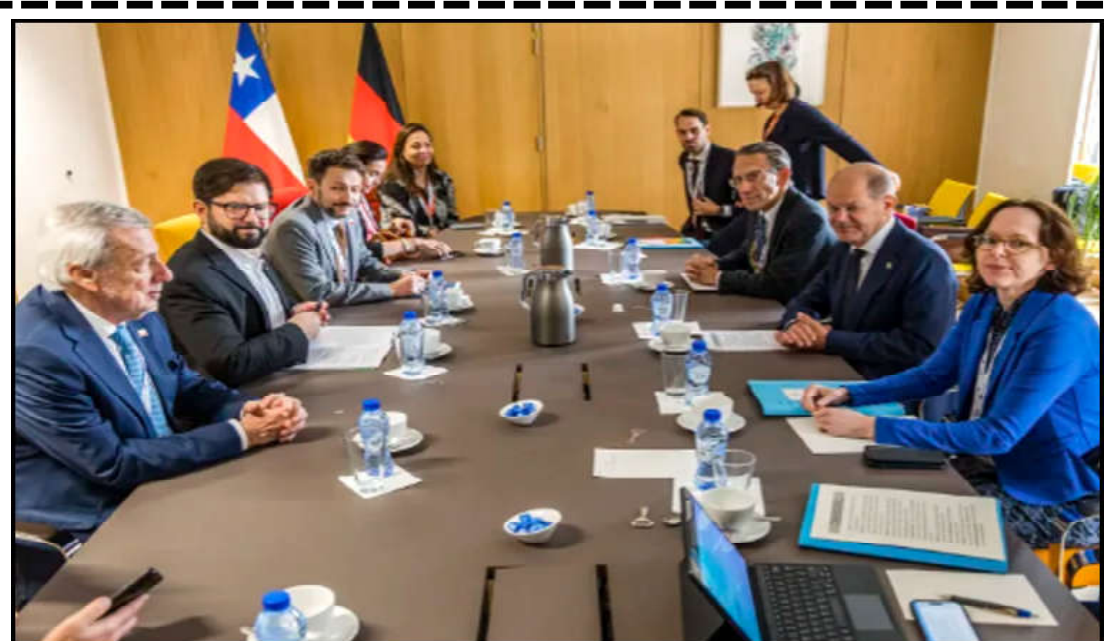
Germany's Chancellor Olaf Scholz and Chile's President Gabriel Boric sit during their bilateral meeting during the third EU-CELAC summit that brings together leaders of the EU and the Community of Latin American and Caribbean States, in Brussels, Belgium.

eration. China's security pacts with other nations have drawn suspicion and concern. Earlier this month, the United States, Australia and New Zealand called on the Solomon Islands prime minister to disclose details of the Pacific nation's policing deal signed with Beijing. China and Algeria agreed to work together to fight extremist terrorist organisations within their borders, and support other countries including Somalia and Sudan in their security efforts, according to the joint statement. Algeria, which has successfully battled domestic terrorism, has long expressed its interest in sup-