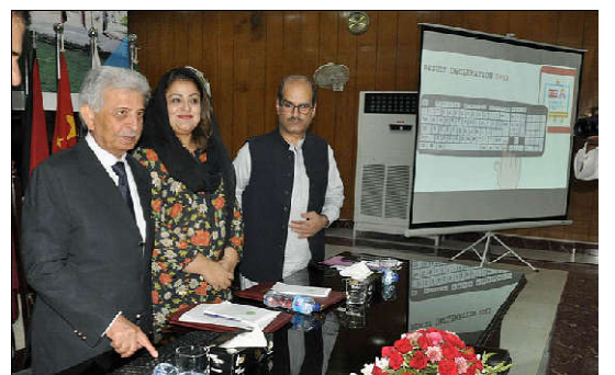
ISLAMABAD: Federal Minister for Education & Professional Training Rana Tanveer Hussain is pressing the key of computer to confirm during the Result Declaration ceremony SSC Part I & II 1st Annual Exam 2023 at FBISE.

to produce critical pool required for sports events such as planners, managers, technical staff, nutritionists, physiotherapists and others. Similarly, PM Shehbaz launched the Prime Minister Youth Sports Initiative to develop sports across the country and to provide world class sports facilities to the youth. He also launched the Elite Sportspersons Development Programme and E-Sports development programme. Addressing on the occasion, Shehbaz Sharif said Pakistan's highly talented sportspersons deserved appreciation from the nation as despite limited resources.