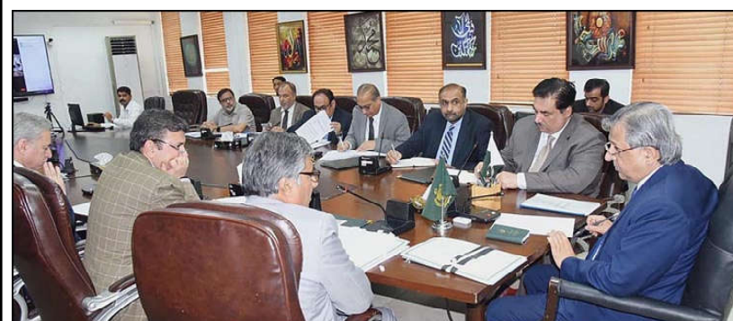
ISLAMABAD: Federal Minister for Law and Justice Senator Azam Nazir Tarar chaired a meeting of the committee regarding the formulation of Power Generation policy for Gilgit Baltistan

The Law Minister assured of full support and cooperation of the Federal Government where needed. The Centre would facilitate the GB Government to devise a way forward in order to meet the power deficiency in every possible way.