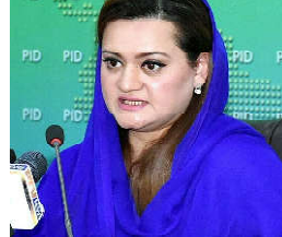
"There will be an official announcement about the date of the NA's dissolution," Aurangzeb said. Mainstream media has also been reporting contradictory statements from various leaders of the coalition parties regarding the timing of the general elections.

ISLAMABAD (INP): Information Minister Marriyum Aurangzeb on Tuesday asserted that no decision had been taken yet by the incumbent government and its allies regarding the dissolution date of the National Assembly. Reacting to media reports about the NA's early dissolution on August 8, days before its term completes on August 12, the information minister told a private TV news channel, "A decision has not been taken yet on the NA's dissolution date." She said the date would be decided in consultation between the government and its allies.