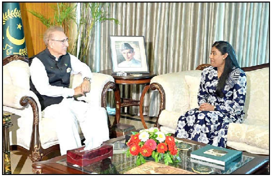
Maldives, particularly textiles, fabrics, rice, cement and pharmaceutical.

The president also congratulated the outgoing high commissioner on the successful completion of her tenure and appreciated her efforts for improving Pakistan-Maldives ties.