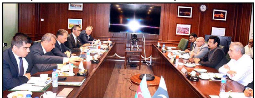
ISLAMABAD: Minister of Maritime Affairs, Syed Faisal Hussain Sabzwari, and Minister of Digital Development and Transport, H. E. Rashad Nabiye, of the Republic of Azerbaijan, held a meeting at the Ministry of Maritime Affairs today to discuss mutual cooperation and explore potential collaborations.