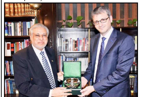
ISLAMABAD: Brent Neiman, Deputy Under Secretary of the US Department of Treasury called on Federal Minister for Finance and Revenue, Senator Muhammad Ishaq Dar at Finance Division.

To achieve the milestone, the USF had diligently laid fiber optic cables and installed 4G and 3G towers in remote and previously unserved areas, he added.