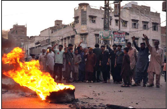
HYDERABAD: Shopkeepers of Anaj Market are burn tires and blocked road as they are holding protest demonstration against non-installation of electricity transformer, in Hyderabad.

The Chief Minister Muhammad Azam Khan while appreciating the role of partner organizations in mitigating polio virus in the province said that eradication of polio is indispensable to give a healthy and safe future to the upcoming generations. Stressing the need for awareness with regard to polio virus.