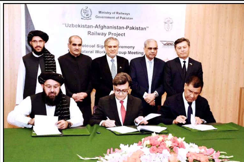
ISLAMABAD: Uzbekistan, Afghanistan and Pakistan signed a Joint Protocol on (UAP) Railway project at Ministry of Railways.

judges will hear an appeal if the SC declares the Act valid. Subsequently, the CJ had constituted a six-member bench - excluding the two senior judges who had expressed their serious reservations about the proceedings - to continue hearing the matter. In a note that was part of the court's June 23 order, Justice Yahya Afridi - who is part of a six-member apex court bench hearing petitions challenging court martial of May 9 rioters - had requested CJ Bandial to constitute a full court to hear the petitions.