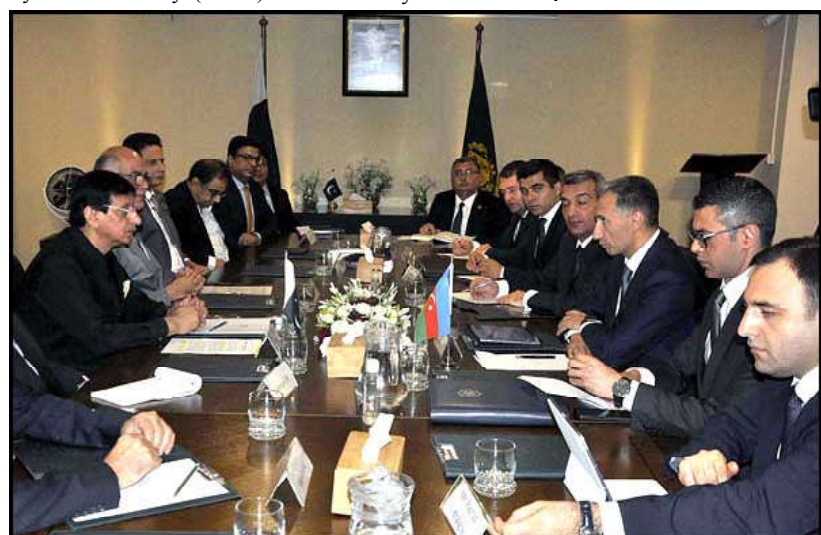
ISLAMABAD: Federal Minister for IT and Telecommunication Syed Amin Ul Haque chair a meeting along with Azerbaijani Minister for Digital Development & Transport Mr. Rashad Nabiyev at IT Ministry.

The agency has successfully processed an impressive sum of around Rs 66.87 billion cash till date.