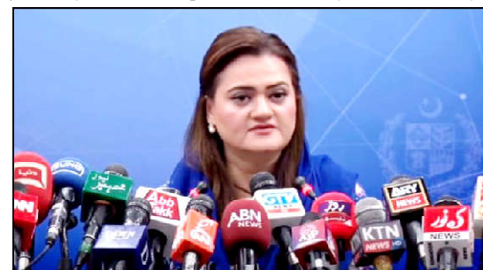
Mariyum Aurangzeb speaking at a press conference.

Comparing first 14 months of the PTI regime with the same period of the