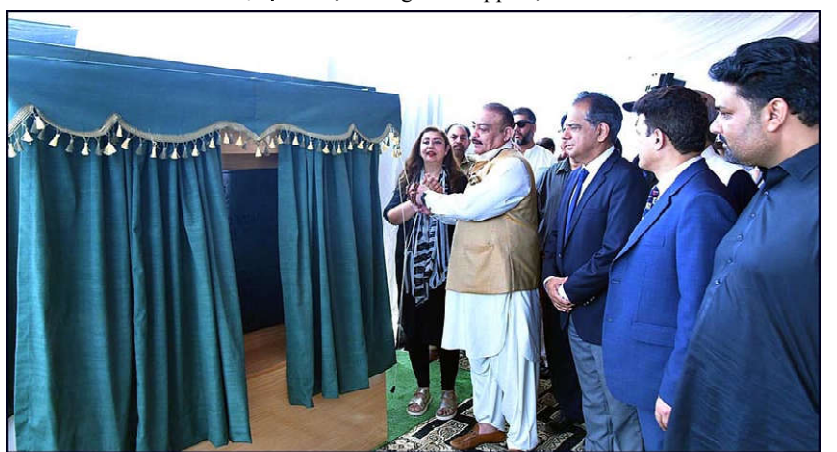
ISLAMABAD: Federal Minister for Health Abdul Qadir Patel inaugurating ground breaking ceremony of Cancer Hospital in PIMS.

The government further contended that the court was not empowered to regulate agricultural policies. It submitted that the order of the single bench was not only in violation of the law but also had contradictions in it.