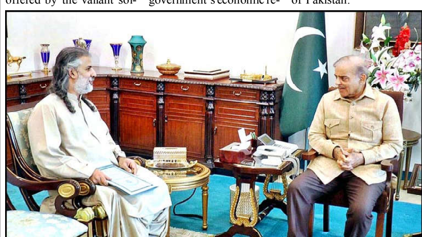
ISLAMABAD: Federal Minister for Narcotics Control, Nawabzada Shahzain Bugti calls on Prime Minister Muhammad Shehbaz Sharif.

He emphasized the need to improve the country's situation and provide better opportunities for the people, thus discouraging emigration.