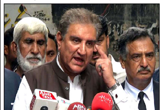
MULTAN: Tehreek-e-Insaf (PTI) Vice Chairman, Shah Mahmood Qureshi talking to media persons after court case hearing, at District Katchery in Multan.