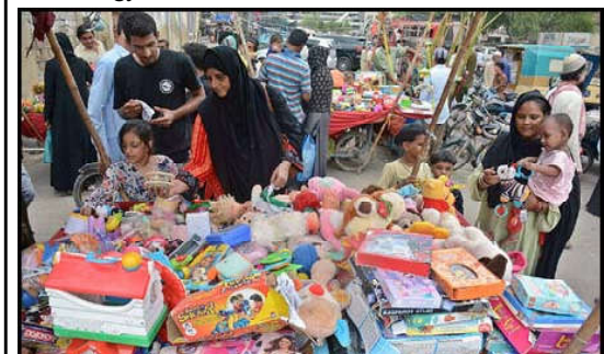
KARACHI: Women and children selecting and purchasing old toys at a roadside stall in Empress Market.

He said that over 10 thousand Pakistanis were residing in Korea while there were opportunities of investment in Fisheries and Textile sectors in Korea available to Pakistanis.