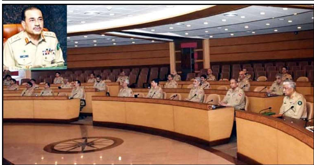
RAWALPINDI: Chief of the Army Staff (COAS) General Syed Asim Munir presiding over 258th Corps Commanders' Conference (CCC) held at the General Headquarters.

Vol. XIII No. 217 Reg. mails-B / ID-445 Tuesday July 18, 2023, Zil Hajj 29, 1444 A.H. Ph: 2158688, 2158997 Pages 4: Rs. 12