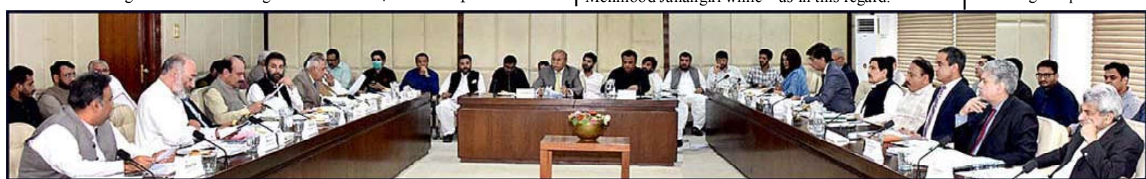
ISLAMABAD: Senator Mohsin Aziz, Chairman Senate Standing Committee on interior presiding over a meeting of the committee at Parliament House.

He stressed the importance of courteous and polite interactions between officers and personnel of Islamabad Capital Police and citizens during duty, as the force is regarded as a model force across the country.