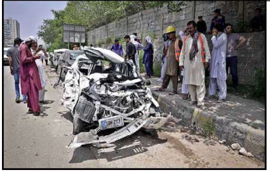
RAWALPINDI: View of badly damaged vehicles struck by an out of control Dumper Truck near Lahore High Court Bench at Swan area in the outskirts of the city.