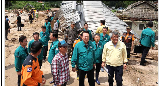
South Korea's President Yoon Suk Yeol (C) visits a village, where more than a third of houses were damaged in landslides and two people remain missing, in Yecheon.

Climate talks between the two biggest greenhouse gas emitters came to a halt last year after Nancy Pelosi, then speaker of the US House of Representatives, enraged Beijing by visiting self-ruled Taiwan, which China considers to be part of its territory.