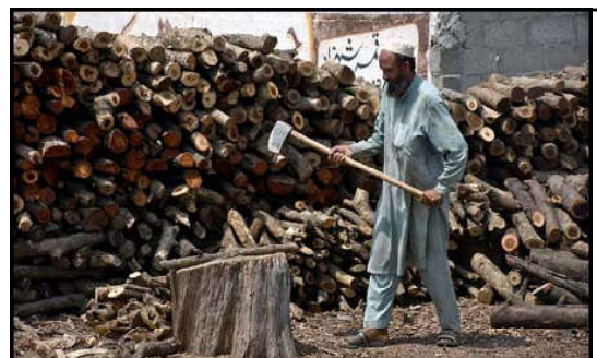
RAWALPINDI: A laborer cutting woods at Chakbeli Road.

Over a decade and a half, Zong 4G has been at the forefront of technological advancement, pioneering the introduction of 3G and 4G networks and successfully testing 5G. The company's commitment to technological progress has transformed the way Pakistan connects and communicates, propelling the nation's digital revolution. Investing significantly in expanding its network infrastructure, Zong 4G has erected over 14,000 towers nationwide, extending its services to even the remotest corners of the country.