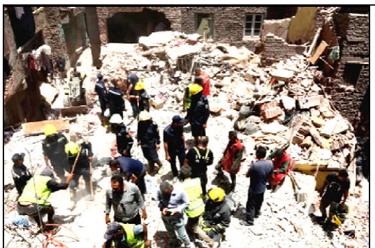
Rescuers search through the rubble of a collapsed five-story apartment building in Cairo, Egypt.

Japan and the UAE have pledged to achieve net-zero carbon emissions by 2050, and Saudi Arabia aims to do so by 2060. It's unclear how the two Gulf nations — which rely on massive oil exports — will reach those goals.