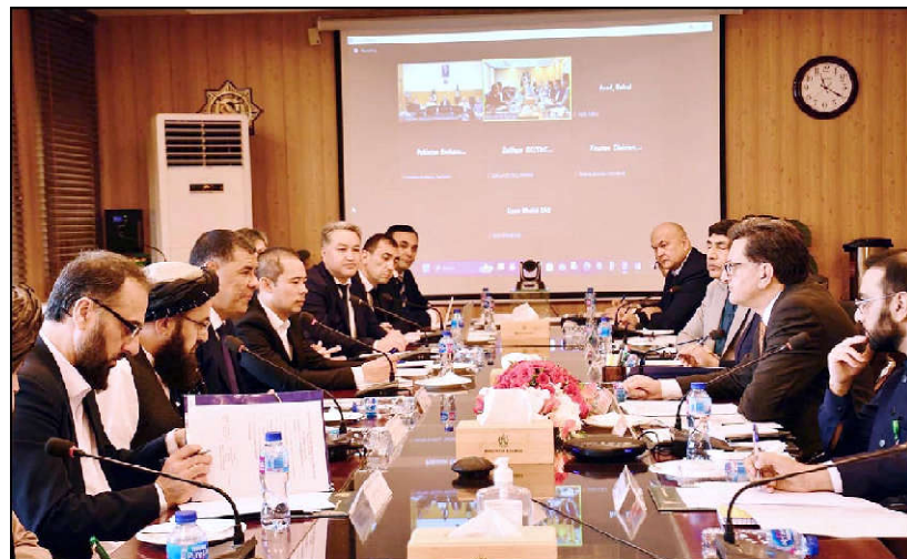
ISLAMABAD: A trilateral Working Group Meeting of Uzbekistan-Afghanistan-Pakistan (UAP) on Railways Project held at Ministry of Railways

He said that the Kashmiri people have been the worst victims of India's fascism for the past several decades. He, however, maintained that after August 5, 2019, India has turned the occupied territory into a military garrison, where people live in a state of perpetual fear and anxiety. Terming India's 5th August action as a violation of the UNSC resolutions, the PM said that after stripping the region of its special status.