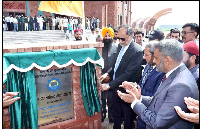
NAROWAL: Mr. Ahsan Iqbal Federal Minister for Ministry of Planning Development & Special Initiatives unveiling the plaque to inaugurate Nisar Fatima Auditorium and Jamia Masjid UET.