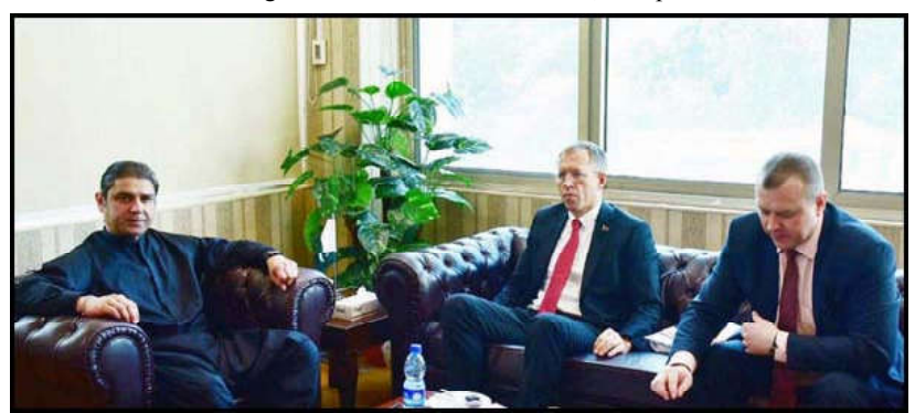
ISLAMABAD: Ambassador of the Republic of Belarus H.E. Andrei Metelitsa calls on the Federal Minister for Inter-Provincial Coordination (IPC) Ehsan ur Rehman Mazari.

sures. The authorities emphasized the utilization of advanced technologies such as safe city cameras, smart cars, surveillance cameras, and drone cameras to maintain high vigilance and ensure the safety of processions. Stringent directives were issued to organizers, emphasizing the cooperation between law enforcement agencies.