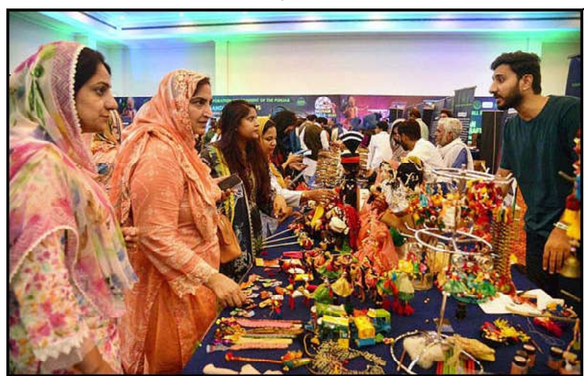
LAHORE: Women participating in the Dastkar Mela organized by Punjab Small Industry at the local hotel.