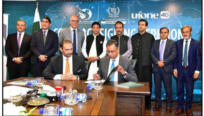
ISLAMABAD: Federal Minister for IT and Telecommunication Syed Amin Ul Haque and Federal Minister for Science and Technology Agha Hassan Baloch witnessing contract signing of High Speed Mobile Broadband Projects for Balochistan.

The subject rules shall be finalised once approved by the special committee under the Anti Rape (Investigation and Trial) Act, 2021.