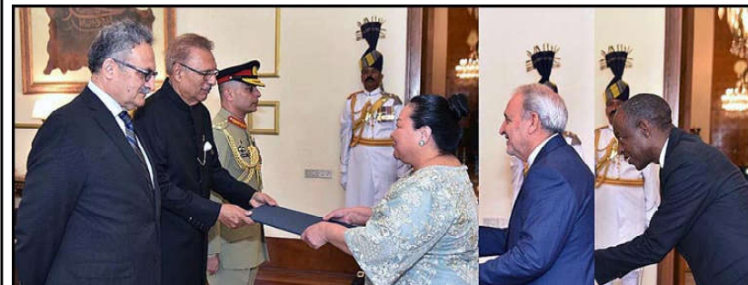
ISLAMABAD: The newly-appointed envoys of the Philippines, Iran and Rwanda presenting their diplomatic credentials to President Dr. Arif Alvi at Aiwan-e-Sadr.