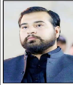
By Hamza Shahzad

Balochistan's educated youth are increasingly feeling exasperated and desperate, as years of university education are no assurance of acquiring a job. With mounting inflation, this catastrophe is also distressing their mental health.