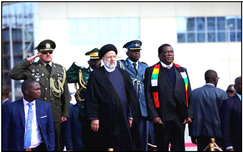
Iranian President Ebrahim Raisi is welcomed by Zimbabwean President Emmerson Mnangagwa, at Harare airport in Harare, Zimbabwe.