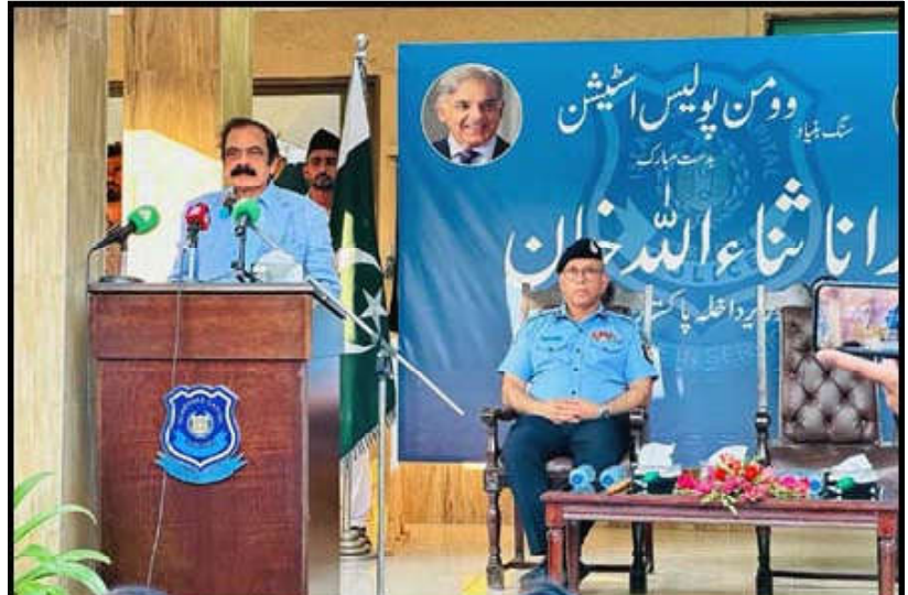
ISLAMABAD: Federal Minister for Interior Rana Sana Ullah Khan addressing the foundation stone laying ceremony of Women Police Station.

contract employees of the PTV to boost its performance. She informed the panel that the PTV Peshawar Center had started 24-hour transmission of its programmes in regional languages, including Pashto, while Multan and Karachi centres were airing round-the-clock their programmes in Saraiki and Sindh languages respectively. All studios of the PTV Lahore had been upgraded, she said, adding a virtual studio was set up in the PTV Islamabad Center. Marriyum said for the promotion of filmmaking, the PTV Film Division had been established, besides setting up the Film Production Institute at the PTV Academy.