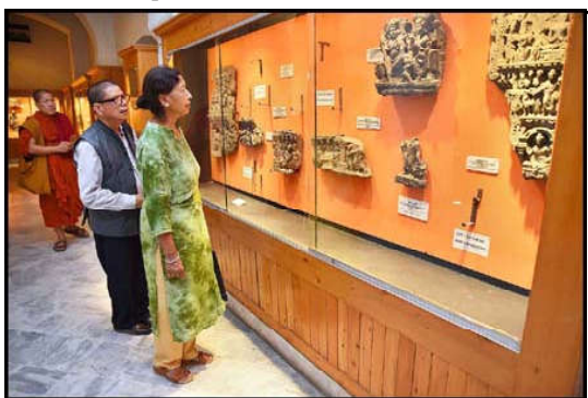
PESHAWAR: Monks from different countries visit Peshawar Museum to see the remains of Buddha's.