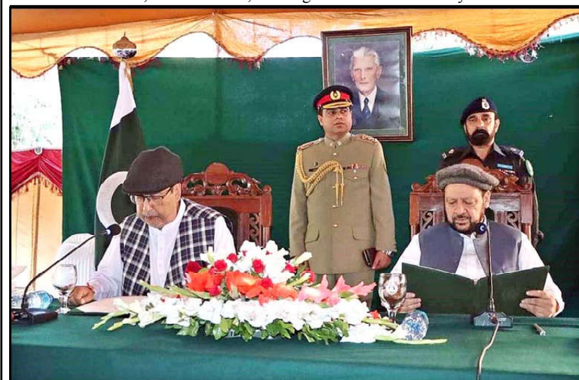
GILGIT: Governor Gilgit-Baltistan Syed Mehdi Shah administering oath from Newly Elected Chief Minister Gilgit-Baltistan Haji Gulbar Khan at Governor Secretariat.

today at Speaker House, Islamabad. During the meeting, Honorable Speaker Raja Pervez Ashraf and Attorney General Mr. Mansoor Usman Awan engaged in a comprehensive dialogue regarding various legal issues affecting Pakistan. The Speaker remarked "the rule of law is the cornerstone of a just society."