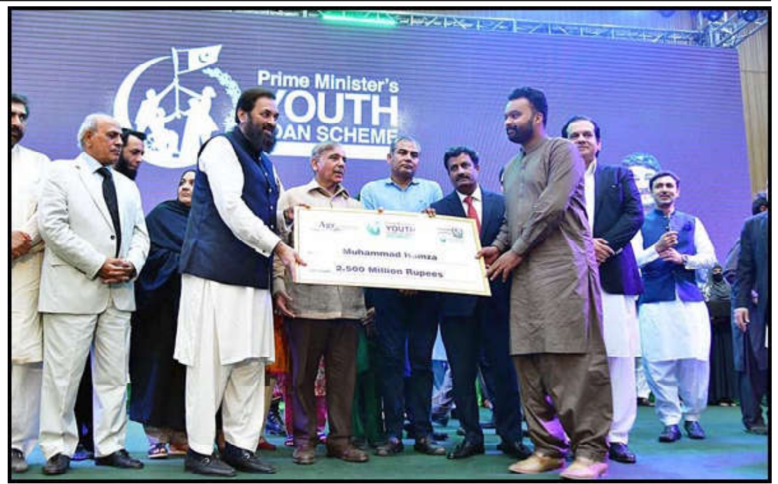
MULTAN: Prime Minister Muhammad Shehbaz Sharif distributes cheques among the successful candidates who received loans under Prime Minister's Youth Loan Scheme.

These initiatives reflect the government's commitment to expanding broadband infrastructure in Balochistan, with numerous projects already underway across the province. Moreover, 21 broadband projects worth Rs. 27.12 billion have been launched in 30 districts of Balochistan.