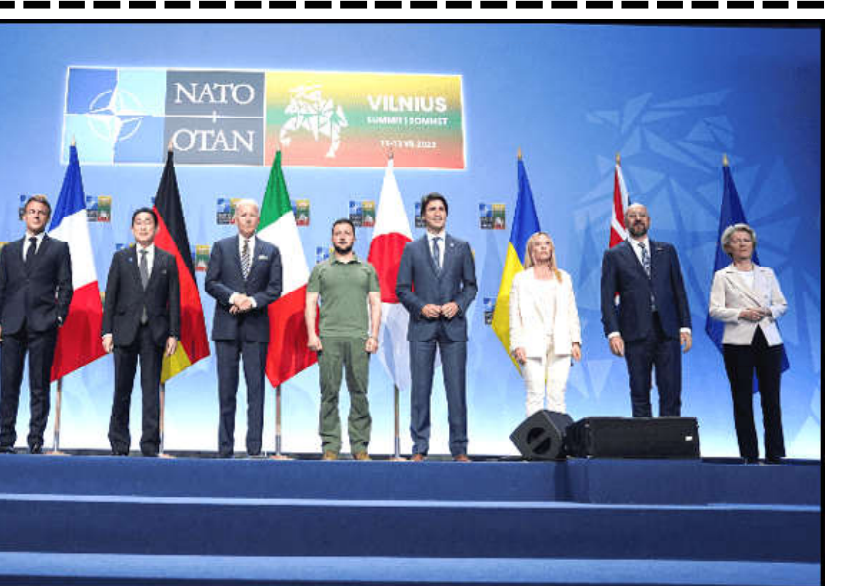
US President Joe Biden, Japan's PM Fumio Kishida, British PM Rishi Sunak, Canadian PM Justin Trudeau, German Chancellor Olaf Scholz, Italian PM Giorgia Meloni, France's President Emmanuel Macron, President of the European Council Charles Michel, European Commission President Ursula von Leyen and Ukraine's President Volodymyr Zelenskiy pose for a family photo, as they attend an event with G7 leaders as the NATO summit is held in Vilnius, Lithuania.

come a "meaningful success" following a flurry of announcements of military aid for Kyiv. "Today there are security guarantees for Ukraine on the way to Nato," he said. "The Ukraine delegation is bringing home a significant security victory for Ukraine." Zelensky said he would raise Ukraine's need for long-range weapons at a meeting with Biden at the summit. At a bilateral meeting, Biden promised Zelensky the US was doing everything it could to meet Ukraine's needs and acknowledged Zelensky's frustration about the scale and speed at which he was receiving support. "Your resilience and your resolve has been a model for the whole world to see," Biden said. "I look forward to the day when we're having the meeting celebrating your official, official membership in Nato. The bad news for you is, we're not going anywhere. You're stuck with us," Biden joked, prompting laughter from Zelensky. Asked by a reporter how soon after the war he would like Ukraine to join Nato, Biden responded "an hour and 20 minutes". US national security adviser Jake Sullivan said Biden would offer Zelensky long-range missiles when they met.