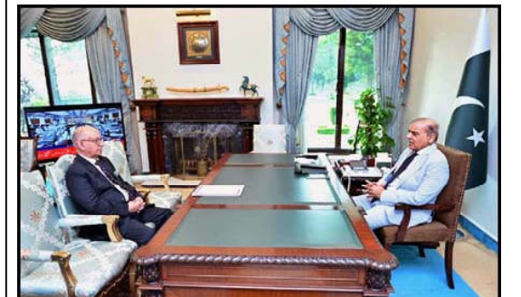
ISLAMABAD: Senator Irfan Siddiqui calls on Prime Minister Muhammad Shehbaz Sharif.

LAHORE (Online): Maryam Nawaz senior vice president of PML-N is likely to return to Pakistan on July 17 or 18. According to sources Maryam Nawaz will give final shape to her schedule of public meetings and rallies in connection with her mass contact campaign on her return to Pakistan.