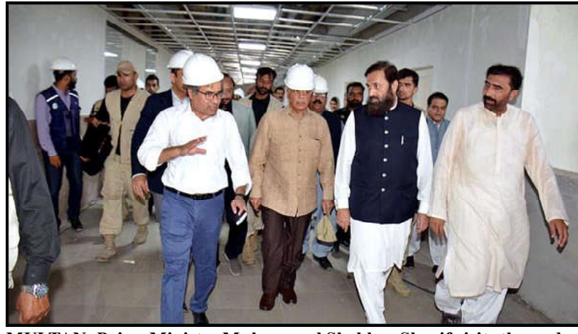
MULTAN: Prime Minister Muhammad Shehbaz Sharif visits the under-construction Nishtar II Hospital.