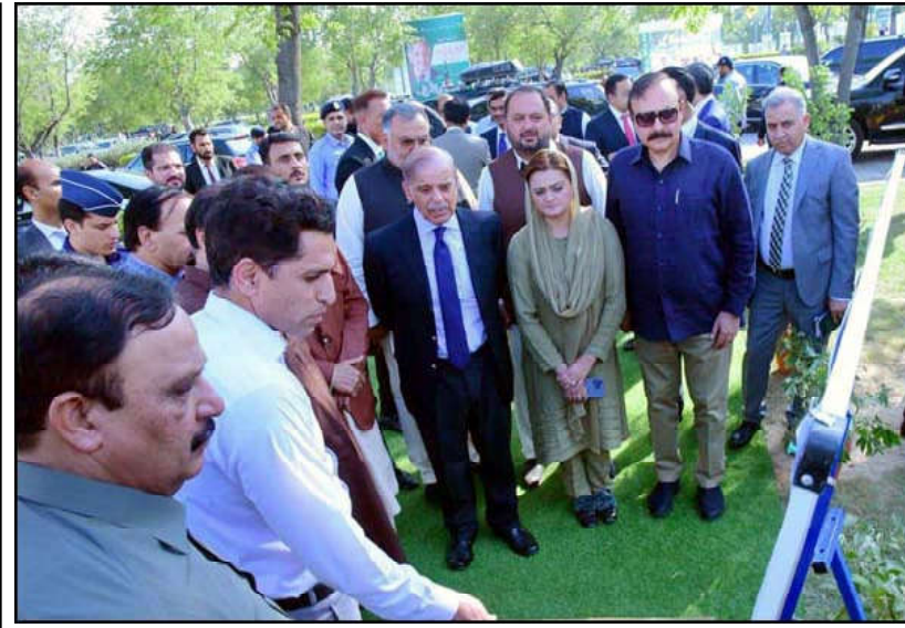
ISLAMABAD: Prime Minister Muhammad Shehbaz Sharif being briefed about Monsoon Tree Plantation Drive 2023.

ment. He wanted the country to default, but with the blessings of Almighty and efforts of the coalition government, such an eventuality was averted, the prime minister added. Pm Shehbaz said not a single corruption scandal had been reported during the current government's tenure of over one year, rather billions of rupees were saved by reaching big deals such as import of wheat and the agreement of a nuclear power project with China. The cost of the nuclear power project remained the same as agreed with the then prime minister Nawaz Sharif in 2018, besides a discount of Rs 30 billion, he added. Speaking about the 9th May incidents, the prime minister said what the PTI (Pakistan Tehreek-e-Insaf) had done on that day the enemy even could not do. Prime Minister Shehbaz Sharif also inaugurated the monsoon tree plantation campaign by planting a tree near the project.