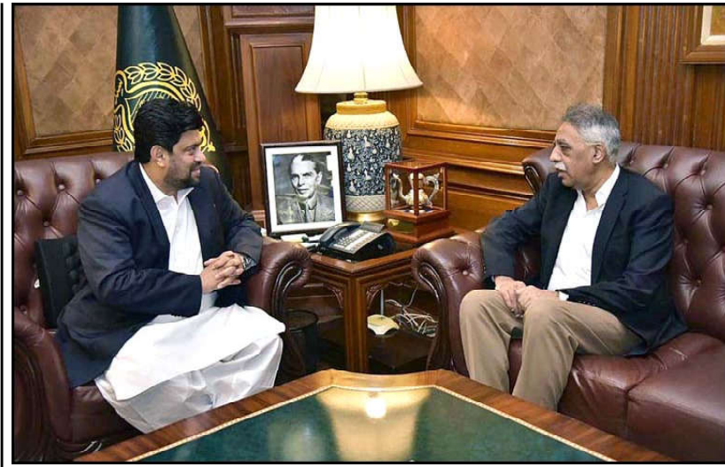
KARACHI: Former Sindh Governor Muhammad Zubair calls on Sindh Governor Kamran Khan Tessori at Governor House.