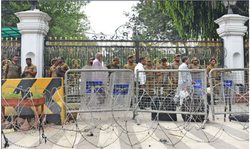
LAHORE: Police personnel stand guard during the protest of Government Employees of Punjab outside Civil Secretariat in Provincial Capital.