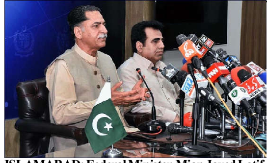
ISLAMABAD: Federal Minister, Mian Javed Latif, addressing a press conference.

plaint. Candidate can also get polling station video after paying the price. Increase in limit of expenditures of election for national and provincial assembly should also be increased. 4 million to 10 million expenditures suggested for national assembly and 2 to 4 million were suggested for provincial assembly elections. Criminal action should be made against presiding and returning officers for negligence. Punishment of election staff involved in rigging should be increased from 6 months to three years, suggestion in reforms committee. Verdict on violation of code of conduct should be made in 7 days instead of 15 days. Polling staff's final list should be uploaded in election commission's website.