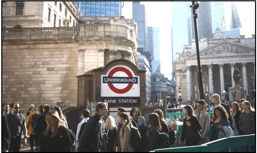
People walk outside the Bank of England in the City of London financial district in London, Britain.

Monitoring Desk UNITED NATIONS: Germany found traces of subsea explosives in samples taken from a yacht that it suspects "may have been used to transport the explosives" to blow up the Nord Stream gas pipelines, it told the U.N. Security Council in a letter with Sweden and Denmark. A series of unexplained explosions hit the Nord Stream 1 and 2 pipelines connecting Russia and Germany under the Baltic Sea last September in the exclusive economic zones of Germany, Sweden and Denmark. The trio are each conducting separate investigations and sent an update - seen by Reuters - ahead of a meeting of the 15-member Security Council on Tuesday called by Russia, which has complained that it has not been kept informed about the probes. "None of the investigations has been concluded and at this point, it is still not possible to say when they will be concluded. The nature of the acts of sabotage is unprecedented and the investigations are complex," the three wrote in a joint letter, dated Monday.