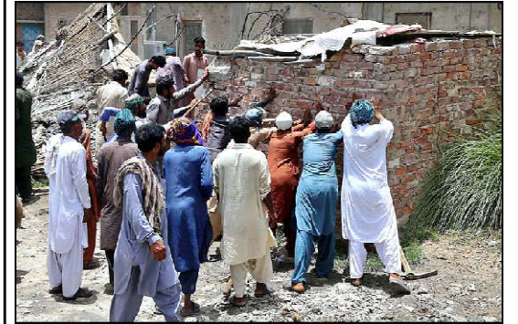
HYDERABAD: Railway staffers of Anti-Encroachment Cell demolishing encroachments at Makki Shah area.