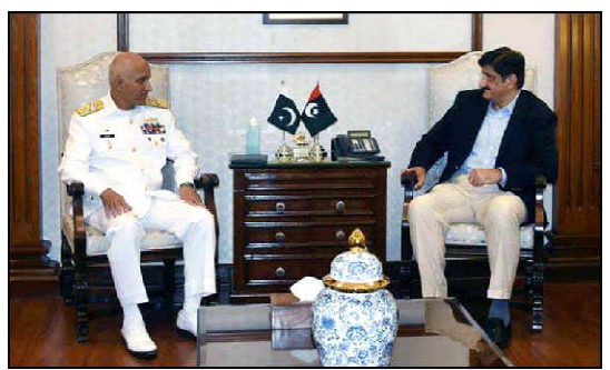
KARACHI: Sindh Chief Minister Syed Murad Ali Shah exchanges views with Chief of the Naval Staff Pakistan Admiral Muhammad Amjad Khan Niazi at CM House.

He said the entire nation stands in solidarity with the families of the martyrs and the injured.