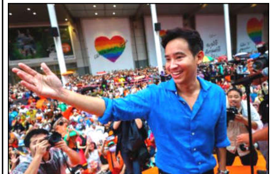
Move Forward Party leader Pita Limjaroenrat greets supporters during a rally to thank voters ahead of the vote for a new prime minister, in Bangkok, Thailand.

Monitoring Desk NAIROBI: Iran's president has begun a rare visit to Africa as the country, which is under heavy U.S. economic sanctions, seeks to deepen partnerships around the world. President Ebrahim Raisi's visit to Kenya on Wednesday is the first to the African continent by an Iranian leader in more than a decade. He is also expected to visit Uganda and Zimbabwe and meet with the presidents there. Africa is a "continent of opportunities" and a great platform for Iranian products, Raisi told journalists in a briefing. He didn't take questions. "None of us is satisfied with the current volume of trade," he said. Iran's leader specifically mentioned Africa's mineral resources and Iran's petrochemical experience, but the five memoranda of understanding signed on Wednesday by the Islamic Republic and Kenya appeared not to address either one. Instead, they addressed information, communication and technology; fisheries; animal health and livestock production and investment promotion. Kenyan President William Ruto called Iran a "critical strategic partner" and "global innovation powerhouse." He expressed interest in expanding Kenya's agricultural exports to Iran and Central Asia well beyond tea. Iran also intends to set up a manufacturing plant for Iranian vehicles in Kenya's port city of Mombasa, Ruto said.