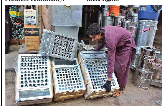
QUETTA: Shopkeeper setting up frames of Kulfi to attract customers at Mission Road.

The business leader said that the news of differences in the ruling coalition is everywhere, and the main reason for these differences is that different parties demand more than their right and try to deprive others of their legitimate rights.