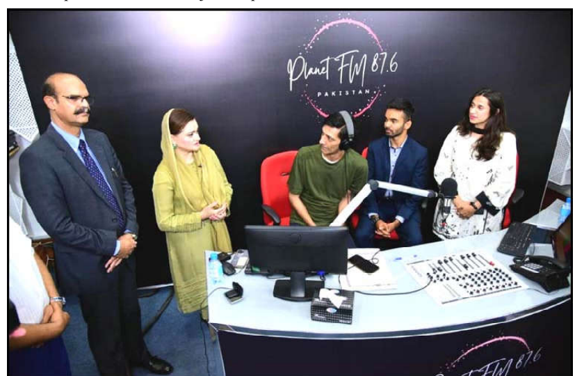
Ms. Marriyum Aurangzeb, Federal Minister for Information and Broadcasting inaugurating a podcast studio titled "Planet FM 87.6" at Radio Pakistan, Islamabad.

No better example can be found than Germany and Japan which were destroyed by powerful bombs but today these countries stand among the developed countries of the world.