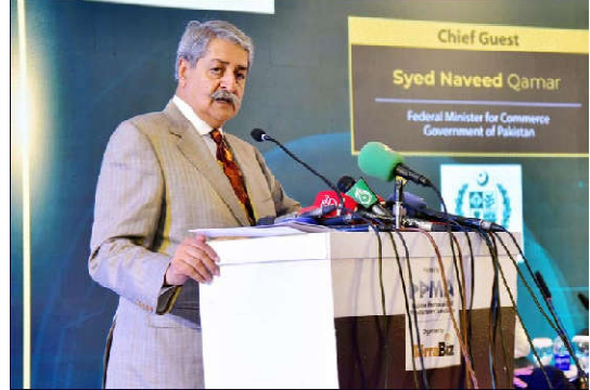
ISLAMABAD: Federal Minister for Commerce, Syed Naveed Qamar, speaking at a podium.

nificantly increase Pakistan's pharmaceutical exports. The event was organized by the Pakistan Pharmaceutical Manufacturers' Association (PPMA), brought together industry leaders, experts, and stakeholders to discuss strategies for growth and innovation in the pharmaceutical sector. While highlighting the immense opportunities for