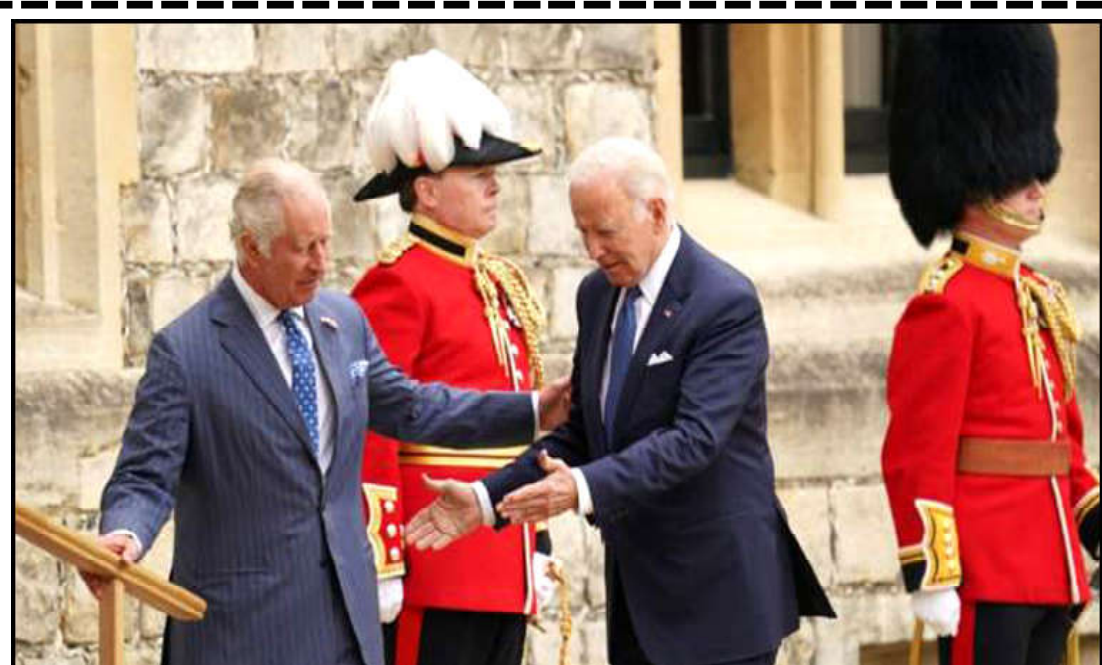
Joe Biden was welcomed by King Charles to Windsor Castle for his first meeting with the monarch since he was officially crowned.