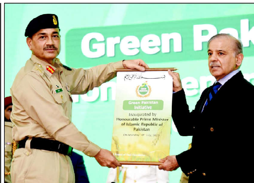
ISLAMABAD: Prime Minister Muhammad Shehbaz Sharif inaugurates Green Pakistan Initiative, COAS General Syed Asim Munir hands over the inaugural scroll to the Prime Minister.

environment, investors shied away, he added. Pakistan could attract investment of $ 40 to 50 billion in the years ahead and it could make food exports to the Gulf countries which were presently importing food products worth $ 40 billion. He was of the view that Pakistan had to compete with the world and increase its exports and added the economy would get revived in the next two years. "It is demand of our national security that the country's food security and economic security should be strengthened," he said. Chief of Army Staff General Asim Munir has assured Pakistan Army's full support for all the initiatives being initiated under the ambit of Special Investment Facilitation Council, including Green Pakistan Initiative launched today.