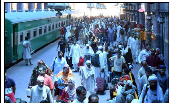
LAHORE: A view of the large number of people at Railway Station as the population of the country is increasing day by day along with problems, for which 11 every year world observed World Population Day to raise awareness of global population issues.