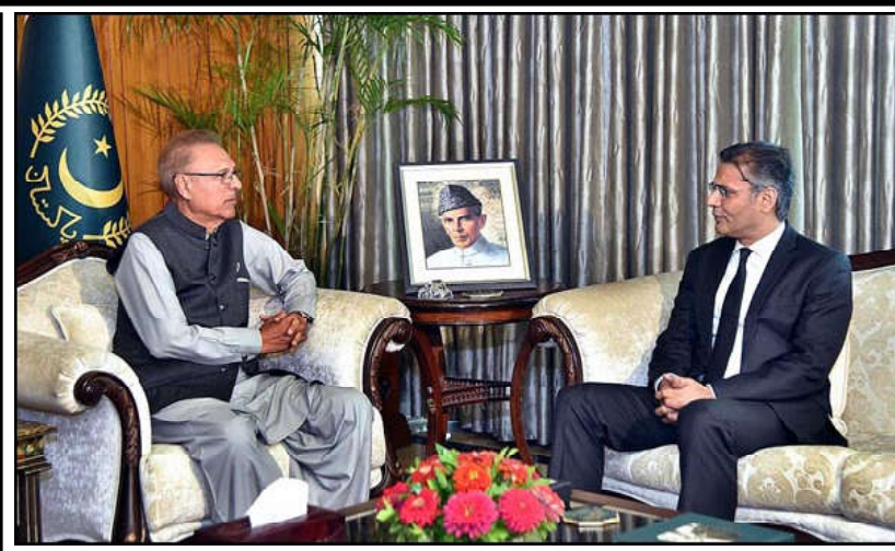
ISLAMABAD: Attorney General for Pakistan, Mansoor Usman Awan called on President Dr. Arif Alvi at Aiwan-e-Sadr.

ISLAMABAD (APP): Prime Minister Muhammad Shehbaz Sharif on Monday said that Pakistan was keen to expand its cooperation with partner countries to meet the UN Sustainable Development Goals (SDGs)-2030. The prime minister virtually participated in the First High-Level Forum on Global Development Initiative (GDI). Held under the theme of Global Development Initiative: "Echo the Development Agenda and Call for Global Action", the forum was organized by the China International Development Cooperation Agency (CIDCA), the PM Office Media Wing said in a press release. PM Shehbaz, in his remarks, stressed the salience of international development cooperation to present a unified global response for socio-economic development, mitigation of climate change threats, and galvanizing new drivers of growth for humanity's enduring progress and prosperity. He also appreciated China for launching the Global Development Initiative for achieving shared goals of inclusive and sustainable global development. Extending Pakistan's