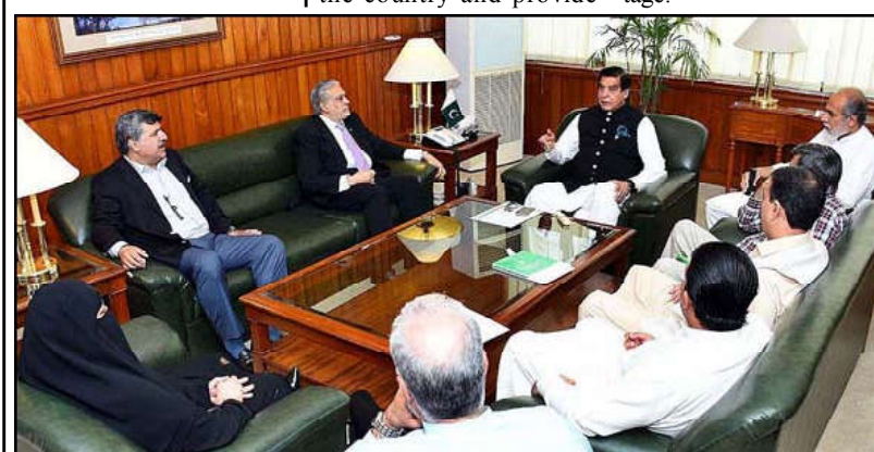
ISLAMABAD: Speaker National Assembly, Raja Pervez Ashraf in a meeting with Federal Minister for Finance and Revenue, Senator Muhammad Ishaq Dar at Parliament House.

rating to CCC from IDR (Issuer Default Rating)... Another positive news towards current economic revival journey, Ahamdolillah... Congratulations to PM @CMShehbaz, the Nation, Govt Allies & Economic Team," the minister tweeted. The rating agency has identified key indicators that contributed to the positive development rating for the country which include improvement in easing external financing risks. It says the upgrade reflects Pakistan's improved external liquidity and funding conditions following its Staff-Level Agreement (SLA) with the International Monetary Fund (IMF) on a nine-month Stand-by Arrangement.