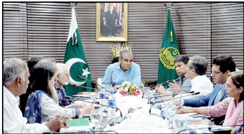
LAHORE: Caretaker Chief Minister Punjab Mohsin Naqvi presides over the meeting to review matter of Social Security Hospitals.