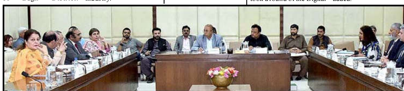
ISLAMABAD: Senator Mohsin Aziz, Chairman Senate Standing Committee on interior presiding over a meeting of the committee at Parliament House.

ISLAMABAD (APP): A group of young artists working on Gandhara called on Dr. Ramesh Kumar Vankwani, Chairman PM's Task Force on Gandhara Tourism here Monday at Sir Syed Memorial Museum to share their work on Gandhara and display the works during the 2-day Gandhara Symposium. Dr. Ramesh Kumar selected their work on Gandhara featuring paintings, sculptures in diverse mediums and ideas exploring potential and opportunities for Gandhara tourism in Pakistan. He said these artists are our assets and we must create opportunities for them to polish their talent and attract young generation to the field of visual art. The Chairman PM Task Force said the works contributed by these budding and established artists will be displayed during the two-day Gandhara Symposium and after this grand event, we will hold a national level Gandhara Art Competition to involve art students and artists for promotion of Gandhara tourism at home and abroad through such competitions.