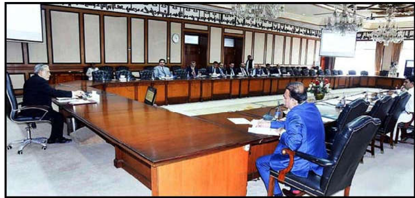
ISLAMABAD: Federal Minister for Finance and Revenue, Senator Mohammad Ishaq Dar chaired a meeting of Cabinet Committee on Privatization (CCoP).