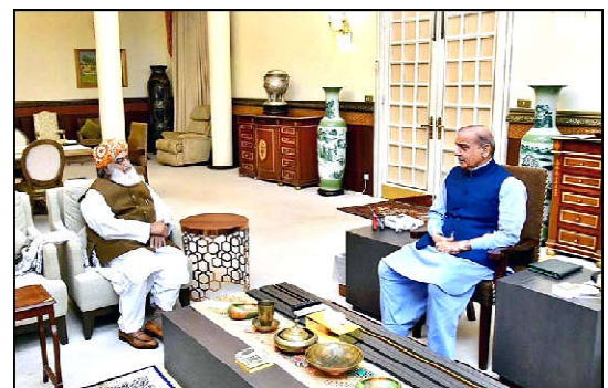
ISLAMABAD: President JUI-F Maulana Fazlur Rehman call on Prime Minister Muhammad Shehbaz Sharif.

connectivity with the world. A three-day international Gandhara symposium will commence in Islamabad on July 11 to showcase the treasure trove Gandhara Civilization and Buddhist Heritage in Pakistan, he added. Speaking on the occasion, the Buddhist Monks from Vietnam lauded Prime Minister Muhammad Shehbaz Sharif and his government for facilitating Buddhist people and followers of other faiths to explore Gandhara Civilization and sites of Buddhism in Pakistan. They said there will be more travelers in the future to visit the cultural heritage of Pakistan. They urged the media to play its due role in promoting Gandhara civilization. and Pakistan's potential for religious tourism. The delegation also took a round of the Islamabad Museum and showed keen interest in Pakistan's Buddhist heritage.