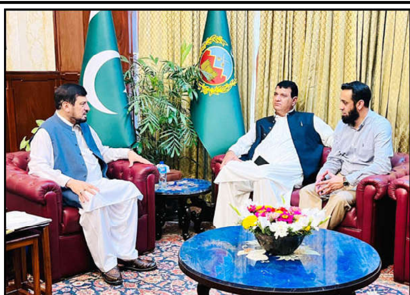
PESHAWAR: Advisor to PM Engineer Ameer Muqam and Special Assistant to PM Attaullah Tarar meeting with Khyber Pakhtunkhwa Governor Haji Ghulam Ali.

FAISALABAD (APP): A minor girl received burn injuries during house-ablaze incident in the area of Sargodha Road police station. Rescue 1122 spokesman said here on Monday that a house situated at Mohallah Shah Abad near Crescent Mills Sargodha Road caught fire due to short-circuiting. The fire engulfed the entire surroundings and burnt precious house luggage present on the spot. Receiving information, fire fighters of Rescue 1122 rushed to the spot and brought the fire under control after hectic efforts of many hours.