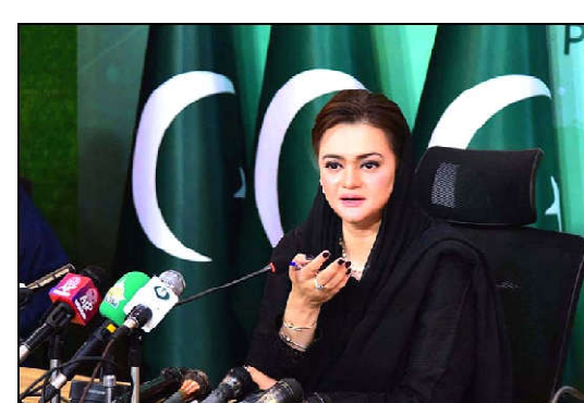
ISLAMABAD: Federal Minister for Information and Broadcasting, Ms. Marriyum Aurangzeb addressing a press conference.

ISLAMABAD (APP): Minister for Information and Broadcasting Marriyum Aurangzeb Monday said the May 9 incidents had only benefited the "enemy", but it was the nation who ultimately emerged victorious with the foiling of conspiracy against Pakistan.