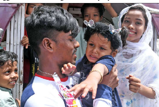
KARACHI: Pakistani fishermen, who were released by the Indian government, are greeted by their family members after arriving in the port city as The Indian government has released 10 Pakistani fishermen held for violating its territorial waters as a goodwill gesture.

Referring international data report said that excessive use of smart phones, tablets or laptops.