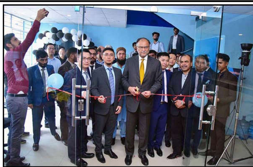
ISLAMABAD: Federal Minister for Planning, Development & Special Initiatives, Prof. Ahsan Iqbal cutting ribbon to inaugurate Hyper Future E-Commerce Operations Center.

Ahsan Iqbal made a crucial point that no matter how qualified and exceptional the individuals in government may be, "political uncertainty, turmoil, or divisive politics hinder a country's path to success."