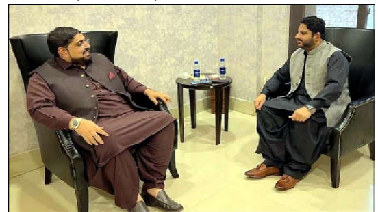
QUETTA: DG PDMA Jahanzeb Khan meeting with Deputy Commissioner Quetta Shehak Baloch

Earlier, the Provincial Minister for Home and Tribal Affairs, Mir Ziaullah Langave also visited route of Muharram procession Quetta city and reviewed the security arrangements made there.