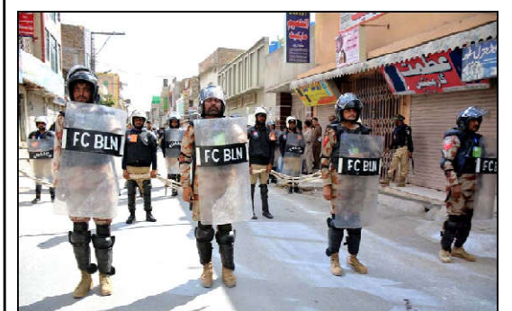
QUETTA: Security officials stand high alert on route to avoid any untoward incident as security has been tightened during mourning procession of 7th Muharram-ul-Haram

He expressed the hope that all parties involved in the BSGI would engage in constructive dialogue to revive the Initiative. In this regard, the Foreign Minister reiterated Pakistan's support for international efforts for restoring the deal by addressing the concerns of all sides.