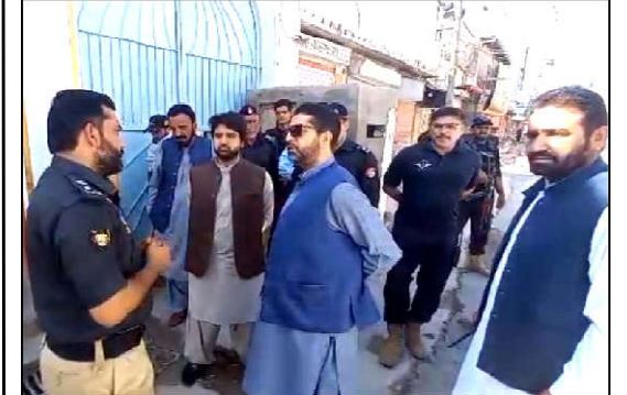
The Minister Home was speaking on occasion of the visit of Quetta city about the security arrangements made for the procession of 7th Muharram in the provincial metropolis.