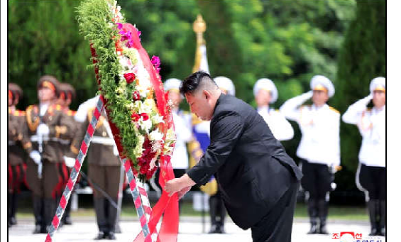
North Korean leader Kim Jong Un visits the Chinese People's Volunteer Army Martyrs' cemetery in this photo released by North Korea's Korean Central News Agency (KCNA).

Monitoring Desk ST. PETERSBURG: Some African leaders arrived in Russia on Wednesday for a summit with President Vladimir Putin as the Kremlin seeks more allies amid the fighting in Ukraine. Putin has billed the two-day summit that opens Thursday in St. Petersburg as a major event that would help bolster ties with a continent of 1.3 billion people that is increasingly assertive on the global stage. On Wednesday, Putin met separately with Ethiopia's Prime Minister Abiy Ahmed, and said Russia will more than triple the number of Ethiopian students it hosts and cover their education costs. Later in the day, Putin is set to hold talks with Egyptian President Abdel Fattah el-Sisi. Africa's 54 nations make up the largest voting bloc at the United Nations and have been more divided than any other region on General Assembly resolutions criticizing Russia's actions in Ukraine. It's the second Russia-Africa summit since 2019, and the number of heads of states attending shrank from 43 then to 17 now because of what the Kremlin described as a crude Western pressure to discourage African nations from attending it. Kremlin spokesman Dmitry Peskov deplored "unconcealed brazen interference by the U.S., France and other states through their diplomatic missions in African countries, and attempts to put pressure on the leadership of these countries in order to prevent their active participation in the forum."