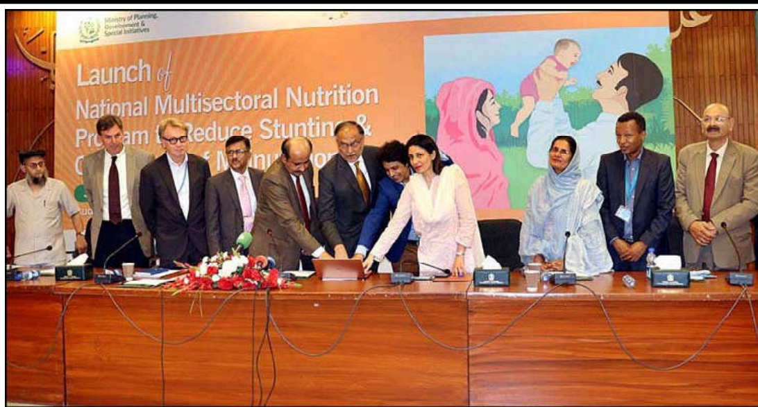
ISLAMABAD: The Planning Minister Professor Ahsan Iqbal launches “National Multi-sectoral Nutrition to Reduce Stunting & Other Forms of Malnutrition” worth Rs8.5 billion under Pakistan Nutrition Initiatives (PANI).

The prime minister also thanked the commercial banks for distributing Rs 30 billion among youth within a few months in the form of business loans.