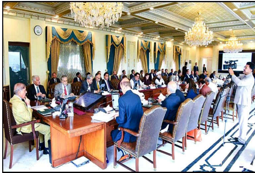
ISLAMABAD: Prime Minister Muhammad Shehbaz Sharif chairs Federal Cabinet Meeting.

Ph: 2841470/2841473 Vol: XVIII No. 221, Muharramul Haram 08, 1445 AH Thursday July 27, 2023 Pages 08, Price Rs.15