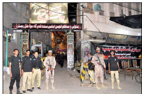
HYDERABAD: Security officials are standing high alert to avoid untoward incident during the Shiite Muslims mourning procession in connection of 2nd Muharram-ul-Haram, at Qadam Gha Mola Ali (R.A) in Hyderabad.

He said that a health screening certificate would be made compulsory for participating in the examination of the 9th class. He said that special focus was being paid on research work in medical institutes of the province. Earlier, the committee gave approval to different initiatives including the construction of the statue of Nishtar Medical University.