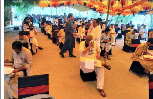
NASERABAD: Participants are solving paper during examination for various vacant posts of Revenue Department Naserabad Division.