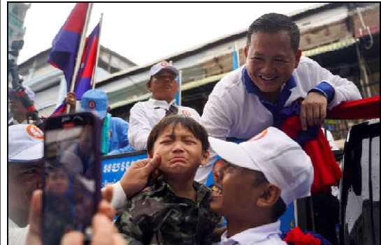
Hun Manet, son of Cambodia's Prime Minister Hun Sen, attends the final Cambodian People's Party (CPP) election campaign for the upcoming general election in Phnom Penh, Cambodia.

Moscow says it will return to the deal only if its demands are met for easier access for its own food and fertiliser exports to world markets.