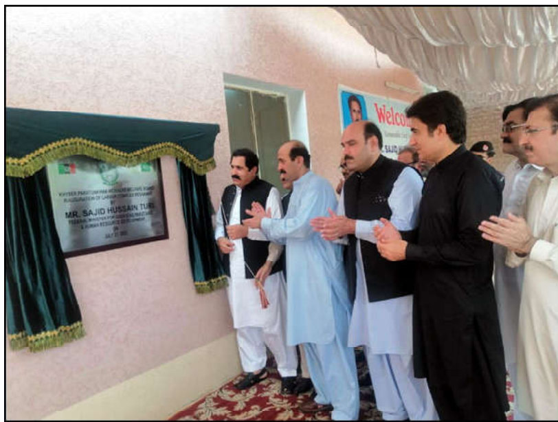
Federal Minister for overseas Pakistani & HRD Mr. Sajid Husain Turi is inaugurating the residential flats for project of worker welfare Board at Peshawar.

These forthcoming endeavors will focus on expanding infrastructure, streamlining business processes, and attracting key industries, unlocking the SEZ's full potential, as part of the ongoing decade of CPEC.