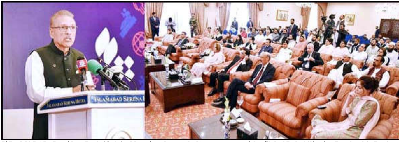
ISLAMABAD: President Dr. Arif Alvi addressing the concluding ceremony of the Global Rehabilitation Leadership Institute Course.