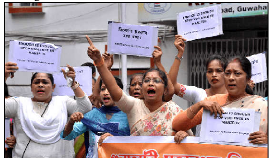
Members of the Assam Pradesh Mahila Congress (Assam PMC) shout slogans as they take part in a demonstration against ongoing ethnic violence in India's north-eastern state of Manipur, in Guwahati.

But the scale of the challenge was highlighted by the loss of the once safe Conservative parliamentary seat of Selby and Ainsty in northern England.