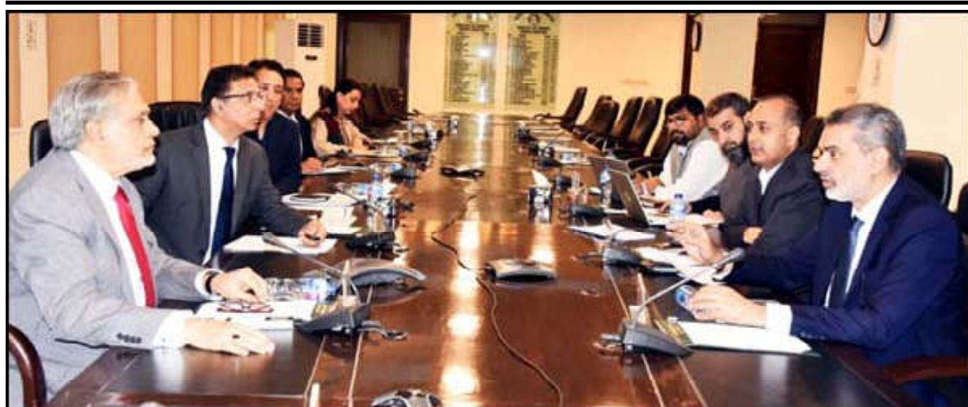
ISLAMABAD: Federal Minister for Finance and Revenue, Senator Mohammad Ishaq Dar chaired a meeting on the establishment of Pakistan Sovereign Wealth Fund (PSWF), at Finance Division in Islamabad.