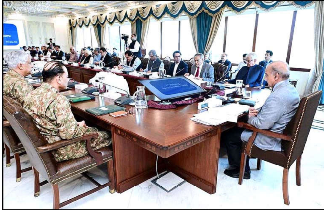
ISLAMABAD: Prime Minister Muhammad Shehbaz Sharif chairs the 2nd meeting of Apex Committee of SIFC.

Ph: 2841470/2841473 Vol: XVIII No. 217, Muharramul Haram 03, 1445 AH Saturday July 22, 2023 Pages 08, Price Rs.15