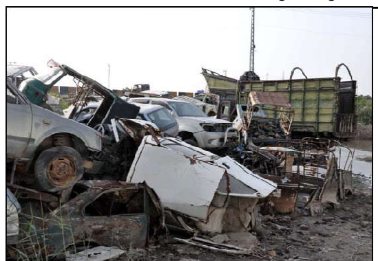
HYDERABAD: Impounded vehicles are ruining outside Hatri Bypass Police Station, showing the negligence of concerned authorities, in Hyderabad.