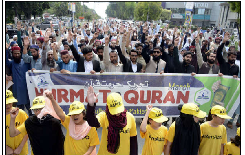
ISLAMABAD: Activists of Muslim Talba Mahaz shouting slogans during protest at Aabpara Chowk, against the burning of the Quran in Sweden.