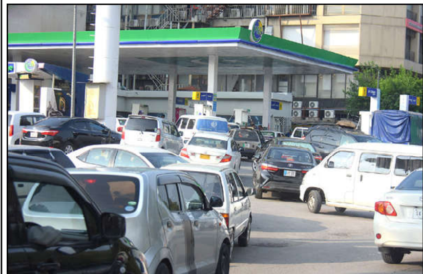
ISLAMABAD: A view of rush on petrol pump after Pakistan fuel pump operator association calls national strike for July 22.

Among them, foreign reserves held by the central bank were US$ 4,524 million while net foreign reserves held by commercial banks were US$ 5,314.5 million.