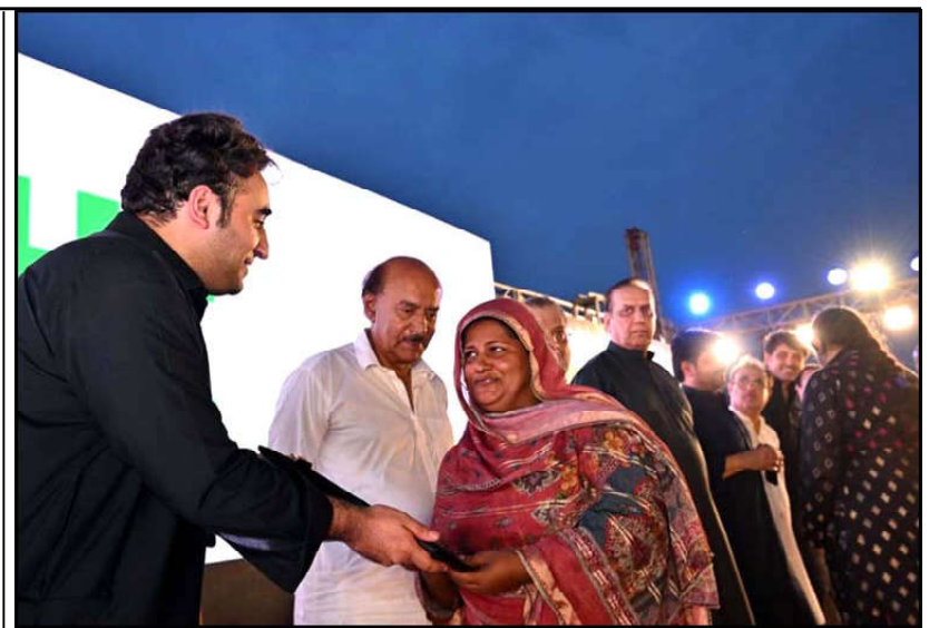
LARKANA: Peoples Party (PPP) Chairman, Bilawal Bhutto Zardari distributes Land Titles among flood affectedes during the ceremony of Distribution of Land Titles for Flood Affectedes held in Larkana.

He said the procedure for trying an accused in military courts was in front of the bench. Firstly a report regarding the certain incident used to be submitted to the military courts and then a commanding officer conducted a complete investigation into it in a court of inquiry.