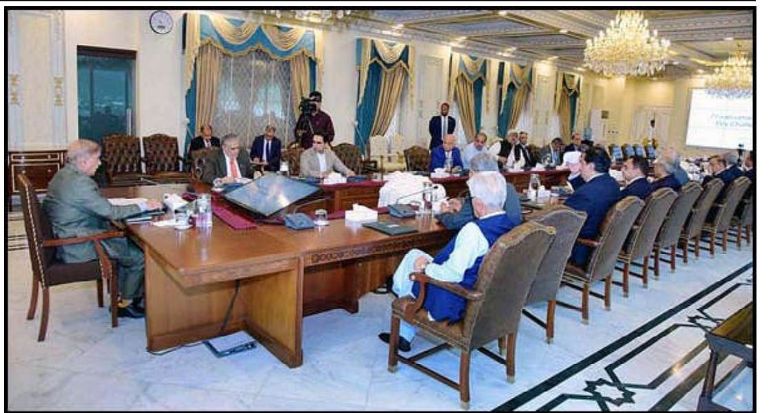
ISLAMABAD: Prime Minister Muhammad Shehbaz Sharif chairs a meeting to review the progress regarding the ongoing SOE reforms.