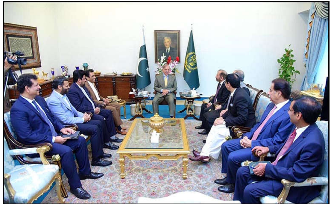
ISLAMABAD: A delegation of MQM led by the Convener Dr. Khalid Maqbool Siddiqui calls on Prime Minister Muhammad Shehbaz Sharif.

During the course of dinner, there was discussion on the political as well as other matters.