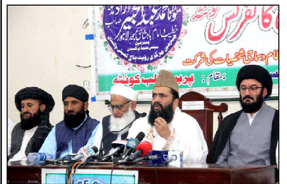
QUETTA: Central Ruet-e-Hilal Committee Chairman, Maulana Syed Muhammad Abdul Khahir Azad addresses to media persons during press conference, at Quetta press club.