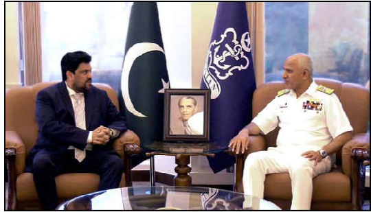
ISLAMABAD: Chief of the Naval Staff, Admiral Muhammad Amjad Khan Niazi exchanging views with Kamran Tessori, Governor Sindh during meeting held at Naval Headquarters in Islamabad.

The other initiatives include the soft launch of the first dedicated Sports University, the Elite Sportspersons Development Programme and the e-sports development programme.