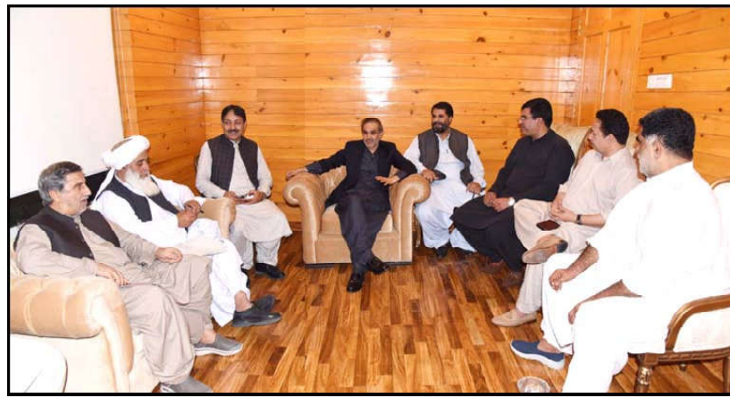
QUETTA: Balochistan Chief Minister Mir Abdul Qudus Bizenjo holding consultative meeting with Opposition MPAs regarding caretaker setup