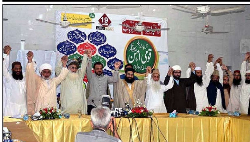
LAHORE: Chairman Pakistan Ulama Council and Special Representative of Prime Minister of Pakistan for Interfaith Harmony and Middle East Hafiz Muhammad Tahir Mahmood Ashrafi series of All Parties National Peace Seminar at Rahmani Islamic Center Model Town hand in hand for peace and unity on the occasion of Muharram.