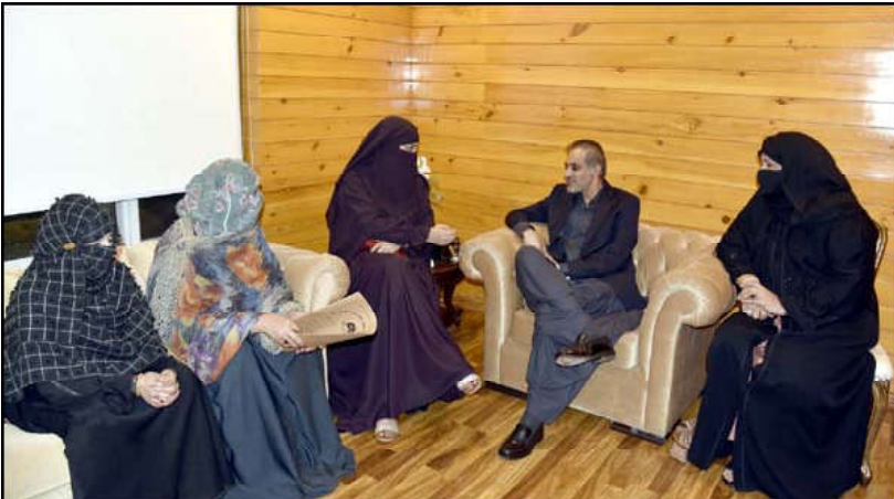
QUETTA: A delegation of women MPAs meeting with Balochistan Chief Minister Mir Abdul Qudus Bizenjo.

"Let us pledge today that we will strive to emulate the noble qualities established by our Prophet Muhammad (PBUH).