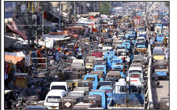
KARACHI: A large numbers of vehicles stuck in traffic jam due to negligence of traffic police staffs and illegal parking, at Liaquatnagar in Karachi.