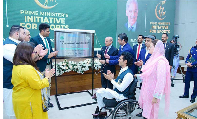
ISLAMABAD: Prime Minister Muhammad Shehbaz Sharif along with veteran sportspersons performing the soft launch of Pak first Sports University.

to produce critical pool required for sports events such as planners, managers, technical staff, nutritionists, physiotherapists and others. Similarly, PM Shehbaz launched the Prime Minister Youth Sports Initiative to develop sports across the country and to provide world class sports facilities to the youth. He also launched the Elite Sportspersons Development Programme and E-Sports development programme. Addressing on the occasion, Shehbaz Sharif said Pakistan's highly talented sportspersons deserved appreciation from the nation as despite limited resources.