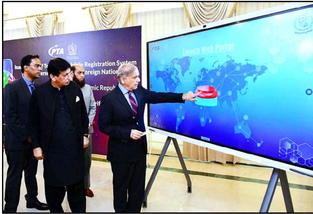
ISLAMABAD: Prime Minister Muhammad Shehbaz Sharif pushing a button to inaugurate temporary Mobile Registration System for overseas Pakistanis & Foreign Nationals.

Ph: 2841470/2841473 Vol: XVIII No. 215, Zil Hajj 30, 1444 AH Wednesday July 19, 2023 Pages 08, Price Rs.15