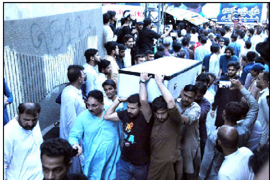
HYDERABAD: Relatives and others busy shifting the bodies of the 4 tourists to their home, who died in Gilgit due to a coach fall into a ditch.

He said Masajid, Imambargahs and Dargahs were spreading the message of harmony which was the soul.