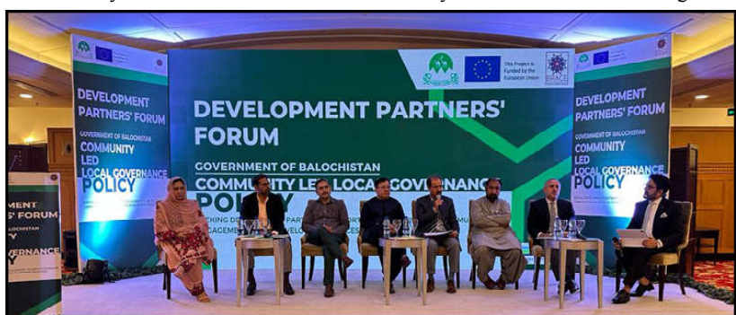
Governance (CLLG) Policy, and then developing an outline of PKR 9.2 Billion in PSDP 2023-24 where GOB reforms which will transform the development landscape in Balochistan. He added that the development