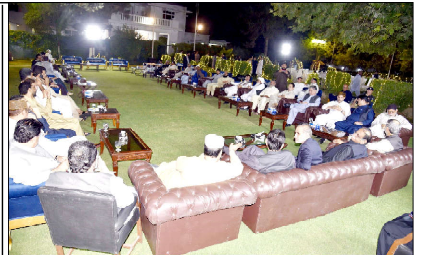
QUETTA: Speaker Balochistan Assembly Mir Jan Muhammad Khan Jamali, Deputy Speaker Sardar Babar Khan Musakhail, Provincial Ministers and MPs from opposition parties attending a dinner hosted by Balochistan Chief Minister Mir Abdul Qudus Bizenjo

In a note that was part of the court's June 23 order, Justice Yahya Afridi - who is part of a six-member apex court bench hearing petitions challenging court martial of May 9 rioters - had requested CJ Bandial to constitute a full court to hear the petitions.