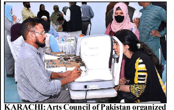
KARACHI: Arts Council of Pakistan organized "Free Medical Camp" at Haseena Moin Hall.

The Chief Secretary said that along with the prices of commodities, their supply and demand should also be closely monitored. He said that the special branch would provide support to the administration for taking action against hoarders.