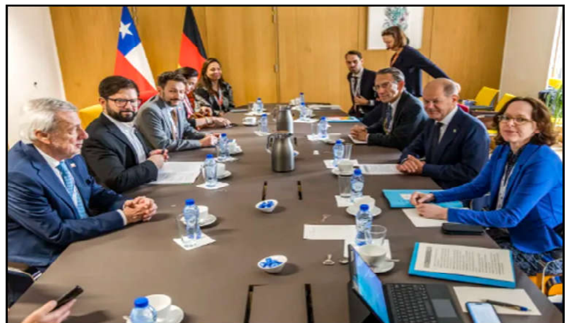
Germany's Chancellor Olaf Scholz and Chile's President Gabriel Boric sit during their bilateral meeting during the third EU-CELAC summit that brings together leaders of the EU and the Community of Latin American and Caribbean States, in Brussels, Belgium.

Tebboune visited Beijing after a state visit to Russia last month, during which he appealed to Russian President Vladimir Putin to support Algeria becoming a member of BRICS, a group of emerging markets comprising Brazil, Russia, India, China and South Africa.