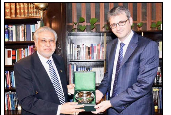
ISLAMABAD: Brent Neiman, Deputy Under Secretary of the US Department of Treasury called on Federal Minister for Finance and Revenue, Senator Muhammad Ishaq Dar at Finance Division.

To achieve the milestone, the USF had diligently laid fiber optic cables and installed 4G and 3G towers in remote and previously unreserved areas, he added.