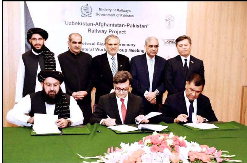
ISLAMABAD: Uzbekistan, Afghanistan and Pakistan signed a Joint Protocol on (UAP) Railway project at Ministry of Railways.