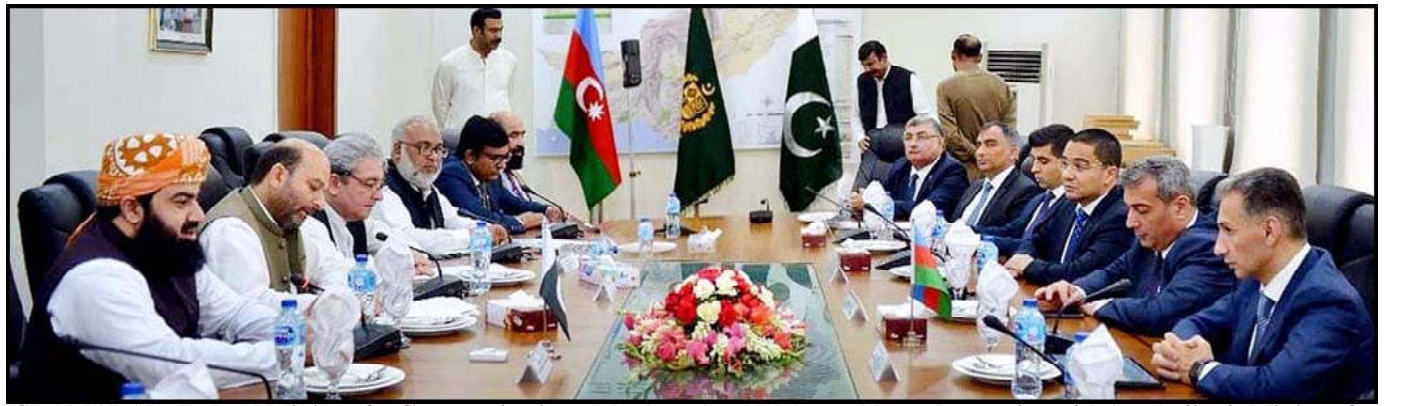
ISLAMABAD: Federal Minister for Communications, Maulana Asad Mahmood hosted a meeting with Azerbaijan's Minister for Transport, Mr. Rashad Nabiyev to discuss Road Trade Agreement.

and reduce humanitarian risks following last year's devastating floods. According to the statement, 56 per cent of the programmes under the CDPS are primarily or significantly geared towards promoting gender equality, and 26pc of the programs are primarily or significantly focused on disability inclusion. It added that the CDPS was aligned with Pakistan's long-term development strategies and sustainable development goals. "The strategy's objectives are to deliver a step change in human capital; support Pakistan to adopt a more resilient and cleaner growth path; support Pakistan to become a more open society; and promote macroeconomic stability.