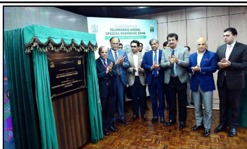
ISLAMABAD: Prime Minister Muhammad Shehbaz Sharif unveiling a plaque to mark the groundbreaking of Islamabad Model Special Economic Zone.