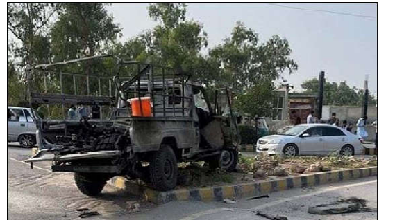
PESHAWAR: View of the site after bomb attack that targeted Frontier Corps (FC) convoy, at Hayatabad area in Peshawar.