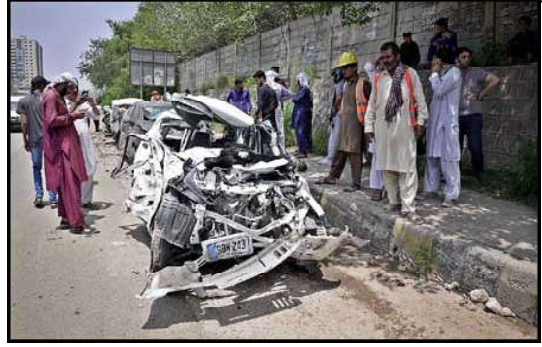
RAWALPINDI: View of badly damaged vehicles struck by an out of control Dumper Truck near Lahore High Court Bench at Swan area in the outskirts of the city.