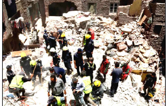
Rescuers search through the rubble of a collapsed five-story apartment building in Cairo, Egypt.

Monitoring Desk DUBAI: Japanese Prime Minister Fumio Kishida visited the United Arab Emirates on Monday as part of a swing through the Arab Gulf states focused on energy and commerce. He met with Sheikh Mohammed bin Zayed Al Nahyan, the president of the UAE, which will be hosting the COP28 U.N. climate summit later this year.