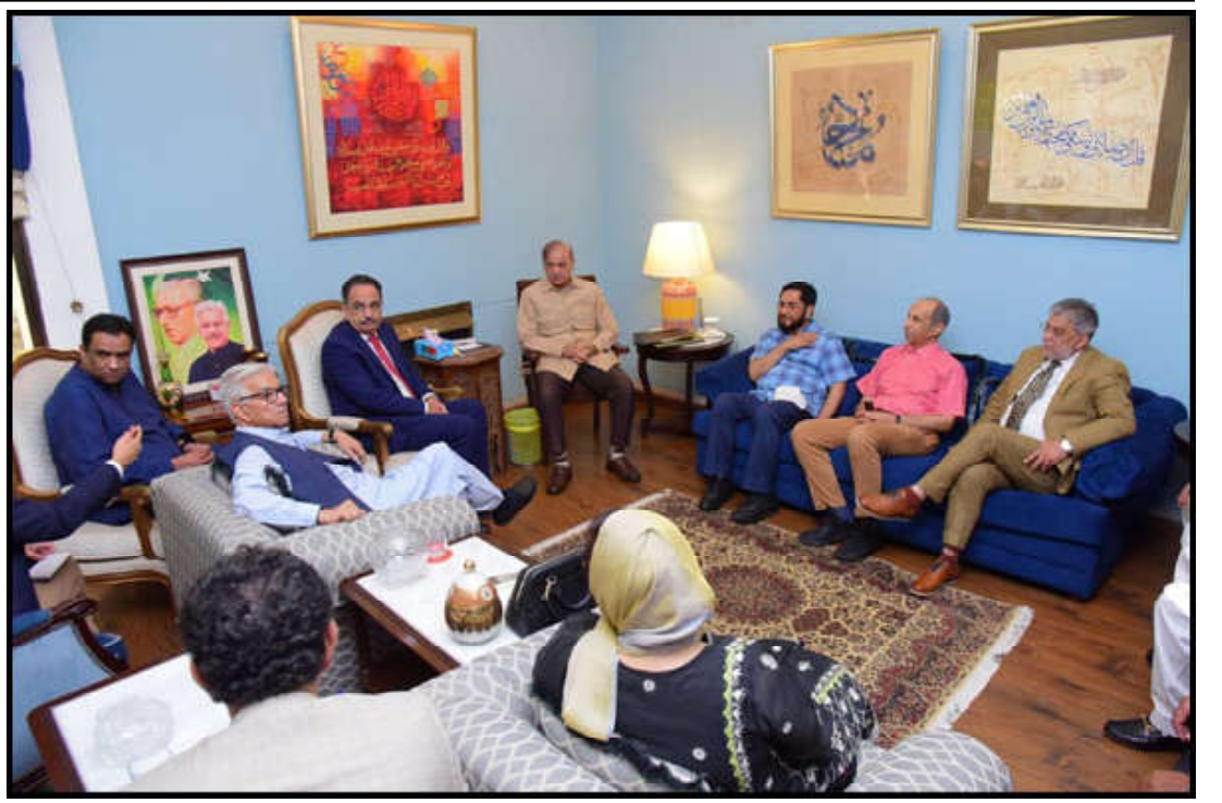
A delegation of Sialkot Chamber of Commerce called on Prime Minister Muhammad Shehbaz Sharif in Sialkot. Minister of Defence, Khawaja Muhammad Asif was also present.