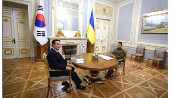
Ukraine's President Volodymyr Zelenskyy and South Korean President Yoon Suk Yeol attend a meeting, amid Russia's attack on Ukraine, in Kyiv, Ukraine.

Monitoring Desk WASHINGTON: White House National Security Adviser Jake Sullivan said on Sunday the Biden administration remains concerned that North Korea will move forward with another intercontinental ballistic missile test. "I have been concerned for some time that North Korea would conduct what would be its seventh nuclear test," Sullivan said during an interview with CBS's Face the Nation.