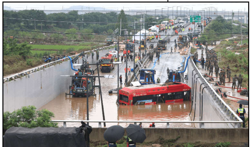
South Korean rescue workers search for missing persons near a bus along a deluged road leading to an underground tunnel where some 15 cars were trapped in flood waters after heavy rains in Cheongju.

fence secretary for four years, helping lead Britain's response to Russia's invasion of Ukraine. "I'm not standing next time," he said in an interview with the newspaper, but ruled out going "prematurely" and forcing another by-election. Sunak is facing three by-elections next week, and opinion polls suggest his Conservative party could lose all of them. A general election must be held in Britain within the next 18 months. The Sunday Times said a cabinet reshuffle was expected in September.