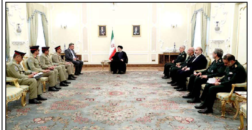
TEHRAN: Chief of Army Staff (COAS) General Syed Asim Munir meeting with President of the Islamic Republic of Iran, Ebrahim Raisi

wise act and insult of the people of Balochistan to give preference to a company (PPL) over a federating unit. Describing the attitude of federal government with Balochistan as unjustified, the Chief Minister maintained continuous and repeated contacts has not bear any positive result yet. He said that such attitudes cause differences and misunderstandings, which is not good for the federalism as well, he maintained.