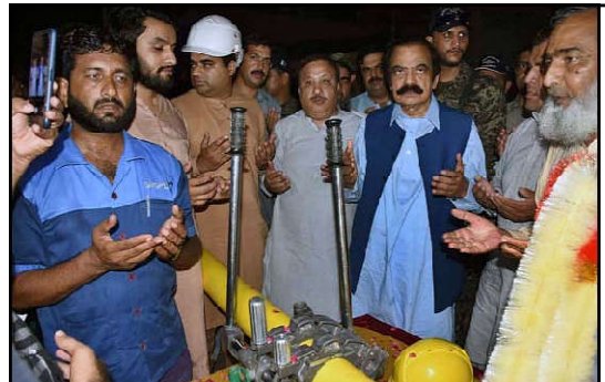
FAISALABAD: Interior Minister Rana Sana Ullah Khan offering 'dua' after inaugurating sui gas supply at Chak No. 4 JB Ram Diwali.