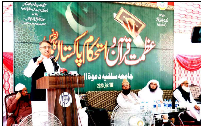
QUETTA: Governor Balochistan Malik Abdul Wali Khan Kakar addressing Azmat-e-Quran and Istehkam-e-Pakistan Conference organized by Markazi Jamiat Ahle Hadith Balochistan

The prime minister said during his tenure, about one million laptops were given to the youth and the PTI leadership blamed them for using the scheme as a bribe, adding that contrary to it, their initiative brought about an IT revolution in the country, enabling the youth to continue their studies, work as freelancers and earn a respectable livelihood for their families. A number of ministers, advisers, parliamentarians, officials and beneficiaries of the loan and families attended the ceremony. The prime minister stressed that these laptops were given purely on merit, and if proved otherwise, he would be held accountable as these resources belonged to the country.