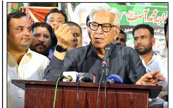
SIALKOT: Defense Minister Khawaja Muhammad Asif addressing the workers convention of PML-N at Union Council Water Works.

The Governor Balochistan, Malik Abdul Wali Khan Kakar had summoned the assembly session earlier last week. The agenda of session has already been issued by the secretariat of provincial assembly.