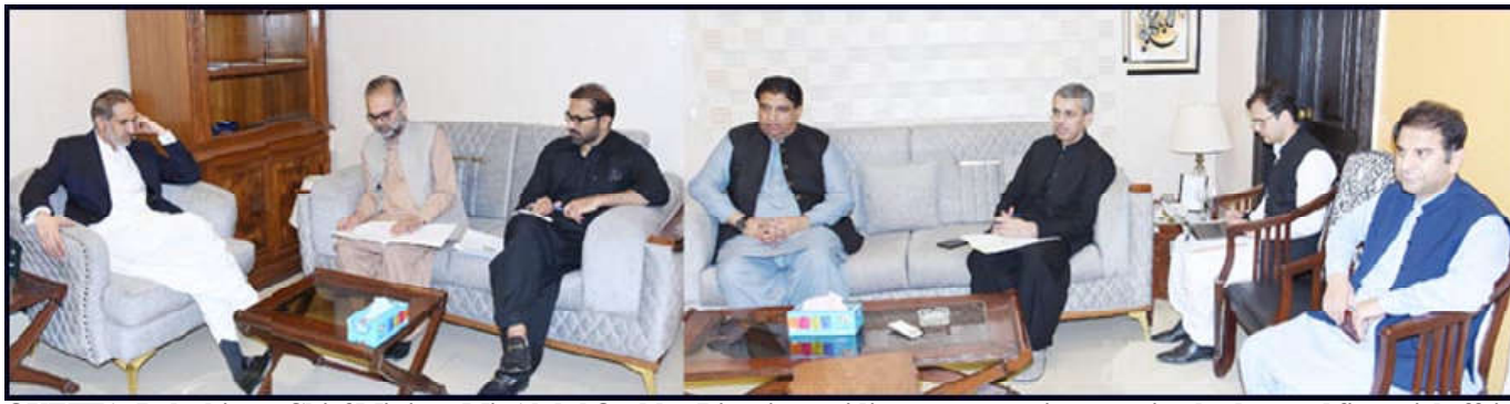
QUETTA: Balochistan Chief Minister Mir Abdul Qudus Bizenjo presiding over a meeting to review budget and financial affairs