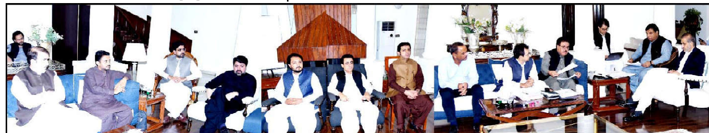
QUETTA: Balochistan Chief Minister Mir Abdul Quddus Bizenjo presiding over a high level meeting held to review the matters and issues of Gwadar