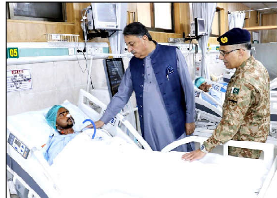
QUETTA: Governor Balochistan Malik Abdul Wali Khan Kakar enquiring about health of personnel injured in Zhub Garrison attack at CMH Quetta

He said that the "October 12, 1999 adventure" [Musharraf martial law] not been happened, today Pakistan would have been a developed country, with no jobless people. Pakistan was going to become an Asian tiger, but it was pushed into crises under a conspiracy with the ousting of Nawaz Sharif and his party from power, he added.