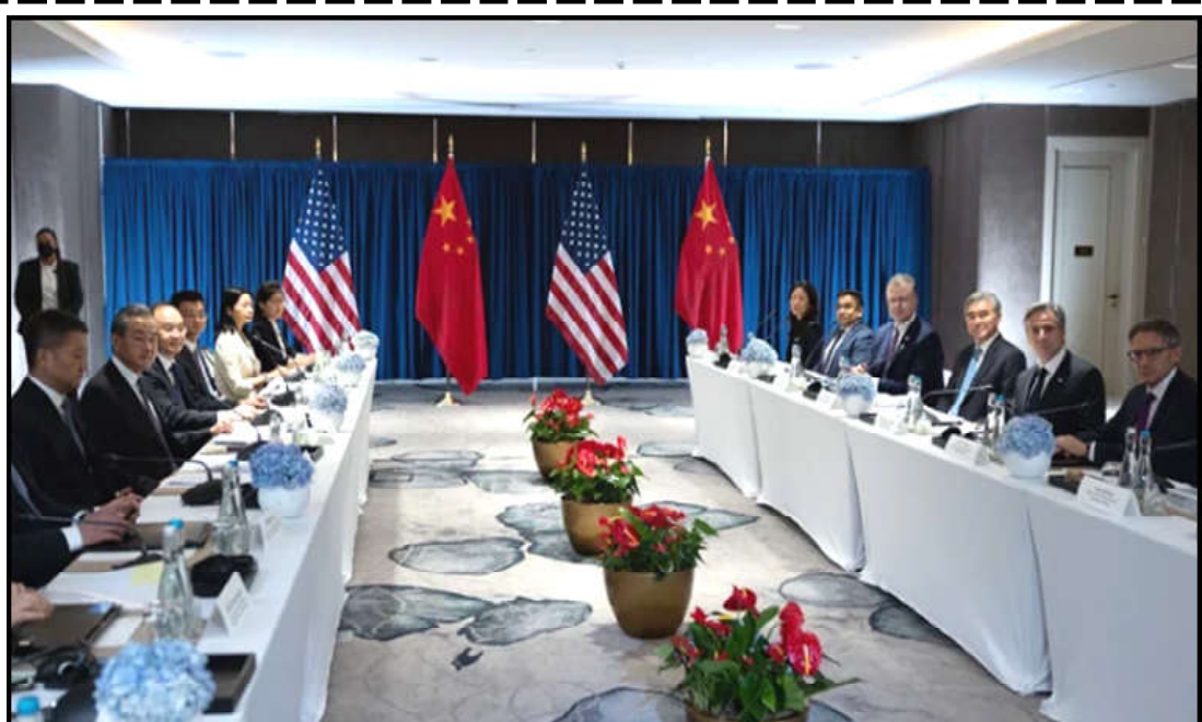
US Secretary of State Antony Blinken sits at a table with advisors across from Director of the CCP Central Foreign Affairs Office Wang Yi and his advisors.

attend such meetings, is ill, according to China's foreign ministry. Blinken told Wang to convey his "best wishes" to Qin, another US official said. Incidents have repeatedly impacted efforts to repair US-China relations, with Blinken scrapping his first planned trip to Beijing in February after Washington said it detected a Chinese espionage balloon over the US mainland. Blinken eventually visited in mid-June, becoming the first US secretary of state in China in nearly five years, opening a flurry of diplomacy since then.