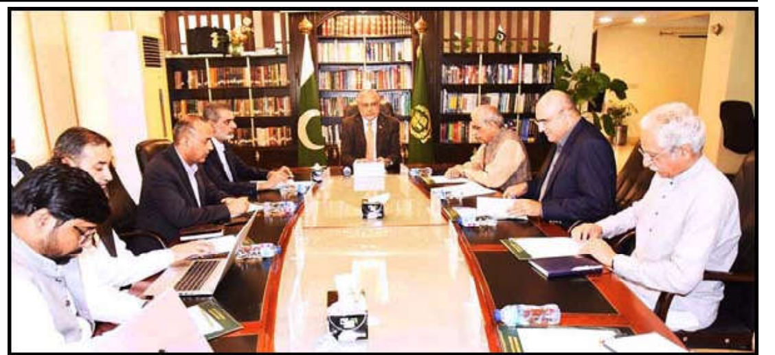
ISLAMABAD: Federal Minister for Finance and Revenue Senator Mohammad Ishaq Dar chaired a meeting on the establishment of Pakistan Sovereign Wealth Fund, at Finance Division.

development and long-term business partnerships between Pakistan and China. He said that Pakistan was establishing many special economic zones under CPEC and it was a good opportunity for Chinese companies to transfer technology to Pakistan and set up joint ventures in areas of interest. He said that ICCI is working on a new industrial estate in the region.