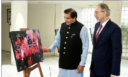
ISLAMABAD: Speaker National Assembly Raja Pervaiz Ashraf witnessing Türkiye Art Exhibition displayed on the occasion of Turkish Democracy and National Unity Day.

He expressed that Pakistan and Türkiye shared goals of democracy & stability. Pakistan considered Türkiye a brotherly country as it supported us in difficult times, especially during natural disasters, including the earthquake of 2005, the speaker said.