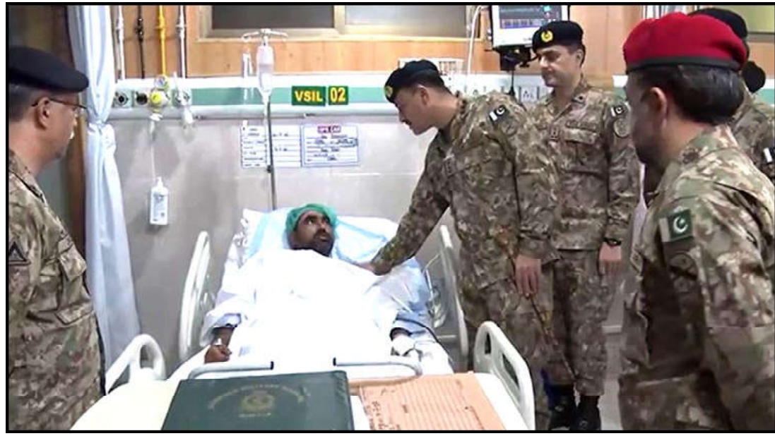
QUETTA: Chief of the Army Staff, General Syed Asim Munir enquiring about health of soldier injured in Zhub Garrison attack at CMH Quetta

Ph: 2841470/2841473 Vol: XVIII No. 212, Zil Hajj 26, 1444 AH Saturday July 15, 2023 Pages 08, Price Rs. 15