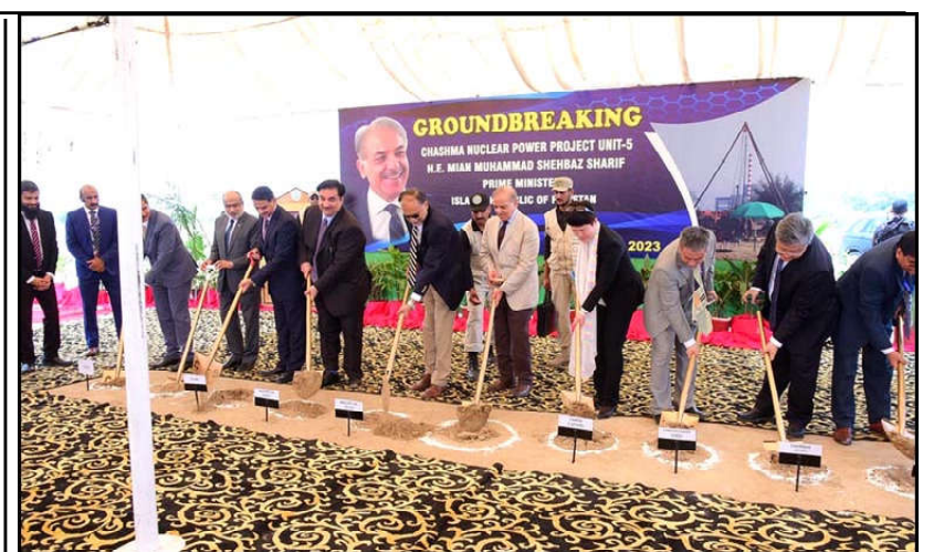
MIANWALI: Prime Minister Muhammad Shehbaz Sharif, Federal Ministers, dignitaries from China and PAEC officials performing the ground breaking of the 5th Unit of Chashma Nuclear Power plant (C-5) in Chashma.

MIANWALI (APP): Prime Minister Muhammad Shehbaz Sharif on Friday broke ground on the 1200 MW Chashma Nuclear Power Plant Unit 5 (C-5) here which is likely to be completed in seven to eight years at a cost of around US$3.48 billion. On June 30, 2023 the prime minister had witnessed the signing of Memorandum of Understanding (MoU) on the C-5 project between China National Nuclear Corporation Overseas Ltd (CNOS) and Pakistan Atomic Energy Commission (PAEC). Addressing the ground breaking ceremony, the prime minister said keeping in mind the country's requirements of clean and cheap energy sources, the project should be completed before the given schedule. Termed it a huge milestone and a symbol of co-operation between the two great friends China and Pakistan, Shehbaz Sharif said the project would help the country promoting clean, efficient and comparatively cheaper energy. He said after a pause of many years, the China Pakistan Economic Corridor (CPEC) was going again in full swing. He gave the credit of concluding the agreement of C-5 to the coalition government and the SPD for their hard efforts. "Our detractors had been fabricating rumours all around that Pakistan was going to default on its sovereign commitments but we crossed all turbulent waters in just 15 months," he added.