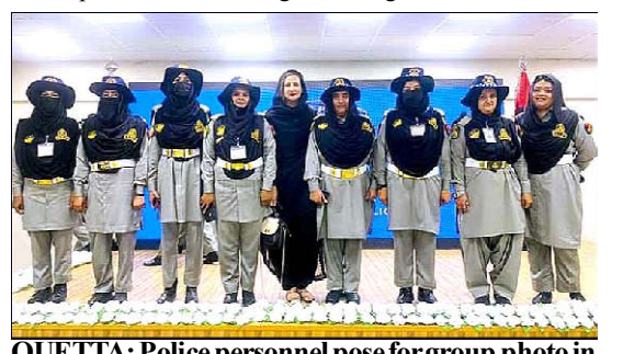
QUETTA: Police personnel pose for group photo in new uniform of the traffic police.

They shared valuable insights about the negative effects of corruption on society and the steps to be taken to eradicate it.